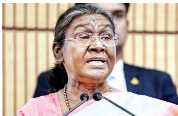
President Droupadi Murmu addresses during the launch of the first indigenous CAR-T cell therapy, in Mumbai, Thursday.

Speaking at the launch event at IIT Bombay here, Murmu said the indigenous development of the therapy was an example of the Make in India initiative. A CAR T-cell therapy involves modifying a patient's T cells (a type of immune system cell) in the laboratory and using them