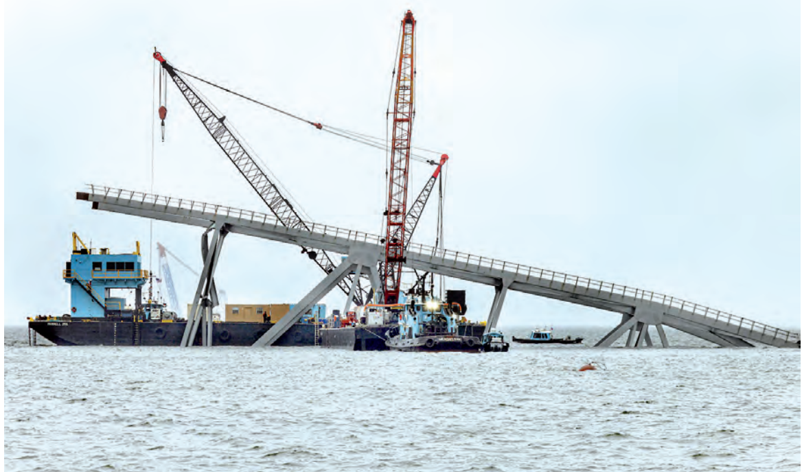
Cranes continue salvage work as wreckage of the Francis Scott Key Bridge rests on the container ship Dali, Wednesday, April 3 2024, in Baltimore.