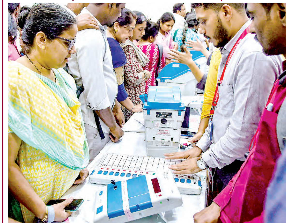
An electoral officer demonstrates the functioning of Electronic Voting Machine (EVM) and Voter Verifiable Paper Audit Trail (VVPAT) during a training programme for polling officials, ahead of Lok Sabha elections, in Mumbai, Thursday.