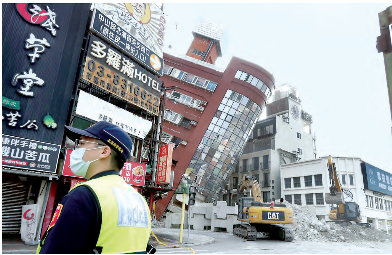
A police officer stands guard near a partially collapsed building a day after a powerful earthquake struck in Hualien City, eastern Taiwan, Thursday, April 4.