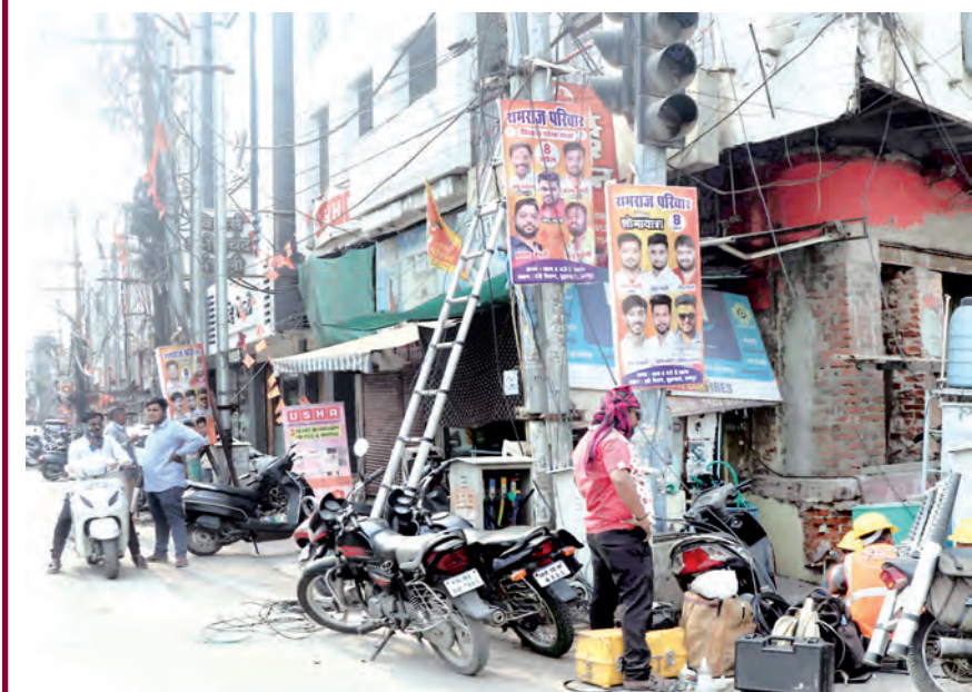
The linemen of the electricity department have started clearing the bunch of electrical wires from different chowks and localities to make it underground.