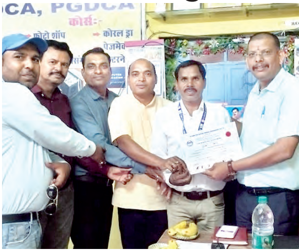
Rajim, Apr 04:

The meeting of Krida Bharti district unit was conclude here with the officials of Krida Bharti dis-