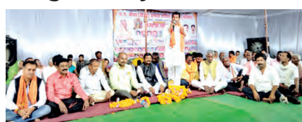
Rajim, Apr 04:

The annual general meeting of Dhivar Samaj Pargana Rajim concluded on a note of unity and determination at the social building in Amapara, Rajim.