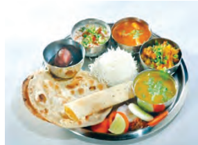
plate in March from Rs 25.5 in the year-ago period, but was cheaper than Rs 27.4 in February 2024, it said. "The cost of the veg thali increased due to a surge of 40 per cent, 36 per cent and 22 per cent on-year in prices of onion, tomato and potato, respectively, due to lower arrivals of onion and potato and low base of last fiscal for tomatoes," the report said.

The cost of a vegetable thali - comprising roti, vegetables (onions, tomatoes and potatoes), rice, dal, curd and salad - increased to Rs 27.3 per