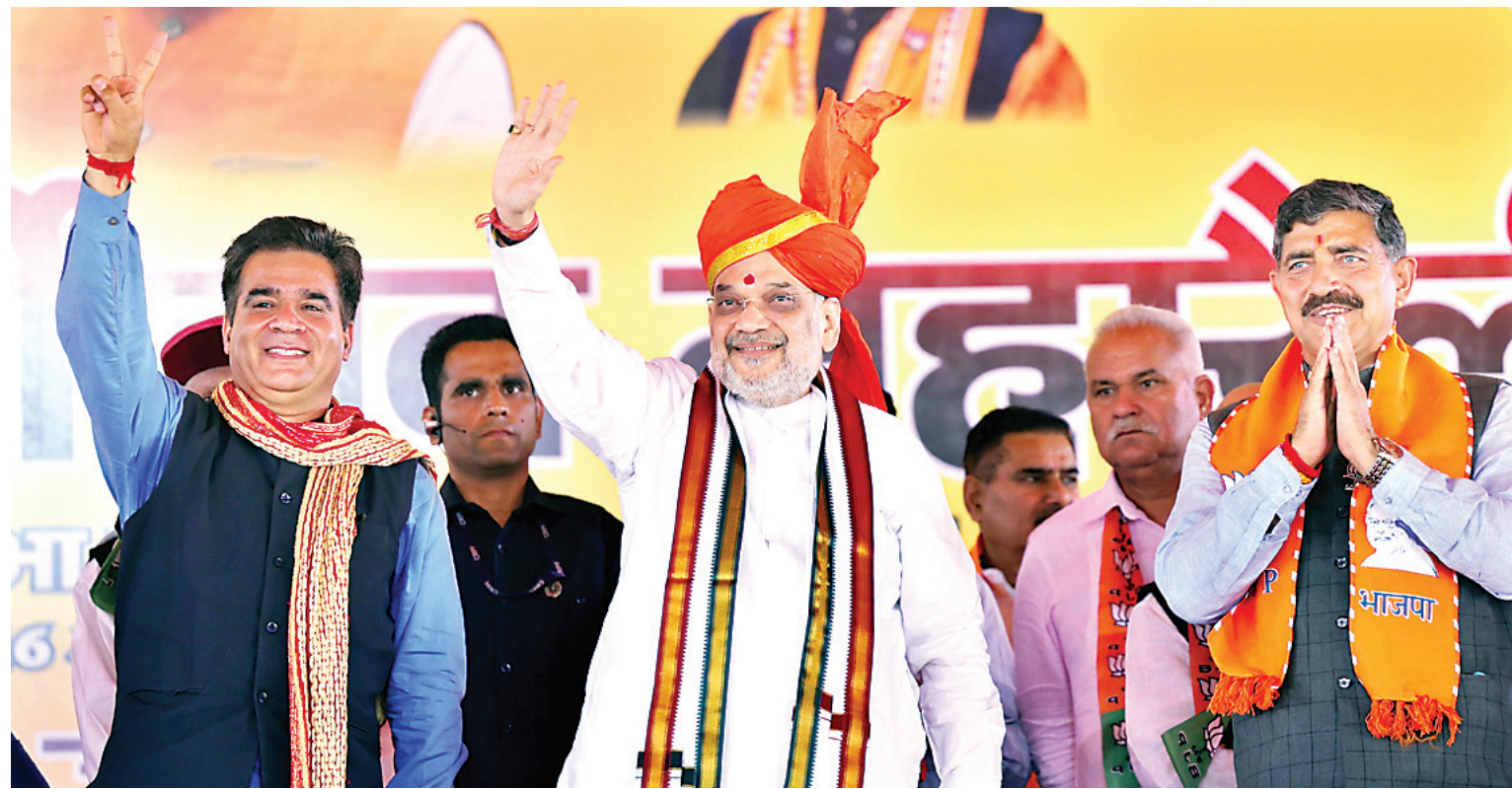
Union Home Minister Amit Shah waves at supporters during a public meeting ahead of Lok Sabha elections on Tuesday.