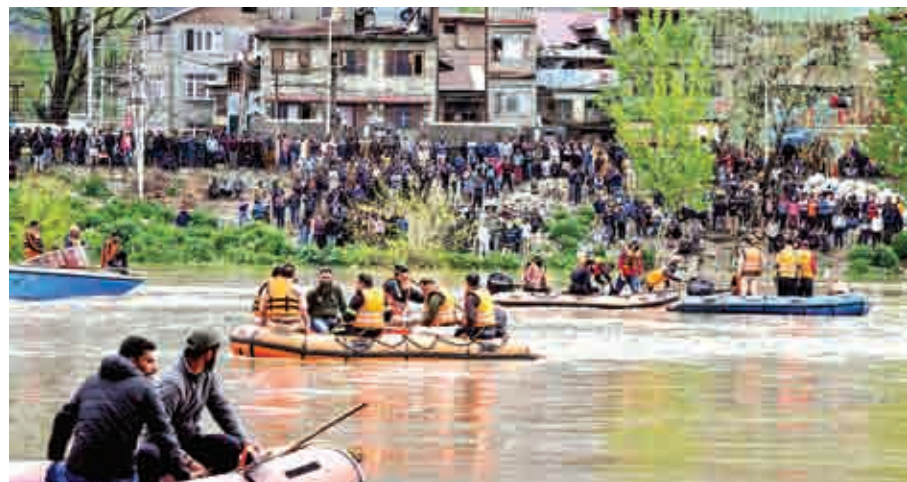
Rescue operation underway after a boat capsized in the Jhelum river, Tuesday.

Officials said many others are missing and a rescue operation is underway. It was not clear as to how many people were travelling in the boat. Incessant rains over the last couple of days have led to an increase in the