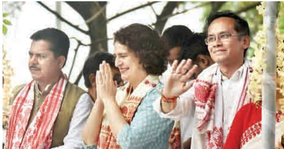
Priyanka Gandhi Vadra during an election campaign rally ahead of Lok Sabha elections