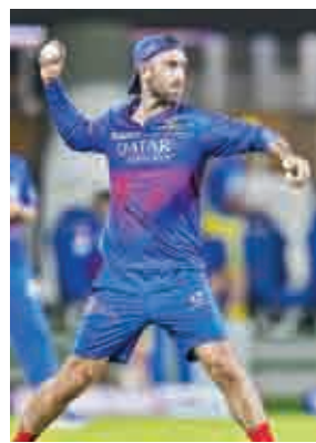
Glenn Maxwell Australian cricketer

one else (in his place)," Maxwell said in the post-match press meet. "It's actually a good time to give myself a bit of a mental and physical break, get my body right. If I'm required to get in during the tournament, I can, hopefully, get back into a solid mental and physical space where I can make an impact," he added.