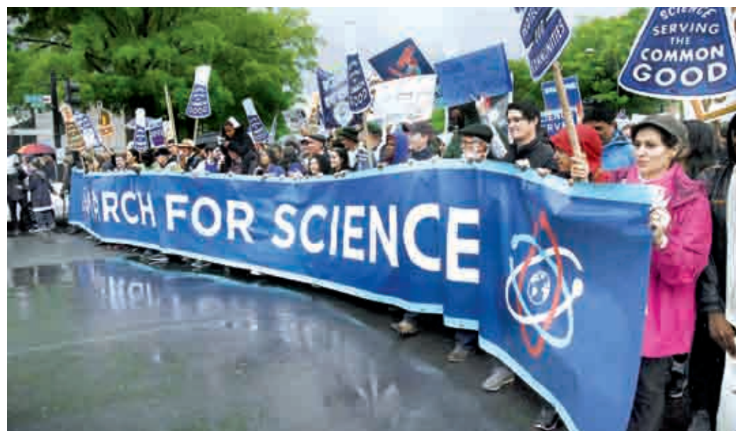
March for Science