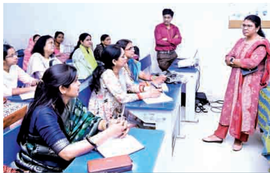
Sector officers of Sangwari polling station being imparted training.

Gaurela - Pendra - Marwahi : Special initiatives have been taken to ensure participation of women in the Lok Sabha Elections 2024, by the District Election Office. Under this in urban areas, in all 37 Sangwari polling stations, voting will be conducted only by women polling teams on May 7, of these, 16 Sangwari polling stations have been made in the urban area Gaurela, 11 in Pendra and 10 in Marwahi. Apart from this, there will be only women officers in polling officer number 03 in the polling teams of all 306 polling stations of the district. All sector officers of Sangwari