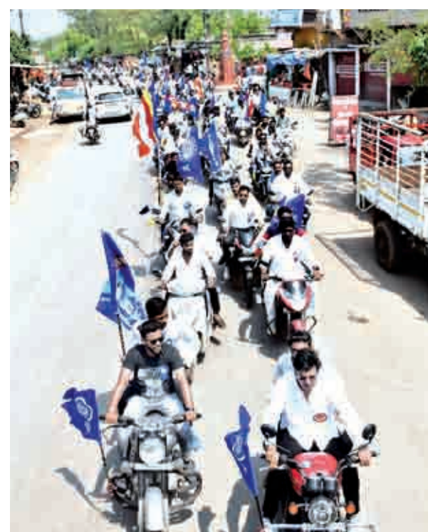
Youth on Ambedkar Jayanti took out massive bike rally.

KHAIRAGARH: The 135th birth anniversary of founder of India's constitution and Bharat Ratna recipient Dr Bhimrao Ambedkar was observed in Khairagarh and the youths took out a massive bike rally. The programme was held jointly under the aegis of Khairagarh Mahabodhi Vihar Samiti (KMVS) and Bhim Regiment District Khairagarh on April 14 and the youths remembering Baba Saheb started their bike rally from Boudha Vihar at Dua-