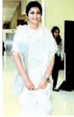
Sonali Bendre pairs white saree with sneakers, proves she is coolest fashionista in town.

Ever since Sonali Bendre's triumphant return to the fiction realm following her courageous battle with cancer, she's been inundated with offers. Bendre's approach to her comeback is marked by discernment rather than sheer volume. Known for her iconic roles in Bollywood films such as "Diljale" (1996) and "Duplicate" (1997), Bendre took a hiatus from acting to focus on her health. Her return to the screen with the web series "The Broken News" in 2022 marked a significant milestone in her career. In selecting "Broken News," Bendre prioritized substance over superficiality, aiming to portray characters and stories that held personal significance and conveyed meaningful messages. For Bendre, aging gracefully isn't about defying the inevitable; it's about embracing it with pride and acceptance. She sees the lines on her face and the scars on her body as badges of honor, symbols of the battles she's fought and the life she's lived.