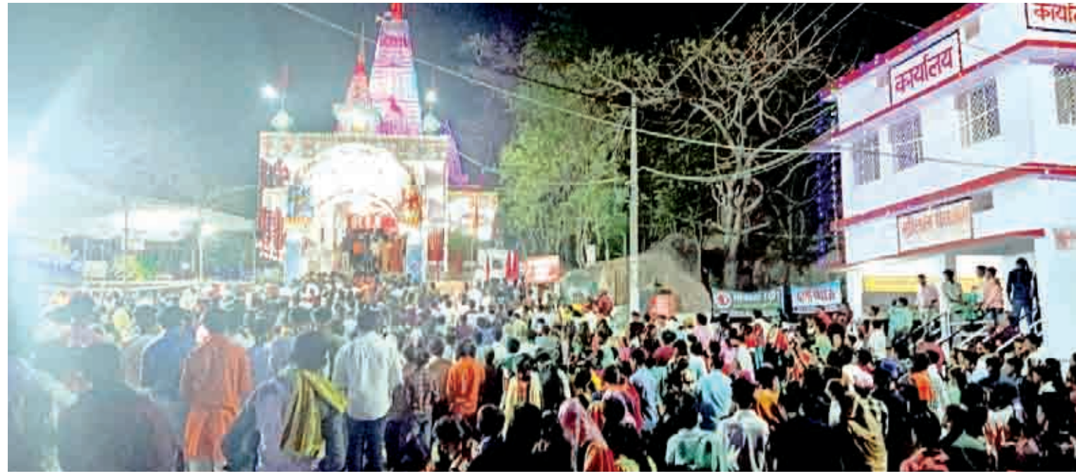
Devotees in large number thronged the Maa Chandi Mandir on Navratri.