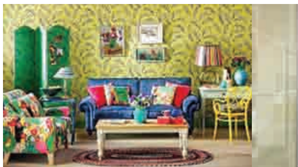
Sustainable living and artisanal craftsmanship redefine interior design.

Step into the vibrant world of interior design as Spring 2024 unfolds its palette of creativity and renewal. This season, we're breaking free from the mundane and embracing a symphony of colors, textures, and styles that awaken the senses and breathe new life into our homes. Eclectic Styles take the spotlight, inviting us to play with contrasts and blend different aesthetics to curate spaces that are uniquely ours. From bold and saturated hues to the plush embrace of velvet and chenille, every element tells a story of individuality and expression.