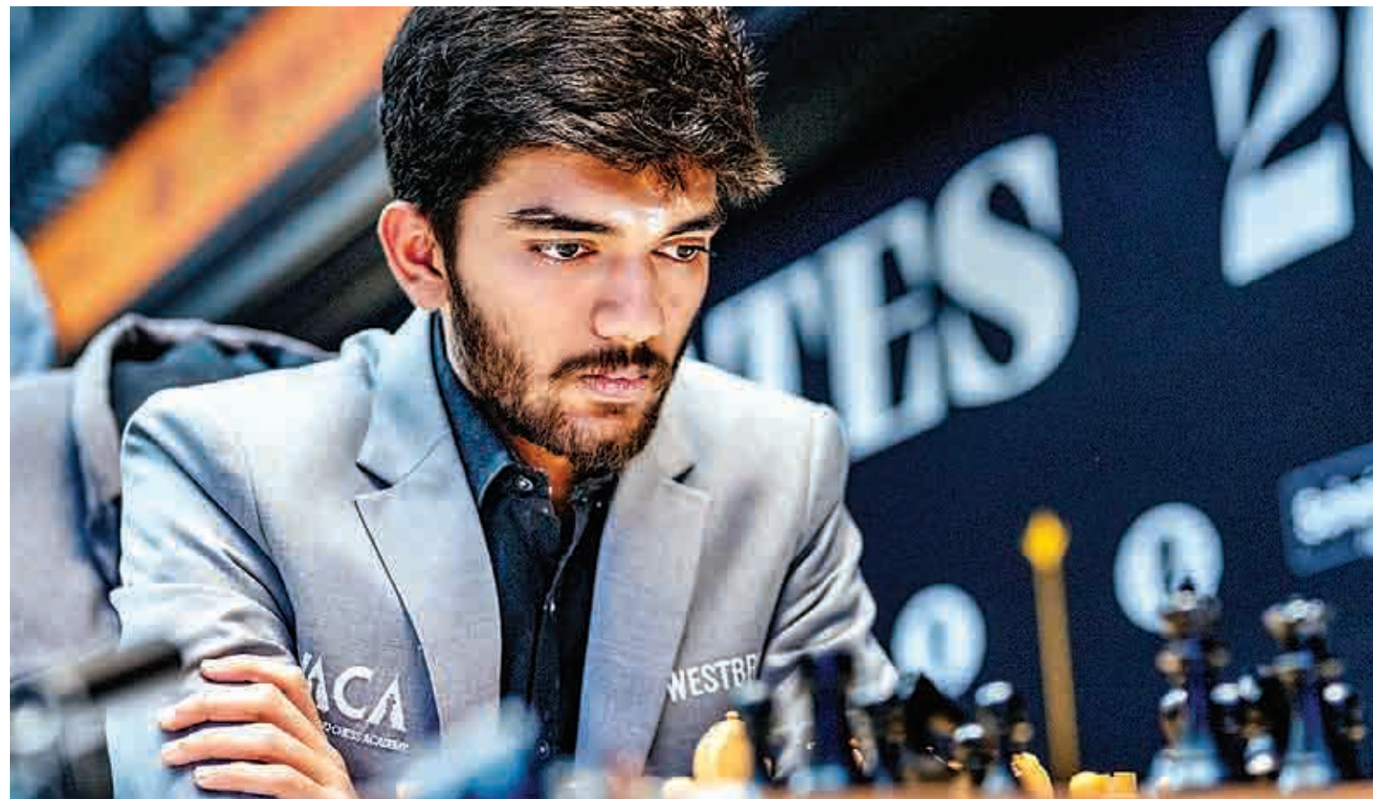
Indian GM D Gukesh during match against Russian Ian Nepomniachtchi.

Gukesh and Nepomniachtchi hold joint lead; Praggnanandhaa, Caruana, and Nakamura trailing closely; Nepomniachtchi remains unbeaten in solid play.