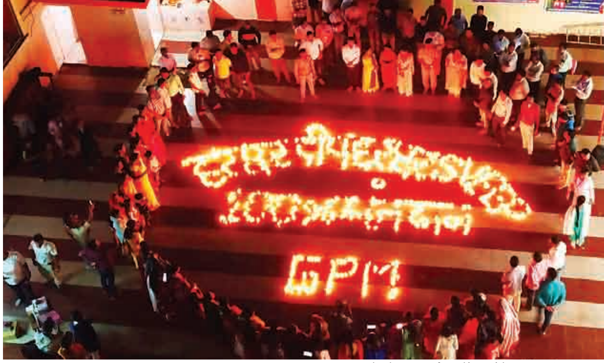
Earthen lamps were formed in special way to create awareness.