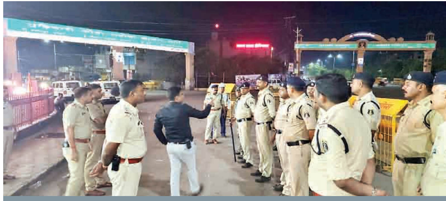
Police officials monitoring the security check ahead of the Lok Sabha elections.