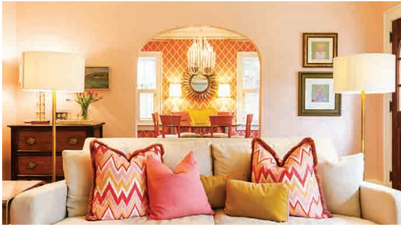
Embrace the essence of Spring 2024 with eclectic styles and vibrant colors to breathe new life into your home.