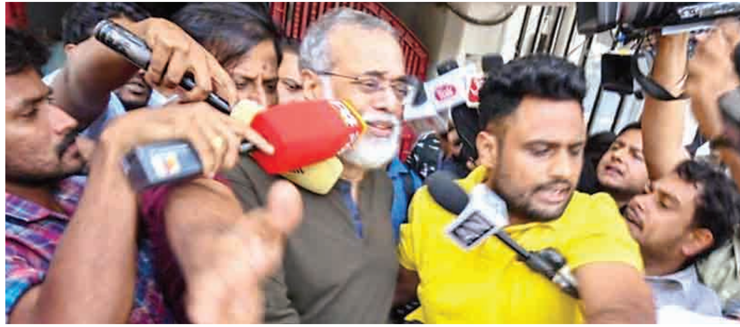
NewsClick founder Prabir Purkayastha being produced in the court