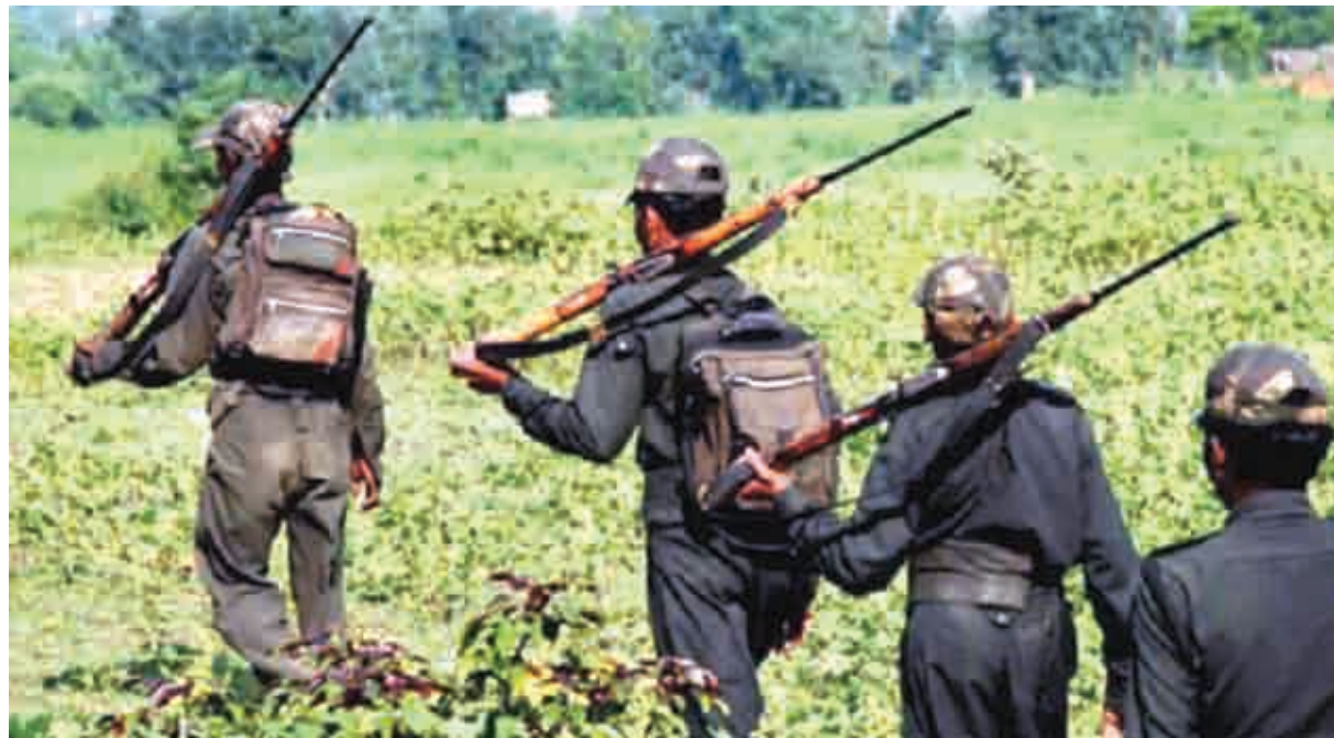
Security personnel engaged in operation.

Three security personnel suffered injuries in the fierce gun-battle and a large quantity of weapons was also recovered from the spot, the state police said. The gunfight took place at around 2 pm in Hapatola forest between Binagunda and Koronar villages under Chhotebethiya police station limits, when a joint team of the Border Security Force (BSF) and the state police's District Reserve Guard (DRG) was out on an anti-Naxal operation, a statement issued by the BSF said. The BSF has been extensively deployed in Kanker