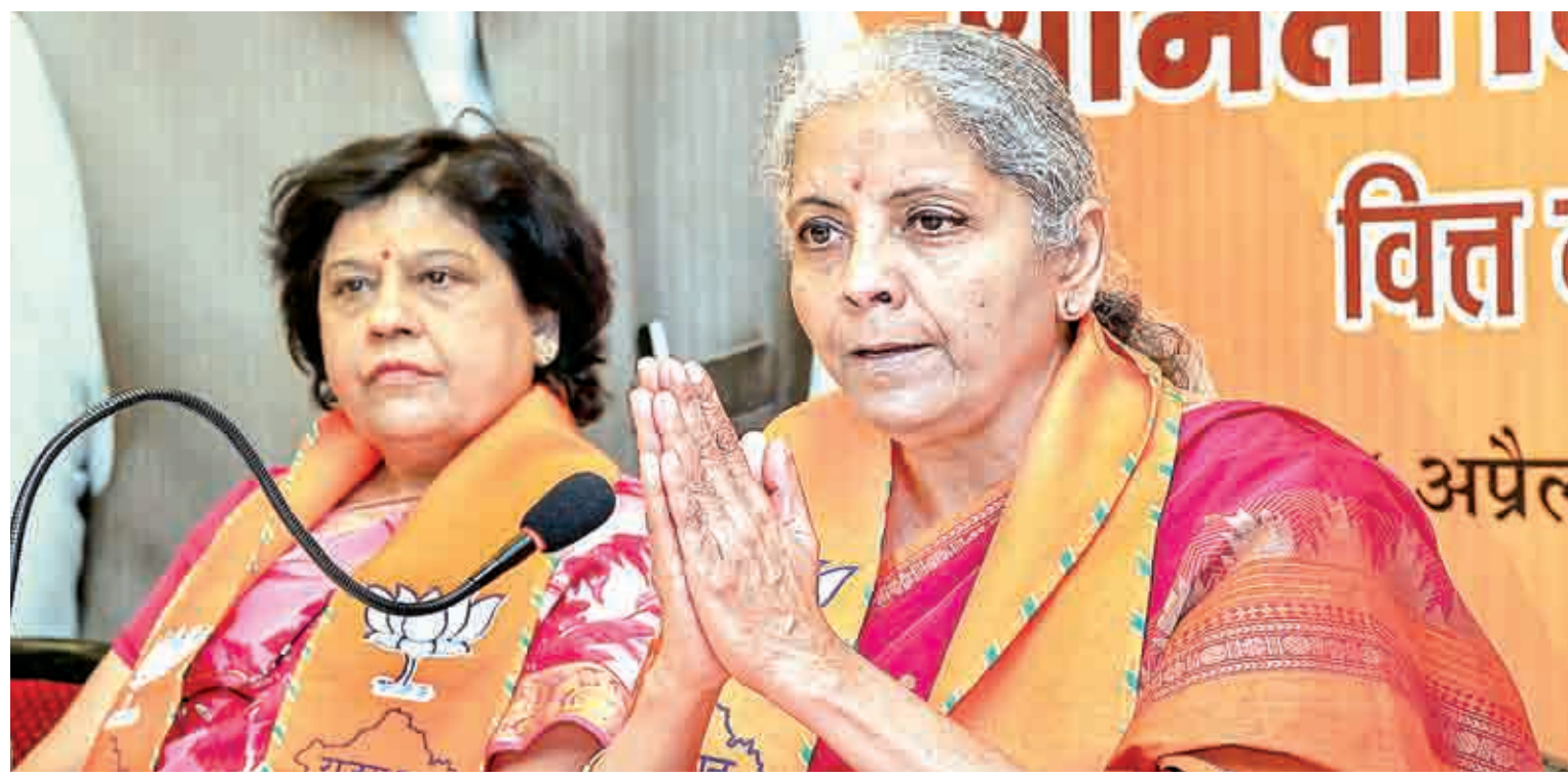
Union Finance Minister Nirmala Sitharaman addresses a press conference ahead of Lok Sabha elections, in Jaipur, Tuesday, April 16.