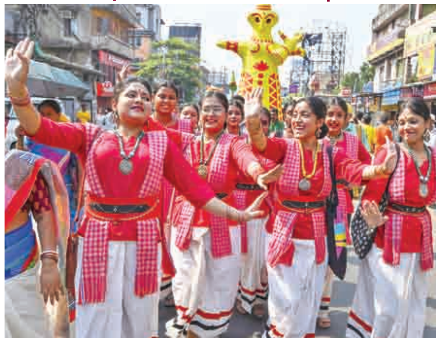
People take part in a procession to celebrate Bengali New Year, 'Poila Baishakh', in Kolkata, Sunday.