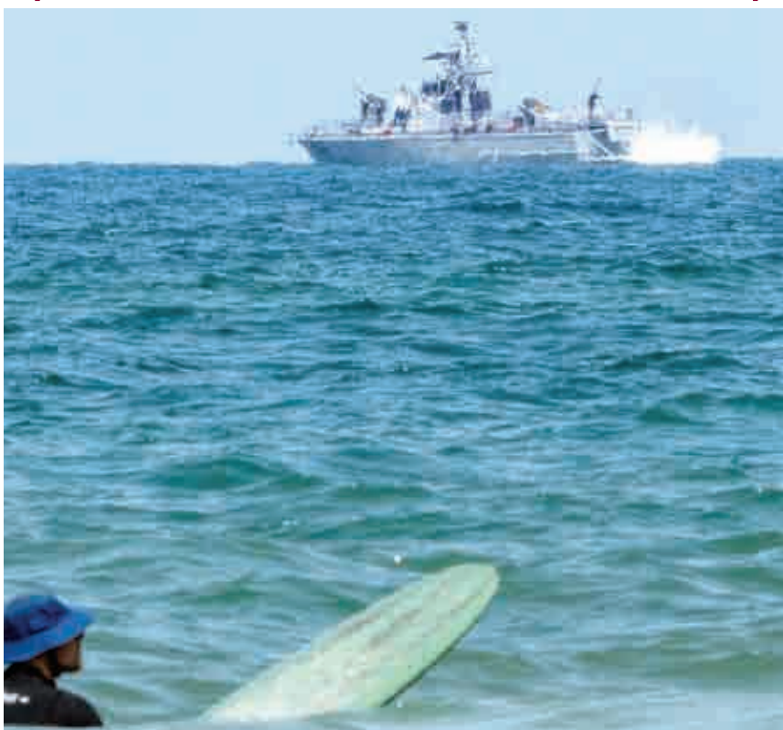
A surfer waits for wave while an Israeli military naval ship patrols the Mediterranean sea off the coast of Hadera, Israel, Sunday, April 14, 2024.