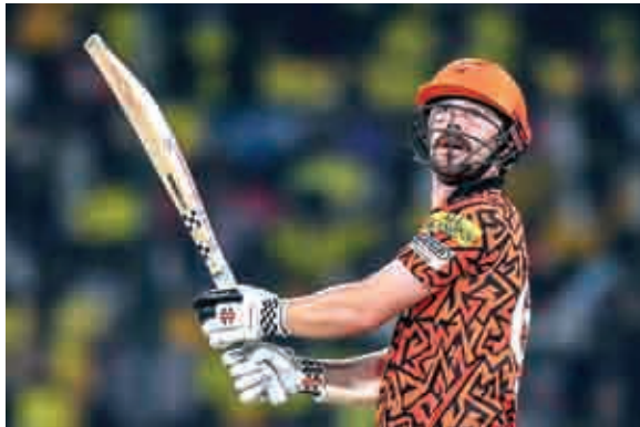
Bengaluru, Apr 14 (PTI):

Travis Head raised his career graph a few notches up in 2023 but the Australian batter understands that staying at that level is a challenging task, and the first step for him in that journey is the upcoming T20 World Cup.