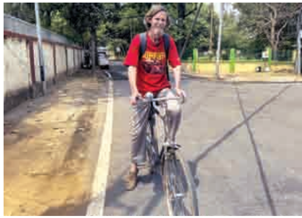
Development economist Jean Dreze in Ranchi.

In an exclusive interview with PTI, Dreze said five years ago, Arundhati Roy had described the 2019 elections as a race between a Ferrari and a few bicycles. "The metaphor is still valid. Today, thanks to the Supreme Court, we know that the Ferrari is fuelled