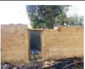
Remains of the house which caught fire.