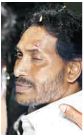
Vijayawada," a statement from the Chief Minister's Office (CMO) said.

"A stone struck the chief minister while he was acknowledging the crowd as part of his bus tour at Vivekananda School Centre in Singh Nagar,