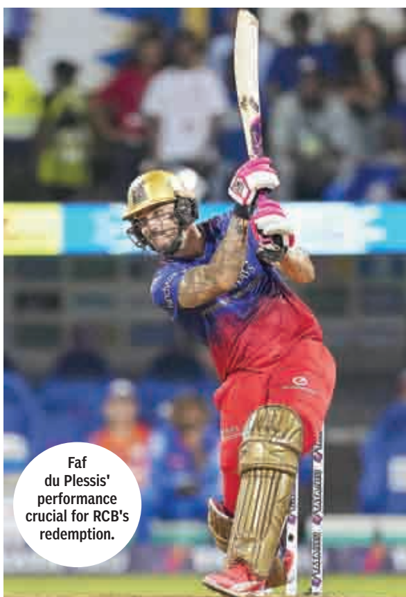
Must address their bowling woes to stand a

Throughout the tournament, RCB's bowlers have displayed a lack of adaptability and innovation, often resorting to predictable tactics against aggressive batsmen. Their inability to contain opposition batsmen was glaringly evident in their recent match against Mumbai Indians, where they conceded a mammoth total despite posting a compet-