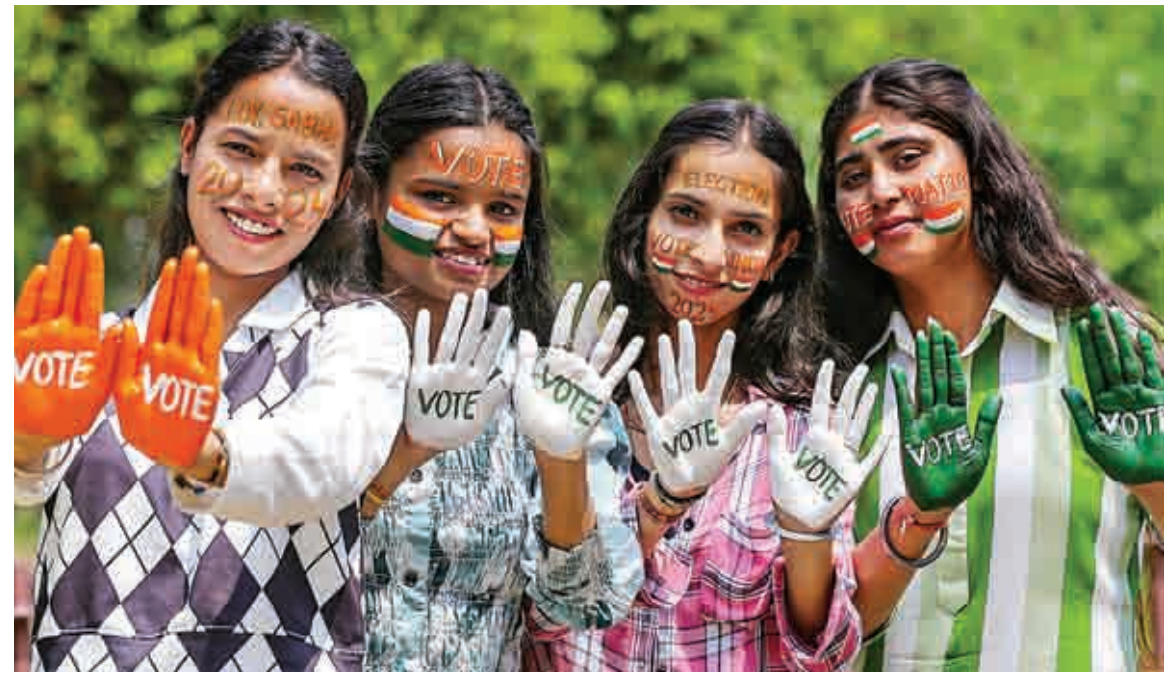
Young women with their faces and hands painted to aware people to vote pose for photographs ahead of the Lok Sabha elections, in Amritsar, Sunday.