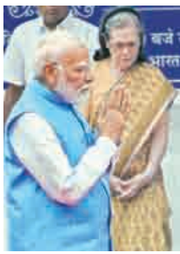
PM Modi with Congress leader Sonia Gandhi during Ambedkar Jayanti celebrations, at Parliament in New Delhi, Sunday.