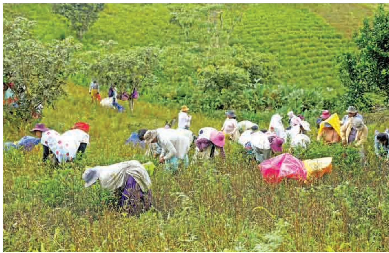
Farmers from the Yungas region harvest coca leaves near Trinidad Pampa, a coca-producing area in Bolivia.