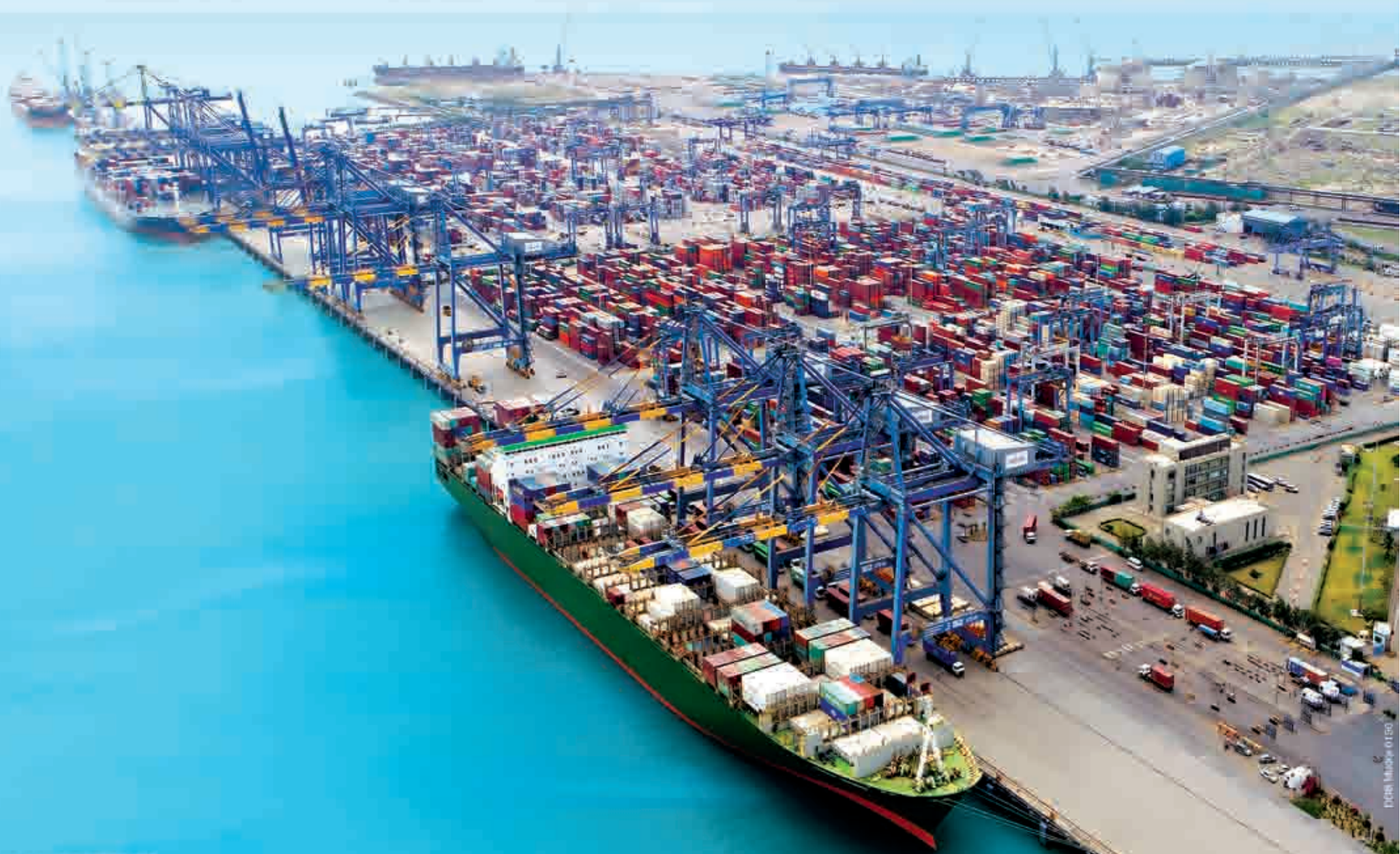
Figures as on FY 2023-24