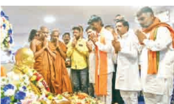
Maratha activist Manoj Jarange Patil pays tribute to BR Ambedkar on his birth anniversary, in Mumbai, Sunday.

Jarange slammed Deputy Chief Minister Devendra Fadnavis and said police continues to register cases against Maratha quota agitators across the state even for incidents that took place four