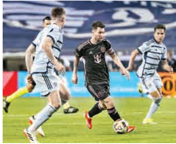
Inter Miami's Argentine forward #10 Lionel Messi (C) controls the ball during the MLS football match between Sporting Kansas City and Inter Miami CF at the Arrowhead Stadium in Kansas City, Missouri.