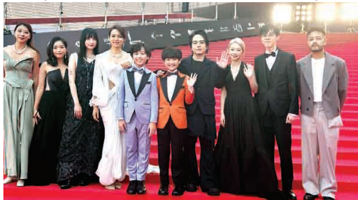
The cast and crew from the movie Time Still Turns The Pages pose for photos during the red carpet for the 42nd Hong Kong Film Awards in Hong Kong, Sunday, April 14, 2024.