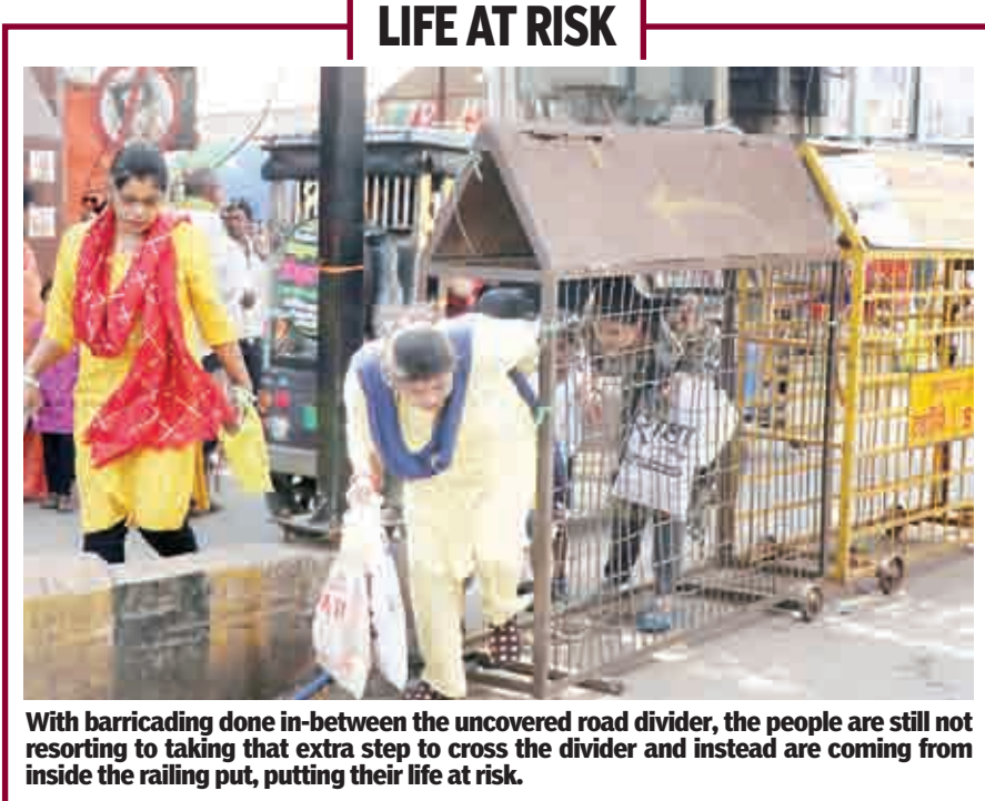
With barricading done in-between the uncovered road divider, the people are still not resorting to taking that extra step to cross the divider and instead are coming from inside the railing put, putting their life at risk.

fidence of people towards the party. It is a reflection of expectations of youth for the young Indians. In the last 10 yrs, 25 cr people have come out of the below poverty line. The senior citizens above 70 yrs have got benefitted from Ayushman Bharat Yojana. Apart from 4 cr 'pucca' houses have been constructed and 3 cr more are to be constructed. The party has ensured supply of LPG cylinders at affordable rates and now there are plans to take Gas pipelines directly to homes. There will be work to make electricity bills of crores to zero and then works will be done to generate revenue from power generation from domestic consumers as well. Under PM Surya Yojana, now the people will not get electricity, but they will generate it and sell it, he added. On this occasion BJP senior leaders, party's LS candidate from Raipur LS seat Brijmohan Agrawal, BJP State media in-charge Amit Chimmani, co-in-charge Anurag Agrawal, spokesmen Amit Sahu, Nalinesh Thokane and others were present.