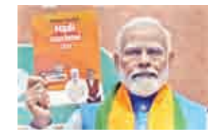
PM Modi releases the BJP's election manifesto 'Sankalp Patra' at the party headquarters, in New Delhi, Sunday.

Prime Minister Narendra Modi on Sunday released the BJP's Lok Sabha manifesto which has a special focus on the poor, youth, farmers and women, and asserted that the need for a stable government with full majority was necessary when the world was passing through uncertain times.