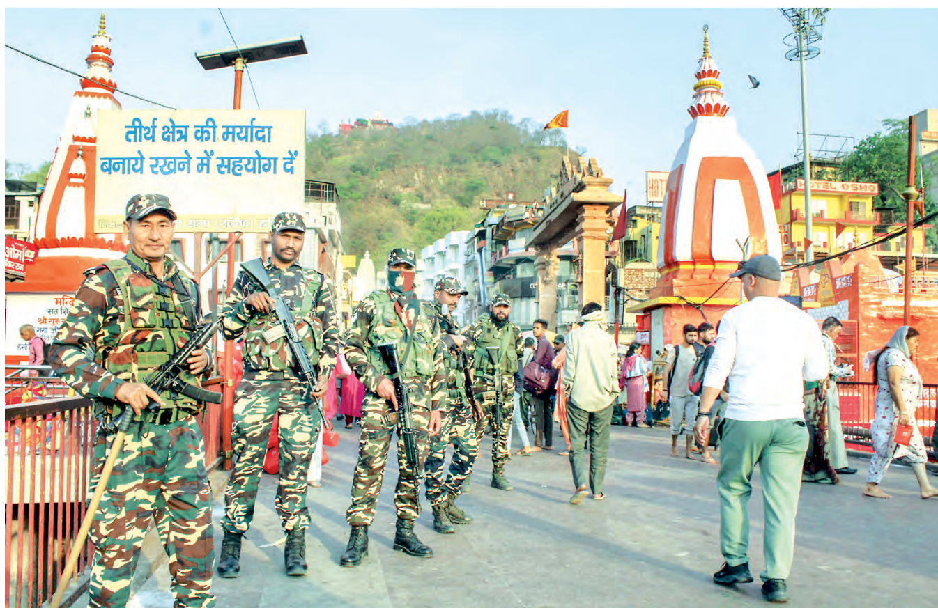
Security personnel conduct a route march on the occasion of 'Vaisakhi', at Har Ki Pauri ghat in Haridwar, Saturday, April 13.