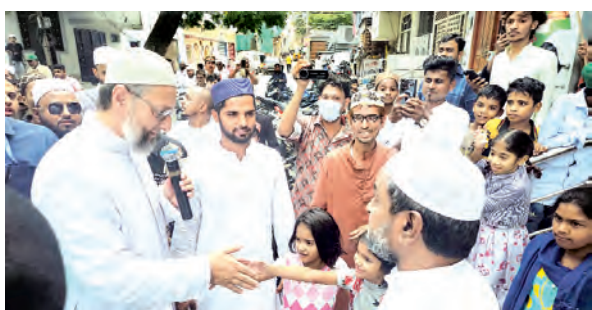
AIMIM President Asaduddin Owaisi during his door-to-door election campaign for Lok Sabha polls.

Rejecting BJP Hyderabad Lok Sabha candidate K Madhavi Latha's allegation of about six lakh bogus votes in the constituency, AIMIM president Asaduddin Owaisi on Saturday said the Election Commission takes care of the issue of voters' lists. Owaisi, who is seeking re-election from Hyderabad constituency, wondered what his role was in the matter.