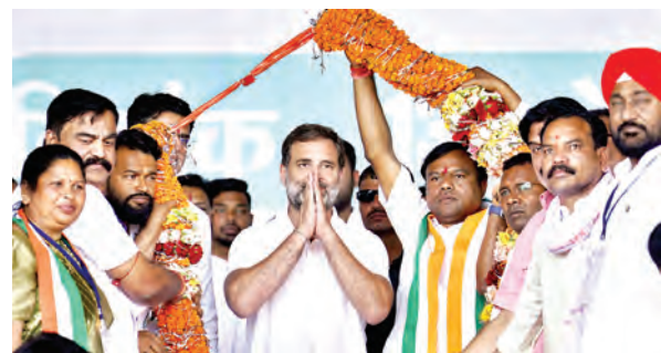
Congress leader Rahul Gandhi speaks during a public meeting ahead of Lok Sabha elections, in Bastar district, Saturday.