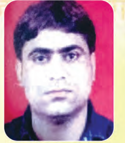
शुरी रुरी रुररर रुरररर

गरररगरर-दररर, सरररर, रररर, खररर, खरर-गरररर, रुरररर-बरर, दही-बरर, गरररगरर ककरररी हररेशर उपलरर. |