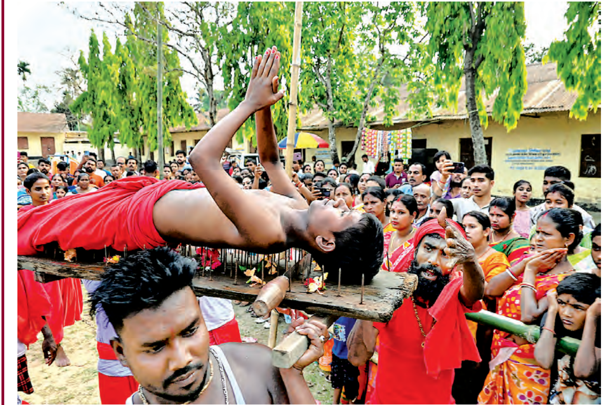
A young devotee performs a ritual during the 'Charak' festival celebration, in Agartala, Saturday.