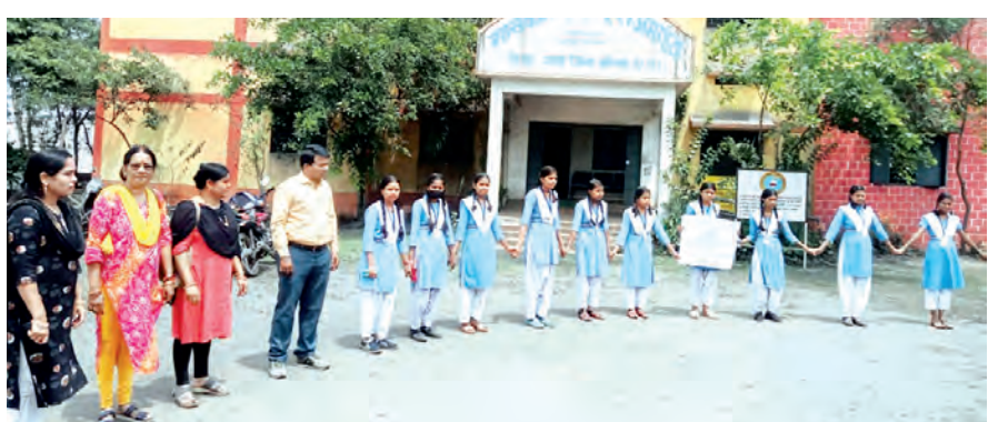
Central Chronicle News

Through the Systematic Voters' Education and Electoral Participation (SVEEP) program, various engaging activities such as drama performances, rallies, slogan-writing competitions, essays, speeches, mehndi contests, and poster making sessions have been organized to inform 100% of the electorate.