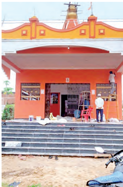
Central Chronicle News

Kurud, Apr 13: In a testament to communal harmony and collective effort, the tribal Kanwar Paikra community in village