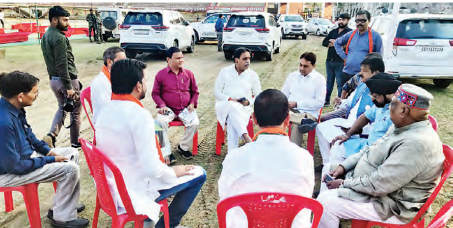
Central Chronicle News

Amit Shah's rally promises political fireworks