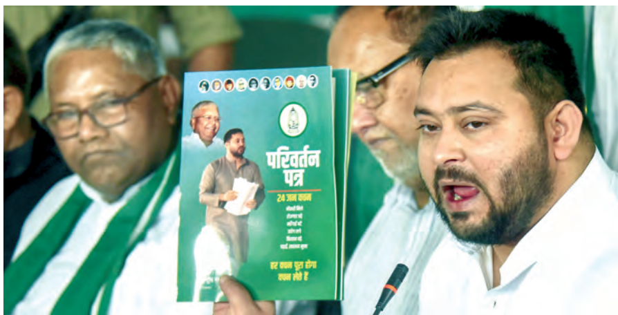
RJD leader Tejashwi Yadav addresses during the release of 'Parivartan Patra' for the Lok Sabha elections, at the party office, in Patna, Saturday.

The RJD, the largest constituent of Mahagathbandhan in Bihar, on Saturday released its election manifesto for the Lok Sabha polls, promising 1 crore government jobs and Rs 1 lakh per year to "sisters" from poor families on Raksha Bandhan. Former deputy chief minister Tejashwi Yadav, while releasing the RJD's election manifesto 'Parivartan Patra', said the party is making 24 "jan vachan" (public promises) for the 2024 polls, and it will fulfill these commitments.