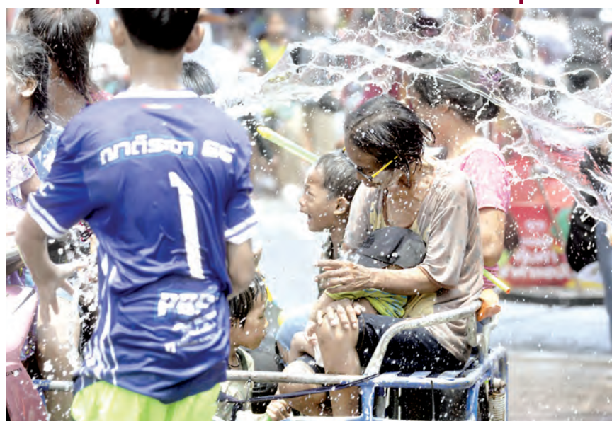
A woman reacts as a bucket of water is splashed on her during the Songkran water festival to celebrate the Thai New Year in Prachinburi Province, Thailand, Saturday April 13, 2024.