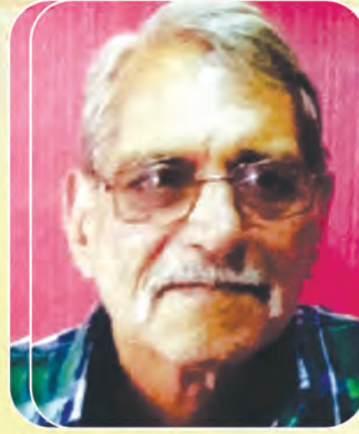
रुर. शुरी रुरी रुररर रुरररर