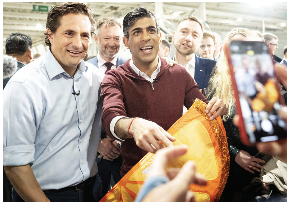
Britain's Prime Minister Rishi Sunak and Minister for Veterans' Affairs Johnny Mercer, left, during a Q&A event at the RAF Museum in Hendon north west London, to launch an employment plan which pledges to help veterans secure high-paid jobs after they leave the armed forces, Friday April 12.