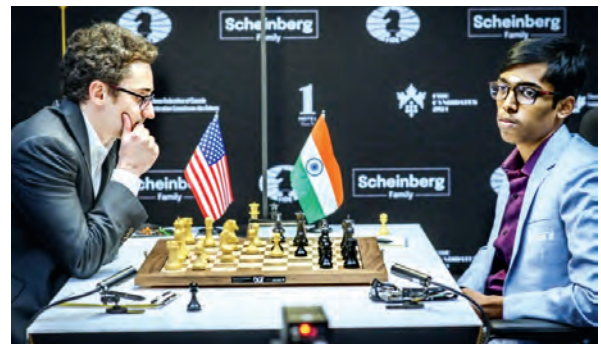
Grandmaster R Praggnanandhaa during Round 7 match against Grandmaster Fabiano Caruana at the FIDE Candidates 2024 chess tournament, in Toronto, Canada, Friday, April 12.

After a draw with Nijat Abasov, Vidit Gujrathi took his tally to 3.5 points to share the fifth spot with Nakamura while Alireza pulled himself up a little on 2.5 points to take the seventh spot.