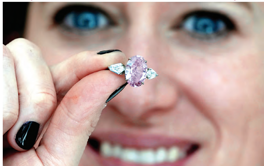
A Phillips employee shows the Fancy Vivid Pink diamond ring, weighing 6.21 carats during a press preview of Jewellery Highlights ahead of Phillips' auction house Geneva Jewels Auction on May 13th in London, Friday, April 12, 2024.