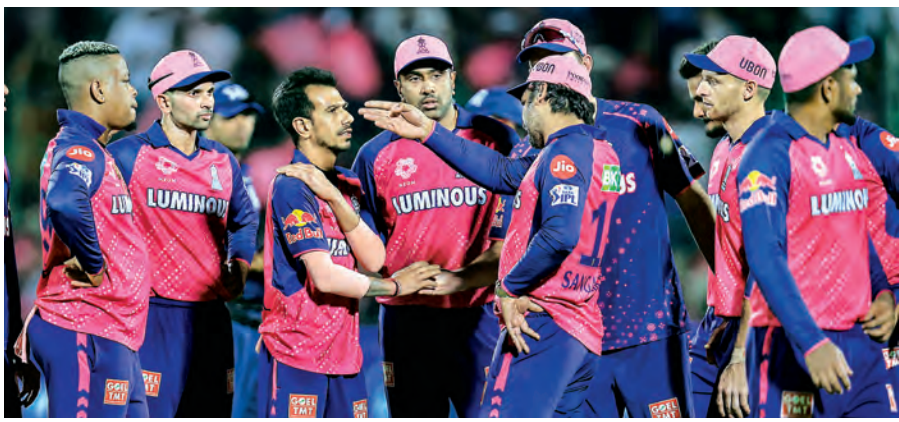
Mullanpur, Apr 12 (PTI):

A disappointed Rajasthan Royals will have to focus on better execution of their strategies for a swift turnaround when they face a highly inconsistent yet capable Punjab Kings in their Indian Premier League match here on Saturday. The Royals had an excellent chance to register their fifth win on the trot and consolidate their totem pole position, but Rashid Khan's daring assault helped Gujarat Titans snatch a last-ball