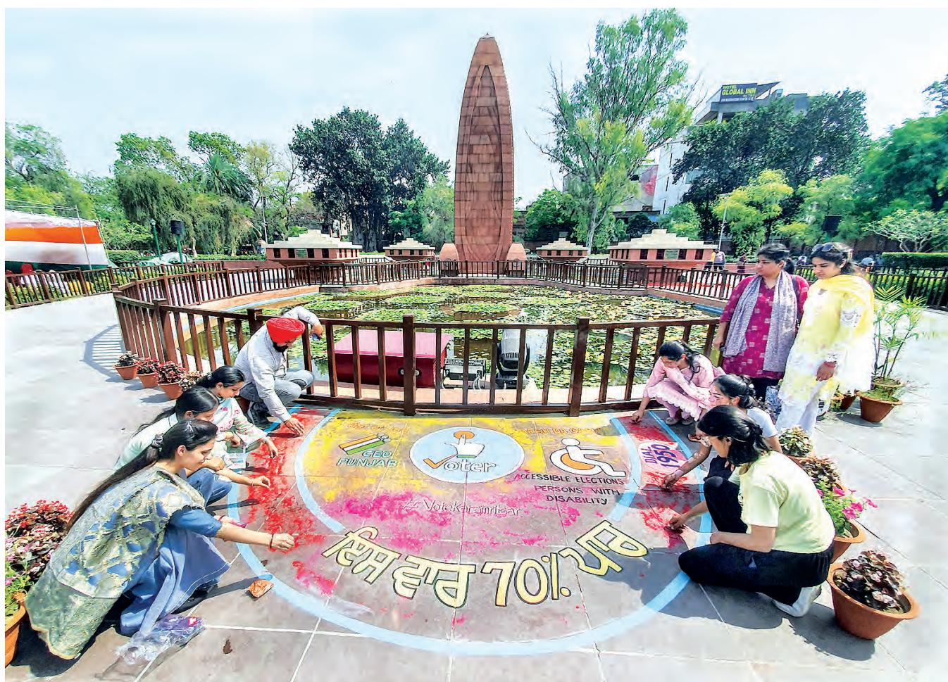
Students create a 'rangoli' at the Jallianwala Bagh Martyrs' Memorial to create voter awareness ahead of Lok Sabha elections, in Amritsar, Friday, April 12.