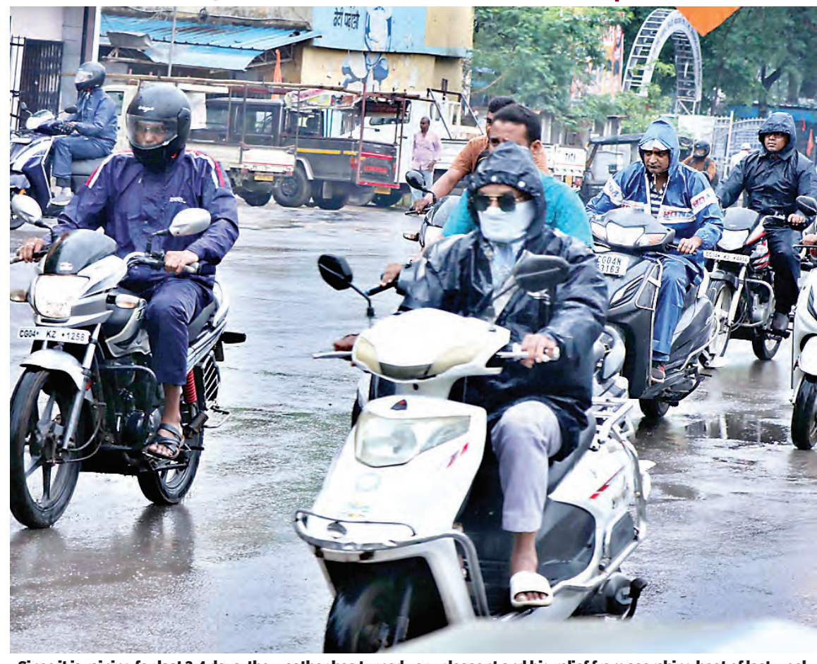
Since it is raining for last 3-4 days, the weather has turned very pleasant and big relief from scorching heat of last week.