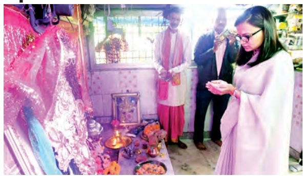
■ Last date for filing nomination is April 19