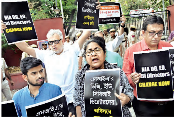
Trinamool Congress (TMC) leaders, who were detained by Delhi Police while staging a dharna outside the Election Commission's office, shout slogans during their protest at Mandir Marg police station, in New Delhi, Tuesday.

The TMC leaders on Monday met with the full bench of the Election Commission (EC) and urged the poll body to change the heads of the Enforcement Directorate (ED), Central Bureau of Investigation (CBI),