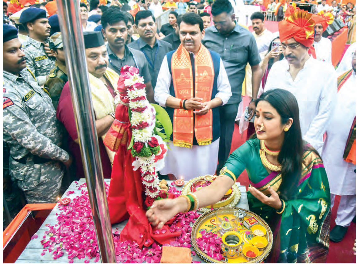
Maharashtra Deputy CM Devendra Fadnavis, actor Prajakta Mali and others offer prayers during the Gudi Padwa festival, in Nagpur, Tuesday.