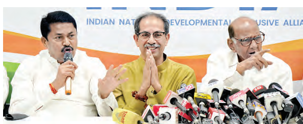
Shiv Sena (UBT) chief Uddhav Thackeray, Congress leaders Nana Patole, Prithviraj Chavan and Balasaheb Thorat, NCP chief Sharad Pawar and NCP leader Jayant Patil during a Maha Vikas Aghadi (MVA) press conference, in Mumbai, Tuesday.

NCP (SP) chief Sharad Pawar said there are no differences among the allies over any seat and the distribution arrangement for the 48 parliamentary seats in the state has been