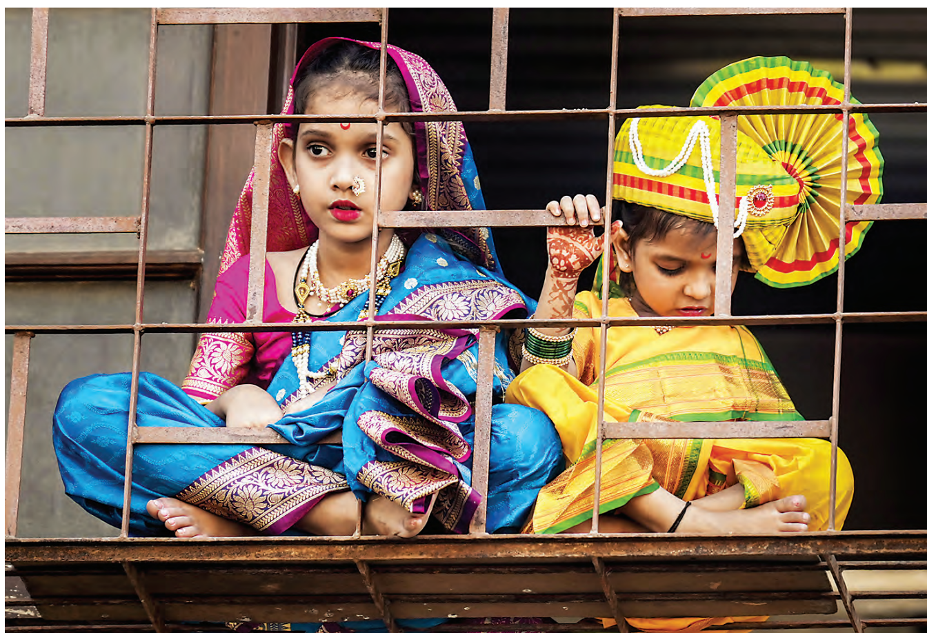
Children dressed in traditional attire participate in celebrations of 'Gudi Padwa', the Maharashtrian New Year, at Girgaon in Mumbai, Tuesday, April 9.