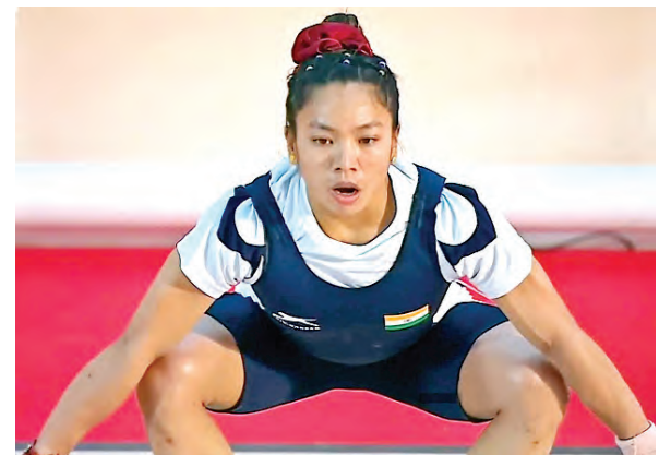
New Delhi, Apr 09 (PTI):

She heaved her lowest weight in years at the World Cup recently but Olympic silver-medallist Mirabai Chanu is actually quite chuffed about her performance as she managed it on the back of just one month's training after enduring a challenging injury breakdown.