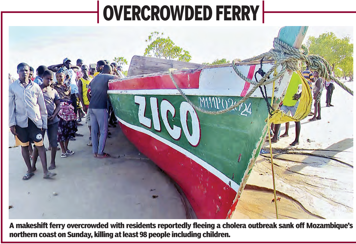
OVERCROWDED FERRY A makeshift ferry overcrowded with residents reportedly fleeing a cholera outbreak sank off Mozambique's northern coast on Sunday, killing at least 98 people including children.

ous markets, with women buying bangles, jewelry and clothes for themselves and their children. More than 52,000 police were being deployed at mosques as part of a security plan under which about 8,000 police were sent to sensitive places and markets in the provincial capital Lahore, according to a statement issued by Punjab police. Punjab is the country's most populous province and the home city of Prime Minister Shehbaz Sharif, who was elected in March by lawmakers in Pakistan's National Assembly despite protests and allegations that the election was rigged.