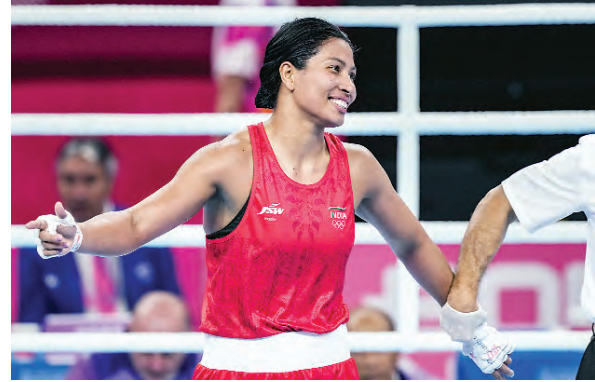
New Delhi, Apr 09 (PTI):