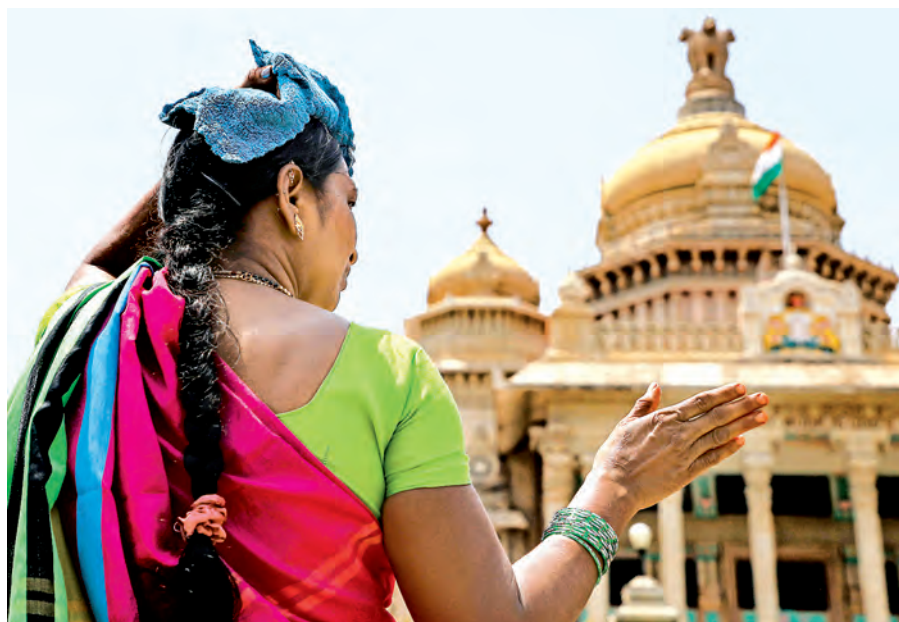
A woman uses a cloth to protect herself from the scorching sun on a hot summer day, in Bengaluru.

"The global average temperature for the past