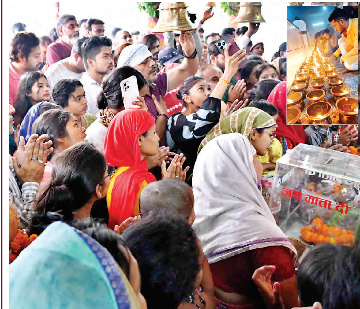
Devotees offered prayers to Goddess Durga on occasion of first day of Navratri in the temples and (R) 'Jyoti Kalash' of devotees being lighted up in the temple.