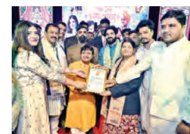
priest of Khatu Shyam, were present.