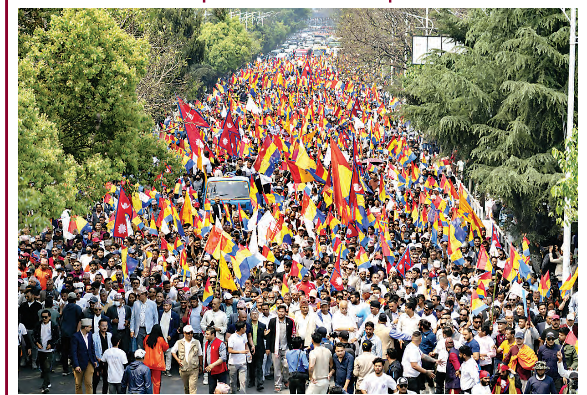
Supporters of Rastriya Prajatantra Party, or national democratic party, wave their flags as they take part in a protest demanding a restoration of Nepal's monarchy in Kathmandu, Nepal, Tuesday.