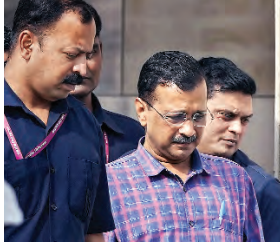
Delhi CM Arvind Kejriwal leaves from the Rouse Avenue Court in the excise policy-linked money laundering case, in New Delhi.

Senior AAP leader and Delhi minister Saurabh Bharadwaj told a press conference soon after the HC order that they are hopeful the Supreme Court will provide relief to Kejriwal in the same way it granted bail to AAP Rajya Sabha MP Sanjay