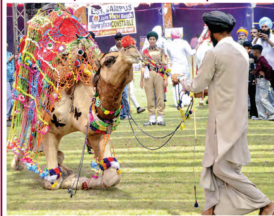
A camel performs during Baisakhi Fair, in Amritsar, Tuesday.