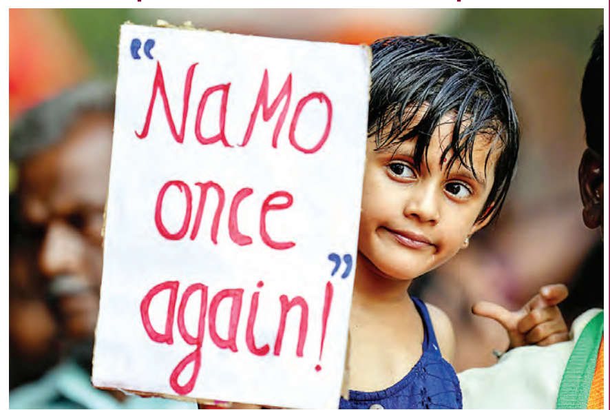
A child holds a placard during Prime Minister Narendra Modi's roadshow in support of BJP's South Chennai candidate Tamilisai Soundararajan, ahead of Lok Sabha elections, in Chennai, Tuesday.