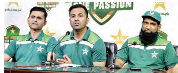
Lahore, Apr 09

Having reversed their decisions of retiring from international cricket, fast bowler Muhammad Amir and left-arm spinner Imad Wasim were recalled to the 17-member Pakistan squad for the five-match T20I series against New Zealand, starting April 18.