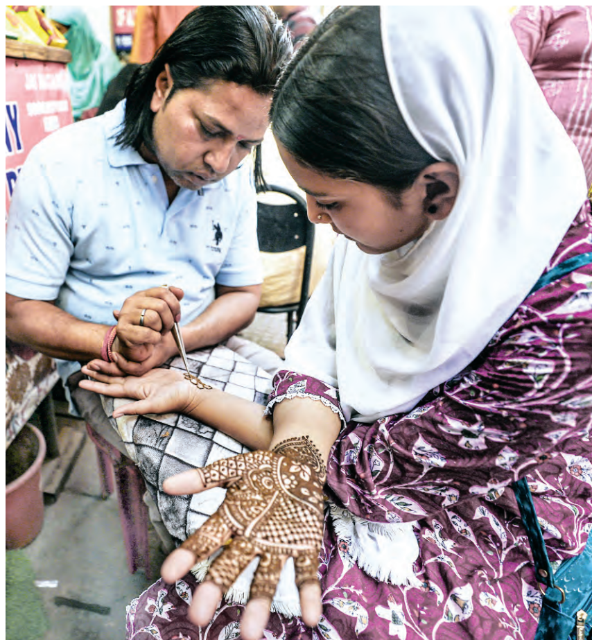
A Muslim woman gets her hands decorated with henna ahead of Eid al-Fitr, in Jammu, Tuesday.