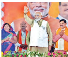
PM Modi waves to supporters during a rally ahead of the Lok Sabha elections, in Balaghat, Tuesday.

The Lok Sabha elections were a mission for