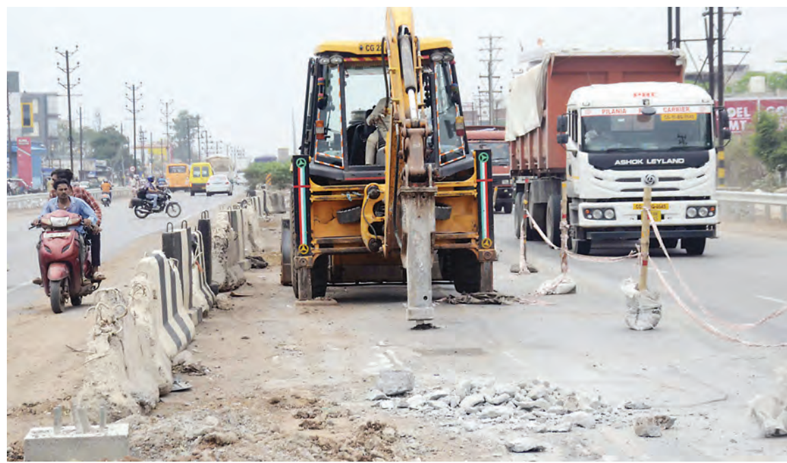
The authorities are constructing barrier to keep the traffic of the service road on one-side of the four-lane Ring Road, so as to ensure safe driving on highways.