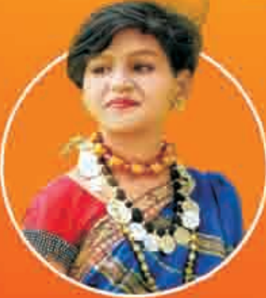
सुप्रसिद्ध खाटूश्याम भजन गायक सुप्रसिद्ध छत्तीसगढ़ी भजन गायिका