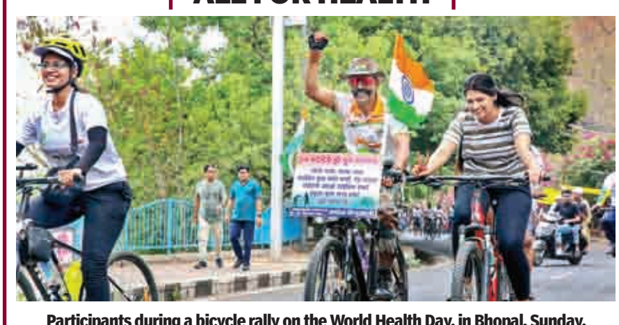
Participants during a bicycle rally on the World Health Day, in Bhopal, Sunday.