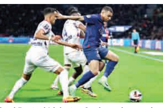
placed Brest, which hosts relegation battler Metz on

liable for any damages, loss, consequences, suffered by any person on account of relying on such