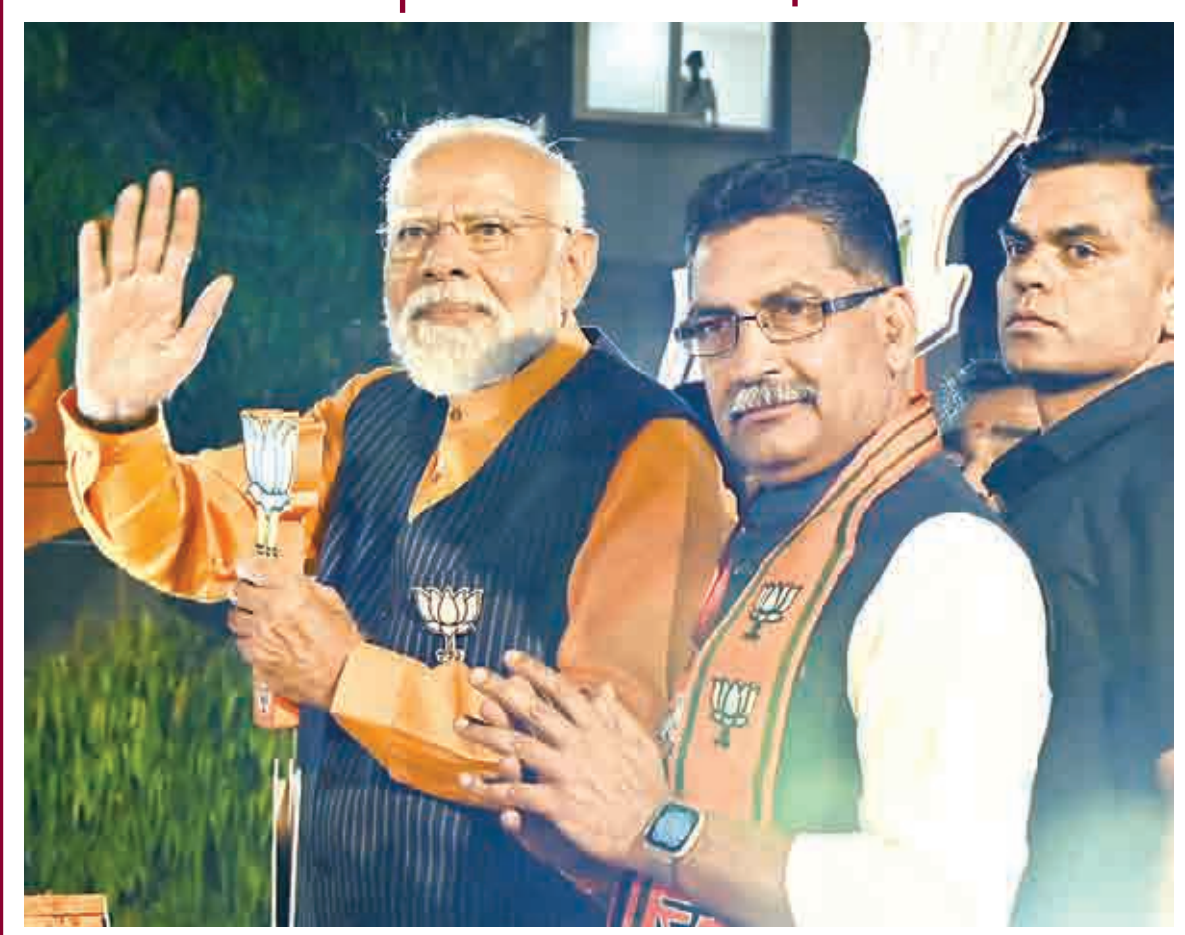
PM Modi with BJP candidate Ashish Dubey during a road show ahead of Lok Sabha elections, in Jabalpur, Sunday.