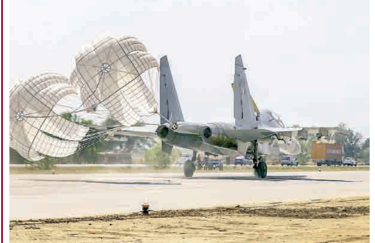
Indian Air force's fighter aircraft Sukhoi 30MKI lands on the Lucknow-Agra expressway, in Unnao, Sunday.