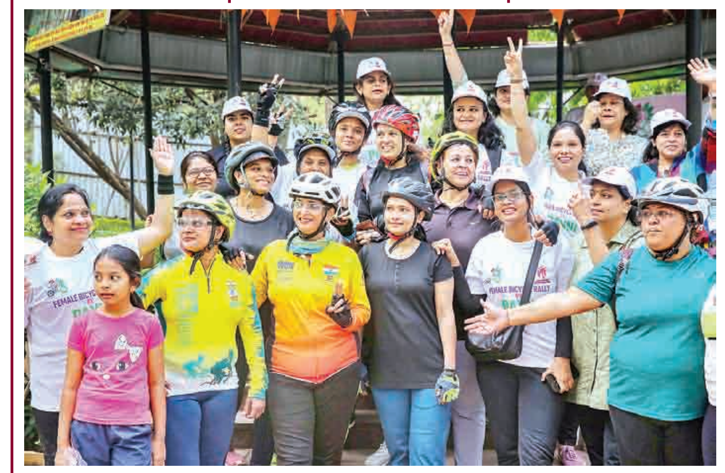
Women riders during a bicycle rally on the World Health Day, in Bhopal, Sunday, April 7.