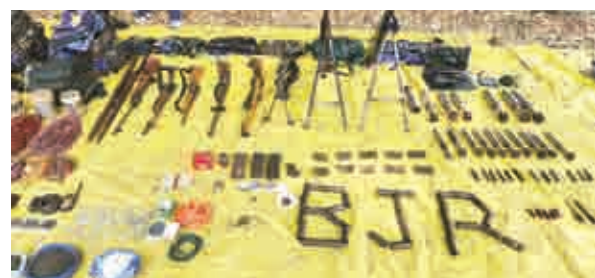
Gangalur, Apr 03: