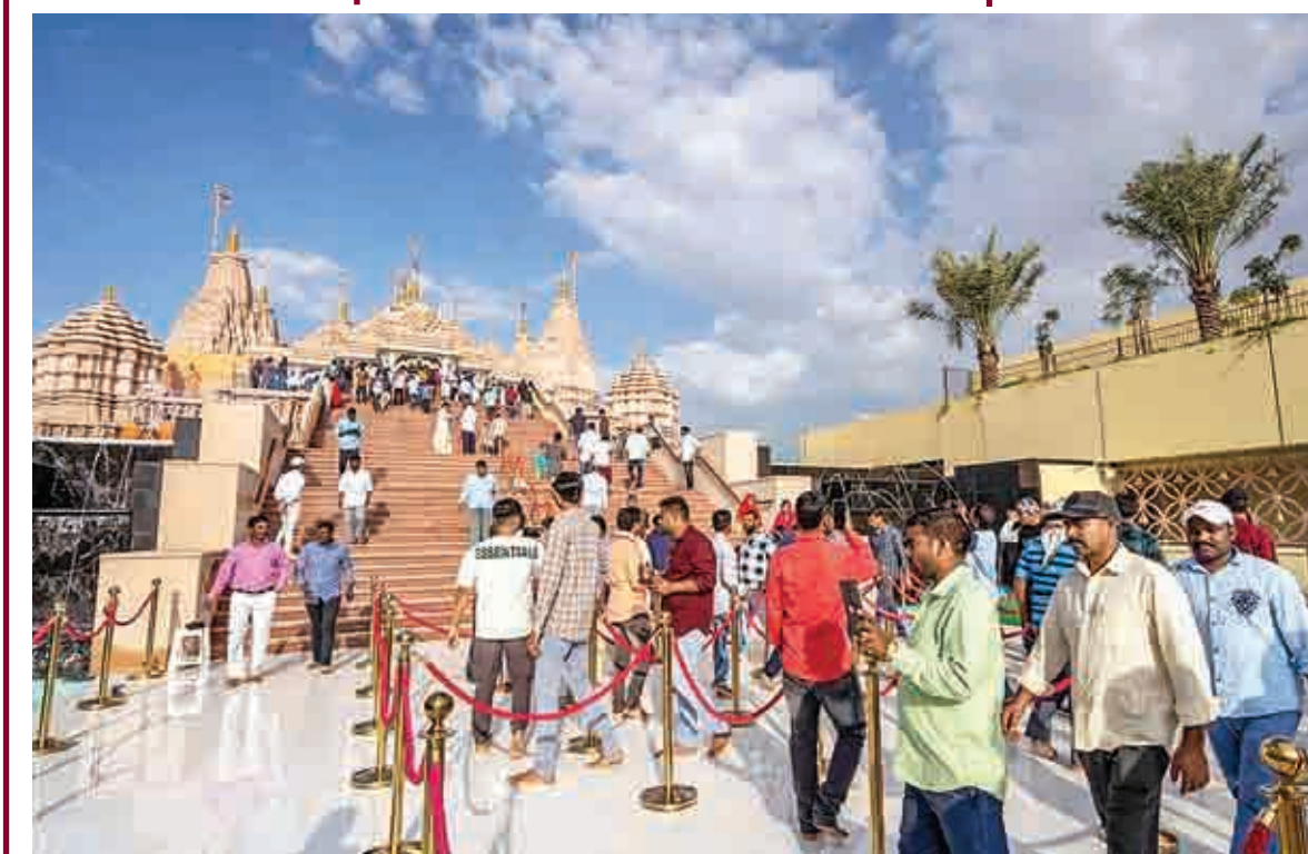
Devotees at BAPS Hindu Mandir, in Abu Dhabi, UAE.