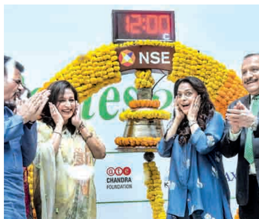
Actor Juhi Chawla at the bell ringing ceremony of NGO Routes 2 Roots as it is registered on NSE's Social Stock Exchange (SSE), in Mumbai, Wednesday, April 3, 2024.