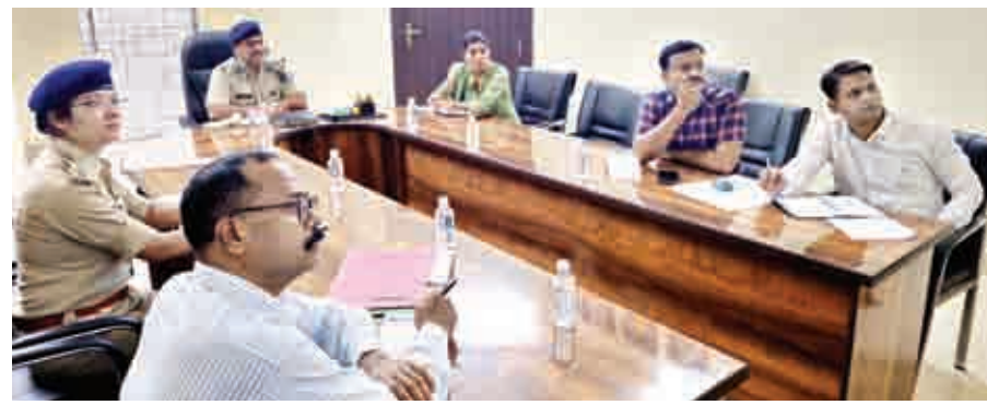
Bhilai, Apr 03: