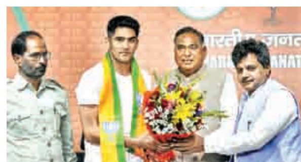
Boxer and former Congress leader Vijender Singh during joining BJP ahead of Lok Sabha elections, at BJP HQ in New Delhi, Wednesday.

"I am the same old Vijender. Whatever I would feel wrong, I would call it