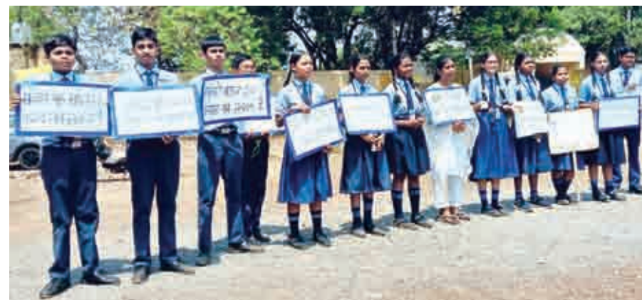
Raipur/Abhanpur, Apr 03:

On 2nd April 2024 Swami Atmanand Government Excellence School, (SAGES) Khorpa block Abhanpur, Raipur organised various voting awareness compelling events at school.