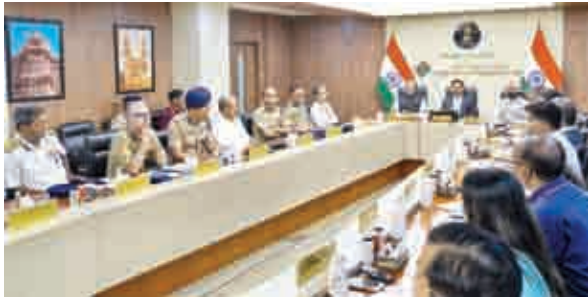
CEC Rajiv Kumar with ECs Gyanesh Kumar and SS Sandhu during a meeting with CSs, Director Generals of Police, MHA, MoD and heads of CAPF ahead of Lok Sabha polls, at Nirvachan Sadan, in New Delhi, Wednesday.

Recent violence and turmoil in Manipur and its ramifications for the conduct of a peaceful election were also addressed, with the EC urging for swift action to assist internally-dis-