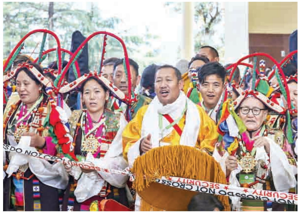
People gather to welcome Tibetan spiritual leader the Dalai Lama ahead of a prayer for his long life, in Dharamshala, Wednesday.