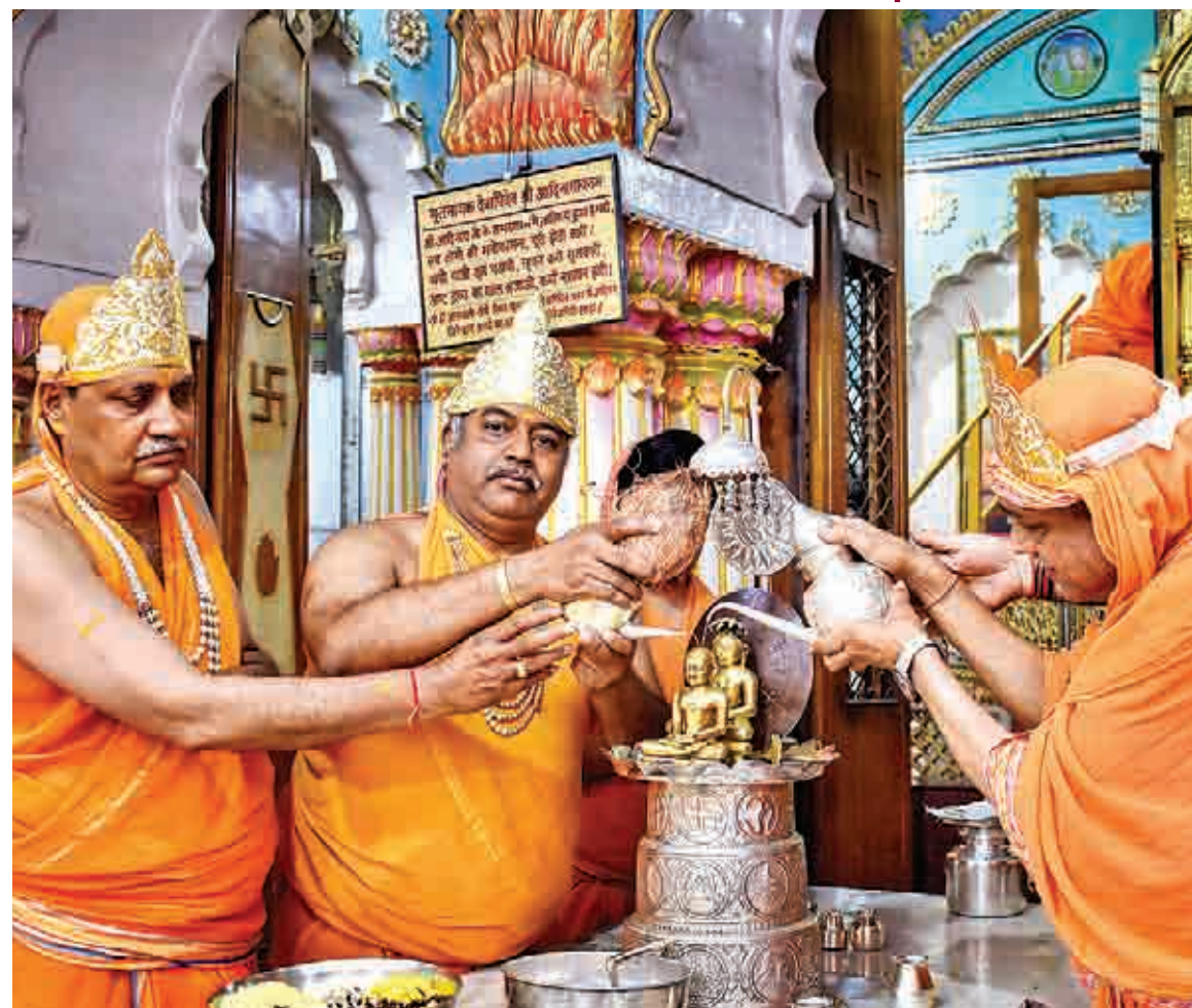
Jain monks with devotees perform 'Abhishekam' ritual on Rishabhdev Jayanti, in Prayagraj, Wednesday.