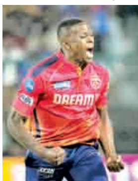
New Delhi, Apr 03 (PTI):

Rabada hugely impressed with Mayank's raw pace and accuracy