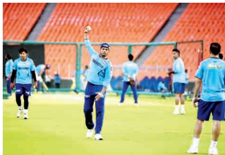
Ahmedabad, Apr 03 (PTI):

Bruised by Mayank Yadav's scorching pace, Punjab Kings' batters will face an altogether different challenge when Gujarat Titans' bowling unit tries to take the pace off deliveries on a slightly tricky Motera track in