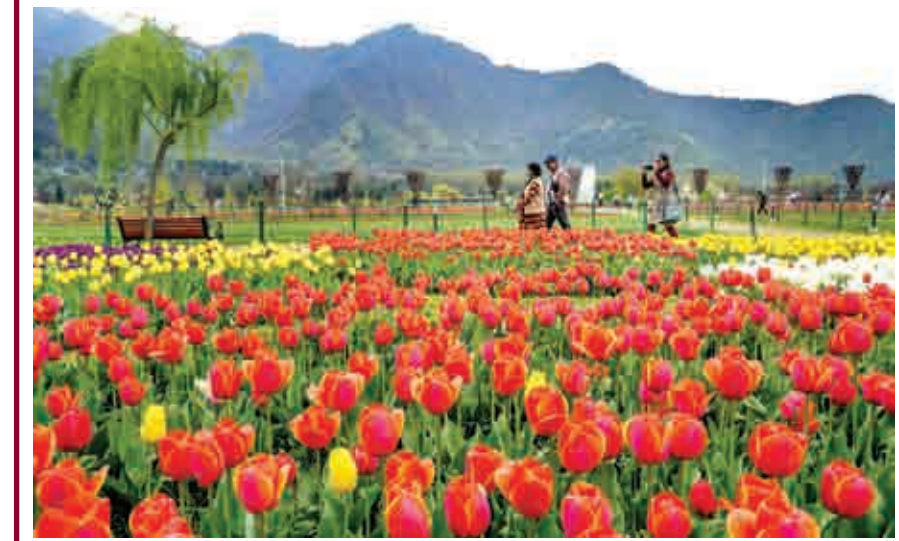
Tulips in bloom at Tulip Garden at the foothills of Zabarwan mountains, on the banks of Dal Lake, in Srinagar, Wednesday.