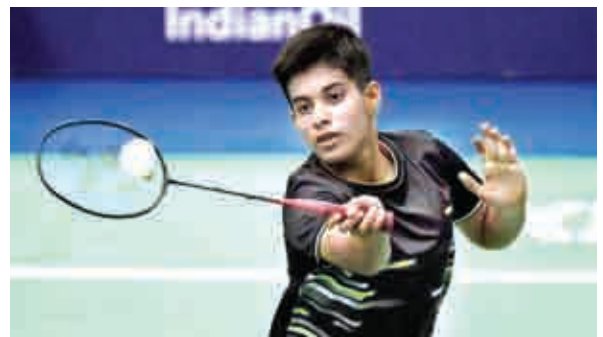
Astana, Apr 03 (PTI):