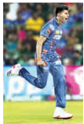
Bengaluru, Apr 03 (PTI):

Talented fast bowlers are often told to trade-off pace for more variations but Mayank Yadav, at the very onset, received golden advice from his illustrious Delhi senior Ishant Sharma - never compro-