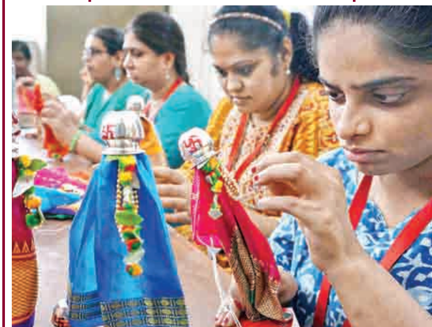
Women seen making small 'Gudi' as part of celebrations ahead of 'Gudi Padwa', a Hindu festival in Maharashtra and Goa, that marks the New Year for Marathi and Konkani Hindu community, in Thane, Wednesday.