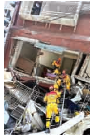
In this photo released by the National Fire Agency, members of a search and rescue team prepare to enter a leaning building in the aftermath of an earthquake in Hualien, eastern Taiwan on Wednesday.

The quake, which also injured hundreds, was centred off the coast of rural, mountainous Hualien County, where some buildings leaned at