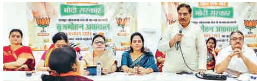
Central Chronicle News

Raipur, Apr 03: Bharatiya Janata Party (BJP) Mahila Morcha members from three Legislative Assembly segments under the Raipur Lok Sabha constituency, were asked to propagate the works of last 10 years of Narendra Modi government during the Parliamentary polls. Raipur Lok Sabha member Sunil Soni said that a strong government under the leadership of Modi