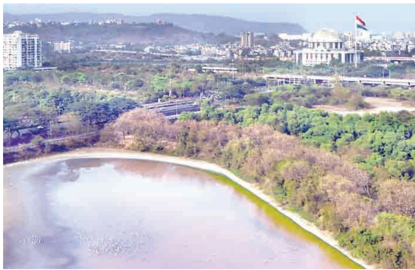
Flamingos seen on the water of DPS Lake as it has started turning reddish pink due to algae bloom, at Nerul in Navi Mumbai.