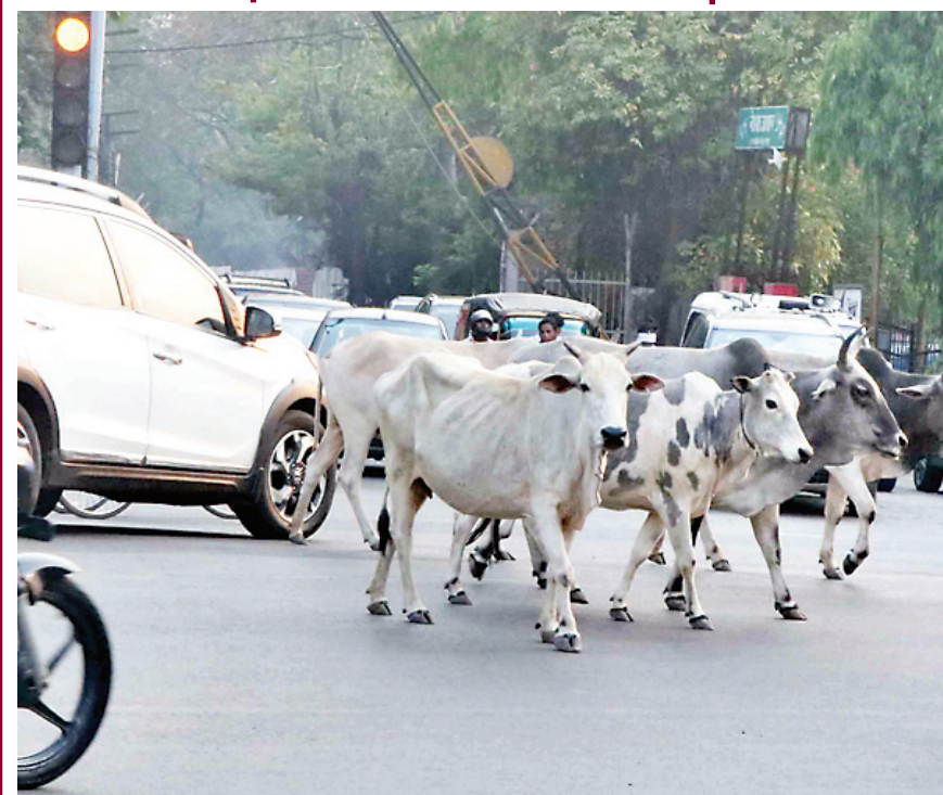
The city's main chowk is cattle menace during peak of the traffic hours and speaks of concern on part of the municipal authorities in taking action against stray cattle.