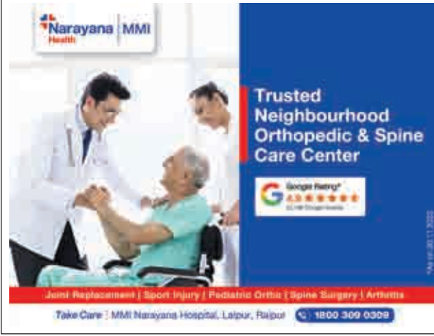
Joint Replacement | Sport Injury | Pediatric Ortho | Spine Surgery | Arthritis Take Care | MBI Narayana Hospital, Lalpur, Raipur | 1800 309 0309

Soft spoken, erudite and modest, Manmohan Singh has exited public life with his retirement from the Rajya Sabha - the former prime minister and architect of India's economic reforms slipping out of politics as quietly and without ceremony perhaps as he entered it 33 years ago.