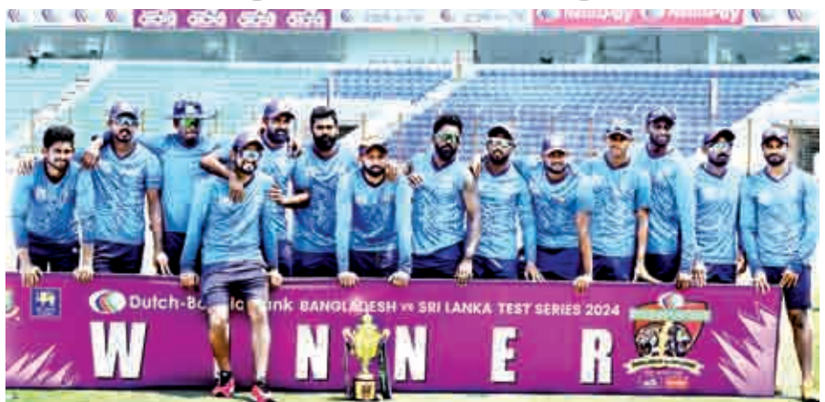
Chattogram, Apr 03 (AP):

Fast bowler Lahiru Kumara claimed four wickets for 50 runs as Sri Lanka swept the two-test series against Bangladesh with a 192-run victory in the second match on Wednesday.