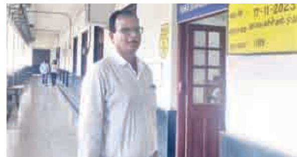
Raipur, Apr 03: