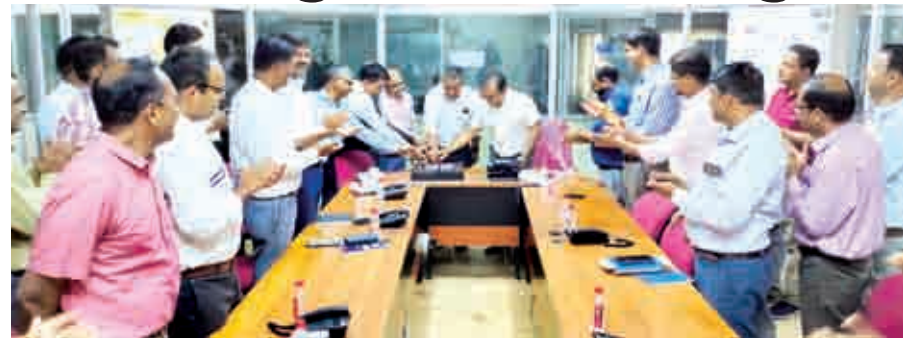
Bilaspur, Apr 03:

In a remarkable feat of efficiency and dedication, the Bilaspur Division of the Indian Railways has surpassed its freight loading target for the financial year 2023-24, achieving a record-breaking 172 million tonnes of freight traffic. This achievement places Bilaspur Division second among all divisions of the Indian Railways. The loading