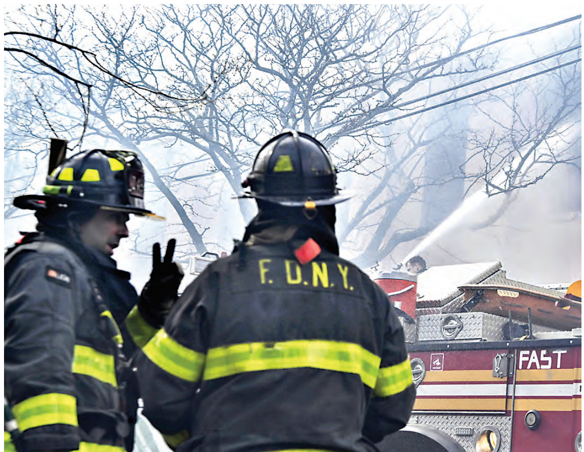
Firefighters battle a four-alarm fire at St. Stanislaus church, Easter, in the Brooklyn borough of New York. The fire, which broke out on Siegel Street between Bushwick Avenue and White Street, resulted in the collapse of one of the floors of the building.