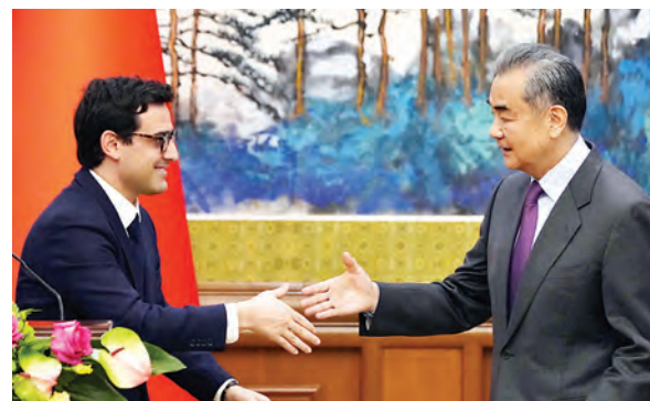
Chinese Foreign Minister Wang Yi, right, shakes hands with French Foreign Minister Stéphane Séjourné, left, after a joint press conference at the Diaoyutai State Guesthouse in Beijing, China, Monday, April 1.

European officials have expressed concern that a flood of low-priced Chinese-made electric vehicles could disrupt production and displace jobs in Europe. The EU is investigating whether Chinese government subsidies for EVs give an unfair advantage to Chinese