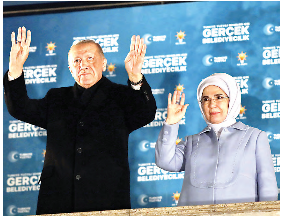
Turkish President and leader of the Justice and Development Party, or AKP, Recep Tayyip, left, and his wife Emine Erdogan gesture to supporters at his party headquarters in Ankara, Turkey, early Monday, April 1.