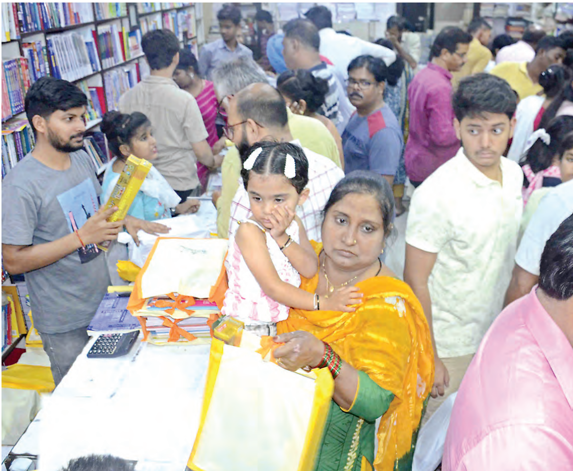
With the opening of Schools today, the rush of parents to book stalls has increased and each had to wait for long to get the books and uniforms for their wards.