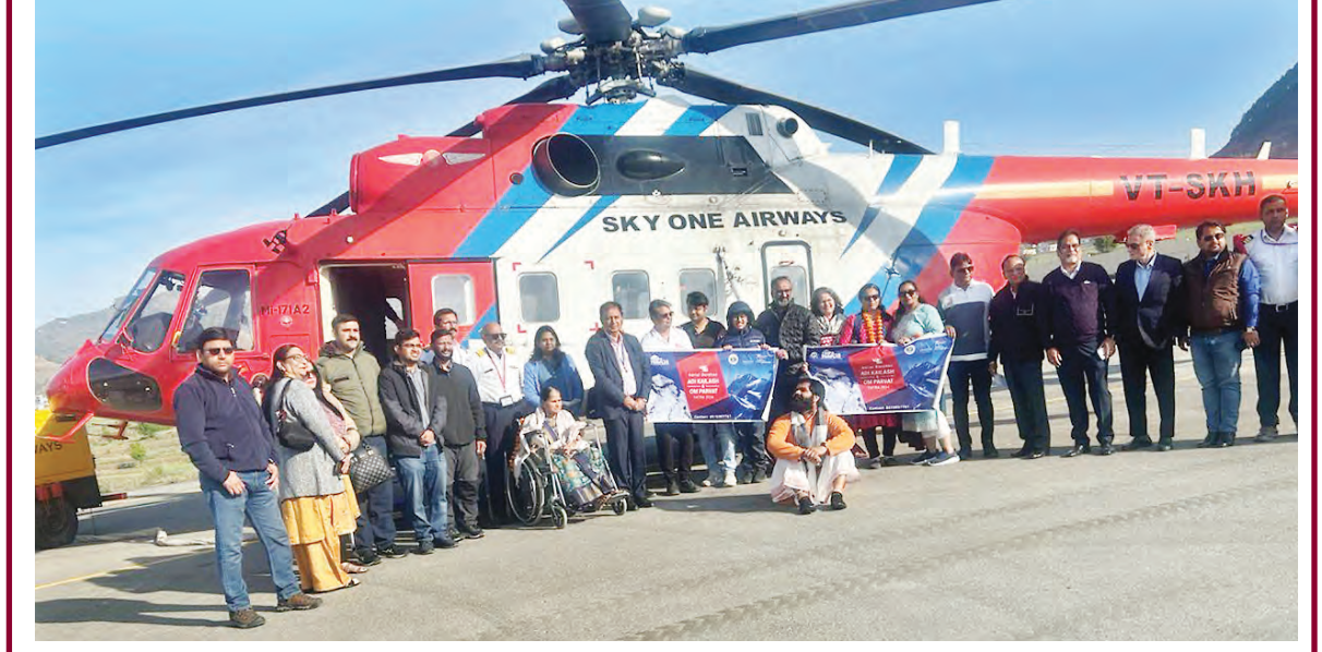
Pilgrims pose for photos after the launch of helicopter services to the peaks of Adi Kailash and Om Parvat, in Pithoragarh, Monday.