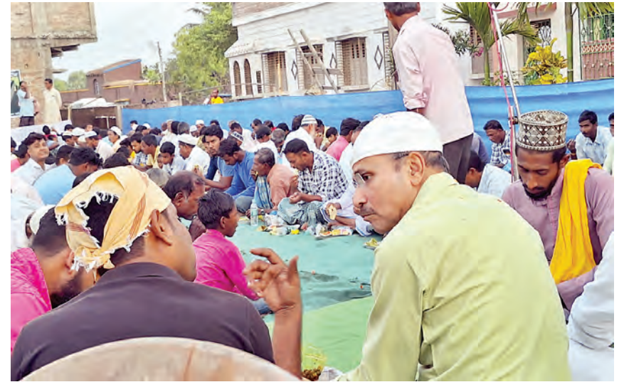
Congress leader Adhir Ranjan Chowdhury with Muslim devotees at 'Dawat-e-iftar' during the holy month of Ramzan, at Rangamati Chandpara village in Murshidabad district, Monday.