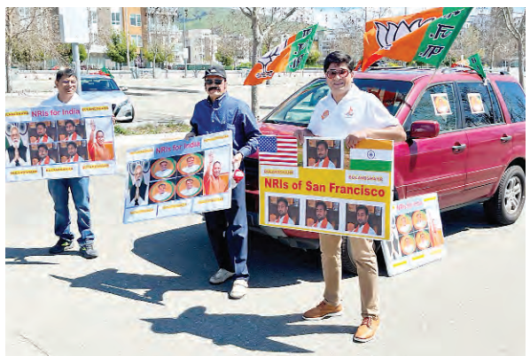
Members and supporters of the Overseas Friends of BJP take part in a car rally in support of Prime Minister Narendra Modi ahead of upcoming Lok Sabha elections in India, in USA.

Overseas Friends of BJP in US organises car rallies in 20 American cities