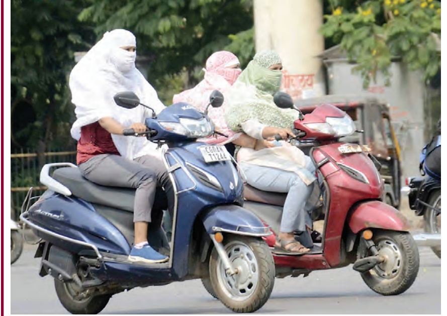
With start of April month, the girls have started taking all precautions in order to avoid any problems due to high temperature.