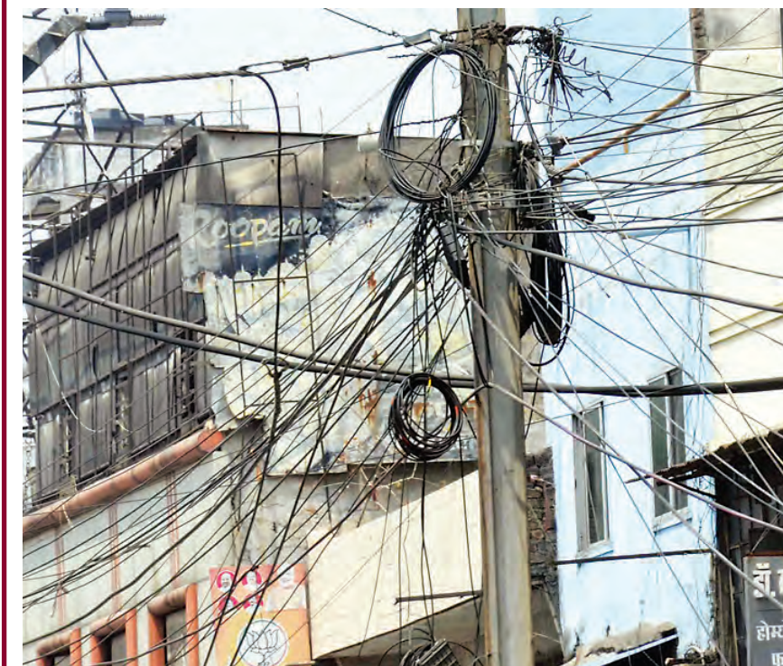
The wiring in majority of the city areas is still very complicated and poses risk specially during summer season and need to be sorted out immediately.