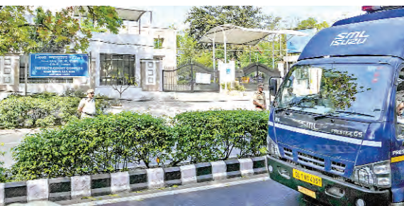
Arvind Kejriwal being taken to the Tihar Jail.

"He was brought to Tihar jail and will be lodged in Jail number 2. He was taken for a medical examination. He will be kept in a separate cell," a jail official said. AAP