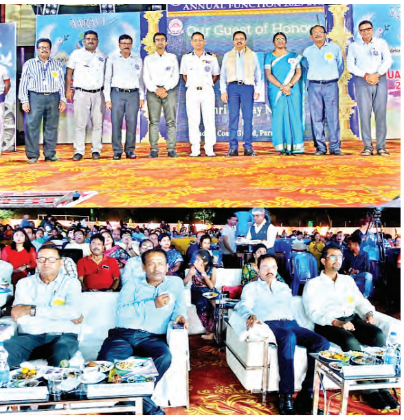
Paradip, Apr 01: