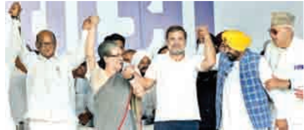
Congress leaders Sonia Gandhi and Rahul Gandhi, NCP (Sharad) leader Sharad Pawar and AAP leader Bhagwant Mann during I.N.D.I.A. bloc's 'Loktantra Bachao' rally at the Ramlila ground, in New Delhi, Sunday.

The leaders who were on the stage at the 'Loktantra Bachao' (save democracy) rally included Congress president Mallikarjun Kharge, for-