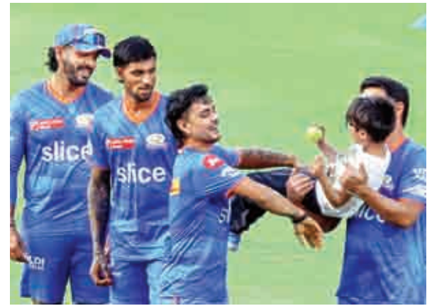
Mumbai Indians players during a practice session.

These are still early days in the 17th edition of the T20 league but Pandya's Mumbai Indians will need to end their losing streak and improve their Net Run Rate which is the worst