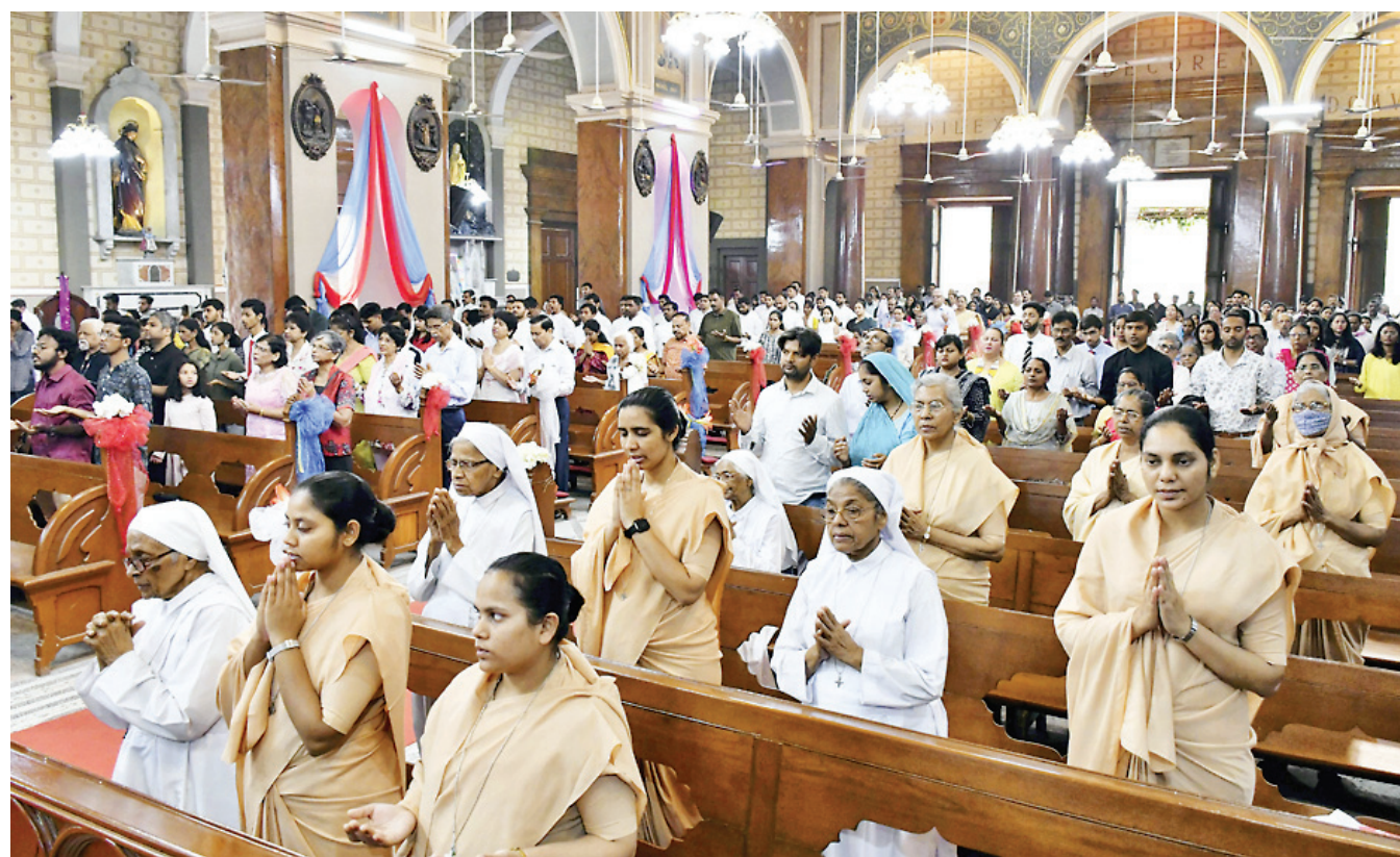
Christian devotees pray at St. Joseph's Cathedral church on Easter, in Prayagraj, Sunday, March 31.