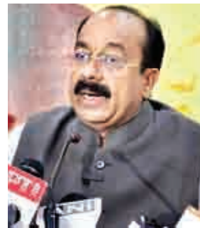
BJP does not need to implicate anyone without any basis.

Action has been taken on the basis of evidence and facts, he said, adding that