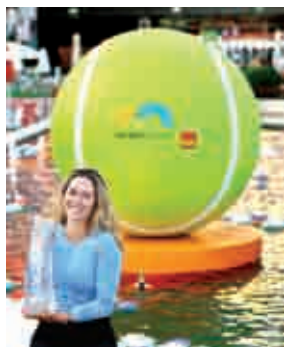
Danielle Collins of the United States poses with the trophy after winning the Women's Final.