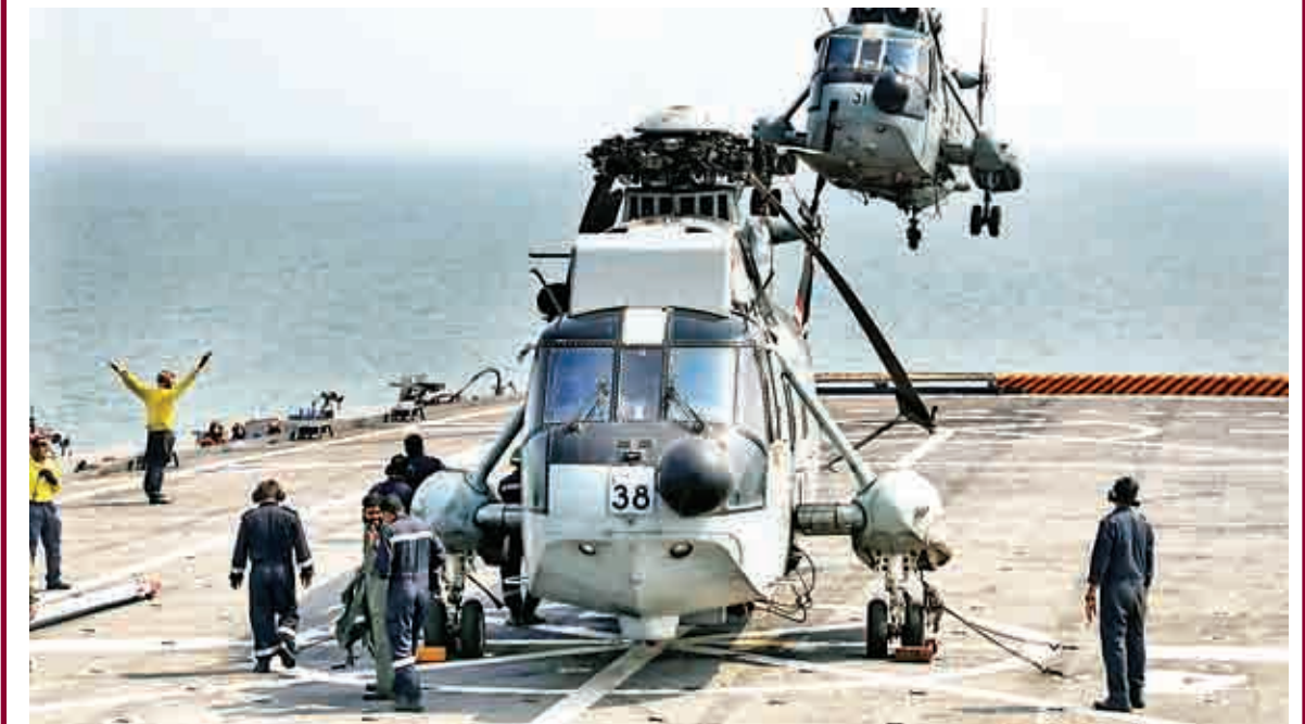
Helicopters during the closing ceremony of the Bilateral Tri-Service Humanitarian Assistance and Disaster Relief (HADR) Amphibious Exercise between India and US, Tiger Triumph 2024.