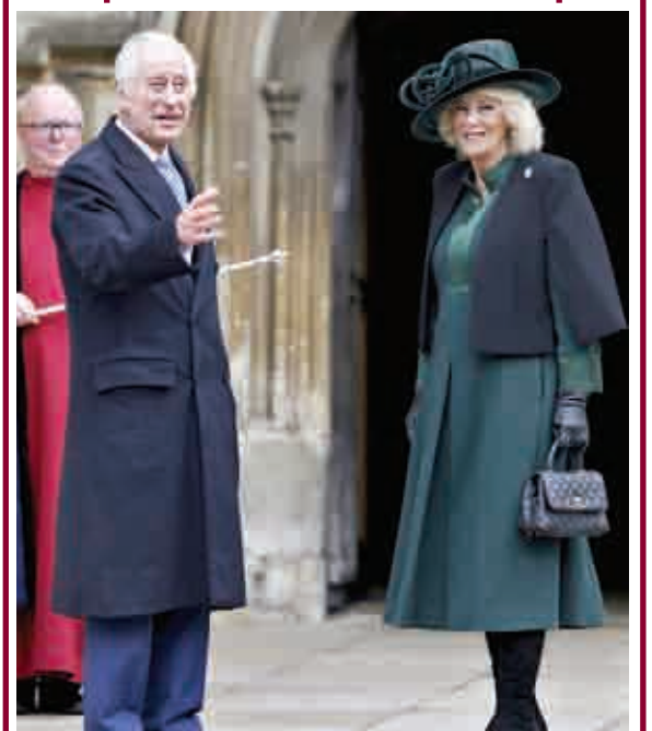
Britain's King Charles III, left, and Queen Camilla arrive to attend the Easter Matins Service at St. George's Chapel, Windsor Castle, England, Sunday, March 31.