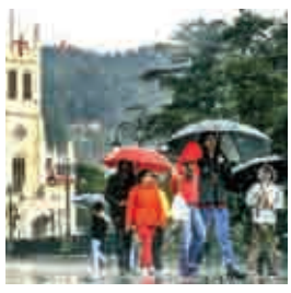
People take a stroll under umbrellas during hailstorm in Shimla, Sunday.