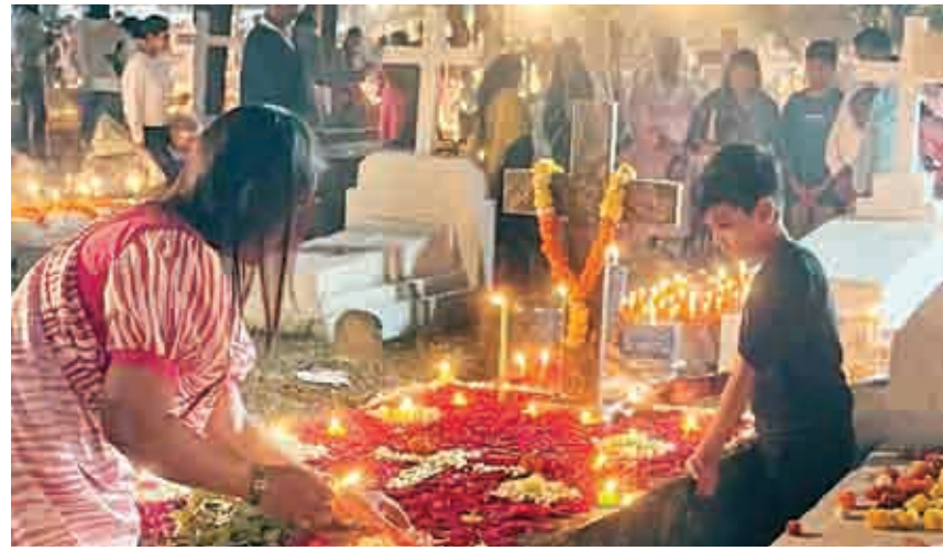
Christians in city celebrated Easter rejoicing and many people attended church services, exchange gifts, and enjoy festive meals with family and friends and flowering the cross as per the rituals here on Sunday.