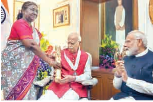
President Droupadi Murmu confers Bharat Ratna on veteran BJP leader L K Advani at his residence, in New Delhi, Sunday.

"His dedication to public service and his pivotal role in shaping modern India