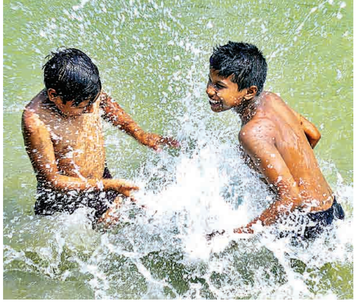
Children play in water to beat the heat during a hot day in Ranchi, Sunday.