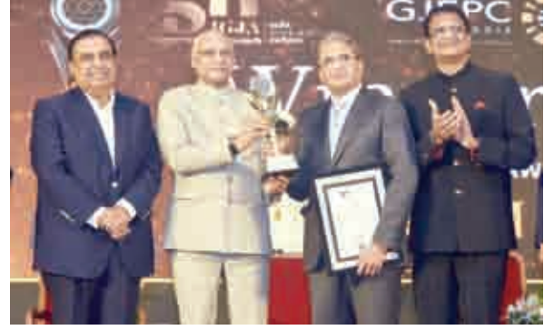
Mumbai, Mar 31:

Polis to the 48 Lok Sabha seats in Maharashtra will be held in five phases between April 19 and May 20 and votes will be counted on June 4.