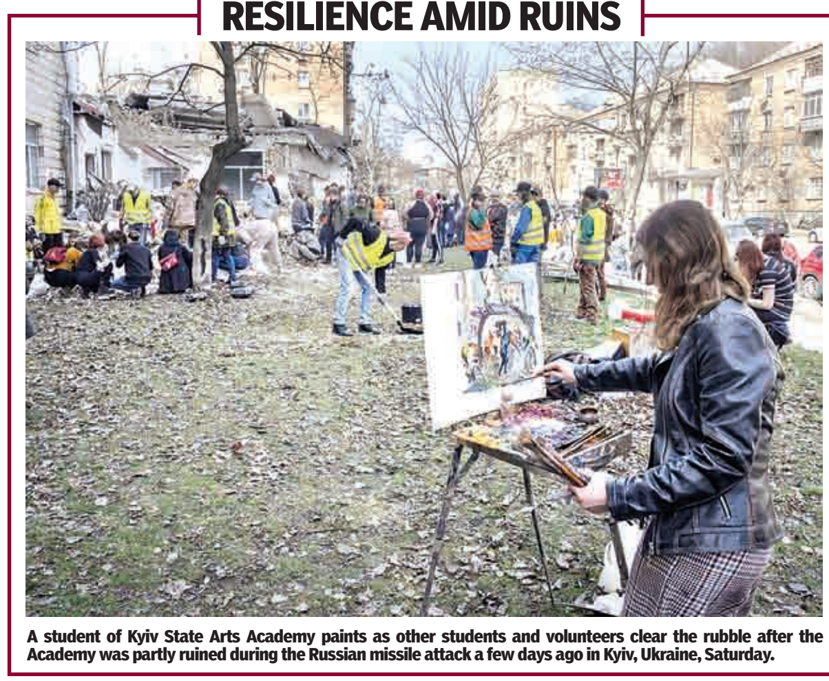
A student of Kyiv State Arts Academy paints as other students and volunteers clear the rubble after the Academy was partly ruined during the Russian missile attack a few days ago in Kyiv, Ukraine, Saturday.

Five people, including three children, were buried in the rubble after their house collapsed due to rain in Bajaur tribal district. In Shangla district, two children died when