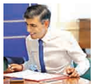
Sunday Times' analysis of the major seat-by-seat survey claims Tory prospects have hit a record low, which means they are on track for their worst election result, winning fewer than 100 seats. Labour could win 468, giving Opposition leader Sir Keir Starmer's party a whopping 286-seat majority. "Our MRP forecast shows that, if the election were held tomorrow,

The 15,029-person MRP poll conducted by Survation on behalf of Best for Britain puts the Opposition Labour Party on 45 per cent of the vote share with a 19-point lead over the Conservatives, up three points from the group's previous poll at the end of last year. "The