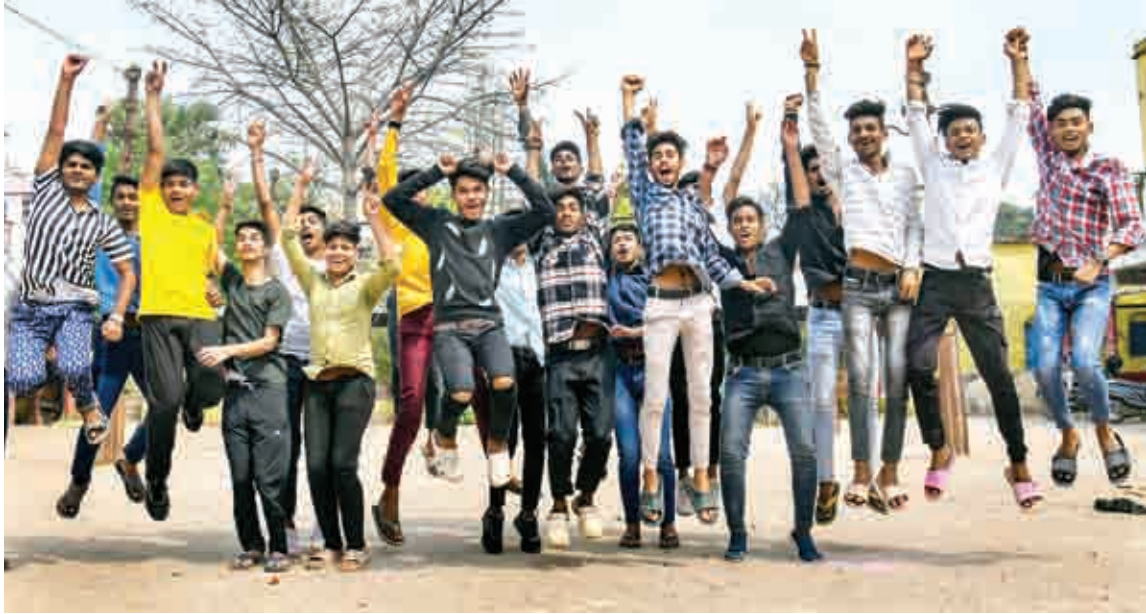
Students celebrate their success after the declaration of the class 10th results of the Bihar Board, in Patna, Sunday.