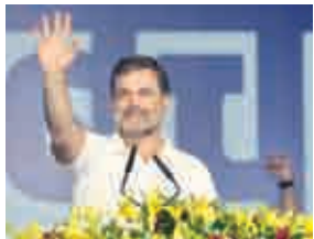
Rahul Gandhi waves as he addresses I.N.D.I.A. bloc's 'Loktantra Bachao Rally' at Ramlila Maidan, in New Delhi, Sunday.

Addressing the INDIA bloc's 'Save Democracy' rally at the Ramlila Maidan here, the former Congress chief said this is not an ordinary election but one to save the country's democracy and Constitution. "When pressure is put on umpires and captain, players are bought off and the match is won, in cricket, it is called match-fixing. We have Lok Sabha polls before us. Who selected the umpires?"