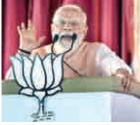
PM Modi addresses during an election campaign rally ahead of Lok Sabha polls, in Meerut, Sunday.

"When Modi is fighting the battle against corruption with full strength, these people have formed the INDIA alliance. They think they will intimidate Modi, but for me, my Bharat is my family and I am taking steps to protect it from the corrupt," the prime minister said addressing his first rally in Uttar Pradesh after the announcement of the Lok Sabha election schedule. Modi's counter-offensive came as the stalwarts of the INDIA bloc held a rally at the Ramlila Maidan in