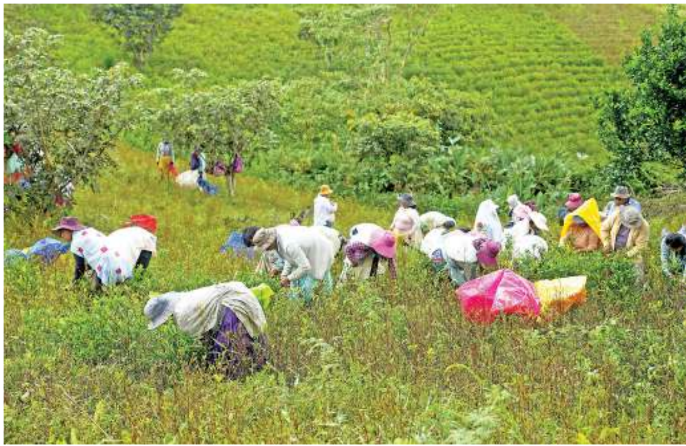
Farmers from the Yungas region harvest coca leaves near Trinidad Pampa, a coca-producing area in Bolivia.