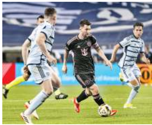
Inter Miami's Argentine forward #10 Lionel Messi (C) controls the ball during the MLS football match between Sporting Kansas City and Inter Miami CF at the Arrowhead Stadium in Kansas City, Missouri.