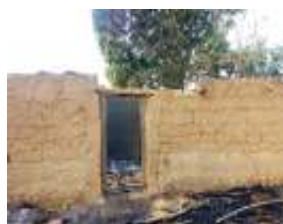
Remains of the house which caught fire.