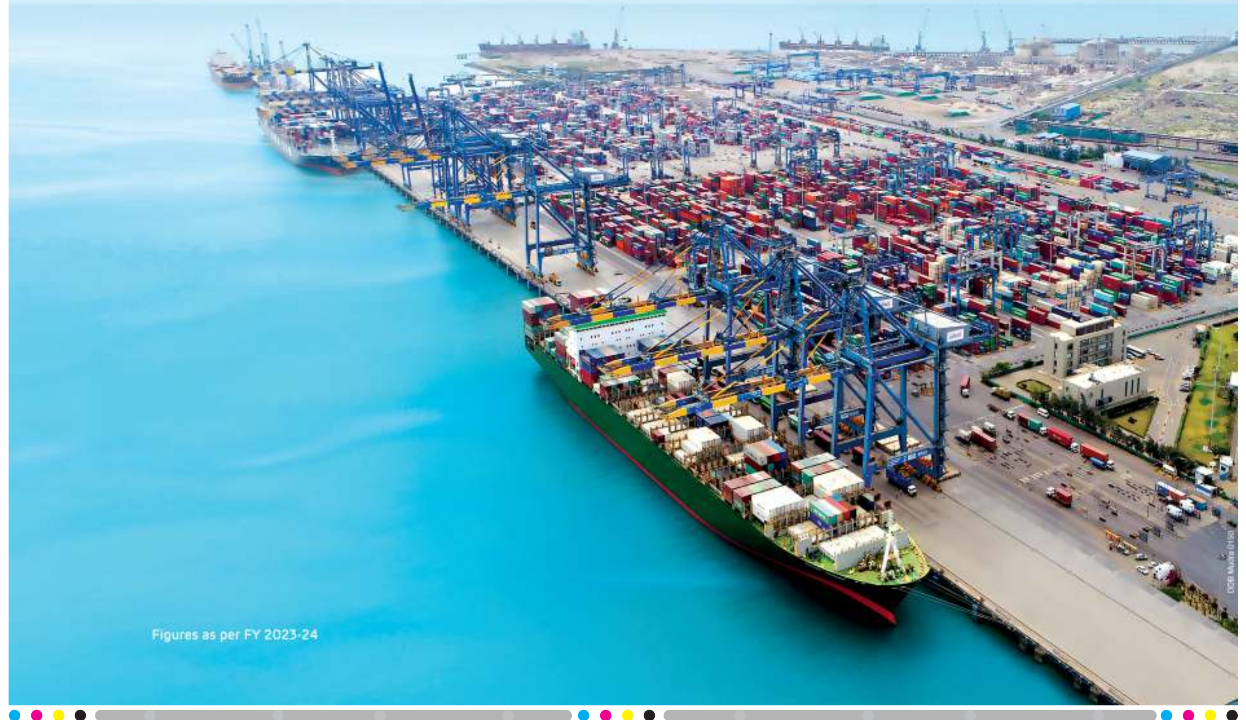
DCE Media (P) Ltd.