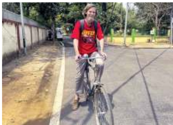
Development economist Jean Dreze in Ranchi.

In an exclusive interview with PTI, Dreze said five years ago, Arundhati Roy had described the 2019 elections as a race between a Ferrari and a few bicycles. "The metaphor is still valid. Today, thanks to the Supreme Court, we know that the Ferrari is fuelled