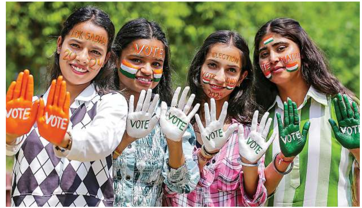
Young women with their faces and hands painted to aware people to vote pose for photographs ahead of the Lok Sabha elections, in Amritsar, Sunday.