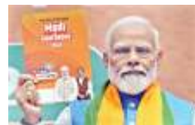
PM Modi releases the BJP's election manifesto 'Sankalp Patra' at the party headquarters, in New Delhi, Sunday.

Prime Minister Narendra Modi on Sunday released the BJP's Lok Sabha manifesto which has a special focus on the poor, youth, farmers and women, and asserted that the need for a stable government with full majority was necessary when the world was passing through uncertain times.