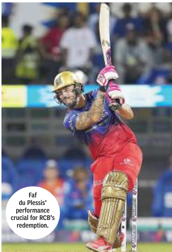
Faf du Plessis' performance crucial for RCB's redemption.

Throughout the tournament, RCB's bowlers have displayed a lack of adaptability and innovation, often resorting to predictable tactics against aggressive batsmen. Their inability to contain opposition batsmen was glaringly evident in their recent match against Mumbai Indians, where they conceded a mammoth total despite posting a compet-