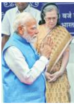
PM Modi with Congress leader Sonia Gandhi during Ambedkar Jayanti celebrations, at Parliament in New Delhi, Sunday.