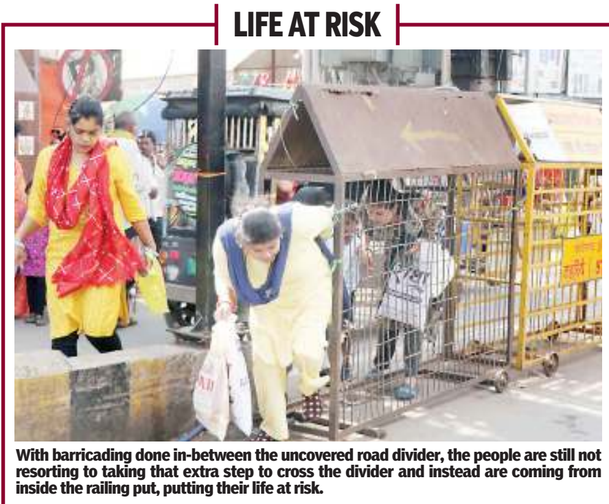
With barricading done in-between the uncovered road divider, the people are still not resorting to taking that extra step to cross the divider and instead are coming from inside the railing put, putting their life at risk.

fidence of people towards the party. It is a reflection of expectations of youth for the young Indians. In the last 10 yrs, 25 cr people have come out of the below poverty line. The senior citizens above 70 yrs have got benefitted from Ayushman Bharat Yojana. Apart from 4 cr 'pucca' houses have been constructed and 3 cr more are to be constructed. The party has ensured supply of LPG cylinders at affordable rates and now there are plans to take Gas pipelines directly to homes. There will be work to make electricity bills of crores to zero and then works will be done to generate revenue from power generation from domestic consumers as well. Under PM Surya Yojana, now the people will not get electricity, but they will generate it and sell it, he added. On this occasion BJP senior leaders, party's LS candidate from Raipur LS seat Brijmohan Agrawal, BJP State media in-charge Amit Chimmani, co-in-charge Anurag Agrawal, spokesmen Amit Sahu, Nalinesh Thokane and others were present.