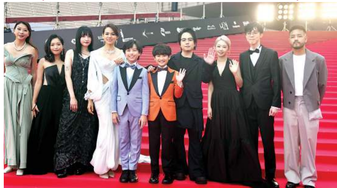
The cast and crew from the movie Time Still Turns The Pages pose for photos during the red carpet for the 42nd Hong Kong Film Awards in Hong Kong, Sunday, April 14, 2024.