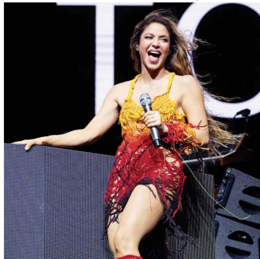
Shakira performs with Bizarrap during the first weekend of the Coachella Valley Music and Arts Festival at Empire Polo Club on Friday, April 12, 2024, in Indio, Calif.