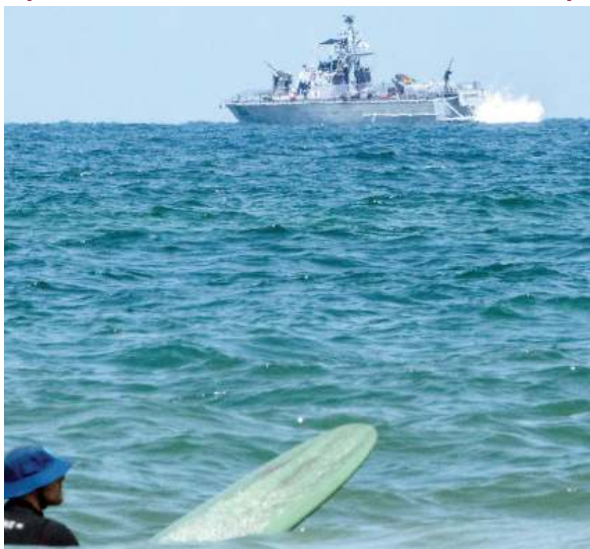
A surfer waits for wave while an Israeli military naval ship patrols the Mediterranean sea off the coast of Hadera, Israel, Sunday, April 14, 2024.