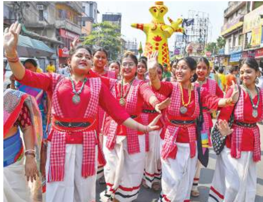
People take part in a procession to celebrate Bengali New Year, 'Poila Baishakh', in Kolkata, Sunday.