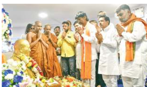
Maratha activist Manoj Jarange Patil pays tribute to BR Ambedkar on his birth anniversary, in Mumbai, Sunday.

Jarange slammed Deputy Chief Minister Devendra Fadnavis and said police continues to register cases against Maratha quota agitators across the state even for incidents that took place four