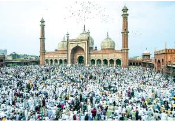
Devotees assemble to offer 'namaz' at the Jama Masiid on the occasion of the Eid-ul-Fitr festival, in New Delhi, Thursday.

strikes. hailstorms, and A spell of moderate rainfall is expected over the mountains and the plains of northwest India this weekend due to two back-to-back western disturbances and high moisture incursion from the Arabian Sea, the India Meteorological Department said on Thursday. States and Union territories, including Jammu and Kashmir, Himachal Pradesh, Uttarakhand, Punjab, Haryana, Rajasthan, and northwest Uttar Pradesh,