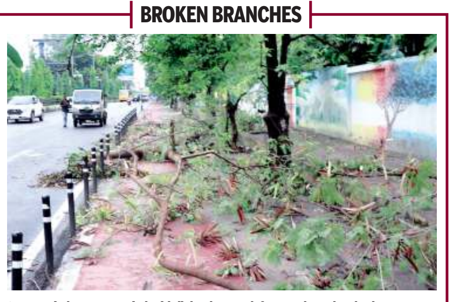
Strong winds accompanied with light showers left many branches broken at many places here on Thursday morning.

cially strong. Today India is again on the path of becoming Vishwa Guru and for which we will have to reelect him as the PM for the third time and for which he has come to seek people's blessings.