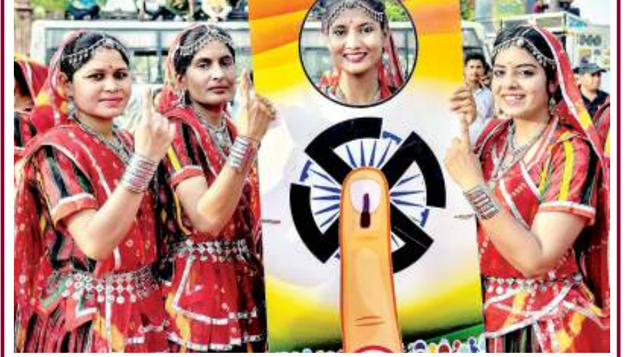
Women constables perform 'nukkad natak' for spreading awareness about voting ahead of the Lok Sabha election, in Bikaner, Thursday.

The principal of the school whose bus overturned in Harvana's Mahendragarh, killing six children, is among three people who have been arrested in connection with the incident. The driver, who allegedly jumped out of the bus just before it rammed into a tree, has also been taken into custody, along with the secretary of the school. A senior police official said the medical test conducted on the driver has confirmed that alcohol was present in his bloodstream.