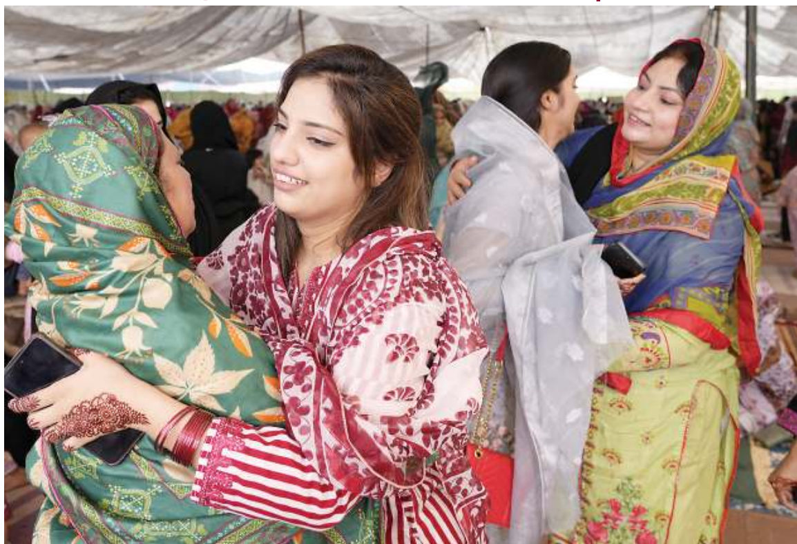
Muslim women share Eid greeting after performing an Eid al-Fitr prayer, marking the end of the fasting month of Ramadan, at historical Badshahi mosque in Lahore, Pakistan, Wednesday, April, 10.