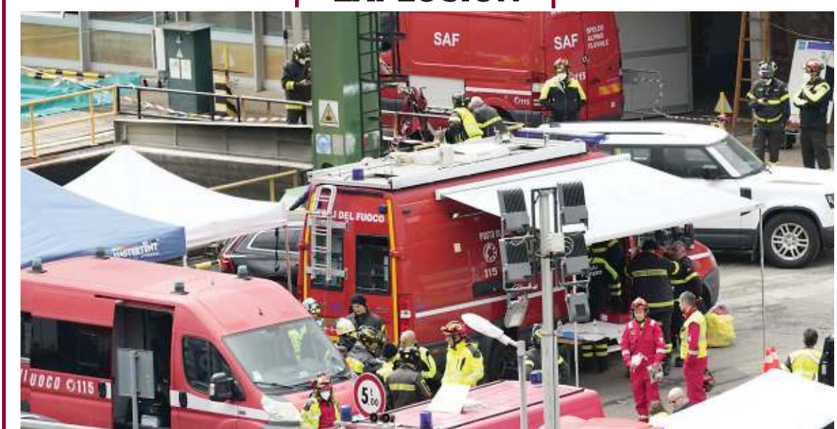
Fire fighters work at the scene of an explosion that occurred at the Enel Green Power hydroelectric plant at Suviana Dam, some 70 kilometers southwest of Bologna, Italy, April 10.