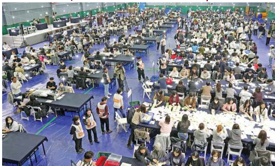
National Election Commission officials sort out ballots for counting at the parliamentary election in Seoul, South Korea, Wednesday, April 10.