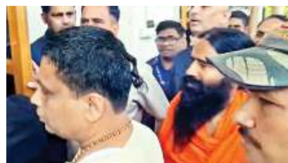
Yoga guru Ramdev and Patanjali MD Acharya Balkrishna arrive at the Supreme Court for hearing on the Patanjali misleading advertisements case, in New Delhi, Wednesday.

"We will rip you apart," a bench of Justices Hima Kohli and Ahsanuddin Amanullah told the counsel representing the authority in an unusually