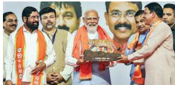
PM Modi being felicitated by Maharashtra CM Eknath Shinde and others during a public rally ahead of the upcoming Lok Sabha election, in Nagpur, Wednesday.

"Yes, he will hold rallies across the state, including Chhatrapati Sambhajinagar city. We will organise his rallies as per his schedule," he said.