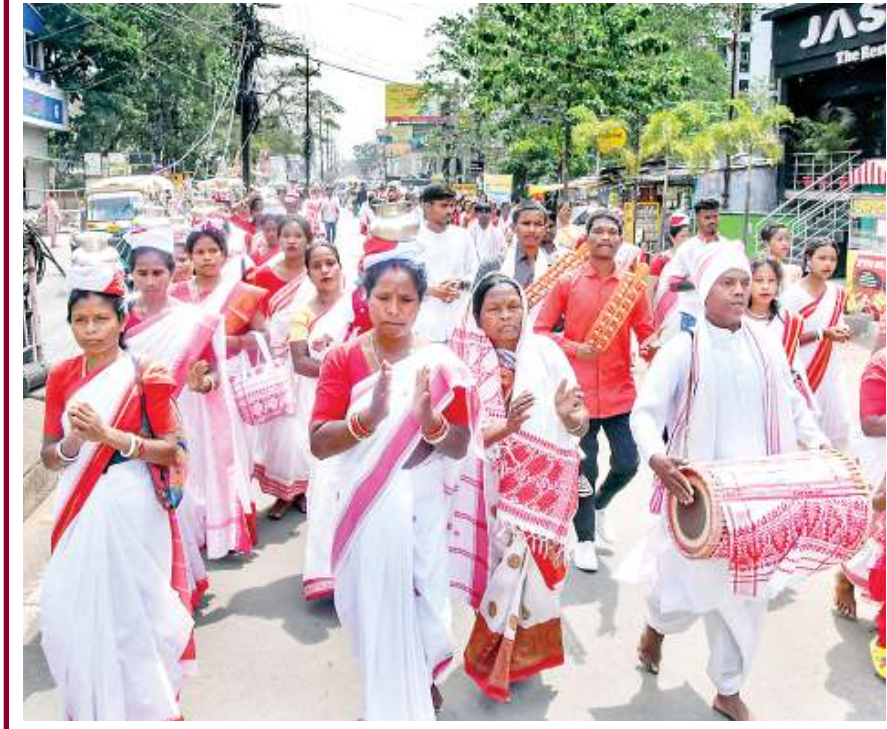
Tribals in traditional attire take part in a 'Kalash Yatra' on the eve of 'Sarhul' festival, in Ranchi, Wednesday.