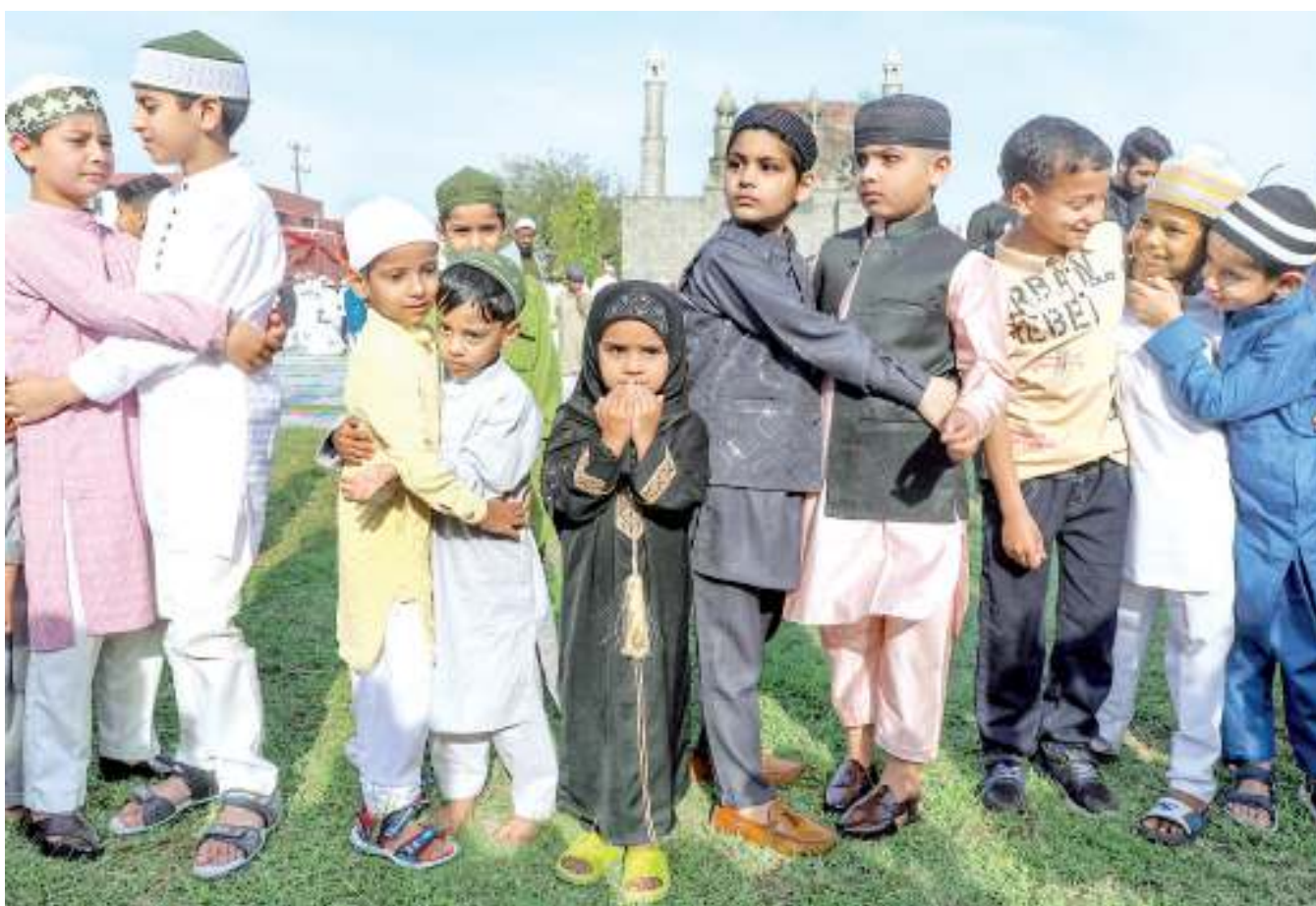
Muslim children celebrate Eid-al-Fitr, at an Eidgah, in Jammu, Wednesday, April 10.