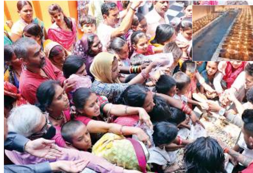
Devotees thronged for the 'prasad' in the temple after offering prayers to Goddess Durga in the temple. Large numbers of 'Jyoti Kalash' of the devotees have been lighted up completely in all the temples.