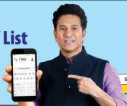
Sachin Tendulkar National Icon, ECI