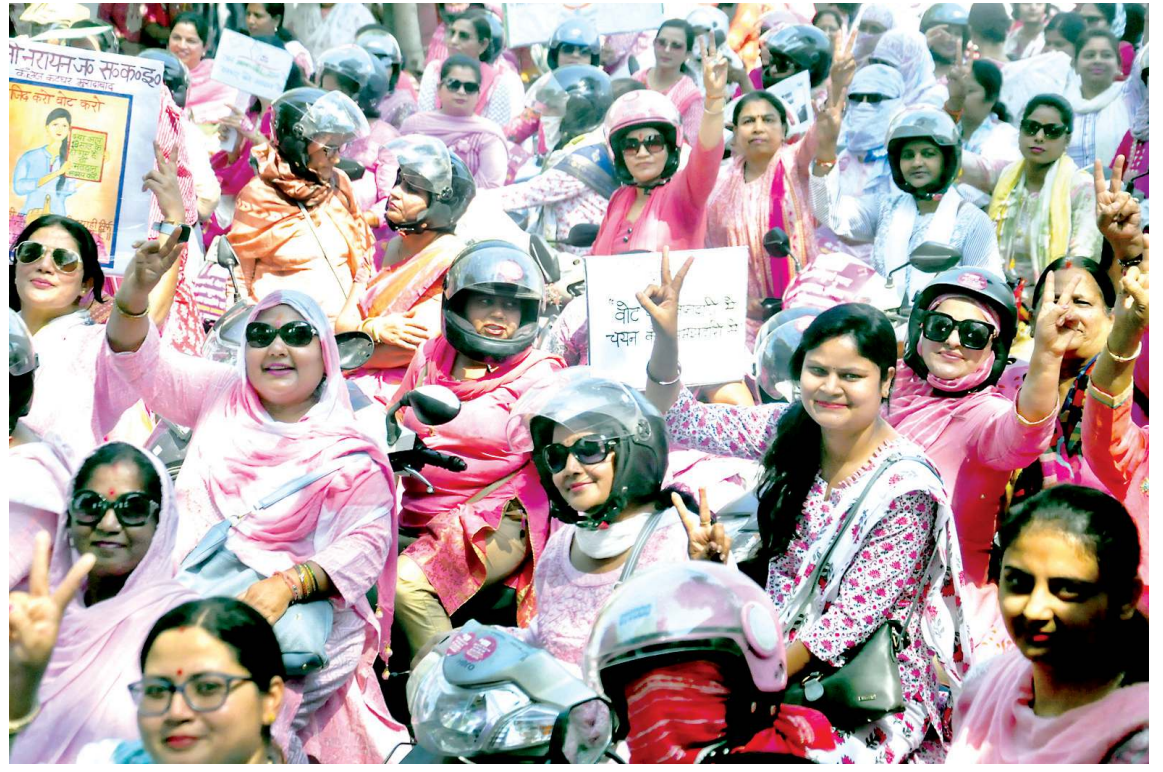
Women participate in a voter awareness rally ahead of the Lok Sabha elections, in Moradabad, Monday.