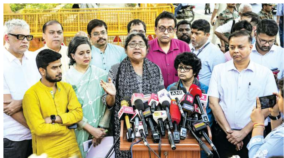
A ten-member TMC delegation addresses the media after meeting with the full bench of EC, in New Delhi, Monday.