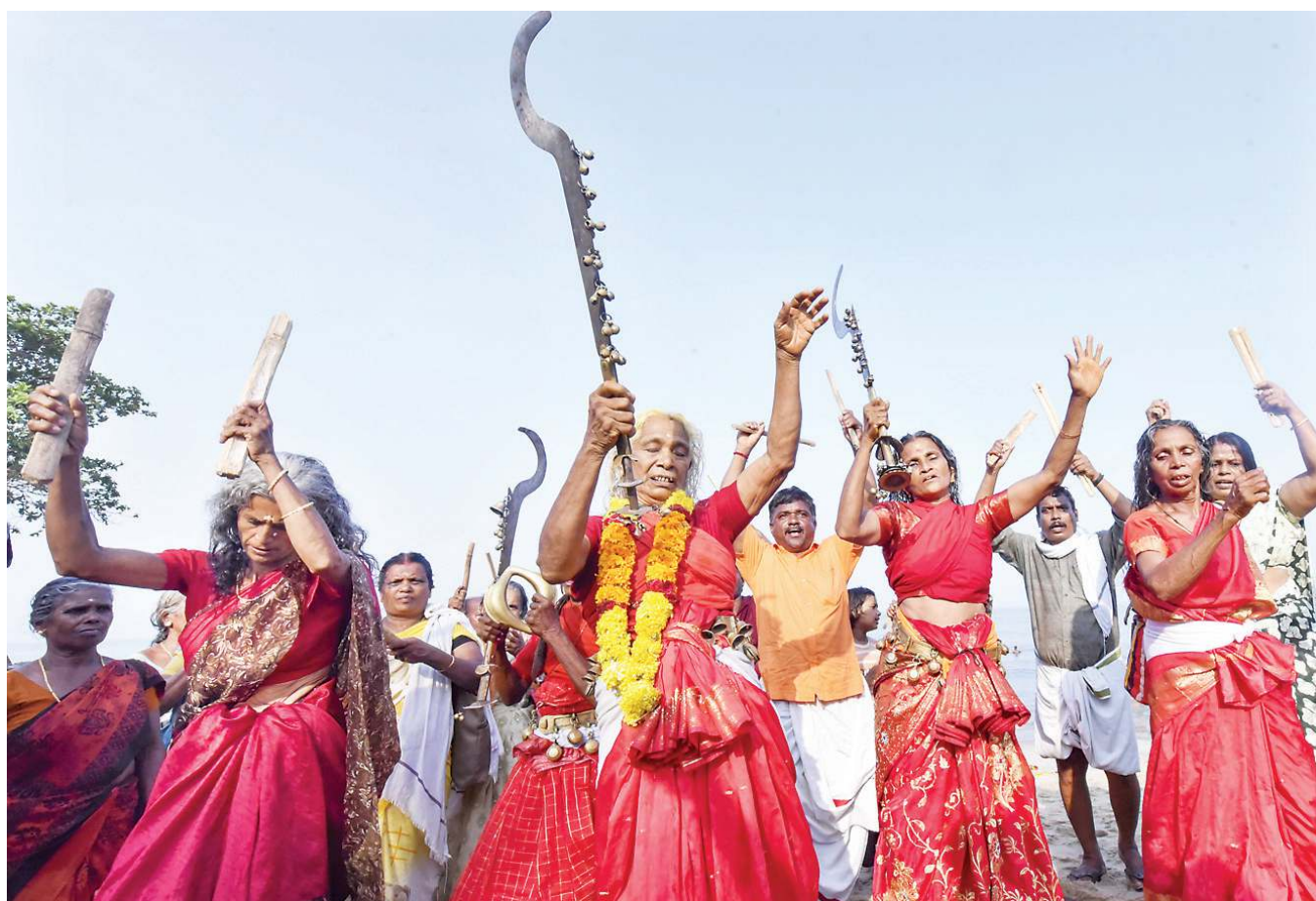
Devotees participate in Kavu Theendal ceremony during the annual 'Bharani' festival, at Kodungallur Bhagavathy Temple in Thrissur district, Monday, April 8.