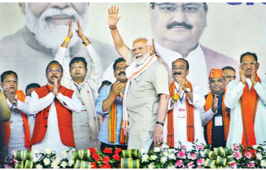
'PM failed' to protect rights of tribals'

Prime Minister Narendra Modi on Monday hit out at the opposition Congress, saying it overlooked needs of the poor for decades since Independence and never understood their pain.