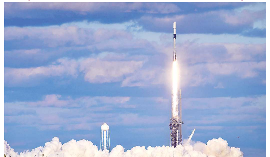
In this photo provided by South Korea Defense Ministry, South Korea’s second military spy satellite lifts off from the Kennedy Space Center in Cape Canaveral, Fla. South Korea has launched its second military spy satellite into space, days after North Korea reaffirmed its plan to launch multiple reconnaissance satellites this year.