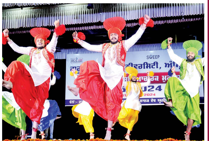
Students perform 'Bhangra' during a folk dance competition at Guru Nanak Dev University, in Amritsar, Monday.