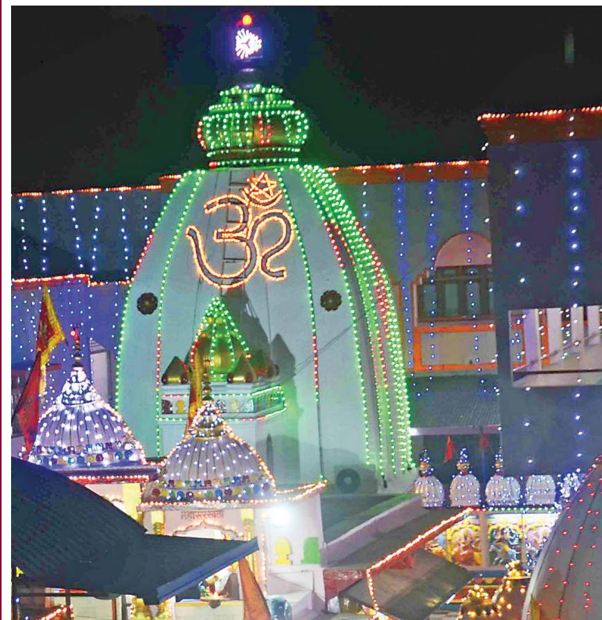
Temples have been illuminated with colourful lights for the nine-day festival of 'Navratri' starting on Tuesday.