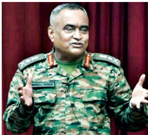
Chief of the Army Staff General Manoj Pandey addresses the student officers from the Indian Armed Forces and other countries undergoing the 79th Staff Course at Defence Services Staff College (DSSC), at Wellington in Nilgiris district, Monday.