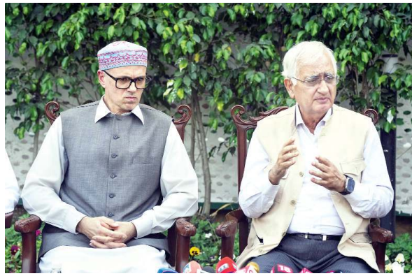
Congress leader Salman Khurshid and J&K National Conference leader Omar Abdullah during a press conference, in New Delhi, Monday.

"I want to formally announce that the National Conference and Congress will jointly contest the elections in Jammu and Kashmir and Ladakh with three candidates for each