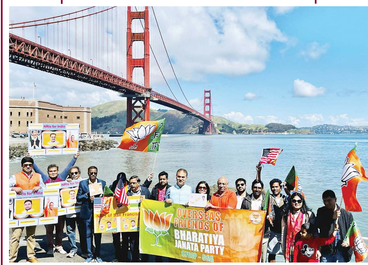
Members and supporters of the Overseas Friends of BJP take part in a rally in support of Prime Minister Narendra Modi ahead of upcoming Lok Sabha elections in India, in USA.