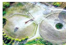
Jorhat (Assam), Apr 08 (PTI): Assam Chief Minister Himanta Biswa Sarma on Monday said the Maidams of Charaideo, burial mounds of Ahom royals, are set to attain UNESCO World Heritage Site

status by the end of this year. Praising Prime Minister Narendra Modi's dedication to Assam, Sarma urged the public to support him for a third consecutive term. Addressing an election rally at Charaideo under Jorhat Lok Sabha seat, Sarma recounted his meeting with Modi where he had placed the request for recommending the 'Maidams' as the country's nomination for UNESCO World Heritage site label.