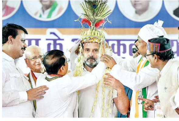
Congress leader Rahul Gandhi during a public meeting ahead of Lok Sabha elections, at Dhanora in Seoni district, Monday.

Addressing a rally at Dhanora in Seoni district, part of the Mandla Lok Sabha constituency which will vote in the first phase on April 19, he assured to provide guaranteed apprenticeships to unemployed youths if the Congress formed the next government at the Centre.