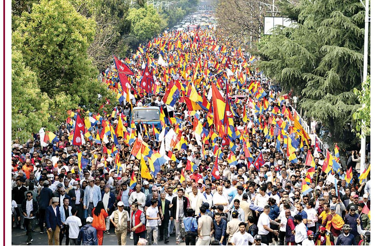
Supporters of Rastriya Prajatantra Party, or national democratic party, wave their flags as they take part in a protest demanding a restoration of Nepal's monarchy in Kathmandu, Nepal, Tuesday.