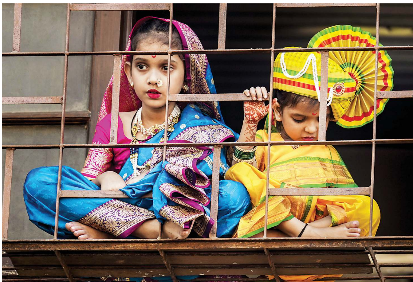
Children dressed in traditional attire participate in celebrations of 'Gudi Padwa', the Maharashtrian New Year, at Girgaon in Mumbai, Tuesday, April 9.