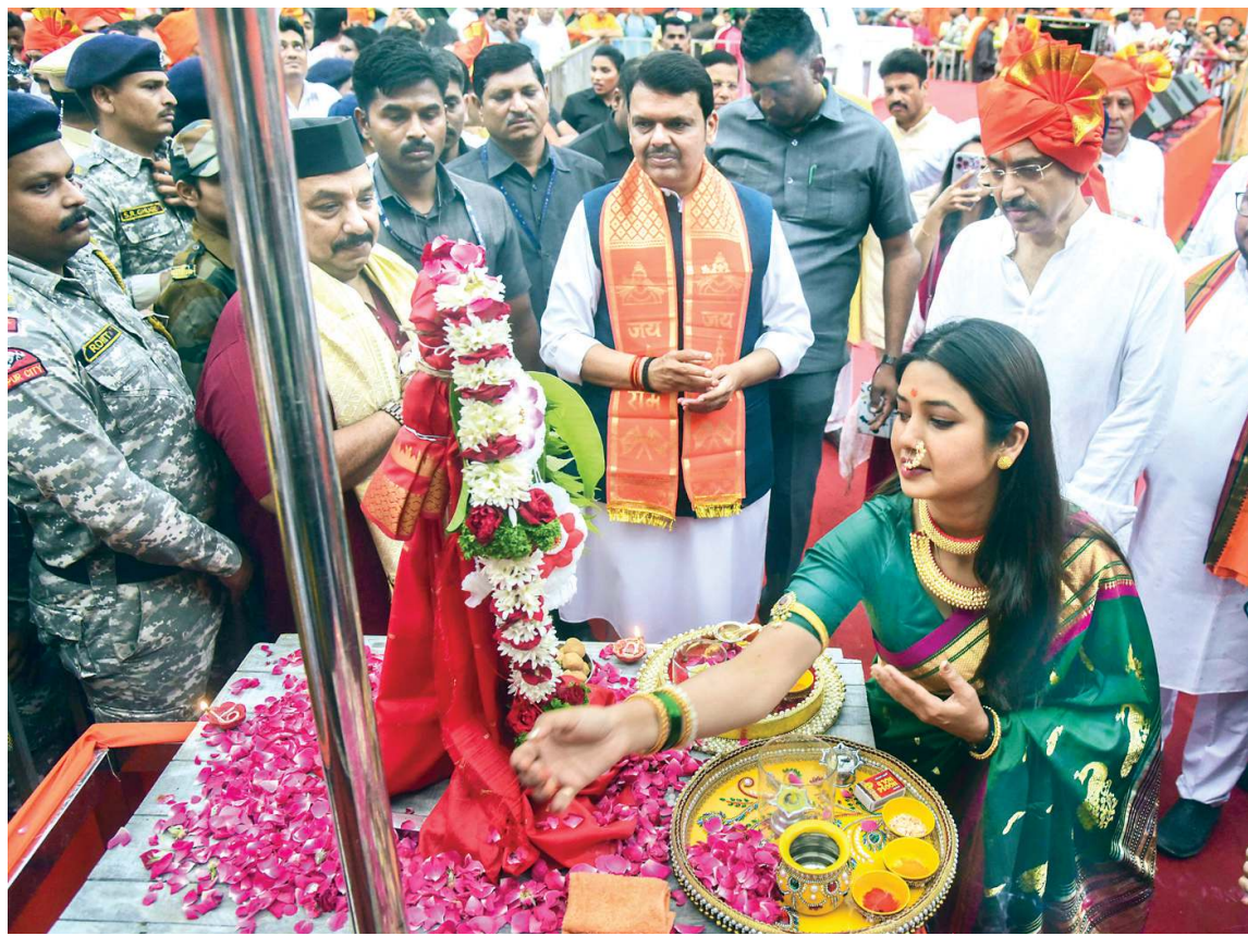
Maharashtra Deputy CM Devendra Fadnavis, actor Prajakta Mali and others offer prayers during the Gudi Padwa festival, in Nagpur, Tuesday.