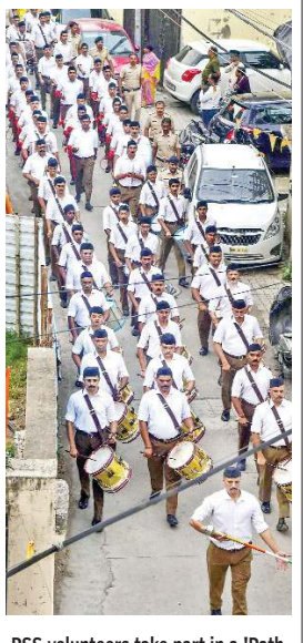
RSS volunteers take part in a 'Path Sancharian' on the occasion of Hindu New Year, in Nagpur, Tuesday.