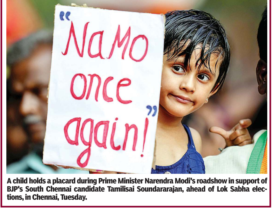
A child holds a placard during Prime Minister Narendra Modi's roadshow in support of BJP's South Chennai candidate Tamilisai Soundararajan, ahead of Lok Sabha elections, in Chennai, Tuesday.