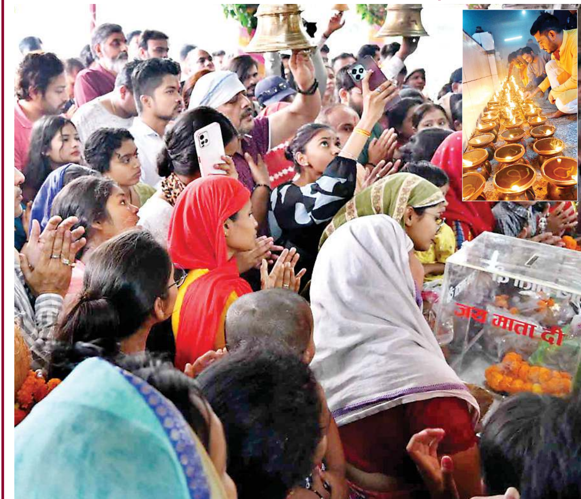
Devotees offered prayers to Goddess Durga on occasion of first day of Navratri in the temples and (R) 'Jyoti Kalash' of devotees being lighted up in the temple.