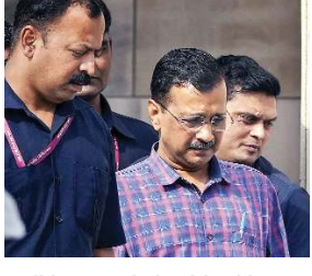
Delhi CM Arvind Kejriwal leaves from the Rouse Avenue Court in the excise policy-linked money laundering case, in New Delhi.

Failing to get any reprieve from the Delhi High Court, the Aam Aadmi Party Tuesday said Chief Minister Arvind Kejriwal will move the Supreme Court against his arrest by the Enforcement Directorate, and maintained the excise policy case was the "biggest political conspiracy of the country" to finish the party.