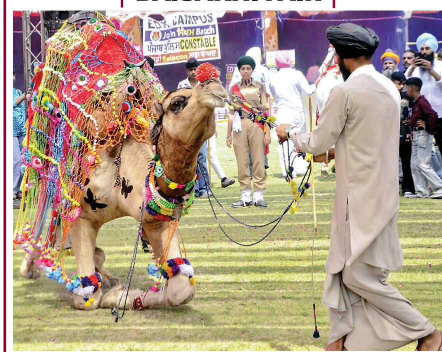
A camel performs during Baisakhi Fair, in Amritsar, Tuesday.