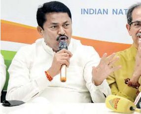
Shiv Sena (UBT) chief Uddhav Thackeray, Congress leaders Nana Patole, Prithviraj Chavan and Balasaheb Thorat, NCP chief Sharad Pawar and NCP leader Jayant Patil during a Maha Vikas Aghadi (MVA) press conference, in Mumbai, Tuesday.

Sena (UBT) gets 21 seats, Cong 17, NCP (SP) 10