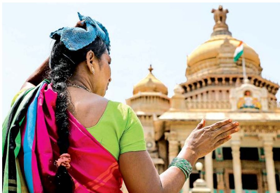
A woman uses a cloth to protect herself from the scorching sun on a hot summer day, in Bengaluru.

"The global average temperature for the past