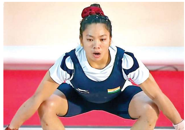
New Delhi, Apr 09 (PTI):

She heaved her lowest weight in years at the World Cup recently but Olympic silver-medallist Mirabai Chanu is actually quite chuffed about her performance as she managed it on the back of just one month's training after enduring a challenging injury breakdown.