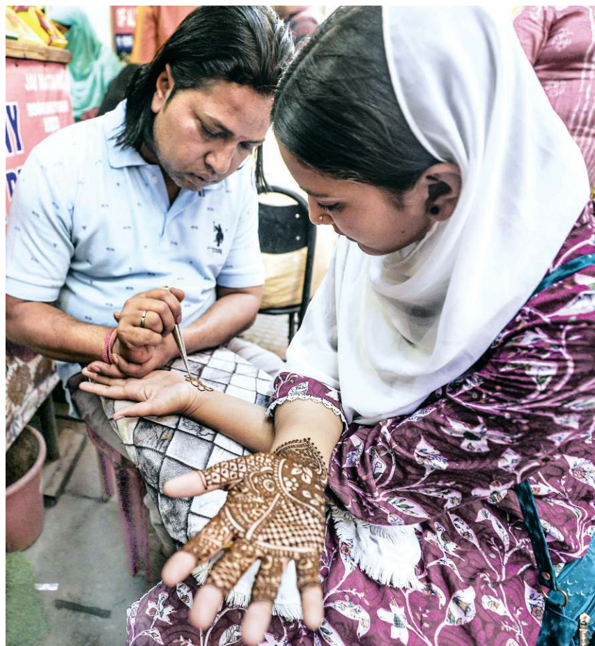
A Muslim woman gets her hands decorated with henna ahead of Eid al-Fitr, in Jammu, Tuesday.