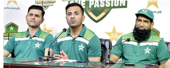
Lahore, Apr 09 (PTI):

Having reversed their decisions of retiring from international cricket, fast bowler Muhammad Amir and left-arm spinner Imad Wasim were recalled to the 17-member Pakistan squad for the five-match T20I series against New Zealand, starting April 18.