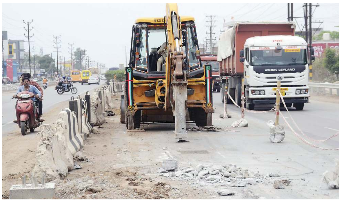
The authorities are constructing barrier to keep the traffic of the service road on one-side of the four-lane Ring Road, so as to ensure safe driving on highways.