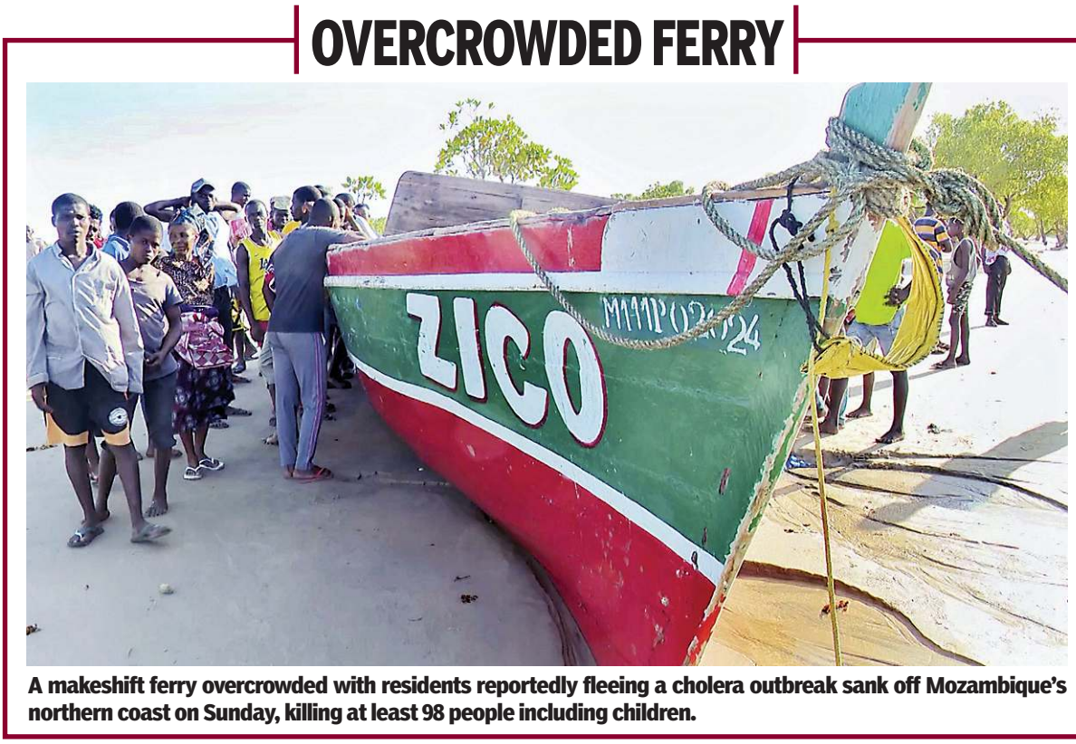
OVERCROWDED FERRY A makeshift ferry overcrowded with residents reportedly fleeing a cholera outbreak sank off Mozambique's northern coast on Sunday, killing at least 98 people including children.

ous markets, with women buying bangles, jewelry and clothes for themselves and their children. More than 52,000 police were being deployed at mosques as part of a security plan under which about 8,000 police were sent to sensitive places and markets in the provincial capital Lahore, according to a statement issued by Punjab police. Punjab is the country's most populous province and the home city of Prime Minister Shehbaz Sharif, who was elected in March by lawmakers in Pakistan's National Assembly despite protests and allegations that the election was rigged.