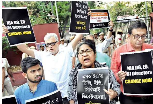
Trinamool Congress (TMC) leaders, who were detained by Delhi Police while staging a dharna outside the Election Commission's office, shout slogans during their protest at Mandir Marg police station, in New Delhi, Tuesday.

The TMC leaders on Monday met with the full bench of the Election Commission (EC) and urged the poll body to change the heads of the Enforcement Directorate (ED), Central Bureau of Investigation (CBI),