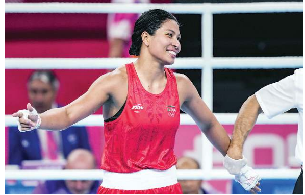
New Delhi, Apr 09 (PTI):