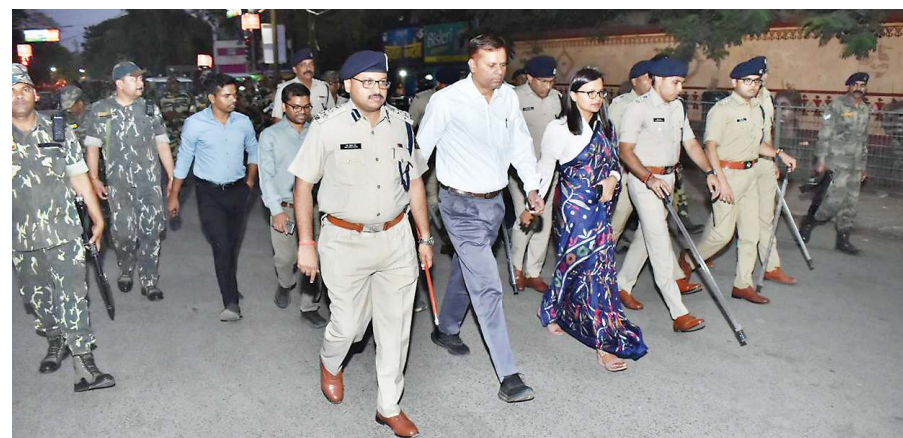
Bhilai, Apr 07:

Divisional Commissioner, IGP, Collector and SP march on streets in Durg