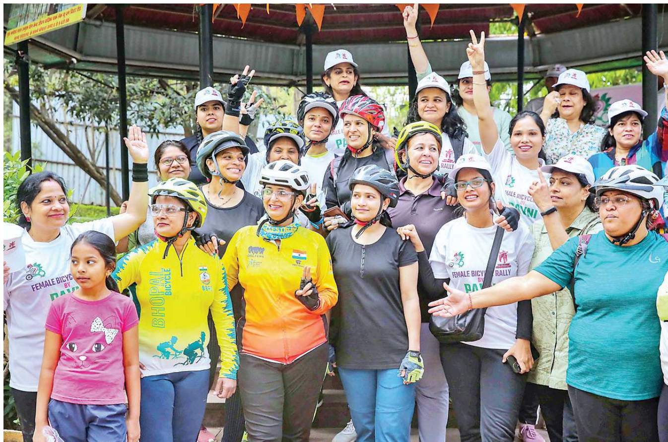
Women riders during a bicycle rally on the World Health Day, in Bhopal, Sunday, April 7.