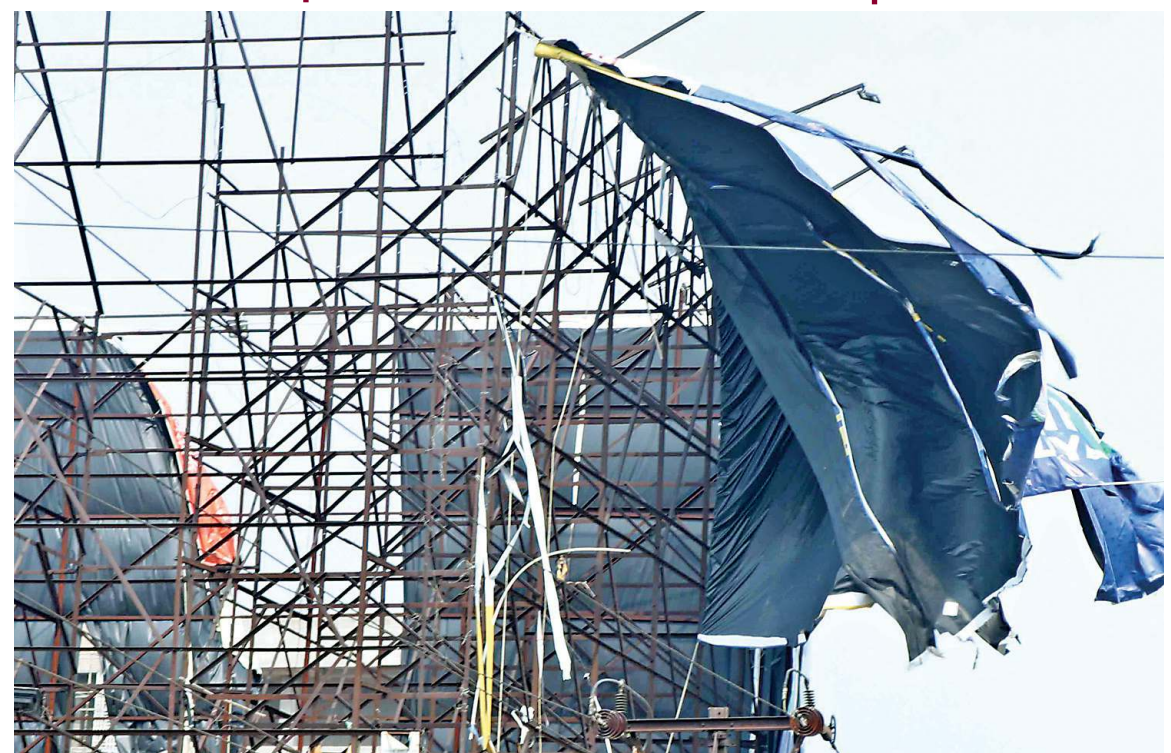
Due to strong winds in the morning hours, the flexes in the hoardings in some part were torn due to strong winds here on Sunday.