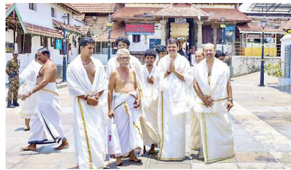
Maharashtra CM Devendra Fadnavis during a visit to Sree Padmanabhaswamy Temple, in Thiruvananthapuram, Kerala, Sunday.

Thiruvananthapuram, Apr 07 (PTI): Kerala has become a "hotbed for anti-national forces" due to the "misgovernance" and vote bank politics by the parties which were in power in the state over the years, Maharashtra Deputy Chief Minister Devendra Fadnavis said here on Sunday. Fadnavis, who was in the state capital as part of the BJP's Lok Sabha poll campaign, said that Kerala ought to have been at the forefront and leading the technological and new economic revolution of the country. But, the state was going backwards, despite its high literacy rate and "wonderful talent", due to the LDF and UDF's "similar agenda of corruption and oppression", he alleged. He further alleged that "due to misgovernance, it (Kerala) has become a