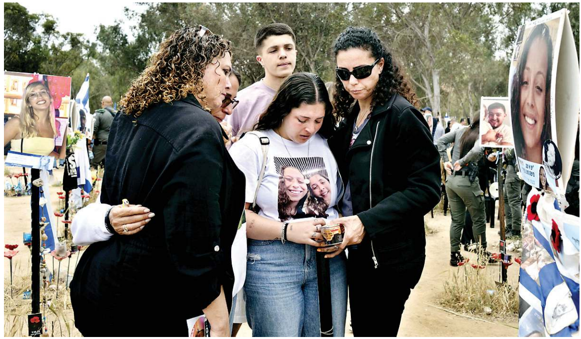
Relatives light a candle for a young woman killed in a cross-border attack by Hamas that killed or kidnapped hundreds of revelers at the Nova music festival, at the site in Re'im, southern Israel, Sunday, April 7, on the sixth month anniversary of the Oct. 7, 2023 attack.