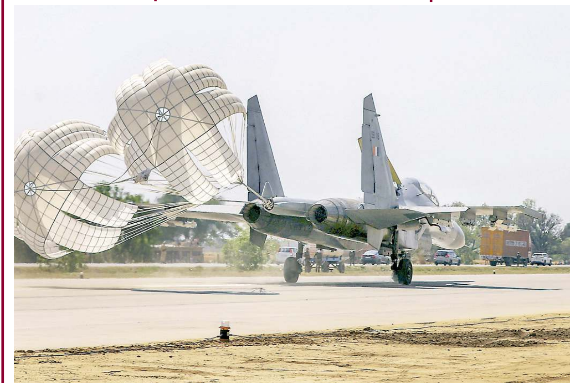
Indian Air force's fighter aircraft Sukhoi 30MKI lands on the Lucknow-Agra expressway, in Unnao, Sunday.