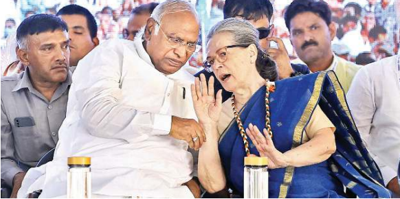
Congress President Mallikarjun Kharge with party leader Sonia Gandhi during a public meeting, ahead of Lok Sabha elections, in Jaipur.

Congress president Mallikarjun Kharge on Sunday said the biggest issue in the Lok Sabha elections is the unemployment "imposed by the BJP", claiming the youth are struggling to find jobs and the country is staring at a "demographic nightmare".