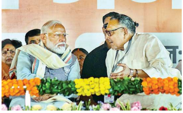
PM Modi with Union Minister Giriraj Singh during a public meeting ahead of LS elections, in Nawada, Sunday.

Prime Minister Narendra Modi on Sunday launched a blistering attack on the opposition Congress, charging that its poll manifesto bore the imprint of Muslim League and utterances of its leaders betrayed hostility towards national integrity and Sanatan Dharma.