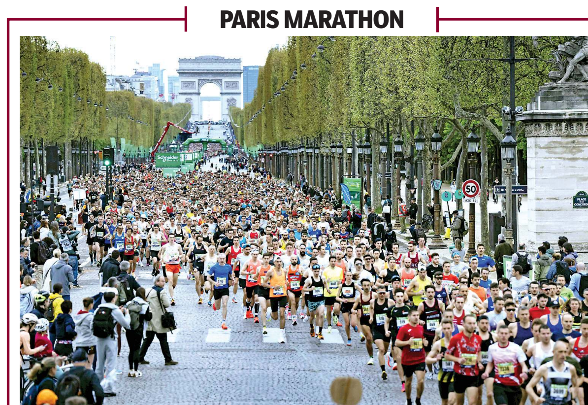
Competitors run at the start of the Paris marathon on the Champs-Élysées avenue, with the Arc de Triomphe in the background, in Paris, Sunday, April 7.

The move will reduce the stock of the debt acquired through selling Eurobonds and Sukuks (bond-like instruments used in Islamic finance) in international markets to below USD 7 billion. This has enhanced the coun-