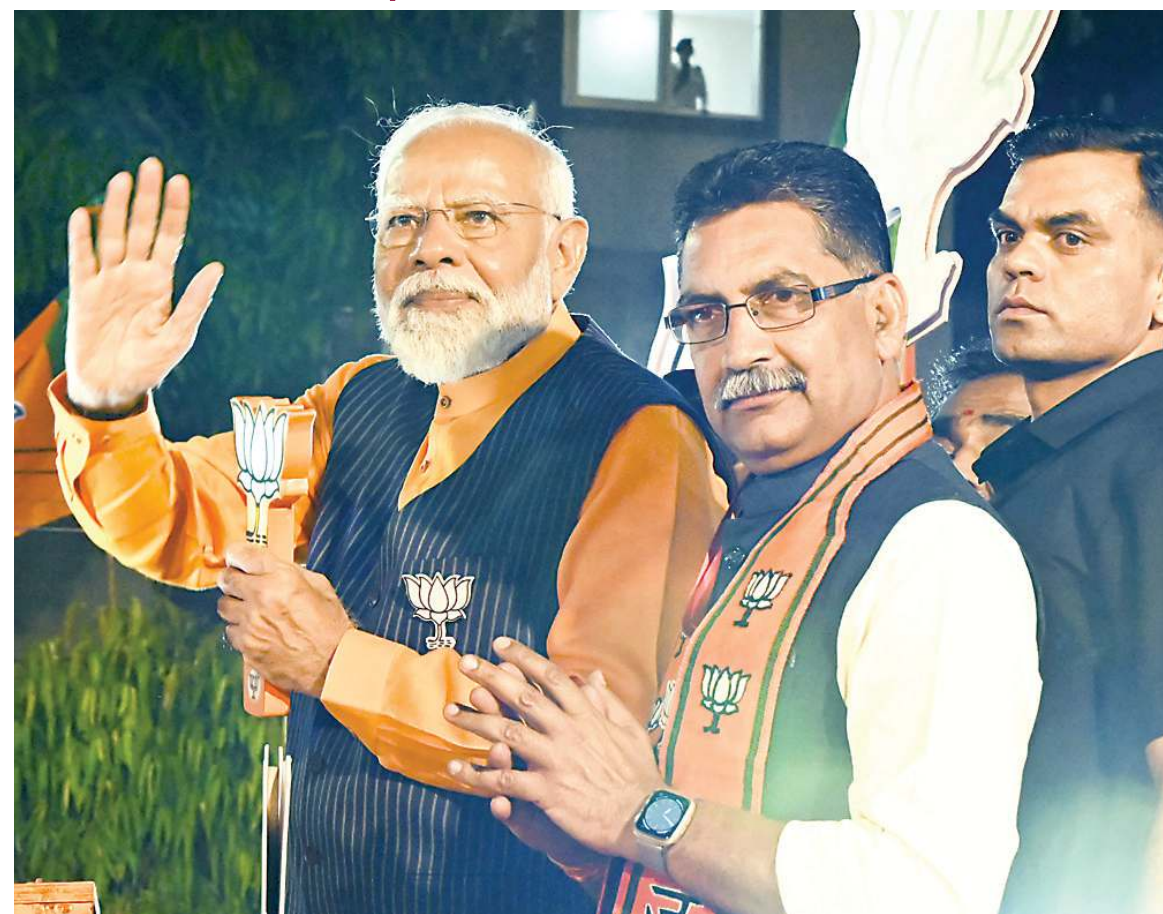
PM Modi with BJP candidate Ashish Dubey during a road show ahead of Lok Sabha elections, in Jabalpur, Sunday.