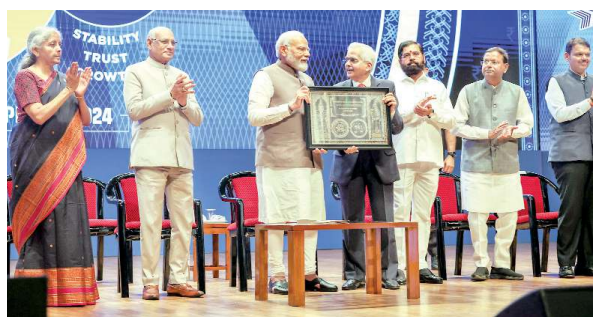
Prime Minister Narendra Modi with RBI Governor Shaktikanta Das during a ceremony marking 90 years of the Reserve Bank of India, in Mumbai, Monday, April 1, 2024.

The Reserve Bank has to accord "top-most priority" to growth and at the same time focus on trust and stability, Prime Minister Narendra Modi said on Monday. Addressing the inauguration of the event commemorating 90 years of the Reserve Bank of India (RBI) here, Modi said the next decade is as important for attaining the goal of developed India as it is for the RBI, which will complete 100 years of existence in 2035. Modi said as per the "mantra" of the central bank, "The RBI should make fast growth its top-most priority, along with focusing on trust and stability." Since 2016, keeping inflation under check has become the primary goal of the RBI. Often, there are voices who have pitched for additional at-