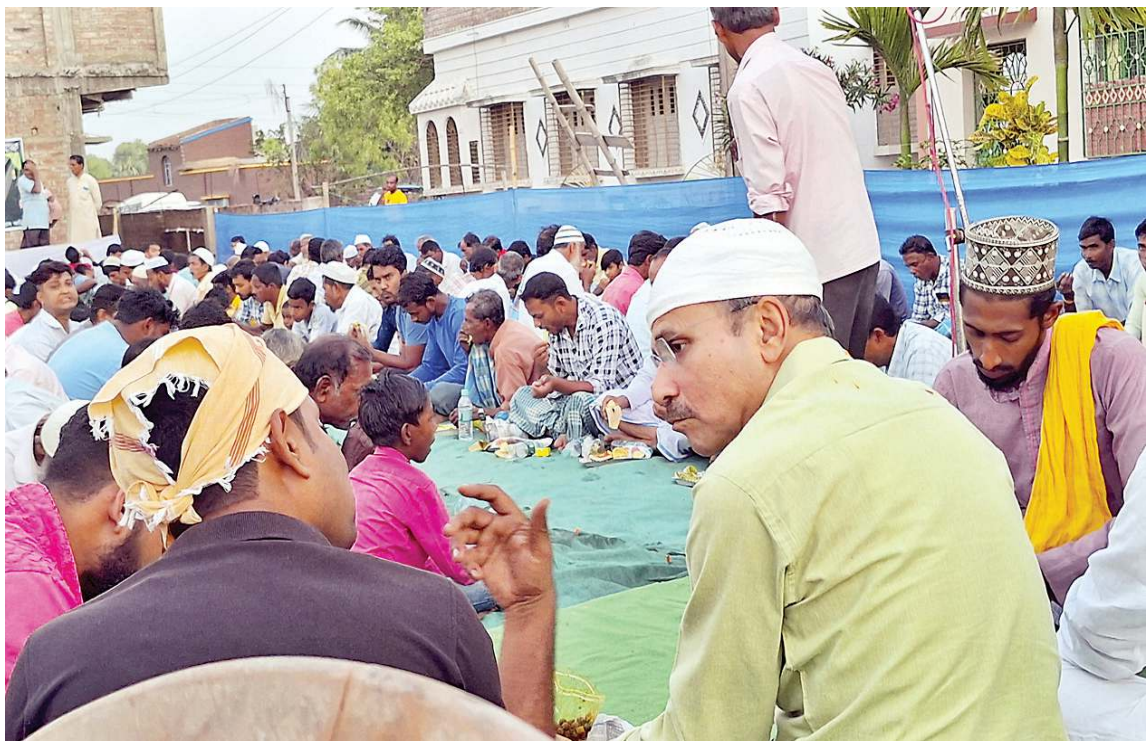
Congress leader Adhir Ranjan Chowdhury with Muslim devotees at 'Dawat-e-Iftar' during the holy month of Ramzan, at Rangamati Chandpara village in Murshidabad district, Monday.