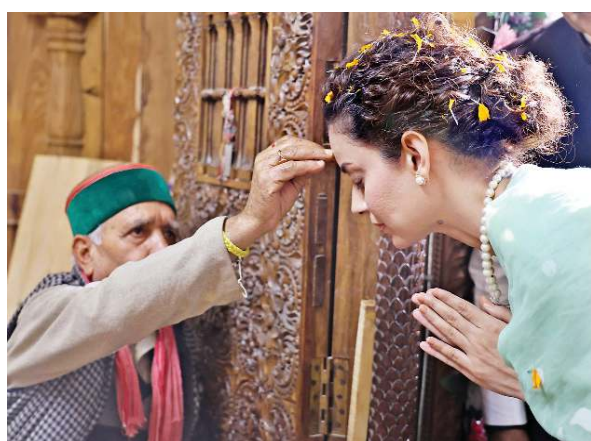
BJP candidate actor Kangana Ranaut during a visit to Bhimakali temple, in Mandi, Monday.

Actor Kangana Ranaut, who is the BJP candidate from Mandi Lok Sabha seat, on Monday said Congress leader Rahul Gandhi does not know the definition of democracy.