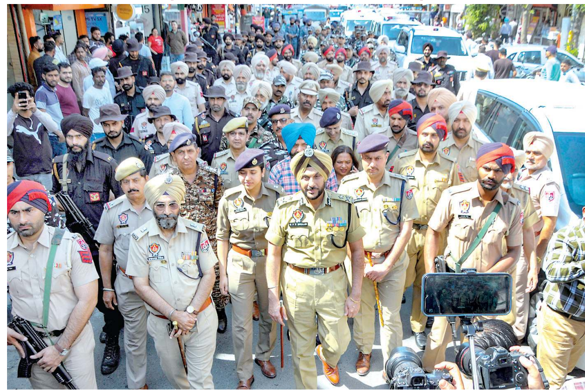
Police and paramilitary forces conduct a flag march ahead of the upcoming Lok Sabha elections, in Amritsar, Monday.