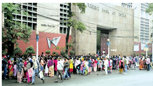
Kolkata: Rush of people outside Reserve Bank of India to exchange Rs. 2000 currency notes, on the day of the presentation of the Interim Budget 2024 by Union Finance Minister Nirmala Sitharaman in Parliament, in Kolkata, Thursday, Feb. 1, 2024.

The Reserve Bank of India (RBI) on Monday said nearly 97.69 per cent of the Rs 2000 denomination bank notes have returned to the banking system, and only Rs 8,202 crore worth of the withdrawn notes are still with the public. On May 19, 2023, the RBI announced the withdrawal of Rs 2,000 denomination bank notes from circulation. The total value of Rs 2000 banknotes in circulation, which was Rs 3.56 lakh crore at the close of business on May 19, 2023, when the withdrawal of Rs 2000 banknotes was announced, has declined to Rs 8,202 crore at the close of business on March 29, 2024, the Reserve Bank of India said in a statement. "Thus, 97.69 per cent of the Rs