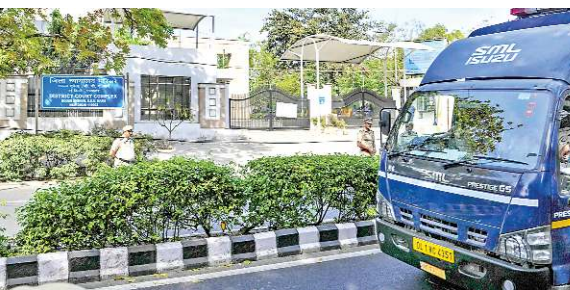
Arvind Kejriwal being taken to the Tihar Jail.

"He was brought to Tihar jail and will be lodged in Jail number 2. He was taken for a medical examination. He will be kept in a separate cell," a jail official said. AAP