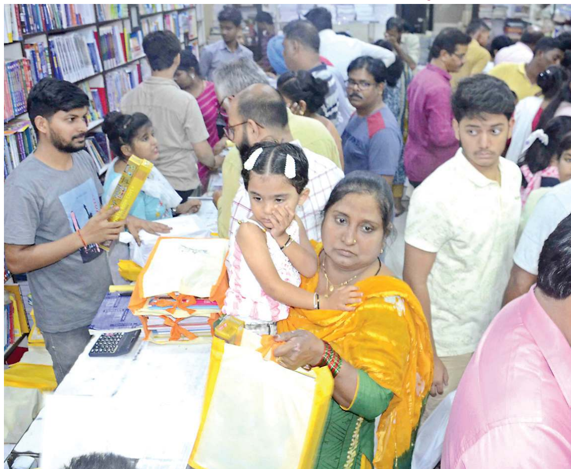
With the opening of Schools today, the rush of parents to book stalls has increased and each had to wait for long to get the books and uniforms for their wards.