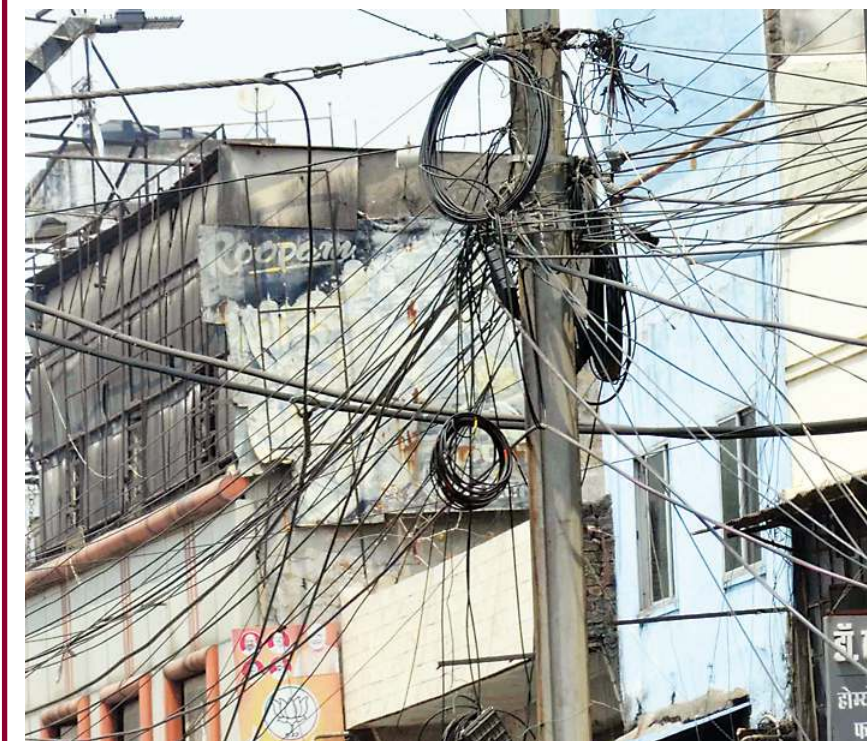
The wiring in majority of the city areas is still very complicated and poses risk specially during summer season and need to be sorted out immediately.