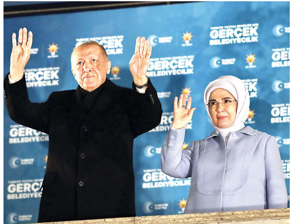
Turkish President and leader of the Justice and Development Party, or AKP, Recep Tayyip, left, and his wife Emine Erdogan gesture to supporters at his party headquarters in Ankara, Turkey, early Monday, April 1.