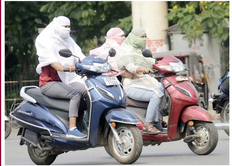
With start of April month, the girls have started taking all precautions in order to avoid any problems due to high temperature.