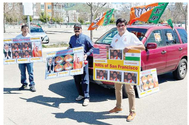
Members and supporters of the Overseas Friends of BJP take part in a car rally in support of Prime Minister Narendra Modi ahead of upcoming Lok Sabha elections in India, in USA.

Overseas Friends of BJP in US organises car rallies in 20 American cities