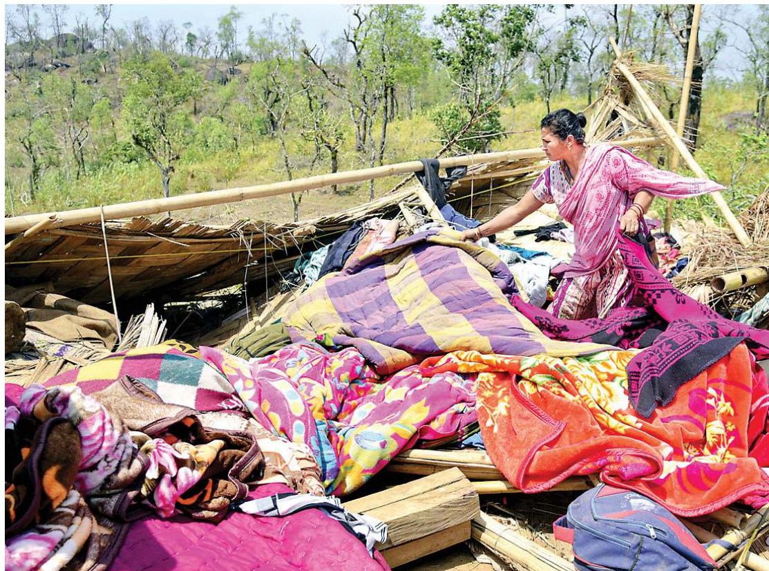
A woman attempts to salvage her belongings after her house was destroyed due to a hailstorm, at Boko in Kamrup district, Assam, Monday.