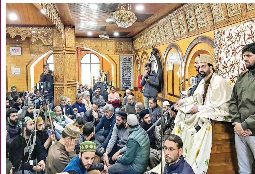
Chairman of Moderate faction of Hurriyat Conference and Chief Cleric of Jammu and Kashmir Mirwaiz Umar Farooq delivers a sermon on the occasion of martyrdom anniversary of the 4th Caliph of Islam, Hazrat Imam Ali, for the first time since 2019, at the famous Shrine of Dastgeer Sahib Saria Bala, at Lal Chowk in Srinagar, Monday.