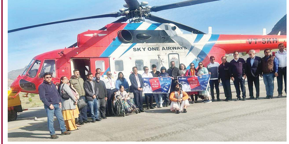
Pilgrims pose for photos after the launch of helicopter services to the peaks of Adi Kailash and Om Parvat, in Pithoragarh, Monday.