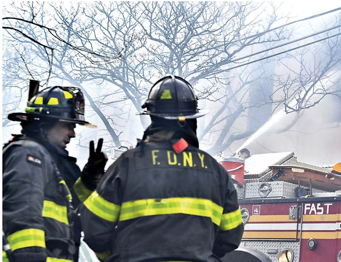
Firefighters battle a four-alarm fire at St. Stanislaus church, Easter, in the Brooklyn borough of New York. The fire, which broke out on Siegel Street between Bushwick Avenue and White Street, resulted in the collapse of one of the floors of the building.