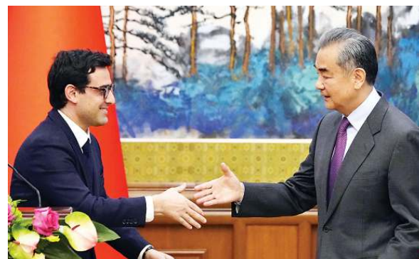
Chinese Foreign Minister Wang Yi, right, shakes hands with French Foreign Minister Stéphane Séjourné, left, after a joint press conference at the Diaoyutai State Guesthouse in Beijing, China, Monday, April 1.

European officials have expressed concern that a flood of low-priced Chinese-made electric vehicles could disrupt production and displace jobs in Europe. The EU is investigating whether Chinese government subsidies for EVs give an unfair advantage to Chinese