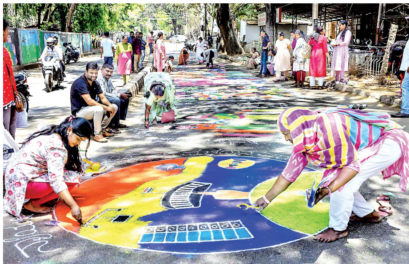
Volunteers create a 'rangoli' during a competition organised to create voter awareness ahead of upcoming Lok Sabha elections, in Chikkamagaluru, Monday, Apr