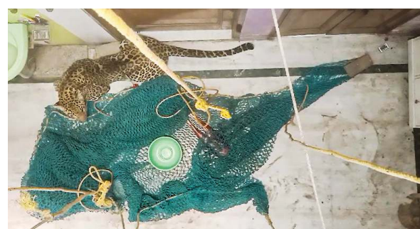
Forest Department personnel capture a leopard which entered a house, in New Delhi, Monday.