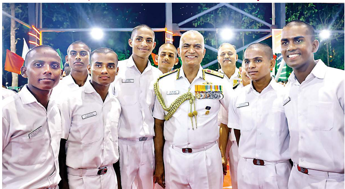
Chief of the Naval Staff Admiral R. Hari Kumar during the Passing Out Parade of third batch of Agniveers, at INS Chilka, in Odisha, Saturday.