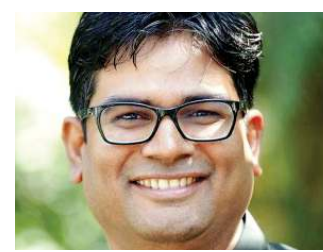
Minister OP Choudhary (center) is seen reviewing the naming process of intersections, roads, water bodies, and parks in Nava Raipur. He is surrounded by officials and staff members.

Chhattisgarh's Minister of Housing and Environment Department, OP Choudhary, reviewed the department's initiatives regarding the naming of intersections, roads, water bodies, parks, etc., at Atal Nagar in Nava Raipur. He strongly criticised the