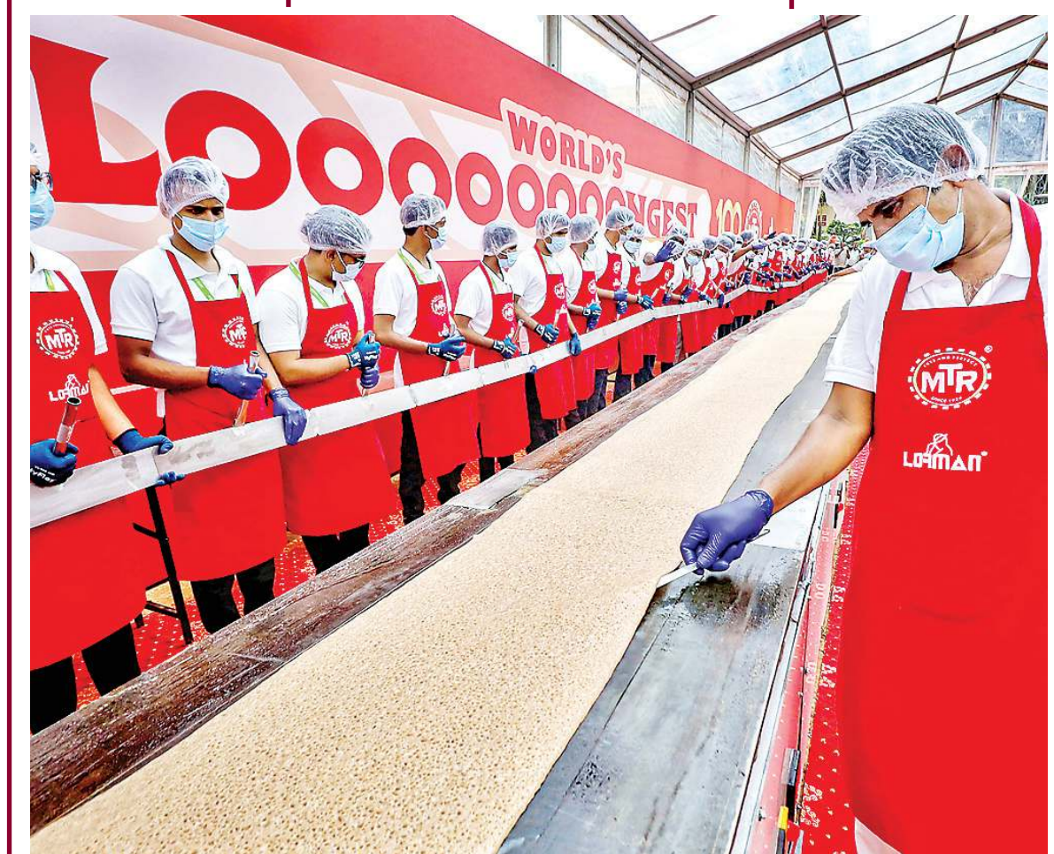
Chefs engaged in making a 123-foot long 'dosa' to create a Guinness World Record on the occasion of MTR's centenary year, at Bommasandra, in Bengaluru, Saturday.