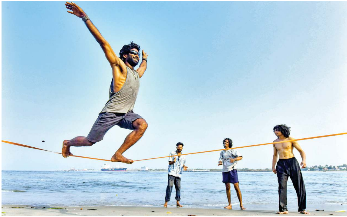
A man practices slacklining at Fort Kochi beach, in Kochi, Saturday.