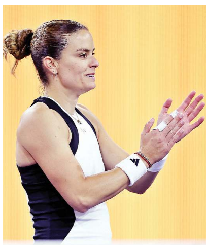
Maria Sakkari of Greece celebrates her win over Coco Gauff of the United States during the Women's Semifinals of the BNP Paribas Open at Indian Wells Tennis Garden on March 15 in Indian Wells, California.

Sakkari broke Gauff twice in taking a 5-2 lead