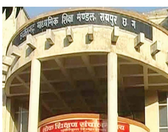
The Chhattisgarh Board of Secondary Education building in Raipur. The board is preparing for the release of 10th and 12th class exam results in the last week of April.

According to officials, this time preparations are also being made to increase the number of evaluator teachers, so that there is no problem in releasing the results. It is noteworthy that 10th and 12th board exams are still