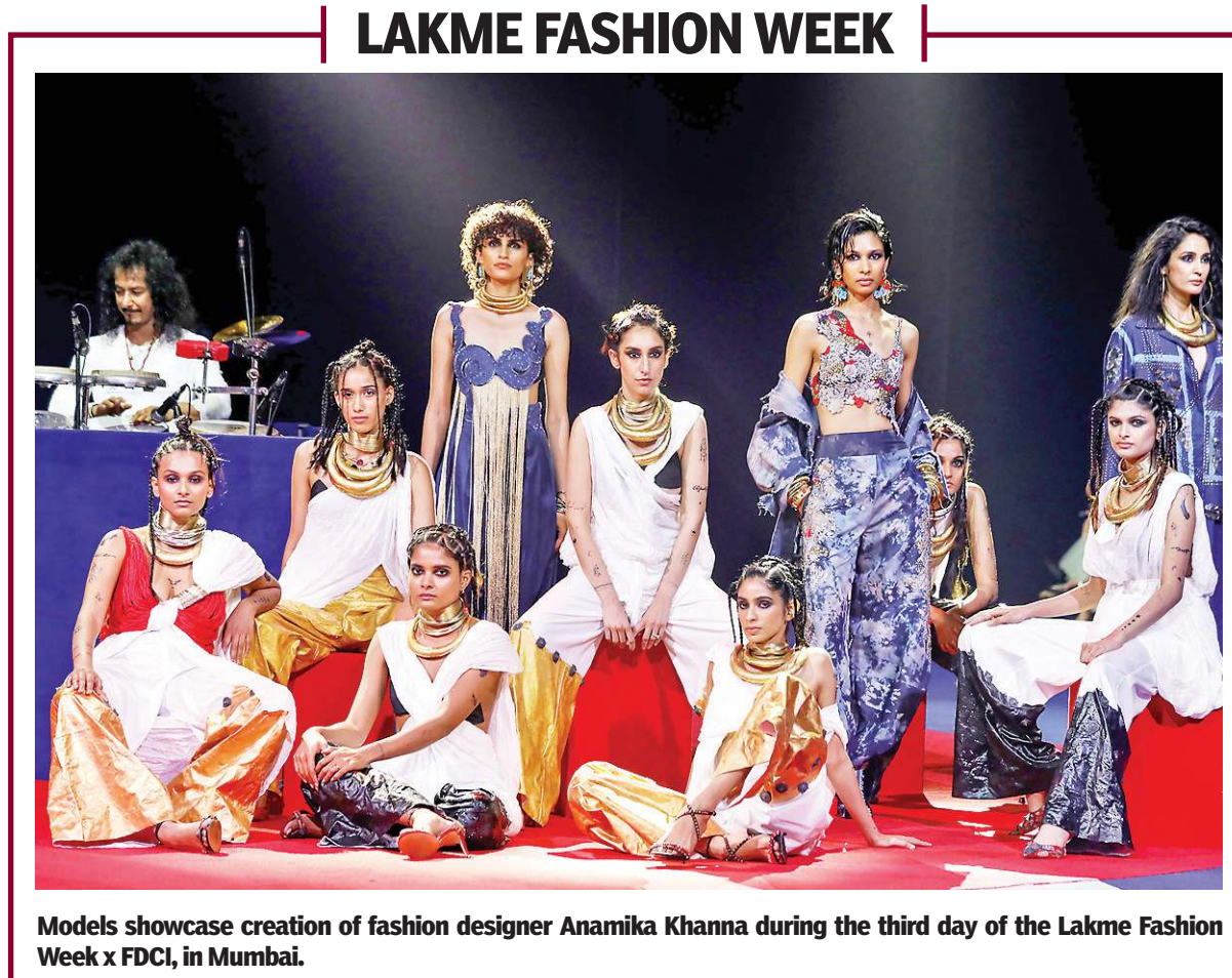
Models showcase creation of fashion designer Anamika Khanna during the third day of the Lakme Fashion Week x FDCI, in Mumbai.

"While perceptions may vary, DGCA is primarily concerned in ensuring safe operations and practices that are best suited to the unique operating environment prevailing in India," the communica-