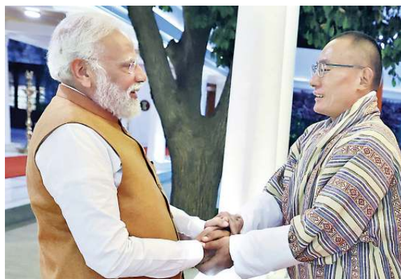
PM Modi with PM of Bhutan Dasho Tshering Tobgay during a meeting, in New Delhi.