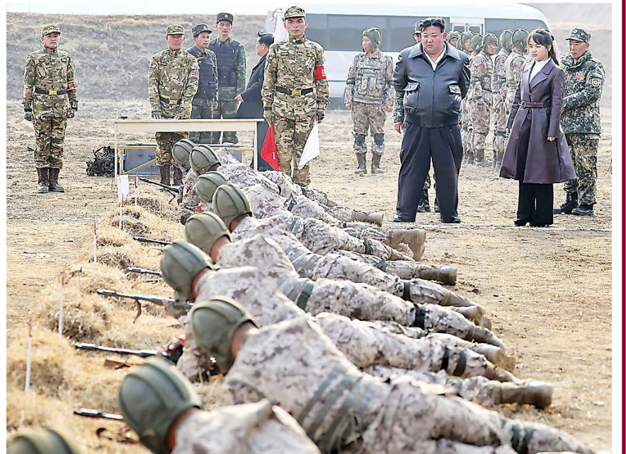
North Korean leader Kim Jong Un, standing in front center, and his daughter inspect a training of the Korean People's Army airborne units in North Korea.