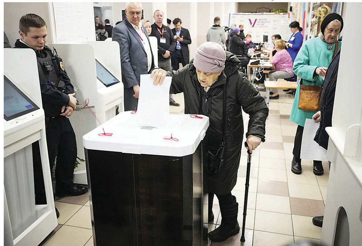
An elderly woman casts a ballot during a presidential election in Moscow, Russia, Saturday, March 16.