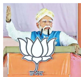
PM Modi addresses during a public meeting ahead of LS elections, in Kalaburagi, Karnataka, Saturday.

Addressing a mega public rally here, Modi said people of Karnataka are disenchanted with the Congress government in Karnataka within a short span of time. "This shows that people are aware of Congress' truth. Congress is not ready to improve despite getting several chances."