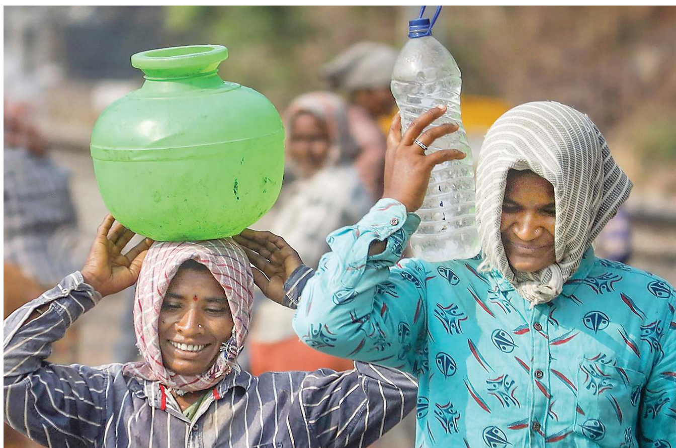
Migrant workers carry water during cleaning work of railway tracks near Jnanabharati station amid the ongoing water crisis in Karnataka, at Kengeri in Bengaluru, Saturday, March 16.