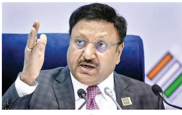
CEC Rajiv Kumar

Results on June 4 New Delhi, Mar 16 (PTD):