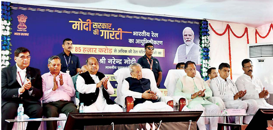
Governor Biswabhusan Harichandan, CM Vishnu Deo Sai and other guests at the programme organised at Raipur railway station, Tuesday.

Prime Minister Narendra Modi on Tuesday inaugurated and laid the foundation for 43 railway projects of Rs 249 crore in Chhattisgarh, including the Vande Bharat train maintenance depot in Bilaspur and MEMU car shed expansion in Bhilai.