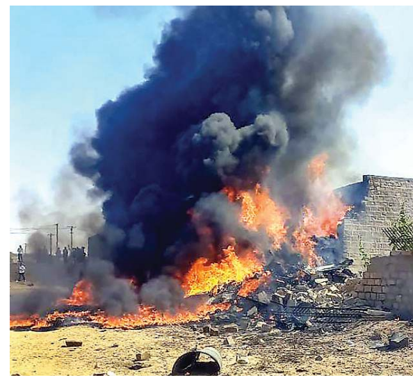
A Tejas aircraft of the Indian Air Force (IAF) in flames after it crashed during an operational training sortie, near Jaisalmer, Tuesday.

A Tejas light combat aircraft (LCA) of the Indian Air Force crashed near a residential colony in Jaisalmer on Tuesday during an operational training sortie, the first such incident involving the indigenously-built jet since its induction around eight years back. There were no casualties.