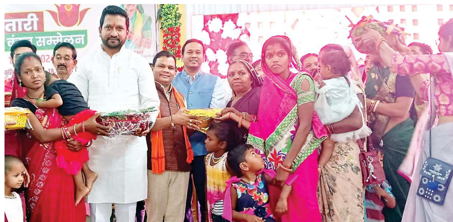
Khairagarh, Mar 12: