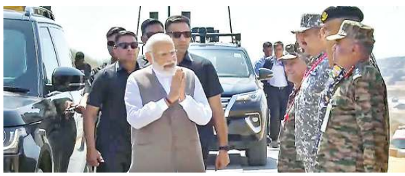
Prime Minister Narendra Modi arrives to witness the Exercise Bharat Shakti, in Pokhran, Rajasthan, Tuesday.

The integrated tri-service firepower and manoeuvre exercise was held for about 50 minutes at the Pokhran field firing range where