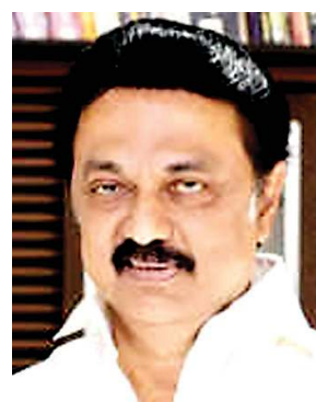
M K Stalin

Explaining the background to the opposition to CAA and hinting at related matters pending in