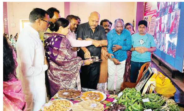
Simga, Mar 12:

Mahatari Vandan Sammelan was organized under "Mukhyamantri Mahatari Vandan Yojana" at Community Building in Simga Nagar Development Block, which was attended by a large number of women and public representatives. The above program started with lamp lighting and Saraswati Vandana and the enthusiasm of all the women was boosted by sharing the blessing and the first instalment of Mahatari Vandan by the Chief Minister and Prime