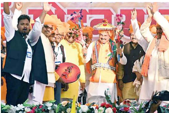
Bhilai, Mar 12:

Madhya Pradesh Chief Minister Mohan Yadav attended the convention of Yadav Samaj in Durg on Tuesday. He urged the members of Yadav Samaj to remain united and follow the teachings of Lord Shri Krishna. CM Mohan Yadav was the chief guest of Yadav Samaj Sammelan organised at Manas Bhawan in Durg. Addressing the convention, Chief Minister Mohan Yadav said that our entire culture is recognized in the world as a follower of Lord Krishna and the name of Ram and Krishna. "If we look at