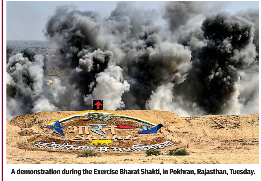
A demonstration during the Exercise Bharat Shakti, in Pokhran, Rajasthan, Tuesday.