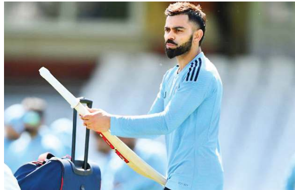
Kohli's aggression gives his team required intensity: Kumble

With youngsters like Rinku Singh, Suryakumar Yadav, Tilak Varma and Shivam Dubey in the mix, Kohli's future in the shortest format of the game looks bleak. Under Surya's captaincy in the T20I series against Australia at home in November, India won 4-1. In South Africa, the three-match series was tied 1-1 after the opener was washed out.