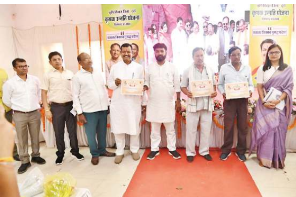
Bhilai, Mar 12:

Chief Minister Vishnu Deo Sai on Tuesday transferred an amount of Rs 13320 crore to the accounts of more than 24.72 lakh farmers of Chhattisgarh through DBT under Krishak Unnati Yojana. As soon as the Chief Minister pressed the remote button, an amount of Rs 537 crore 60 lakh was transferred to the accounts of 105778 farmers of Durg district. In Durg district, paddy was procured through 102 procurement centers of 87 committees. The state government purchased paddy from farmers at the rate of Rs 3100 per quintal. The difference amount is being