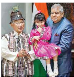
Rajya Sabha Chairman Jagdeep Dhanekar with BJP leader Dorjee Tshering Lepcha and his daughter after administering oath to him as Rajya Sabha MP, at Parliament House in New Delhi, Tuesday.