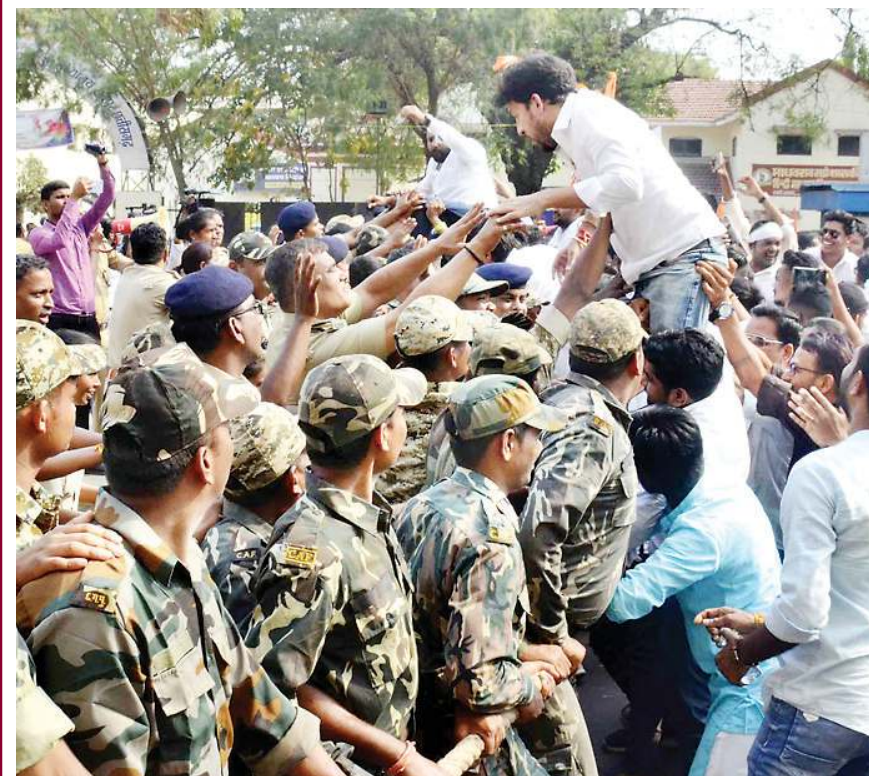
Congmen staged massive demonstration outside the IT office to protest against seizure of account of Congmen accused in scams in the state.