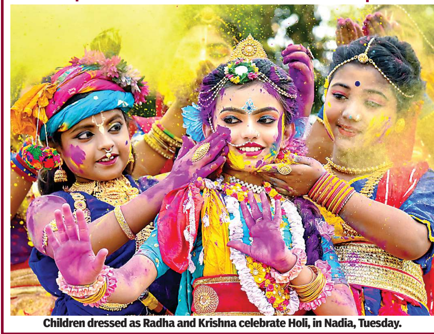
Children dressed as Radha and Krishna celebrate Holi, in Nadia, Tuesday.