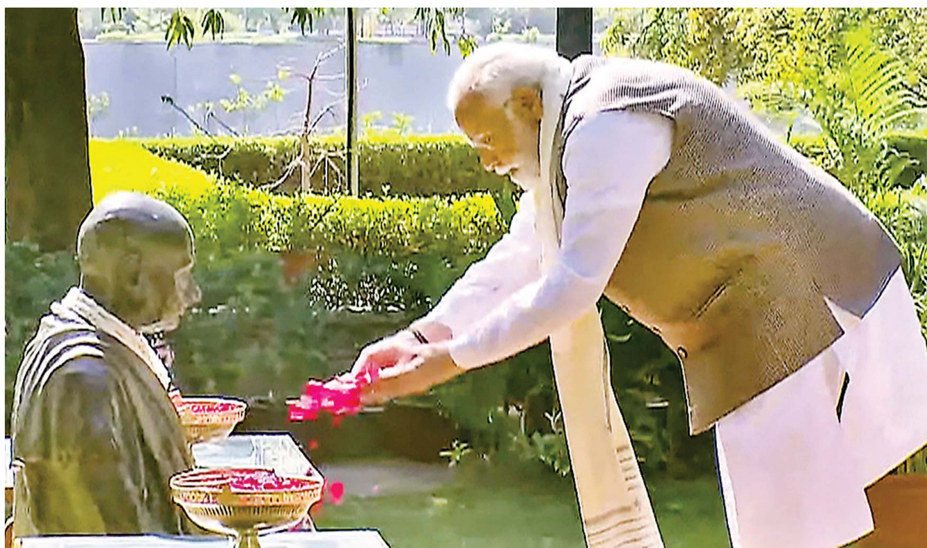
Prime Minister Narendra Modi pays homage to Mahatma Gandhi ahead of the launch of master plan for Sabarmati Ashram project, in Gujarat's Ahmedabad, Tuesday, March 12.