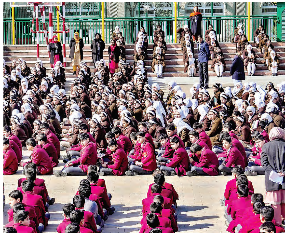
Children attend morning assembly at a school that reopened after winter vacations, in Srinagar, Monday.