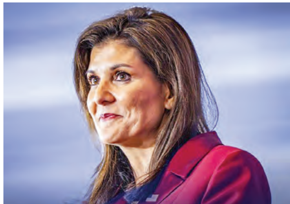
Republican presidential candidate and former United Nations ambassador Nikki Haley.

The three other previous Indian American presidential aspirants Bobby Jindal in 2016, Kamala Harris in 2020 and Vivek Ramaswamy in 2024 had failed to win even one primary.