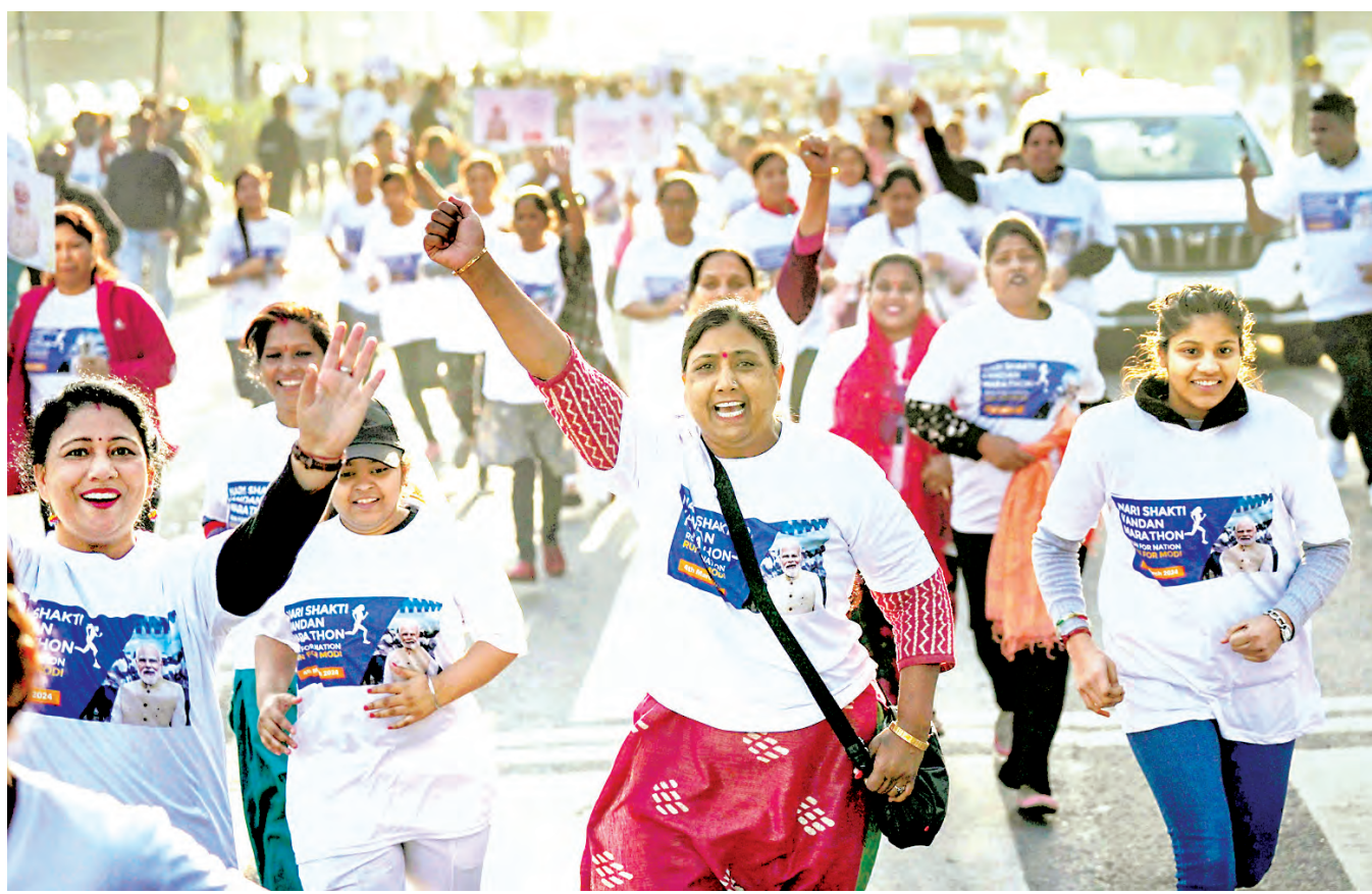
Participants during the Nari Shakti Vandan marathon, in east Delhi, Monday, March 4.