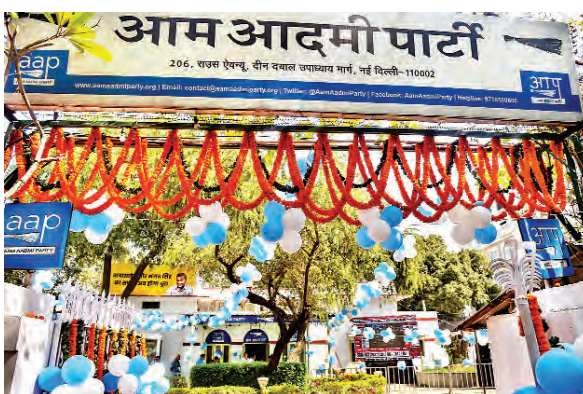
Aam Aadmi Party (AAP) office, in New Delhi.

Taking note of the fact that Lok Sabha elections are around the corner, a bench of Chief Justice D Y Chandrachud and Justices J B Pardiwala and Manoj Misra asked AAP to approach Land And Development Office under the Union Housing and Urban Affairs Ministry for allotment of land for its of-