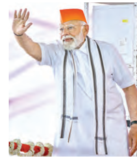
PM Modi waves at the crowd during a public meeting, in Adilabad, Telangana, Monday.

In a major counter-offensive to the opposition's 'no family' jibe, Prime Minister Narendra Modi on Monday asserted that 140 crore Indians are "my family" and attacked the "dynasty parties", saying that they may have different faces, but "jhoot and loot" was their common character.