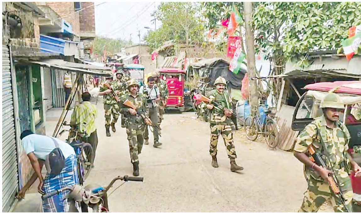
Security personnel conduct a route march, at Sandeshkhali in North 24 Parganas, Monday.