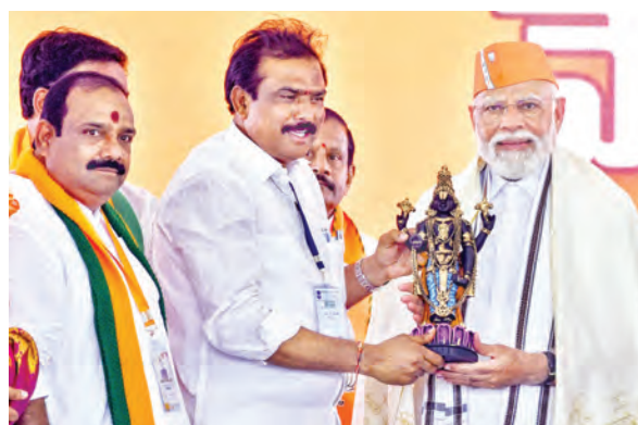
PM Modi being presented a memento during a public meeting, in Adilabad, Telangana, Monday.

Adilabad (Telangana), Mar 04 (PTI): Prime Minister Narendra Modi on Monday inaugurated multiple power, rail and road projects and laid the foundation stone for others, totalling more than Rs 56,000 crore, in Telangana, where Chief Minister N Chandrababu Naidu of Congress received him and shared the dais with him. In his brief address, the prime minister highlighted India's economic growth. He said that more than 25 crore people have risen out of poverty, and attributed it to his govern-