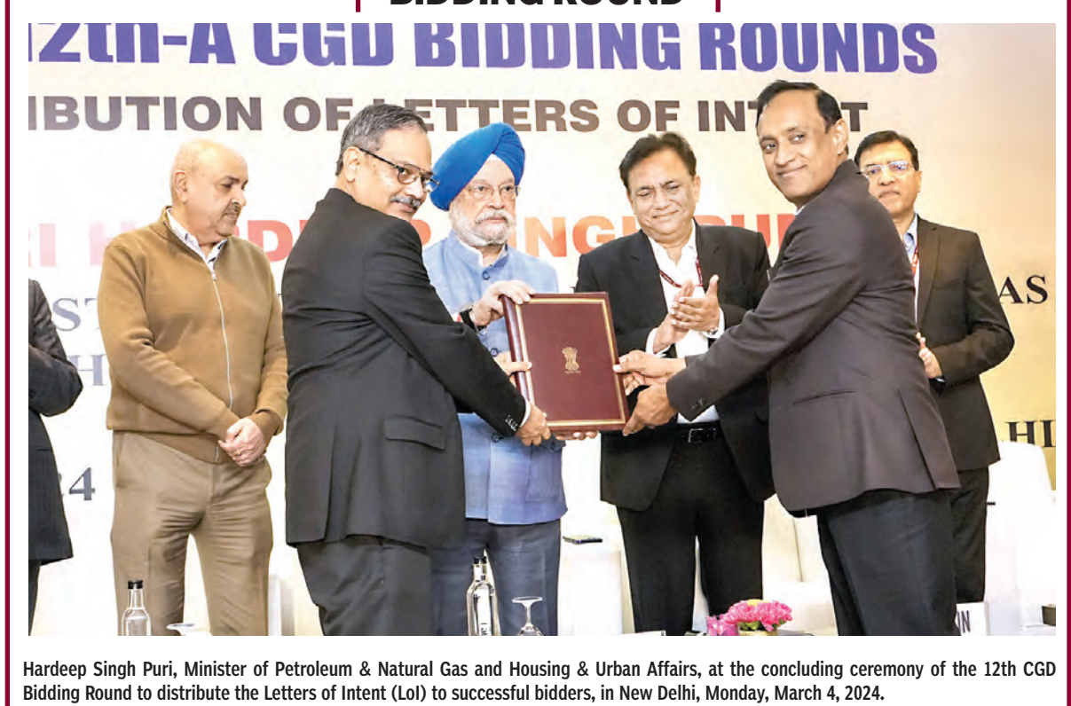
Hardeep Singh Puri, Minister of Petroleum & Natural Gas and Housing & Urban Affairs, at the concluding ceremony of the 12th CGD Bidding Round to distribute the Letters of Intent (LoI) to successful bidders, in New Delhi, Monday, March 4, 2024.