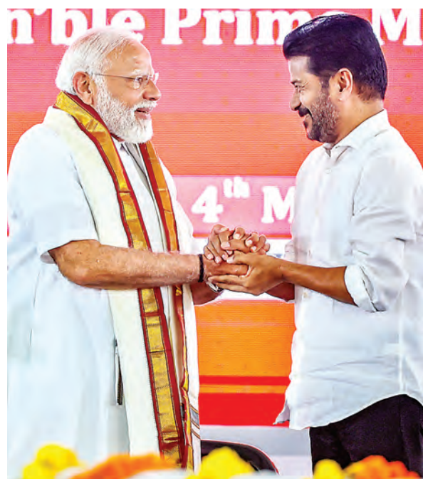
PM Modi with T'gana CM A Revanth Reddy during the launch of development initiatives, in Adilabad, Telangana, Monday.

Reddy said Telangana with capital Hyderabad, the fifth largest city in the country, would like to contribute to PM Modi's ambitious goal of making India a USD 5 trillion economy.