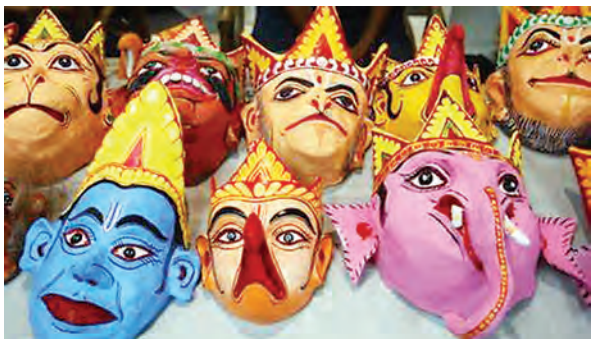
Guwahati, Mar 04 (PTI)

Mask making and manuscript painting of Majuli, an island-district of Assam, have received Geographical Indication (GI) tags, an official statement said on Monday.