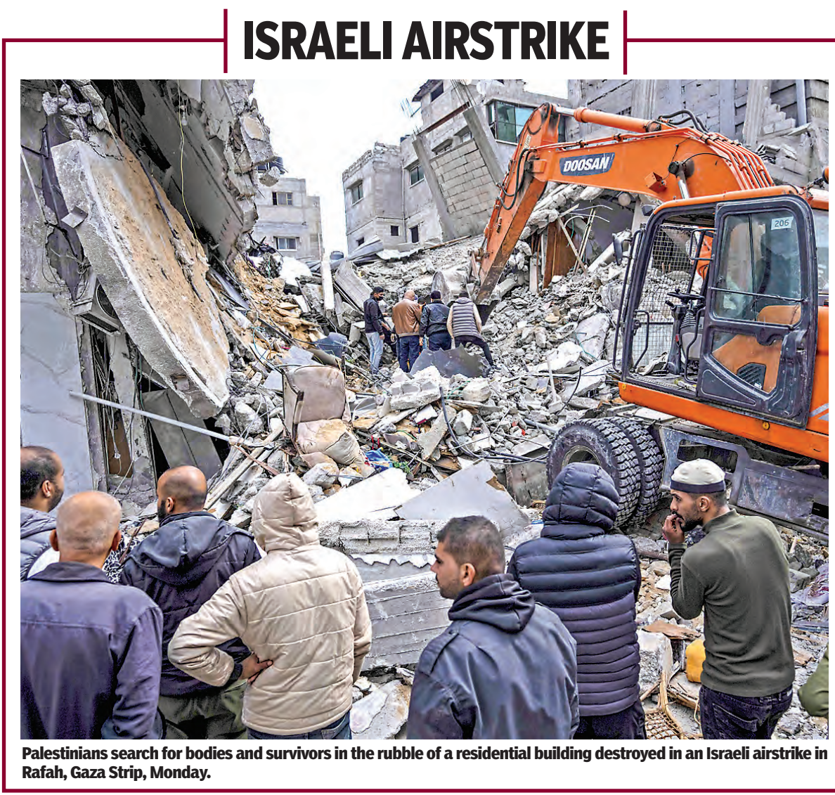
Palestinians search for bodies and survivors in the rubble of a residential building destroyed in an Israeli airstrike in Rafah, Gaza Strip, Monday.

The former South Carolina governor's victory came after she was crushed by Trump in caucuses in Missouri and Idaho and at a Republican convention in Michigan on Saturday.