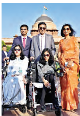
CJI D.Y. Chandrachud with family at the President House, in New Delhi, Monday.