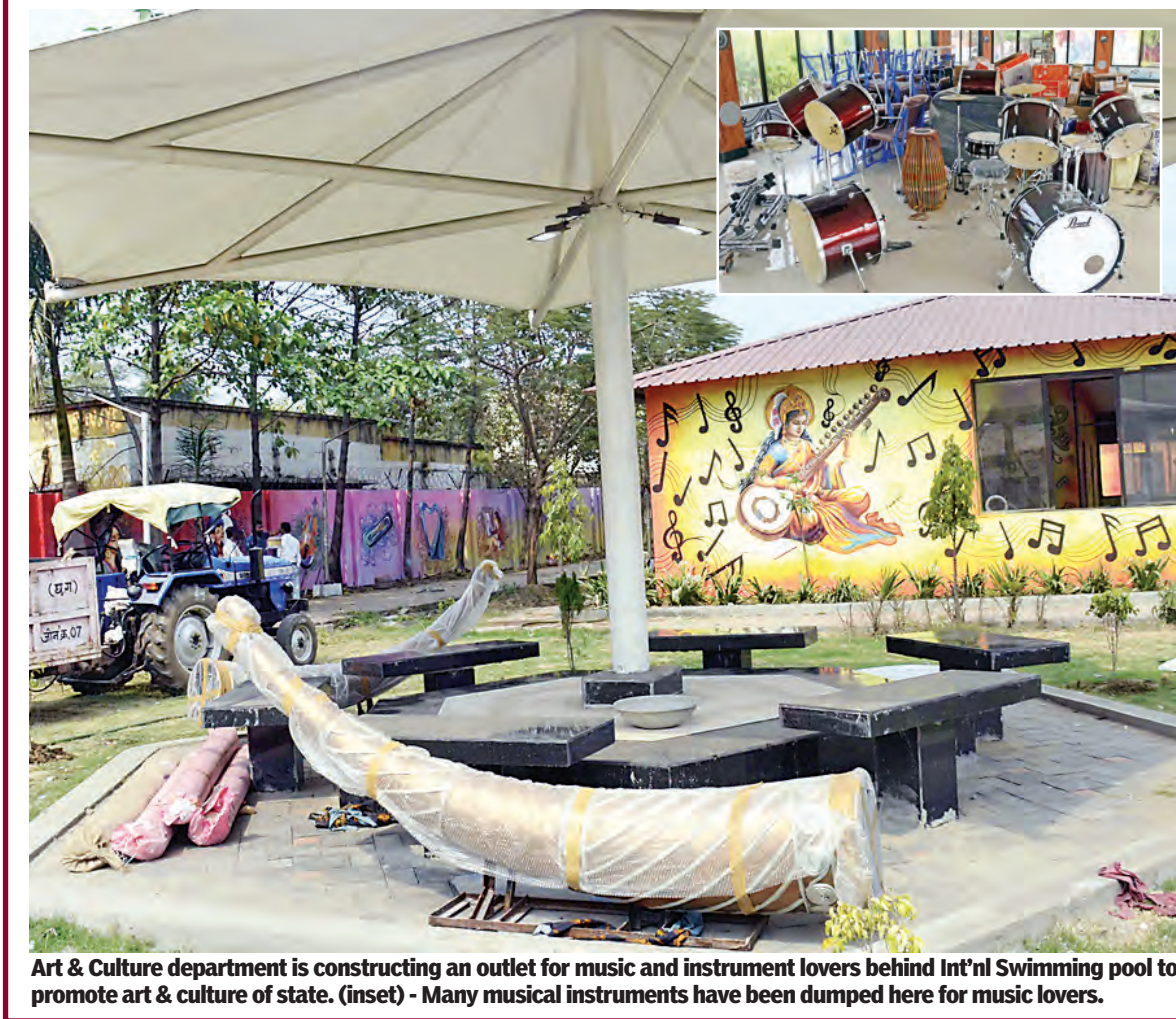
Art & Culture department is constructing an outlet for music and instrument lovers behind Int'l Swimming pool to promote art & culture of state. (inset) - Many musical instruments have been dumped here for music lovers.