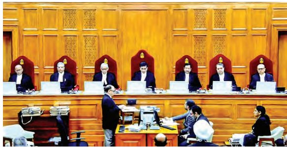
The seven-judge constitution bench headed by CJI D.Y. Chandrachud during pronouncement of verdict on bribes and corruption by legislators, Monday.

Observing that corruption and bribery of members of the legislature erode the foundation of Indian parliamentary democracy, a seven-judge constitution bench headed by Chief Justice D Y Chandrachud overruled the apex court's five-judge bench's 1998 verdict in the JMM bribery case - involving five party leaders accepting bribes to vote against the no-confidence motion threatening the P V Narasimha Rao government in 1993. "Bribery is not protected by parliamentary privileges," the bench, also comprising Justices A