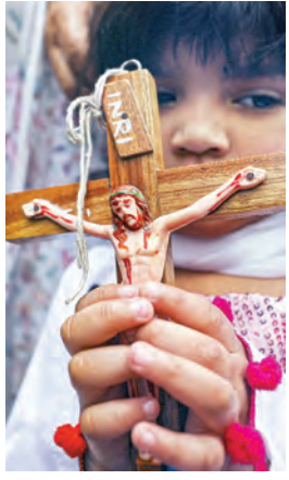
A Christian devotee during commemoration of the Good Friday, in Jammu.