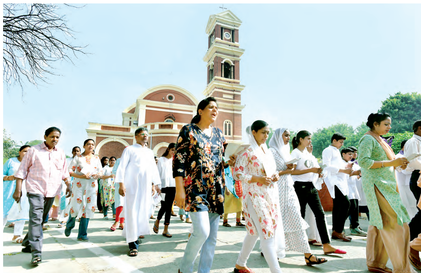
Christian devotees take part in a religious procession on the occasion of 'Good Friday' at St. Joseph's Cathedral Church, in Prayagraj, Friday, March 29.