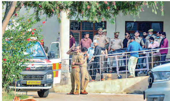
Mortal remains of the jailed gangster-turned-politician Mukhtar Ansari being taken to an ambulance before leaving for his native place in Ghazipur, from a hospital in Banda, Friday.