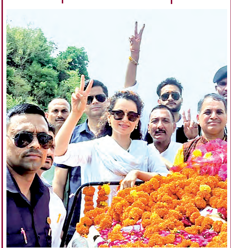
BJP candidate actor Kangana Ranaut during a roadshow ahead of Lok Sabha elections, in Mandi.