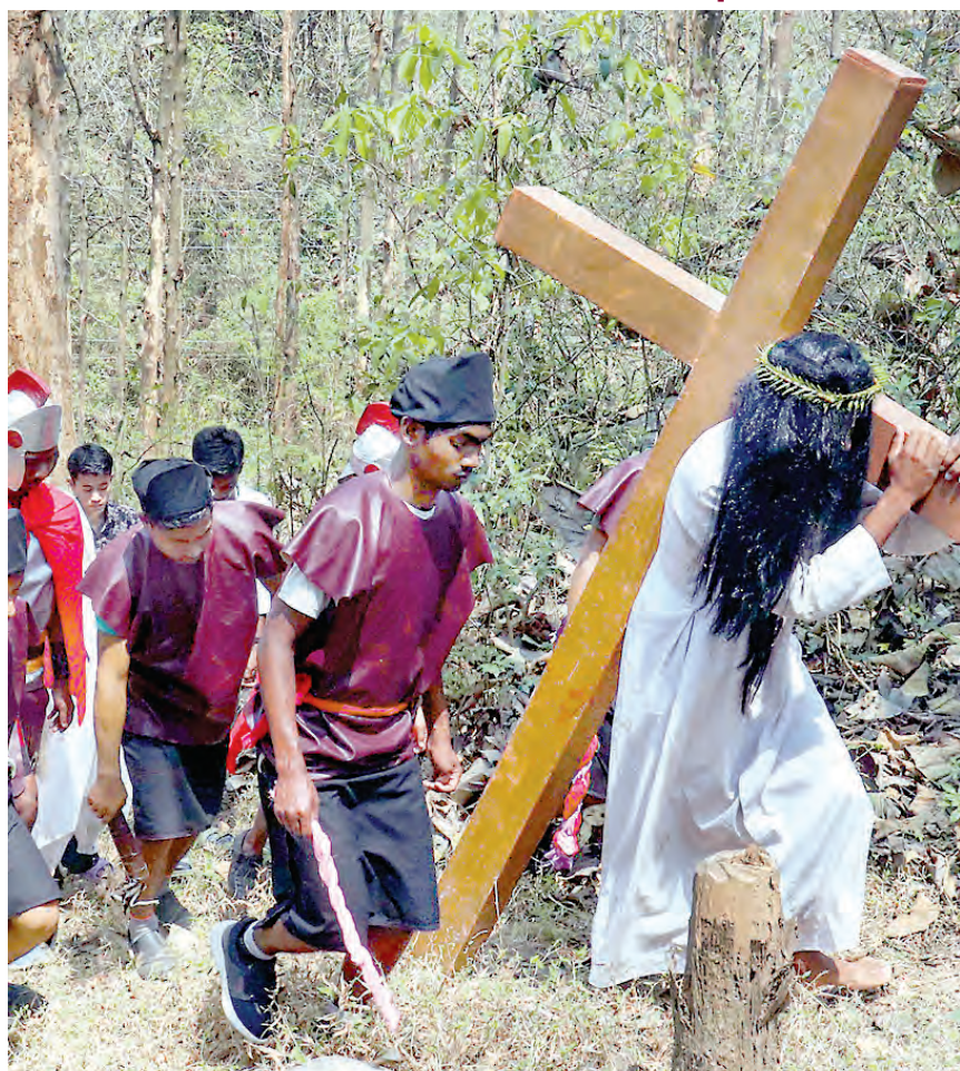
Christians re-enact crucifixion of Lord Jesus to commemorate Good Friday at Kharghuli, in Guwahati, Friday.