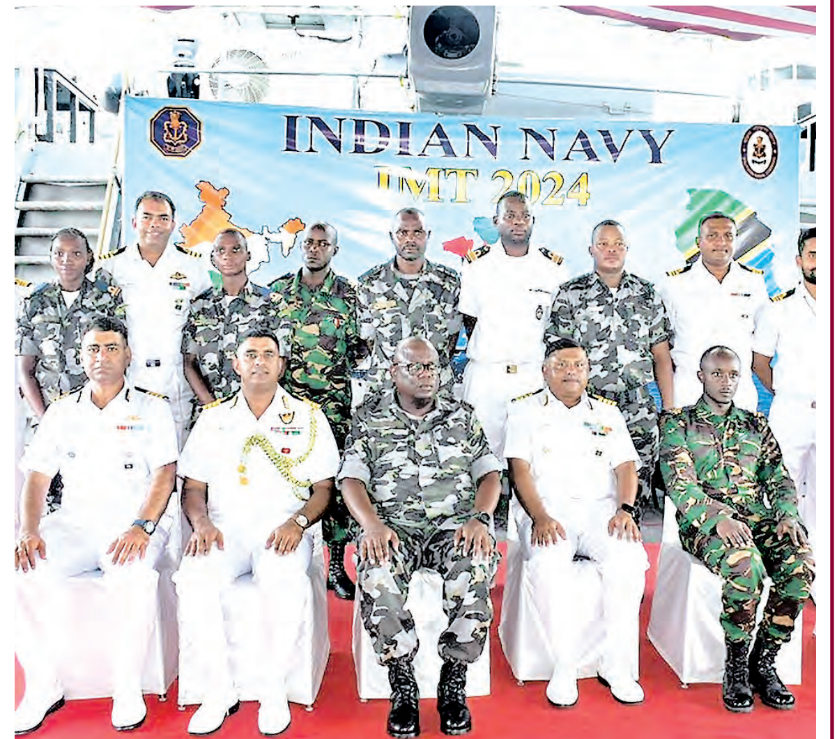
Navy officers with their counterparts from Tanzania and Mozambique at the conclusion of IMT TRILAT-24, a tri-lateral exercise between countries, in Nacla, Mozambique.