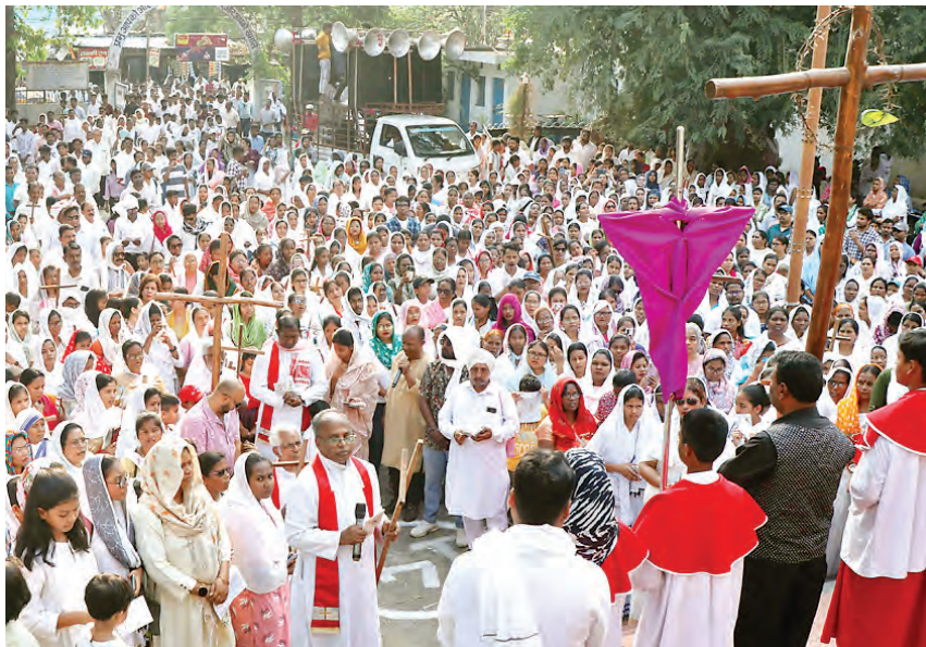
Christians attended the Church Services on Good Friday which commemorates the crucifixion and death of Jesus Christ on the cross. It is a day of reflection and reverence, often observed with fasting, prayer services, and church services that recount the events of Jesus's Passion.