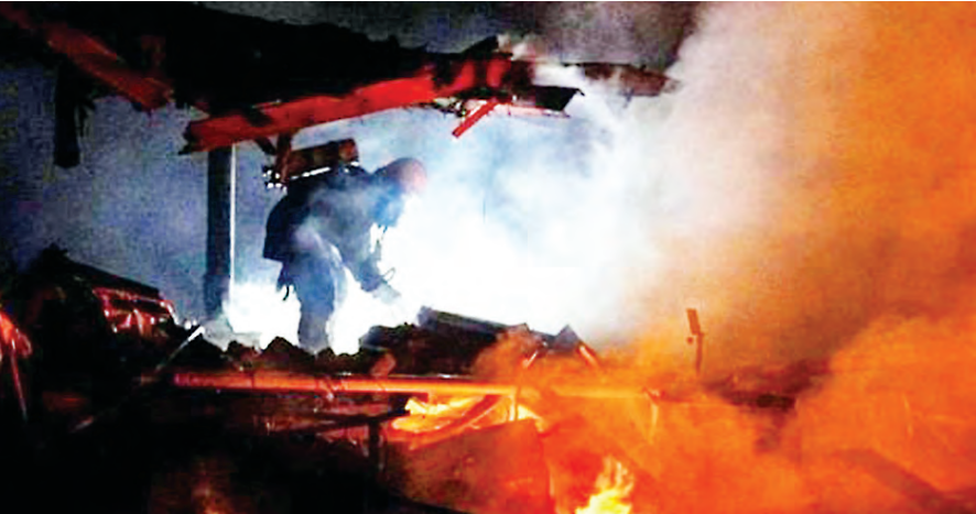
Kyiv, Mar 29 (AP):

Moscow launched a large-scale attack on Ukraine's energy infrastructure Friday, with a mass barrage of 99 drones and missiles hitting regions across the country, Ukraine's armed forces said.