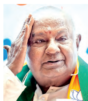
JD(S) supremo H D Devegowda during the BJP-JD(S) Co-ordination meeting, in Bengaluru, Friday.

Gowda cautioned the BJP and JD(S) leaders against taking the Congress lightly as, he claimed, the Mallikarjun Kharge-led outfit has "huge financial resources." "In the present