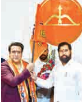
Actor Govinda joins Shiv Sena (Shinde faction) in the presence of Maharashtra CM Eknath Shinde, in Mumbai, Thursday.

Govinda, who gave multiple superhit films in his decades-long career, made a blockbuster entry in