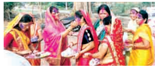
Katagi, Mar 28:

The festival of colours Holi was celebrated with great zeal in the region with people of all sections of the society taking part in the festivities. A day prior to Holi, Holika Dahan was also celebrated and this time in Katgi area, on the call of Gayatri family, women along with men went to perform Holika Dahan, prayed for happiness and prosperity, forgetting all the grudges and congratulated each other