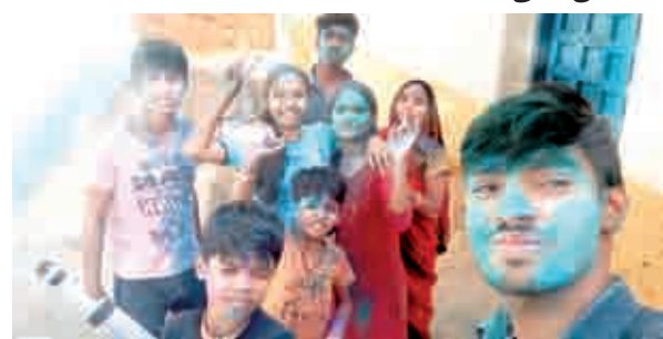
Anwari, Mar 28:

Villages of the area including Anwari, Bhaibod, Kumhari, Purena, Joratarai, Koliyari, Bhakhara Bhattheli, Sigdehi, Bhendasar, Sirve, Semra, Siltara, Supela, Navgaon, Thuha, Bagaud, Bangoli, Banjari, Khapri, Kurra, and surrounding areas, Holi, the great festival of colors, was celebrated with complete simplicity and joy. The enthusiasm of this festival of love, brotherhood and uniting everyone was visible in every section and this time peo-