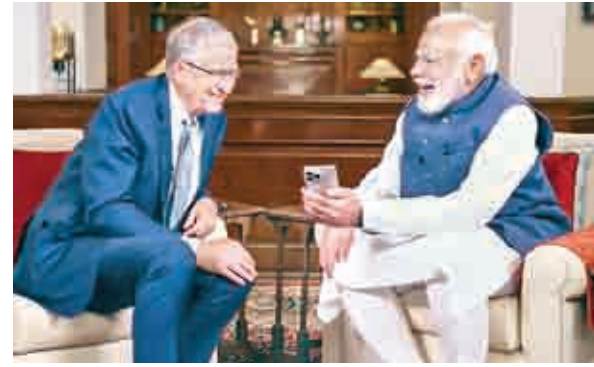
PM Modi with Microsoft co-founder Bill Gates during a meeting at his residence, in New Delhi.