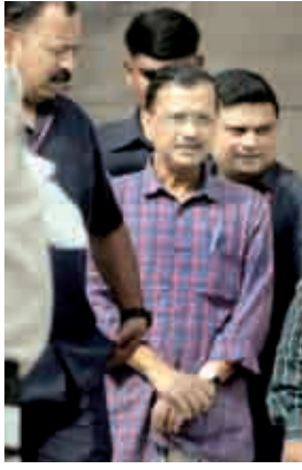
Delhi CM Arvind Kejriwal comes out of the Rouse Avenue Court, in New Delhi, Thursday.

It said the statement of one of the AAP candidates in the 2022 Goa elections