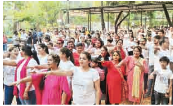
Raipur, Mar 28:

Series of programmes such as Holi of Flowers, aerobics for health promotion, Zumba, musical street drama for road safety and voter awareness were held under 'Holi Milan' of Holi festival in the city's Anupam Garden