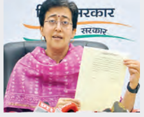
Delhi Minister and AAP leader Atishi Singh shows Delhi CM Arvind Kejriwal's first direction from ED custody on running the city government during a press conference, in New Delhi, Sunday.

In a press meet later, Ms Atishi said she was in tears on reading the Chief Minister's note. "Arvind Kejriwal ji has sent me a letter and a direction. On reading it, I was in tears. I kept thinking who is this man, who is in prison, but is still thinking about Delhi residents' water and sewage problems. Only Arvind Kejriwal can do this because he considers himself a family member of Delhi's 2 crore people," she said. "I want to tell the BJP, you can arrest Arvind Kejriwal and put him in jail, but you cannot imprison his love and sense of duty for Delhi's people," she said, adding that the AAP leader may