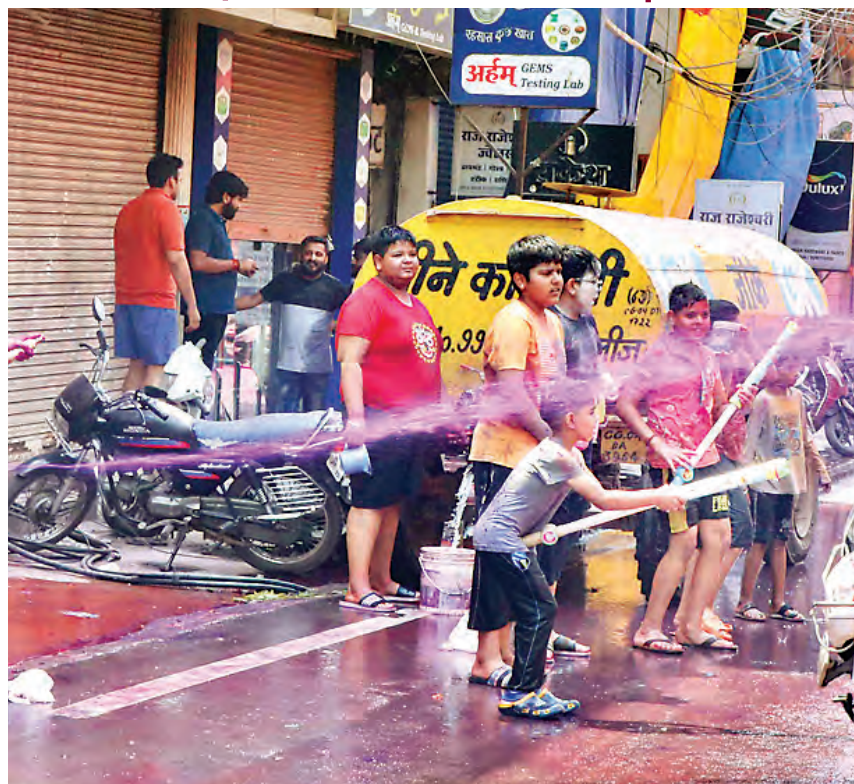
Holi celebrations at city's Sadar Bazar starts two-days in advance and all those passing from this Sadar Bazar road have not excuses and are drenched in colours by children using water guns and other means.