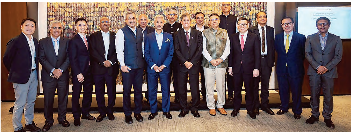
External Affairs Minister S Jaishankar with leading Singaporean Corporate figures, in Singapore.