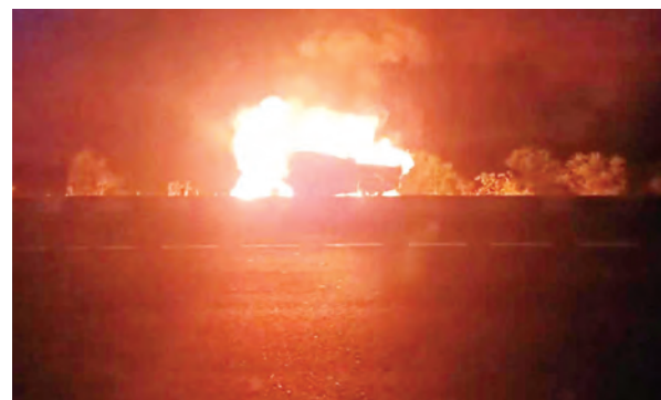
Car occupants narrowly escape

Raipur, Mar 24: An Audi car caught fire in the middle of National Highway-53 near Birkonli last night. The people travelling in the car narrowly