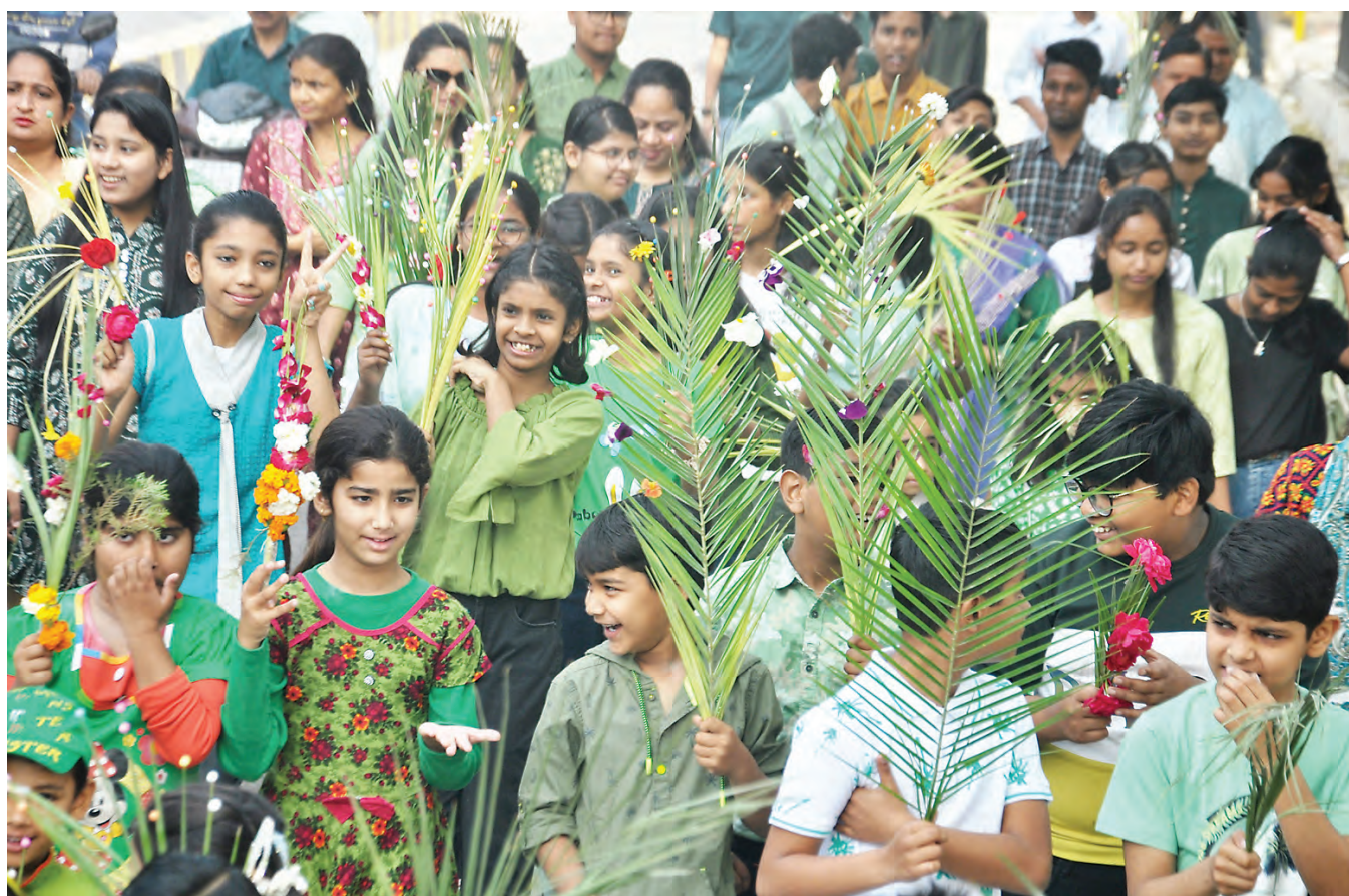
Christians take part in a procession on the occasion of 'Palm Sunday', in Moradabad, Sunday, March 24