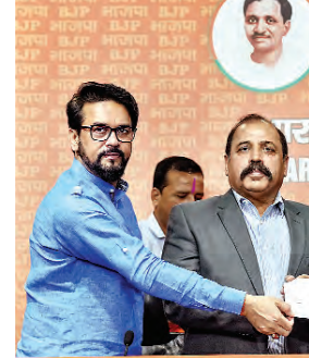
Former IAF chief Bhadauria joins BJP