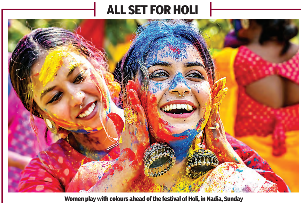
Women play with colours ahead of the festival of Holi, in Nadia, Sunday