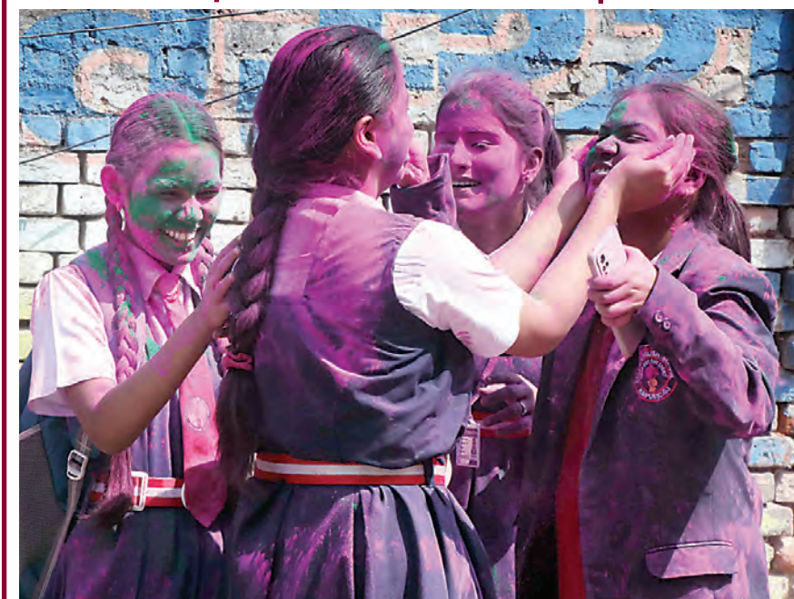
Girls on the last day of their exams in the School, enjoying throwing of colours on each other as pre-Holi celebrations here on Friday.