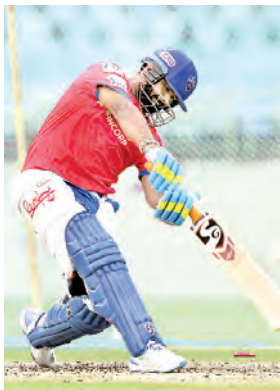
ing forward to playing my first game tomorrow," Pant said ahead of his team's first match of the season. The

Chandigarh: Rishabh Pant is experiencing an entire gamut of emotions from nervousness to excitement as he gears up for his first competitive game in nearly 15 months when he leads Delhi Capitals in their IPL opener against Punjab Kings here on Saturday. Coming back after a painstakingly long rehab following a horrific car crash in December, 2022, Pant feels grateful to be back on the 22-yard strip. "Jittery, nervous, excited...all of it, but at the same time, just happy, being able to come back to professional cricket. I'm just look-