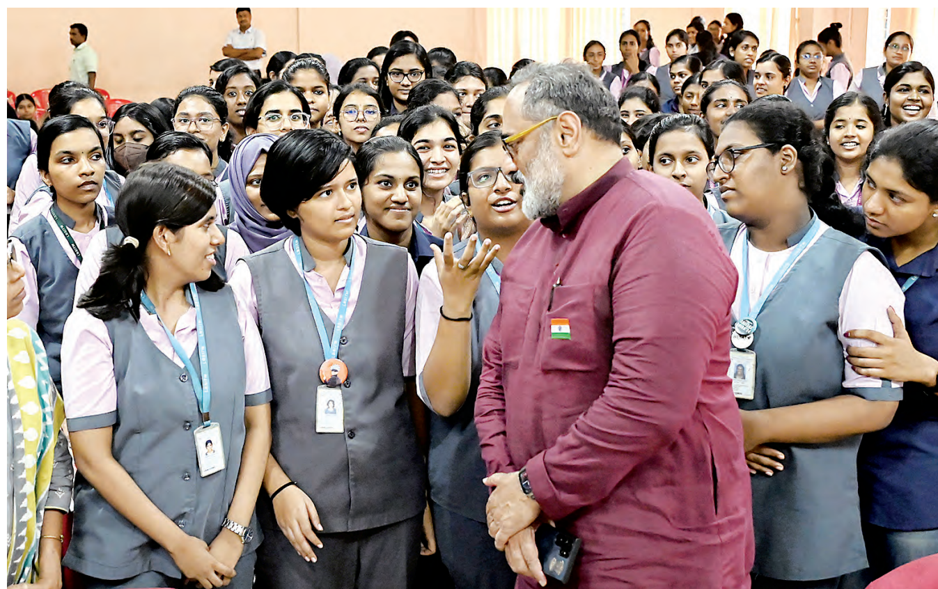
Union Minister & BJP candidate Rajeev Chandrasekhar interacts with the students of LBS Institute of Technology for Women during his election campaign ahead of upcoming Lok Sabha Polls, in Thiruvananthapuram, Friday, March 22.