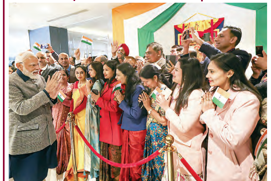
Prime Minister Narendra Modi being welcomed on his arrival, in Thimphu, Friday, March 22.