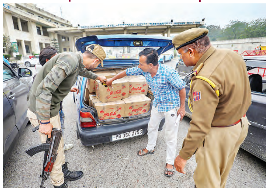
Police personnel check a vehicle at Lakhanpur border, ahead of the upcoming Lok Sabha election, in Kathua district.