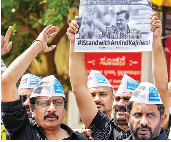
Aam Adami Party workers and leader raise slogans during a protest against the arrest of Delhi CM Arvind Kejriwal, in Bengaluru, Friday.

He demanded Rs 100 crore from some accused from the 'South group' for contesting the Punjab elec-