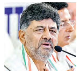
Karnataka Dy CM D K Shivakumar during a press conference at KPCC office, in Bengaluru, Friday.