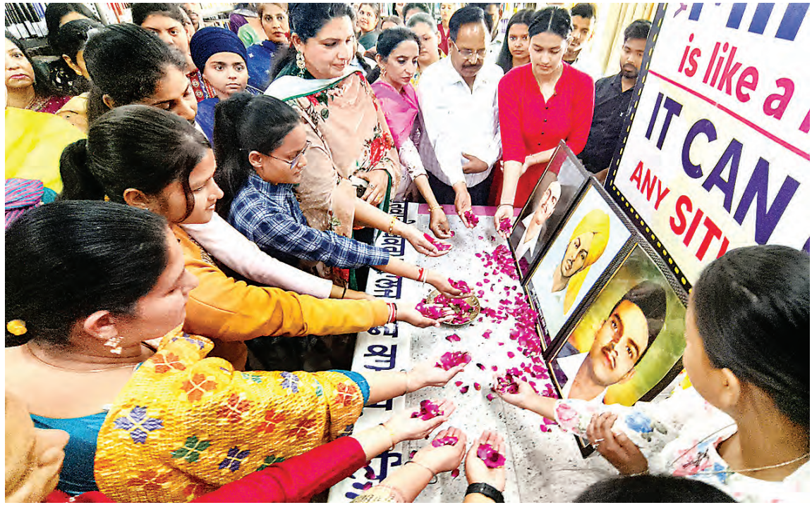
College teachers and students pay tribute to Shaheed Bhagat Singh, Rajguru and Shukhdev on the eve of their martyrdom day, at Government Bikram College of Commerce in Patiala, Friday