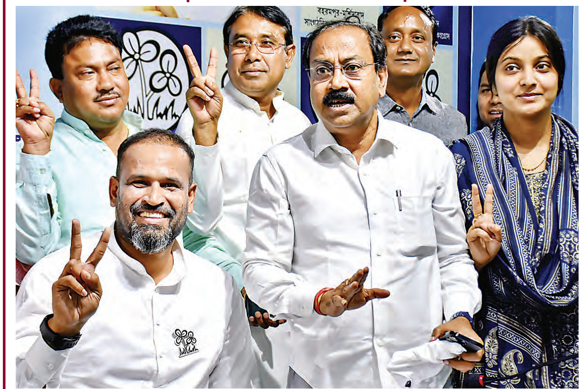
Former cricketer and TMC candidate Yusuf Pathan flashes victory sign with party leaders at the party office at Berhampore, in Murshidabad district of West Bengal, Friday.