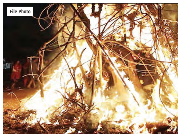
Arang, Mar 22:

Cholera epidemic spurs unique ritual in Ratakat village