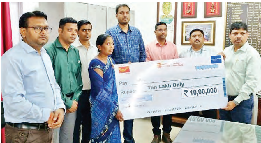
Pithora, Mar 22:

The Indian Postal Department, renowned for its extensive reach and commitment to financial inclusion, continues to serve as a beacon of reliability and support for the Indian populace. Not only does it facilitate essential postal services, but it also extends a helping hand