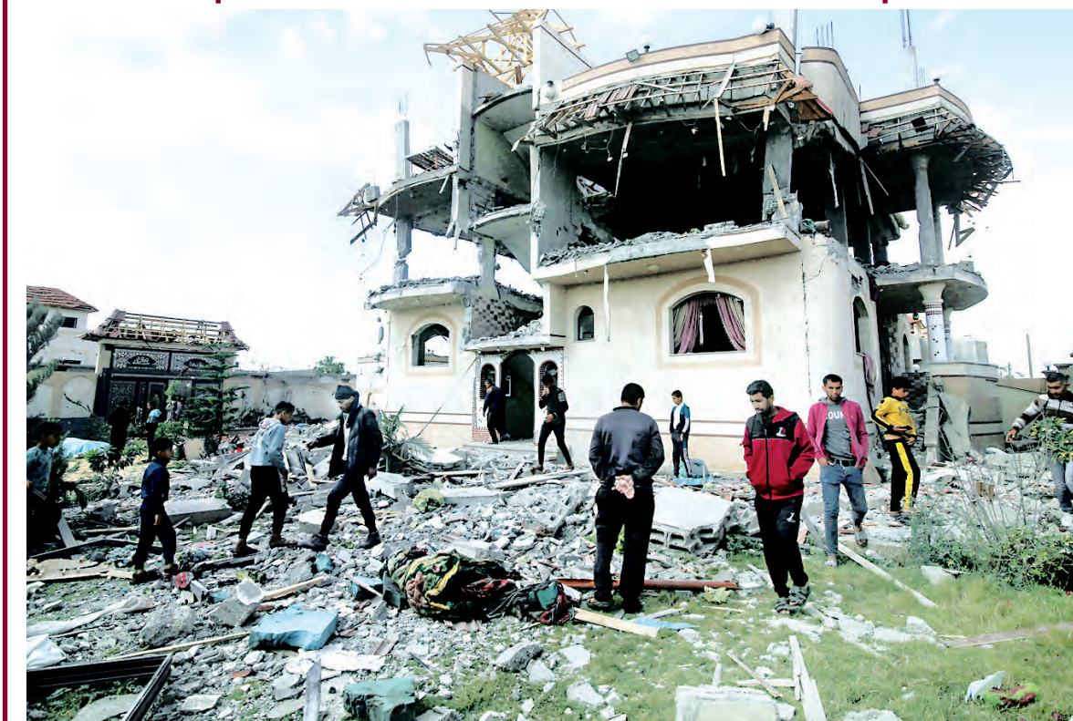
Palestinians look at a house destroyed in an Israeli airstrike, in Khan Younis, Friday, March 22.