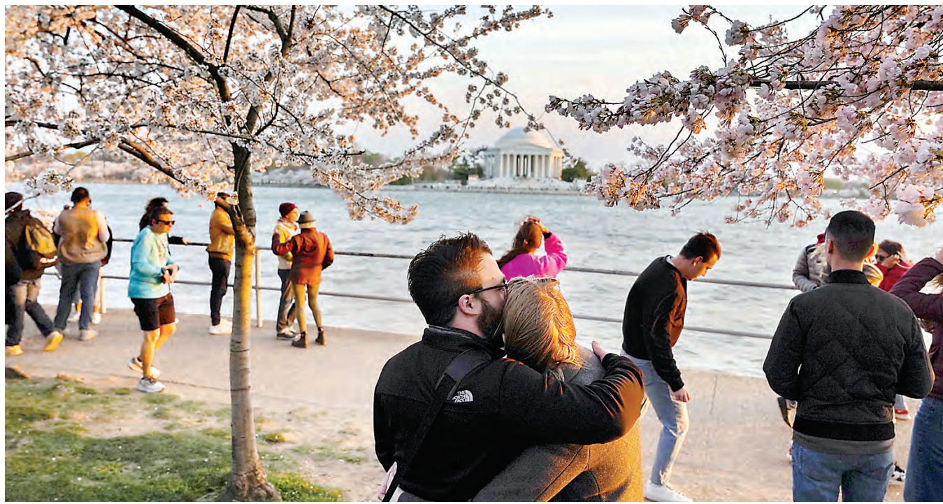
The Jefferson Memorial is visible as visitors to the Tidal Basin walk along an area as cherry trees enter peak bloom this week in Washington.