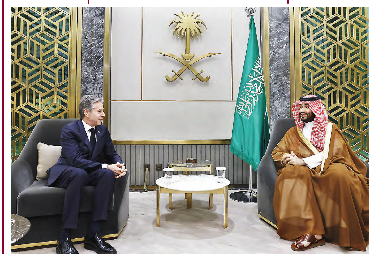
U.S. Secretary of State Antony Blinken meets Saudi Crown Prince Mohammed bin Salman in Jeddah, Saudi Arabia.