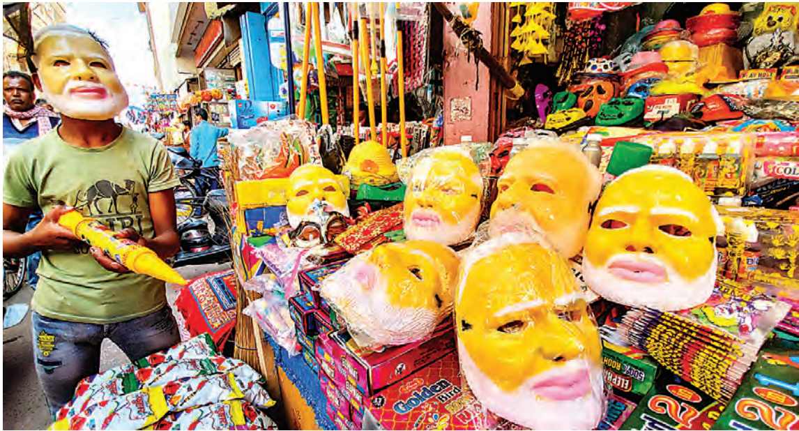
A vendor sells Modi-masks and water guns for the festival of Holi at Lohar Gali, in Agra, Thursday.