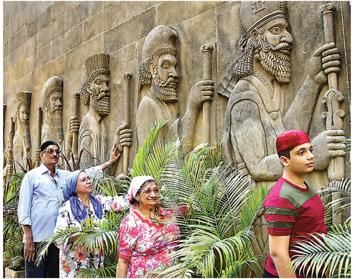
Parsi community members visit a fire temple on the occasion of 'Navroz', the Parsi New Year, at Kappawala Agriy in Mumbai, Thursday.