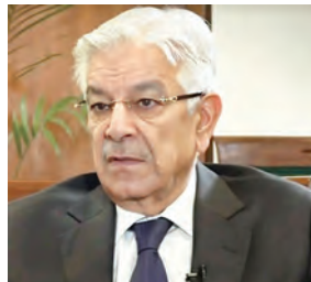
the Dawn newspaper.