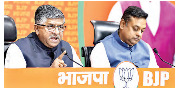
BJP leaders Ravi Shankar Prasad and Sambit Patra address a press conference at party headquarters, in New Delhi, Thursday.

BJP leader and former Union minister Ravi Shankar Prasad charged former Congress president Rahul Gandhi with lying and also targeted Sonia Gandhi, saying