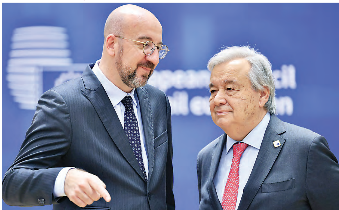
European Council President Charles Michel, left, speaks with United Nations Secretary General Antonio Guterres during a round table meeting at an EU Summit in Brussels, Thursday, March 21.