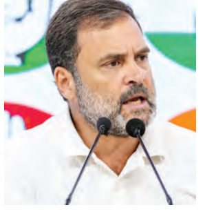
Congress leader Rahul Gandhi briefs the media, at AICC headquarters, in New Delhi, Thursday.