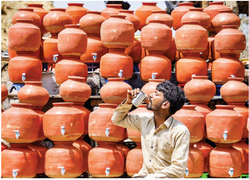
A vendor sells clay water pots amid the ongoing water crisis in Karnataka, in Bengaluru, Thursday.