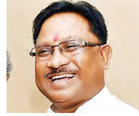
Vishnu Deo Sai

Asked about Baghel claiming he was being implicated in the Mahadev