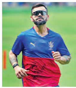
Bengaluru, Mar 18 (PTI): Superstar Virat Kohli on Monday made his first appearance in the training session of his franchise Royal Challengers Bangalore ahead of the IPL beginning March 22. The former India and RCB captain was seen taking rounds of the Chinnaswamy Stadium as part of his warm-up. Skipper Faf du Plessis also attended the session. RCB, who have never won the IPL, begin their campaign against reigning champions Chennai Super Kings in Chennai on Friday. Kohli's performance in the lucrative T20 league will be closely tracked as the event precedes the T20 World Cup in the USA and Caribbean.