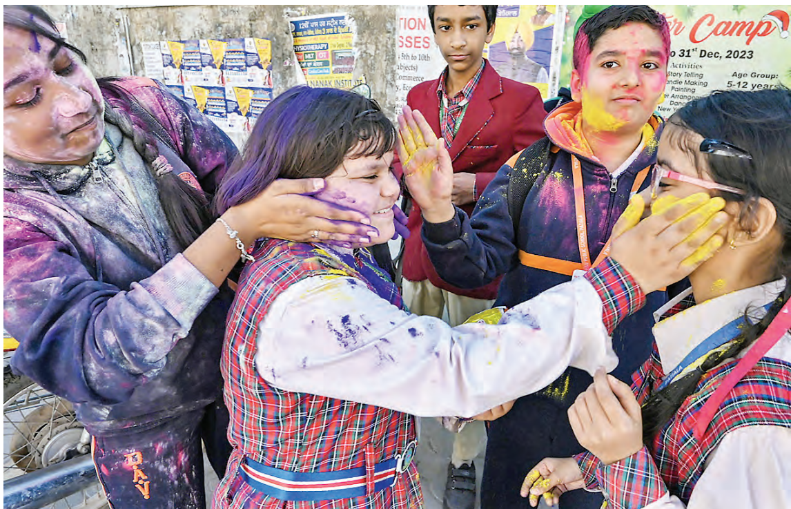
Students play Holi at the end of their exams, at a school in Patiala, Monday.