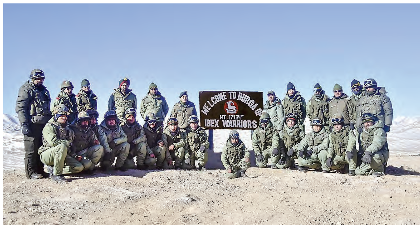
Northern Army commander Lt Gen MV Suchindra Kumar during a visit to review operational preparedness of formations deployed in the Super High Altitude Area of Ladakh.