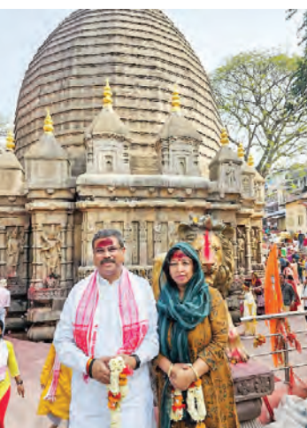
Union Minister Dharmendra Pradhan visits Maa Kamakhya Temple, in Guwahati, Assam.

This entails ensuring ample opportunities for students to learn in their native languages along with the availability of educational materials in all Indian languages. Such measures not only enrich the multilingual