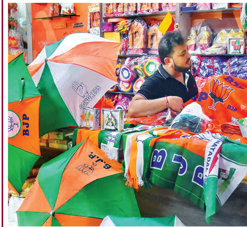
A vendor sells party symbols and other election material ahead of Lok Sabha elections, in Bengaluru, Monday.