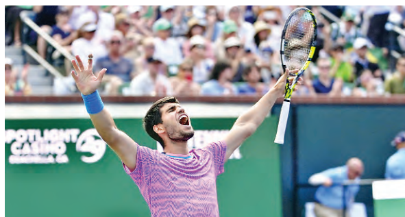
Carlos Alcaraz celebrates after defeating Daniil Medvedev in the final match at the BNP Paribas Open tennis tournament.

Iga Swiatek beat Maria Sakkari 6-4, 6-0 in just over an hour to win the women's title, with Swiatek losing just 21 games in six matches dur-