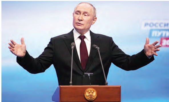
Russian President Vladimir Putin speaks on a visit to his campaign headquarters after a presidential election in Moscow, Monday.

President Vladimir Putin basked in an election victory that was never in doubt, as officials said Monday that he had won his fifth term with a record number of votes, underlining the Russian leader's total control of the country's political system.