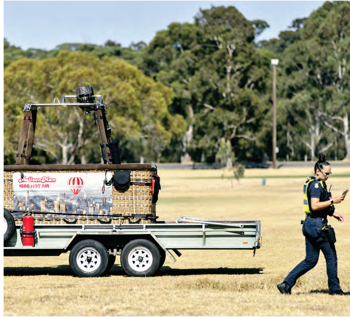
A police officer walks past a trailer with a hot-air balloon basket on it after the discovery of a man's body at Yarra Bend Park in Melbourne, Monday.