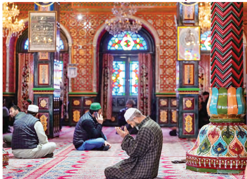
Muslims pray at the shrine of peer Dastagir Sahib during the holy month of Ramadan at Khanayar, in Srinagar, Monday.