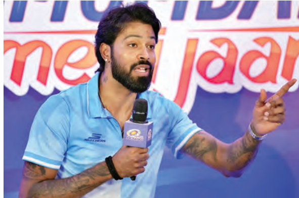
Mumbai Indians captain Hardik Pandya at a press conference in Mumbai, Monday.

Mumbai Indians skipper Hardik Pandya on Monday said his predecessor Rohit Sharma will continue to be a guiding force for him during the IPL despite the unexpected change of leadership that the franchise announced ahead of the upcoming season, triggering a "backlash" from the fans.