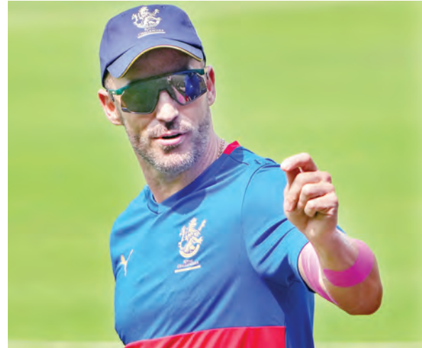
Royal Challengers Bangalore captain Faf du Plessis during a training session ahead of the Indian Premier League (IPL) 2024 cricket tournament, at M. Chinnaswamy Stadium in Bengaluru, Monday.

He might not be the skipper anymore but Kohli's inputs and role in lifting the fielding unit's energy is also something that Du Plessis admires.