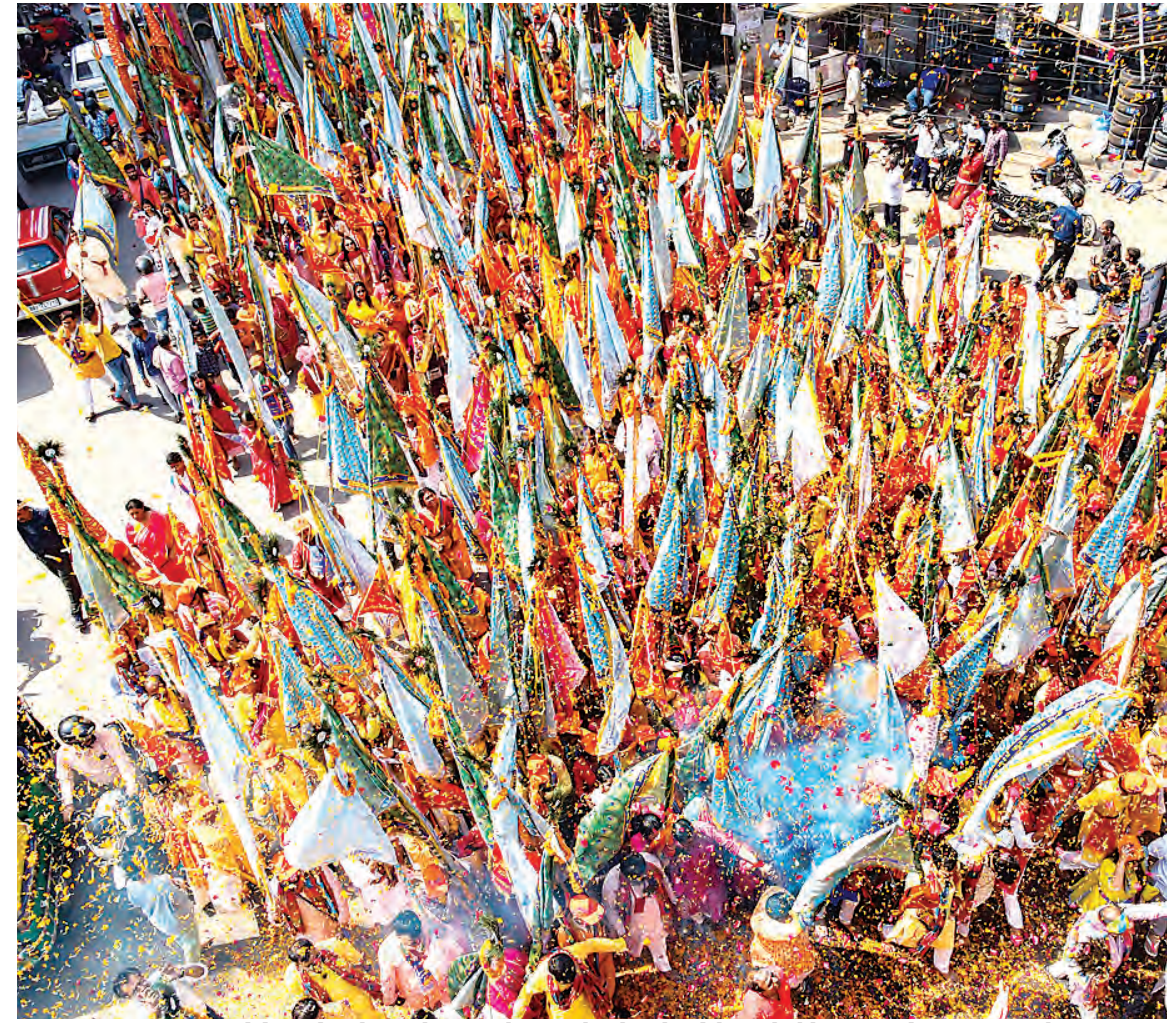
Devotees participate in 'Shree Shyam Falgun Holy Dhwaja Nishan Shobha Yatra', in Patna, Sunday.