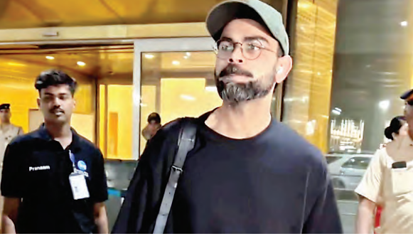
New Delhi, Mar 17 (PTI):