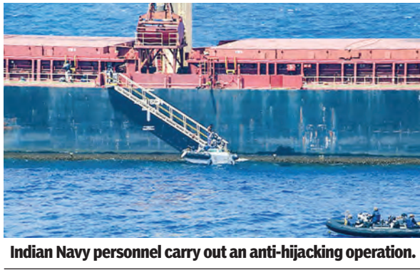
Indian Navy personnel carry out an anti-hijacking operation.

ation saw the Navy deploying its stealth-guided missile destroyer INS Kolkata, patrol vessel INS Subhadra, long-endurance Sea Guardian drones besides airdropping of the elite marine commandos - MARCOS - using the C-17 aircraft.