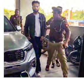
Youtuber Elvish Yadav being produced in a court in the snake venom at rave case, in Greater Noida, Sunday.

Youtuber Elvish Yadav was arrested on Sunday by Noida Police in connection with a probe into the suspected use of snake venom as a recreational drug at a party here, officials said. Yadav was among six people named in an FIR lodged at Sector 49 police station here on November 3 last year. The five other accused were arrested but are currently out on bail, the officials said. The case was lodged under provisions of the Wildlife Protection Act, 1972 and for criminal conspiracy under section 120B