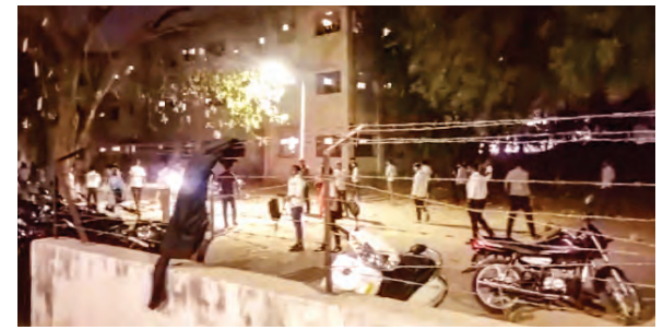
A scene after students hailing from different foreign countries were assaulted over the issue of offering Namaz.

The police have arrested two men and are looking for more after students hailing from different foreign countries were assaulted allegedly by a group of persons in the Gujarat University hostel in Ahmedabad for offering namaaz there, police said on Sunday. Two students one from Sri Lanka and another from Tajikistan were hospitalised after the incident which took place in the A-block hostel on Saturday night, they said. An FIR was registered against 20-25 unidentified accused persons under the Indian Penal Code (IPC) for rioting, unlawful assembly, voluntarily causing hurt, damage to property, and criminal tres-