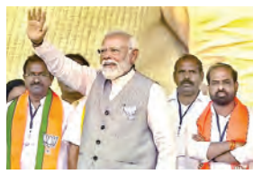
PM waves during a public meeting in Palnadu, Andhra Pradesh, Sunday.

Prime Minister Narendra Modi on Sunday said the NDA moves ahead taking regional aspirations and national progress and during the third term after the polls, the country will take many more big decisions. Addressing an National Democratic Alliance (NDA) election meeting at Boppudi village in Palnadu district, Modi said NDA's aim is for 'Viksit Bharat' build 'Viksit