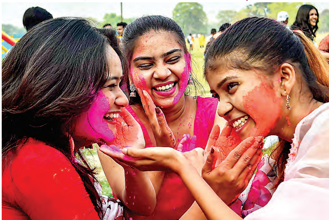
Young women play Holi with colours ahead of Basant Utsav festival, at Maidan area in Kolkata, Sunday.