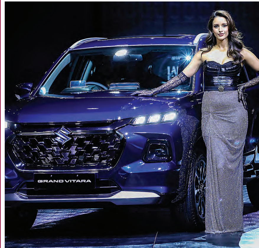
Actor Triptii Dimri walks the ramp showcasing a creation of fashion designers Shantnu and Nikhil during the Lakme Fashion Week x FDCI, in Mumbai, Sunday.