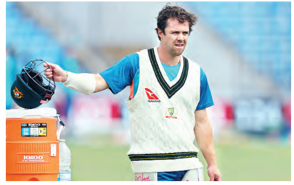
Hyderabad, Mar 17 (PTI):

Dashing Australia opener Travis Head has joined the Sunrisers Hyderabad training camp ahead of the upcoming IPL season.