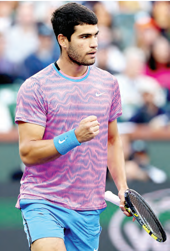
Indian Wells, Mar 17 (AP):

Carlos Alcaraz defeated Jannik Sinner 1-6, 6-3, 6-2 to end the Italian's 19-match winning streak and advance to the BNP Paribas Open final on Saturday night. Alcaraz retained his world No. 2 ranking with