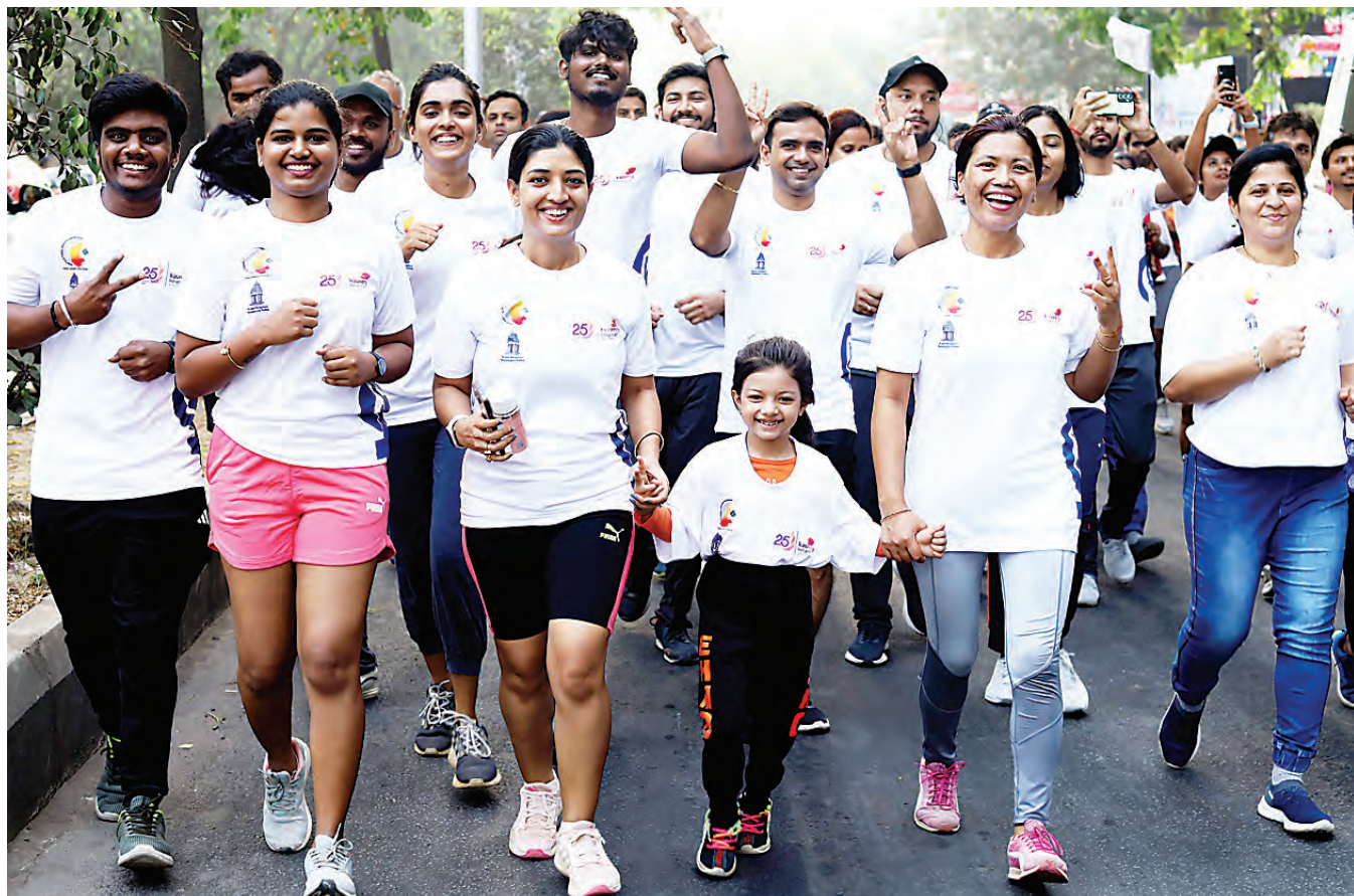
People take part in 'Vote-a-thon', a marathon organised to raise voter awareness ahead of General Elections 2024, in Bengaluru, Sunday, March 17.