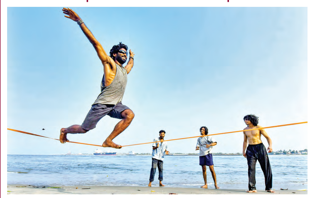
A man practices slacklining at Fort Kochi beach, in Kochi, Saturday.

Arun Goel quit due to personal reasons: CEC