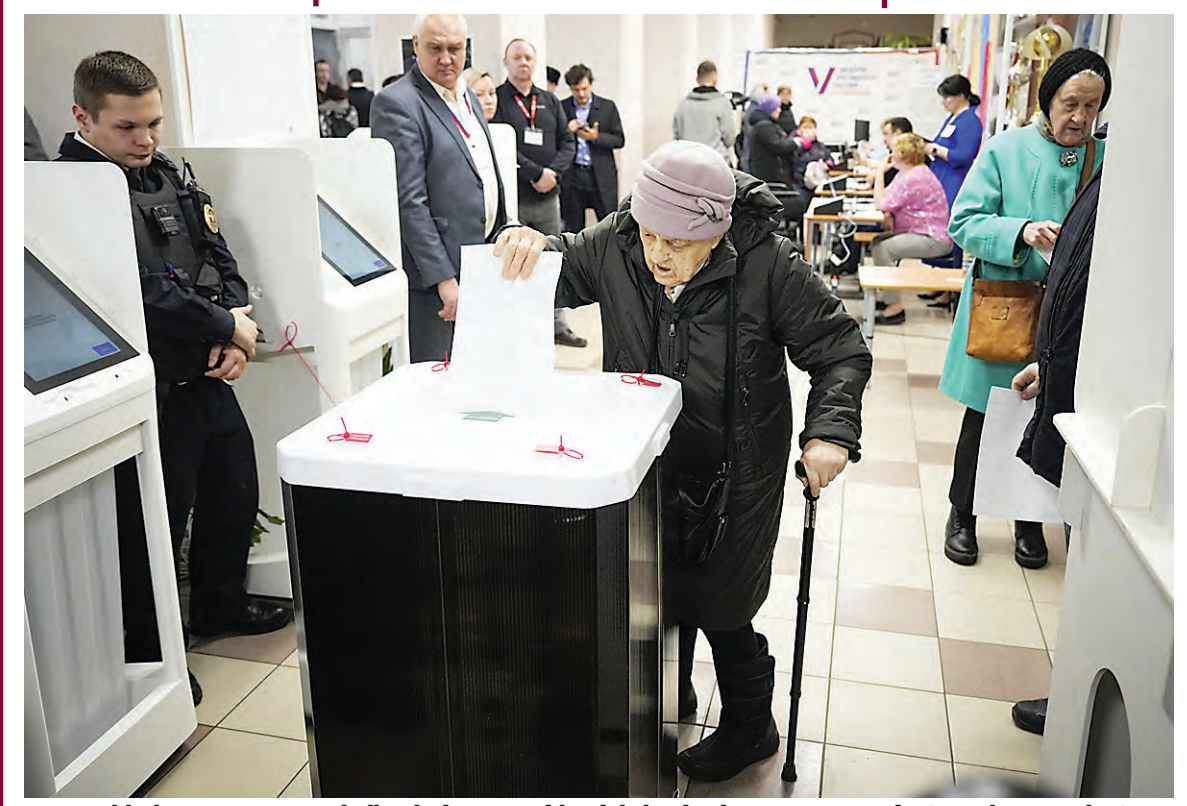
An elderly woman casts a ballot during a presidential election in Moscow, Russia, Saturday, March 16.