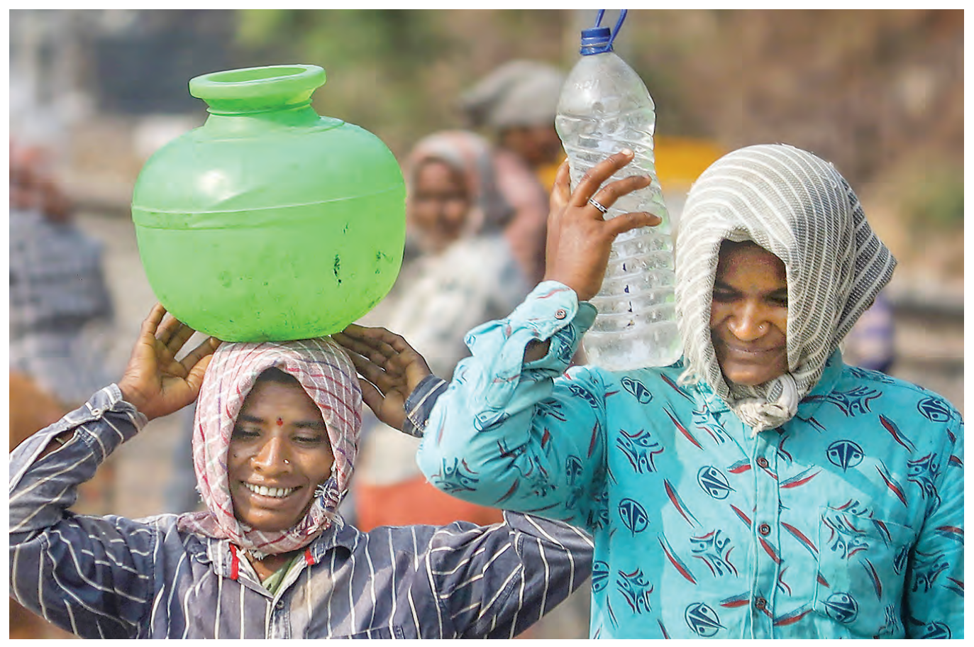
Migrant workers carry water during cleaning work of railway tracks near Jnanabharati station amid the ongoing water crisis in Karnataka, at Kengeri in Bengaluru, Saturday, March 16.