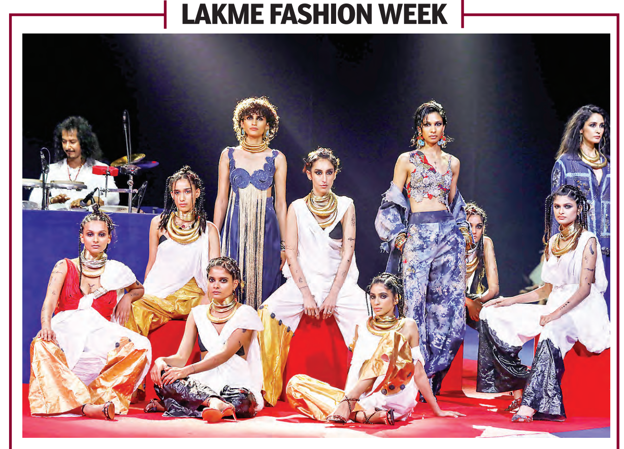
Models showcase creation of fashion designer Anamika Khanna during the third day of the Lakme Fashion Week x FDCI, in Mumbai.

continuing to work towards an ambitious trade deal. Whilst we don't comment on the details of live negotiations, we are clear that we will only sign a deal that is fair, balanced and ultimately in the best interests of the British people and the economy," a UK Department of Business and Trade spokesperson said. Last week, Commerce and Industry Minister Piyush Goyal told PTI in an interview in New Delhi that long-term benefits for the economy were the key in such FTA negotiations and that India was seeking a "balanced, fair and equitable" deal.