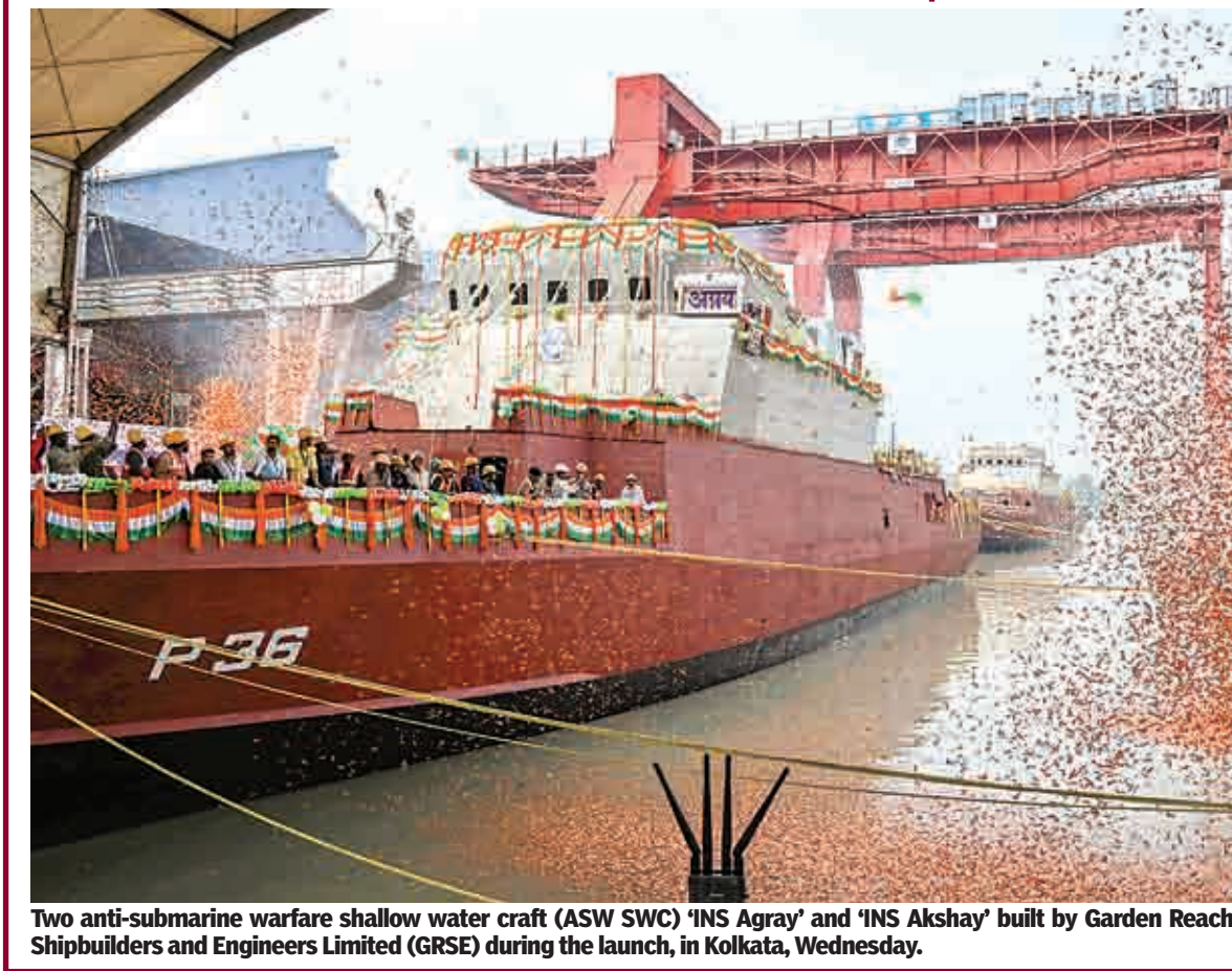
Two anti-submarine warfare shallow water craft (ASW SWC) 'INS Agray' and 'INS Akshay' built by Garden Reach Shipbuilders and Engineers Limited (GRSE) during the launch, in Kolkata, Wednesday.