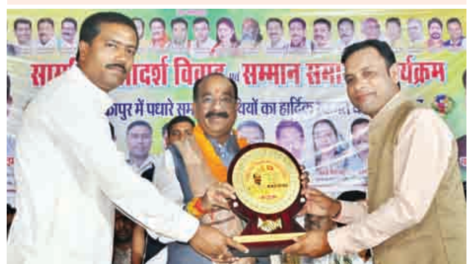
Raipur, Mar 13:

Samuhik Adarsh Vivah & Samman Samaroh (mass ideal marriage and felicitation ceremony) was organized in village Cherkapur on Monday under the joint aegis of Tehsil Sahu Sangh Palari, Rohansi, Bhawanipur, Datan area and Nagar Sahu Sangh Palari. Deputy Chief Minister Arun Sao attended the function as chief guest.