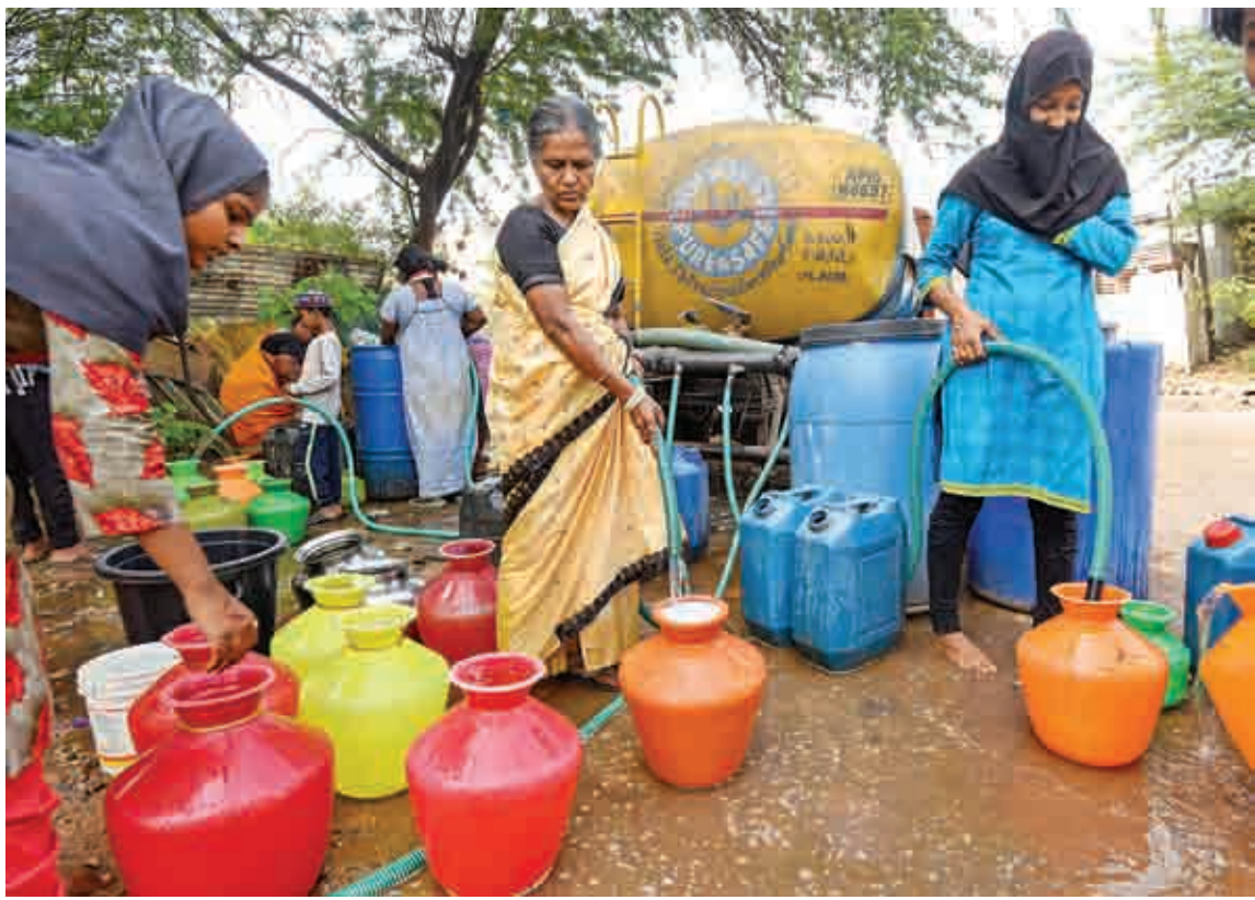
Locals collect free water from a government water supply tanker amid the ongoing water crisis, in Hyderabad, Wednesday.