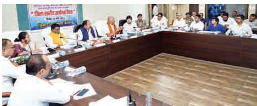
Raipur, Mar 13:

State Education, Tourism and Culture Minister and in-charge of Kanker district, Brijmohan Agrawal held a marathon meeting of district level officials in Kanker late on Monday night of March 11th to ensure better implementation of various schemes of the Central and State Government and as per the intention of the government. Instructions were given to ensure access at the lower level. Minister Agarwal clearly directed the officials present in the meeting to prepare a systematic strategy before the implementation of any scheme so that no