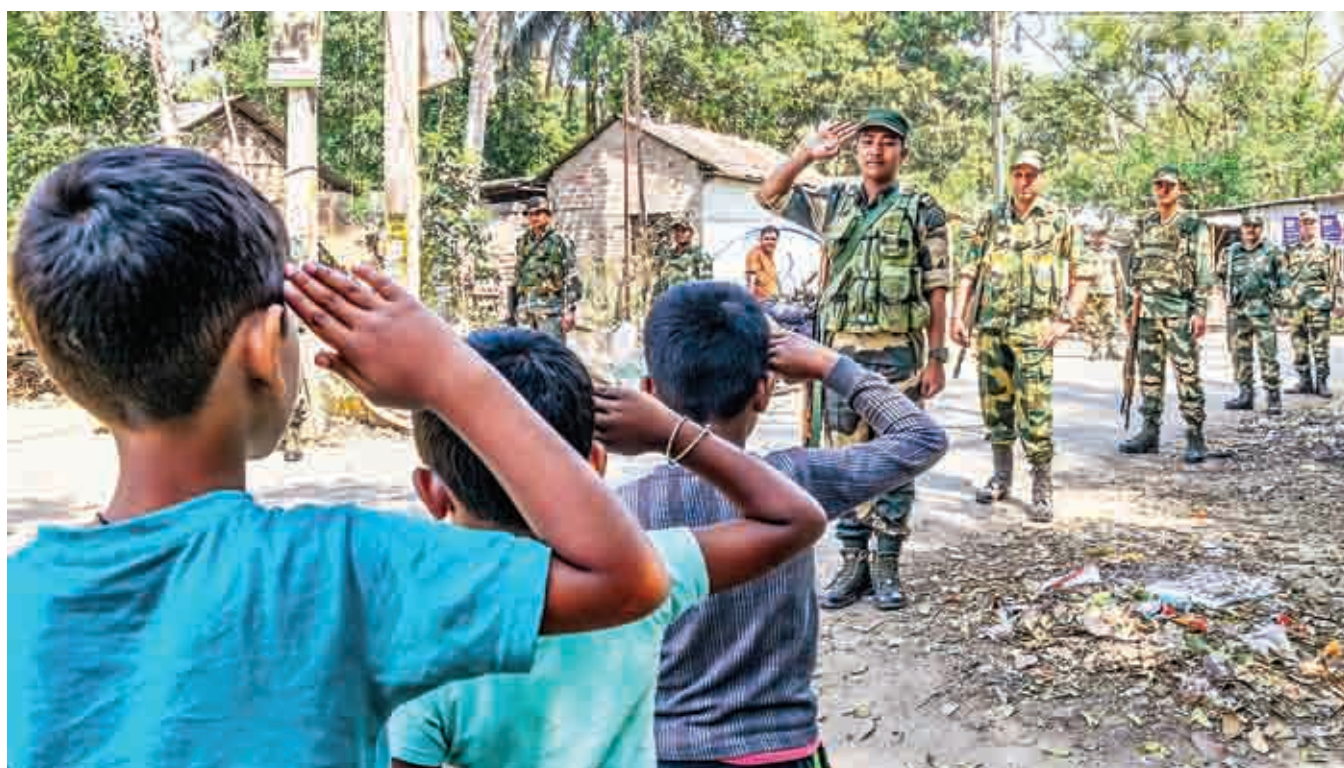
Children salute armed forces personnel during a confidence building march ahead of Lok Sabha polls, in Nadia, Wednesday, March 13.