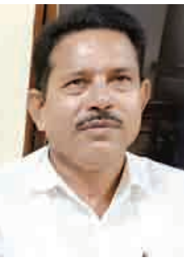
Paradip, Mar 13: