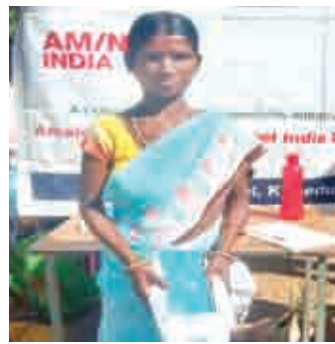
Kirandul, Tikanpal, and

Dantewada, Mar 13: AM/NS India CSR organized an orientation program on Menstrual Hygiene Management, across several Gram Panchayats in Dantewada. Aimed at raising awareness and providing essential support, the initiative targeted 443 adolescent girls and women in villages including Madadi, Palnar, Phulpad,