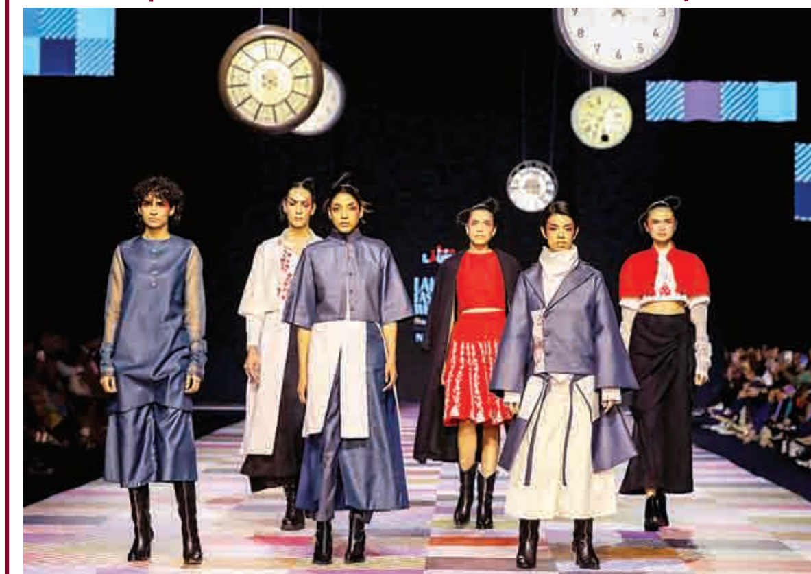
Models walk the ramp presenting the creations of the students of Inter National Institute of Fashion Design (INIFD) during the Fashion Design Council of India (FDCI) X Lakme Fashion Week (LFW), in Mumbai, Wednesday, March 13.