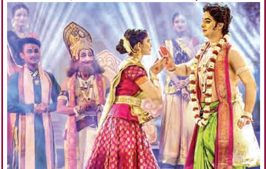
Artists from 'Birju Maharaj Parampara', Delhi, perform 'Katha Raghunath Ki' during the Nrita Sanrachna, a festival of choreographic works based on Ramayana organized by Sangeet Natak Akademi, in Guwahati, Wednesday.