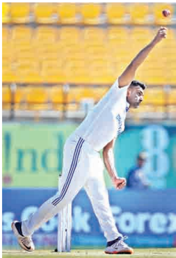
hundred in Dharamsala, rose five places to sixth and within 108 rating points of No.1 ranked Test batter Kane Williamson. Yashasvi Jaiswal (up

two places to eighth) and Shubman Gill (up 11 spots to equal 20th) reached new career-best ratings following excellent individual series against Ben Stokes' side.