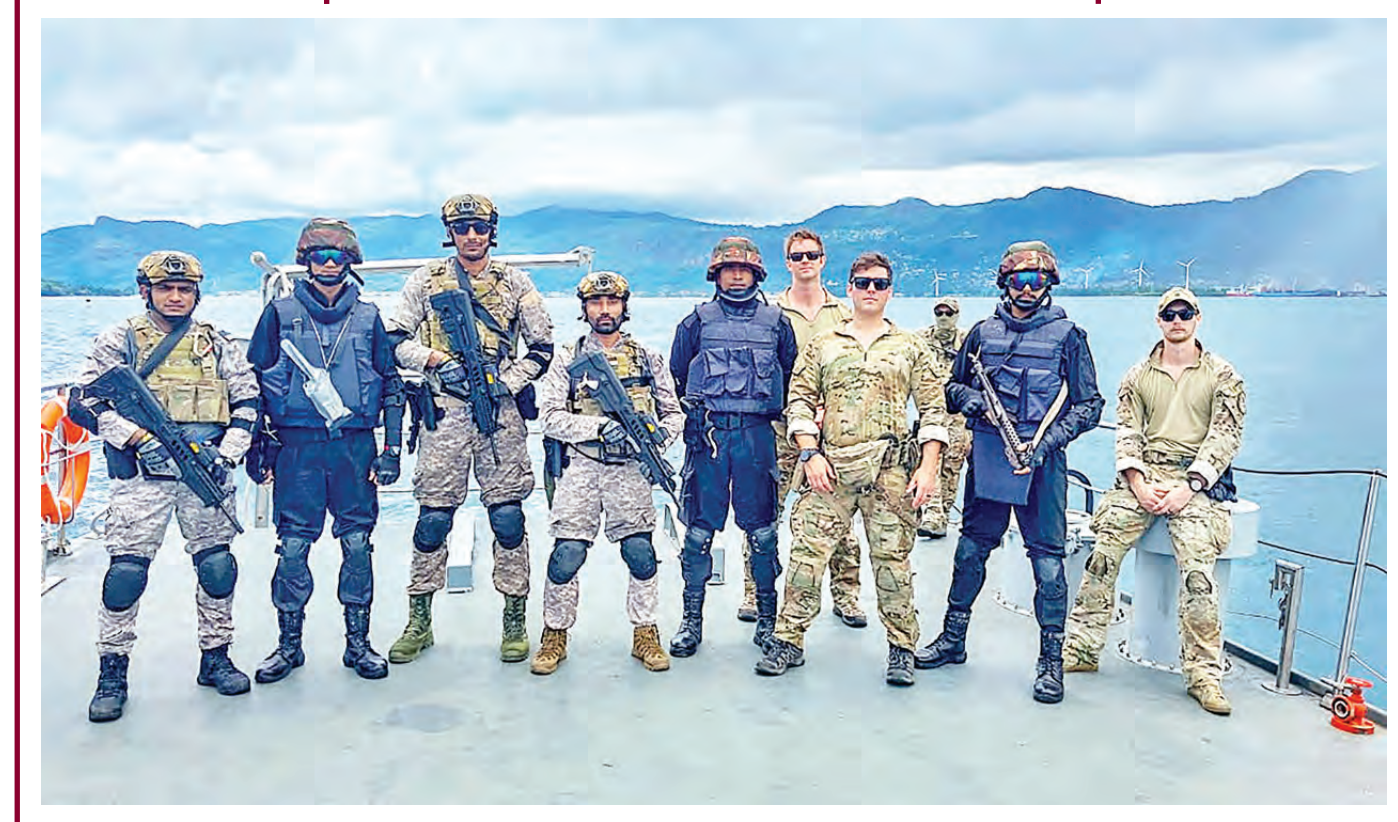
INS Tir, the lead ship of First Training Squadron (1TS) participated in Exercise Cutlass Express - 24 (CE - 24) held at Port Victoria, Seychelles from 26 Feb – 08 Mar 24.