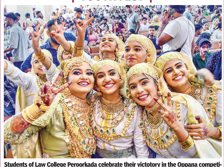
Students of Law College Peroorkada celebrate their victotory in the Oppana competiton at the Kerala University Youth festval, in Thiruvananthapuram, Sunday.

As political parties prepare to fight it out in the Lok Sabha polls, the demand for chartered planes and helicopters is expected to jump by up to 40 per cent compared to the previous general elections, according to industry experts. Helicopters are anticipated to be more in demand compared to fixed-wing aircraft as choppers will help in providing accessibility to rural and remote areas in a shorter time. "There will be an exponential demand for private jets and the demand is expected to outstrip the availability of chartered planes and helicopters. There is a limited supply of chartered planes and helicopters," Club One Air CEO Rajan Mehra told PTI.