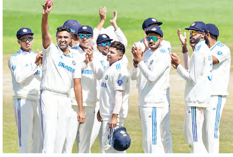
India's R Ashwin shows the ball as he takes a five-wicket haul during the 3rd day of the fifth Test cricket match between India and England, in Dharamsala, Saturday.

Four out of the five debutants Sarfaraz Khan, Dhruy Jurel, Akash Deep and Devdutt Padikkal showed they were ready for the big stage while the pillars of the team like the captain himself, Jasprit Bumrah and R Ashwin also stood tall with timely performances. The future does look bright for a team in transition. The standout performers that al-