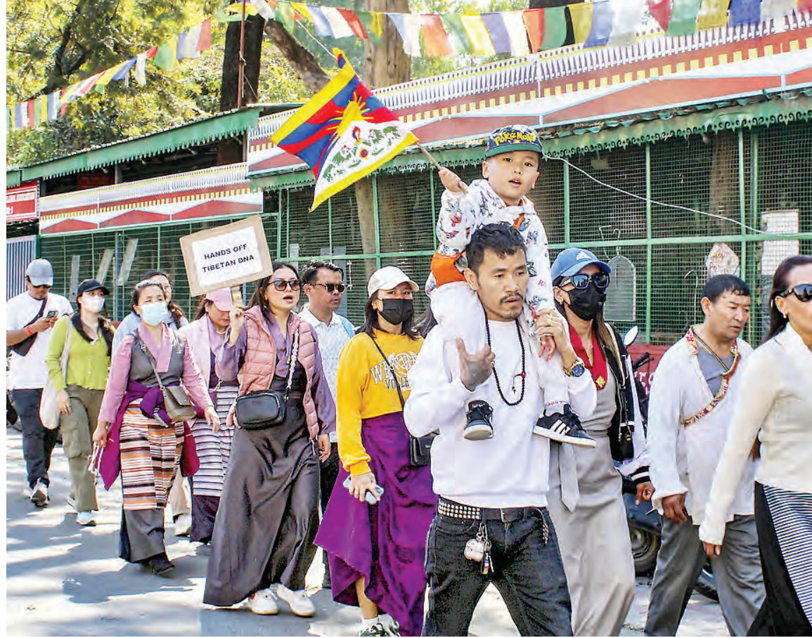
Members of the Tibetan community during a rally to commemorate the 65th anniversary of Tibetan National