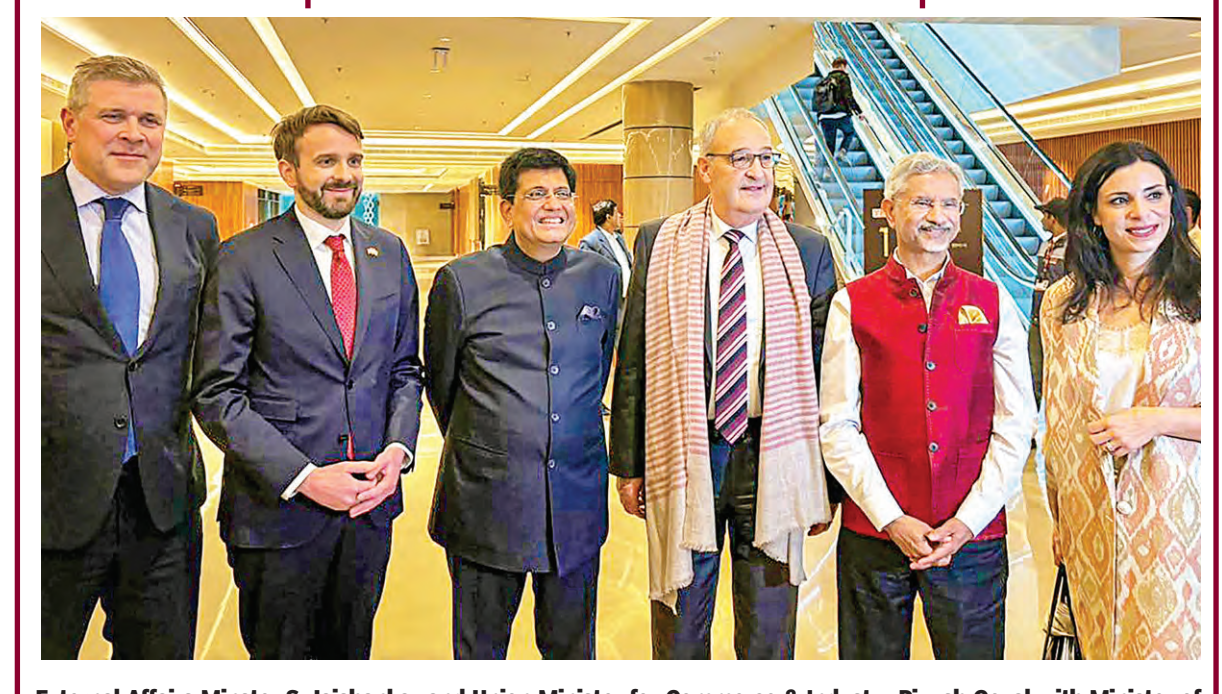
External Affairs Minster S. Jaishankar and Union Minister for Commerce & Industry Piyush Goyal with Minister of Foreign Affairs of Iceland Biarni Benediktsson. Minister of Foreign Affairs of Liechtenstein Dominique Hasler and other dignitaries, in New Delhi, Sunday, March 10.