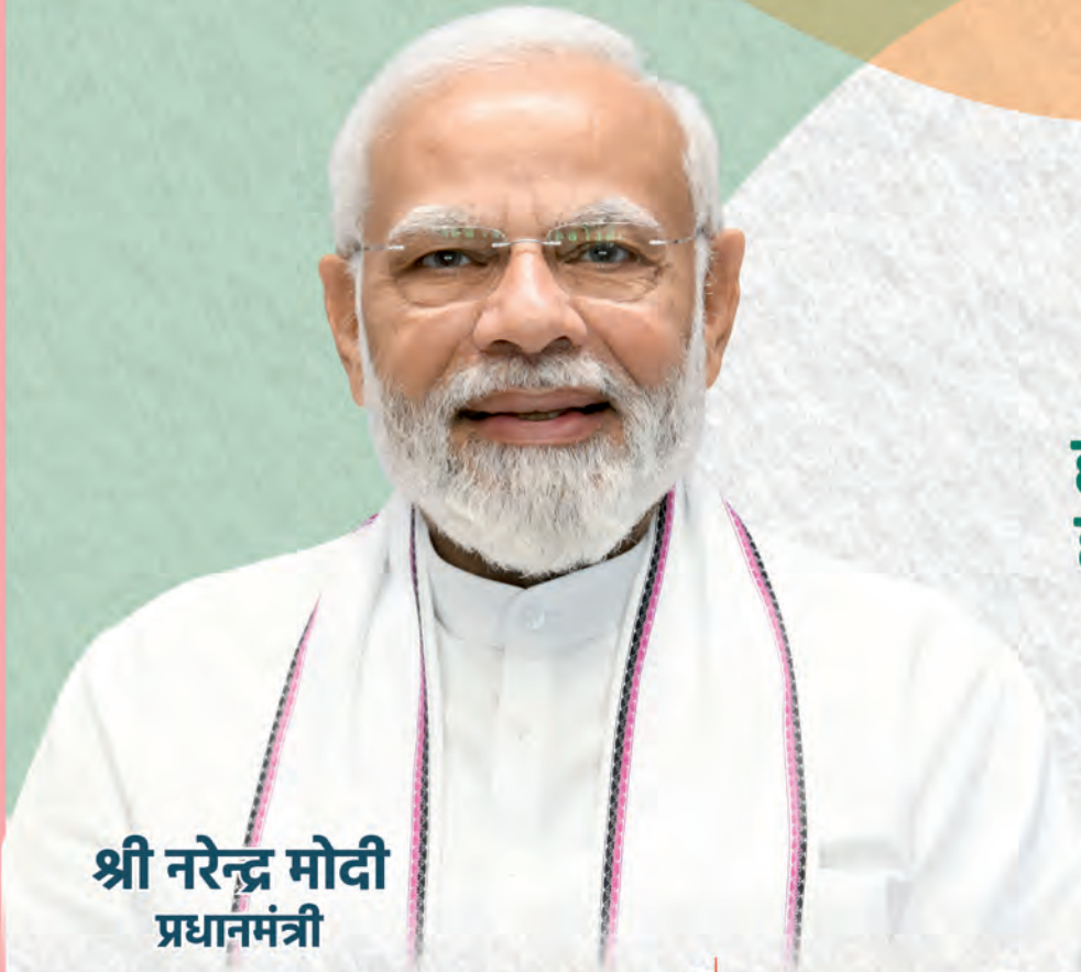
श्री नरेन्द्र मोदी प्रधानमंत्री