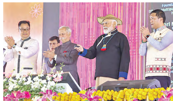
PM Modi during inauguration and foundation stone laying of multiple development projects during the 'Viksit Bharat Viksit North East' programme, in Itanagar, Saturday.

Prime Minister Narendra Modi on Saturday claimed that the Congress would have taken 20 years to do the kind of development work which was executed by his government in the last five years in the Northeast. The PM was addressing 'Viksit Bharat Viksit North East' programme in Arunachal Pradesh's Itanagar after unveiling development projects worth Rs 55,600 crore in the region.