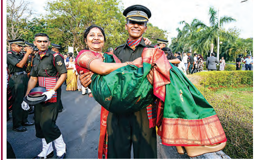
A cadet celebrates with his family member after a Passing out Parade and Pipping Ceremony at Officers Training Academy (OTA), in Chennai, Saturday.