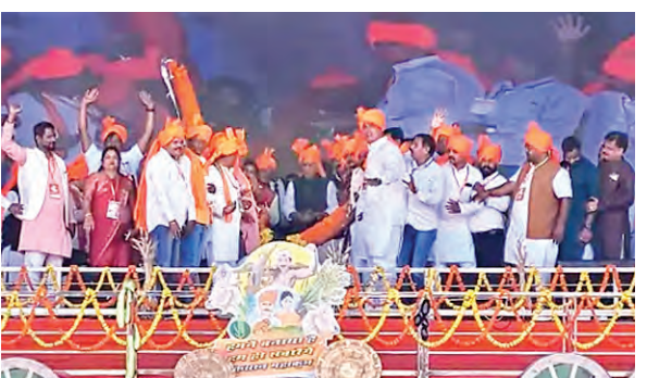
Defence Minister Rajnath Singh at a mega farmers' rally at Government Science College ground here.

Defence Minister Rajnath Singh on Saturday said the country's growth cannot be imagined without the development of farmers and villages, and asserted that the Modi government was standing shoulder to shoulder with the cultivators. Addressing a mega farmers' rally at Government Science College ground in state capital Raipur, he also targeted the previous Congress dispensation in the state, accusing it of indulging in corruption and derailing the state's development. "...I am the son of a farmer and hail from a village. Farmers can yield