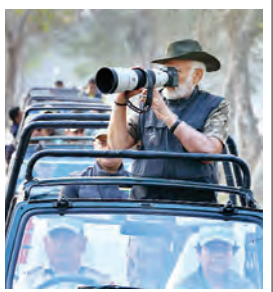
PM Modi takes 'jeep safari' during his visit to the Assam's Kaziranga National Park, Saturday morning.