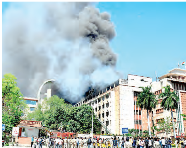
Smoke billows out after a fire broke out, at Madhya Pradesh Secretariat, in Bhopal, Saturday.

It being a Saturday, the government offices inside were almost empty when the fire broke out around 9.30 am, sources said. While Chief Minister Mohan Yadav directed officials to take necessary steps to pre-