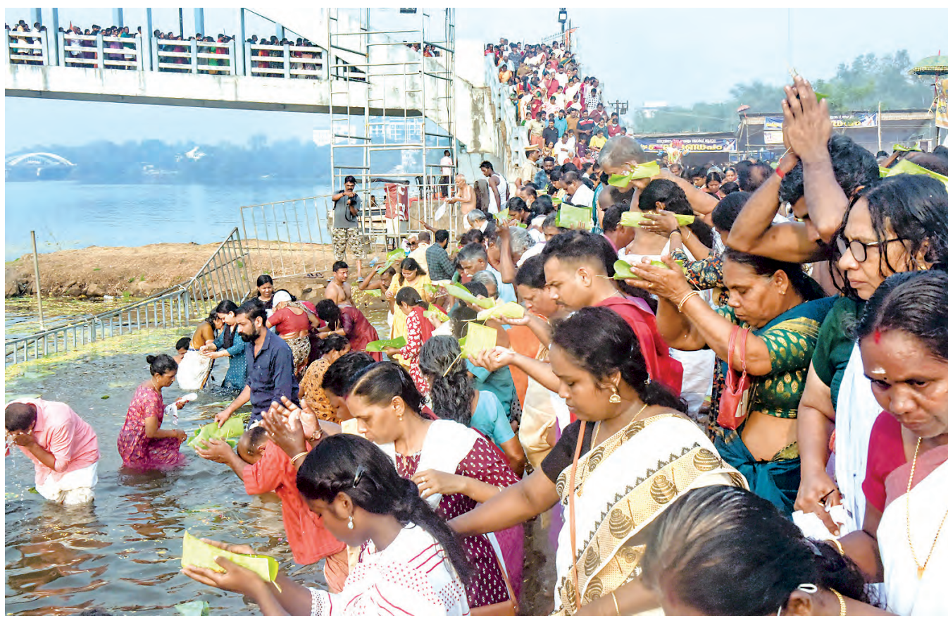
Devotees at the Aluva Shiva temple on Mahashivratri, at the bank of Periyar river, in Kochi, Saturday, March 9.