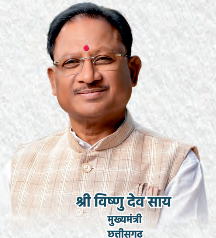
श्री विष्णु देव साय मुख्यमंत्री छत्तीसगढ़