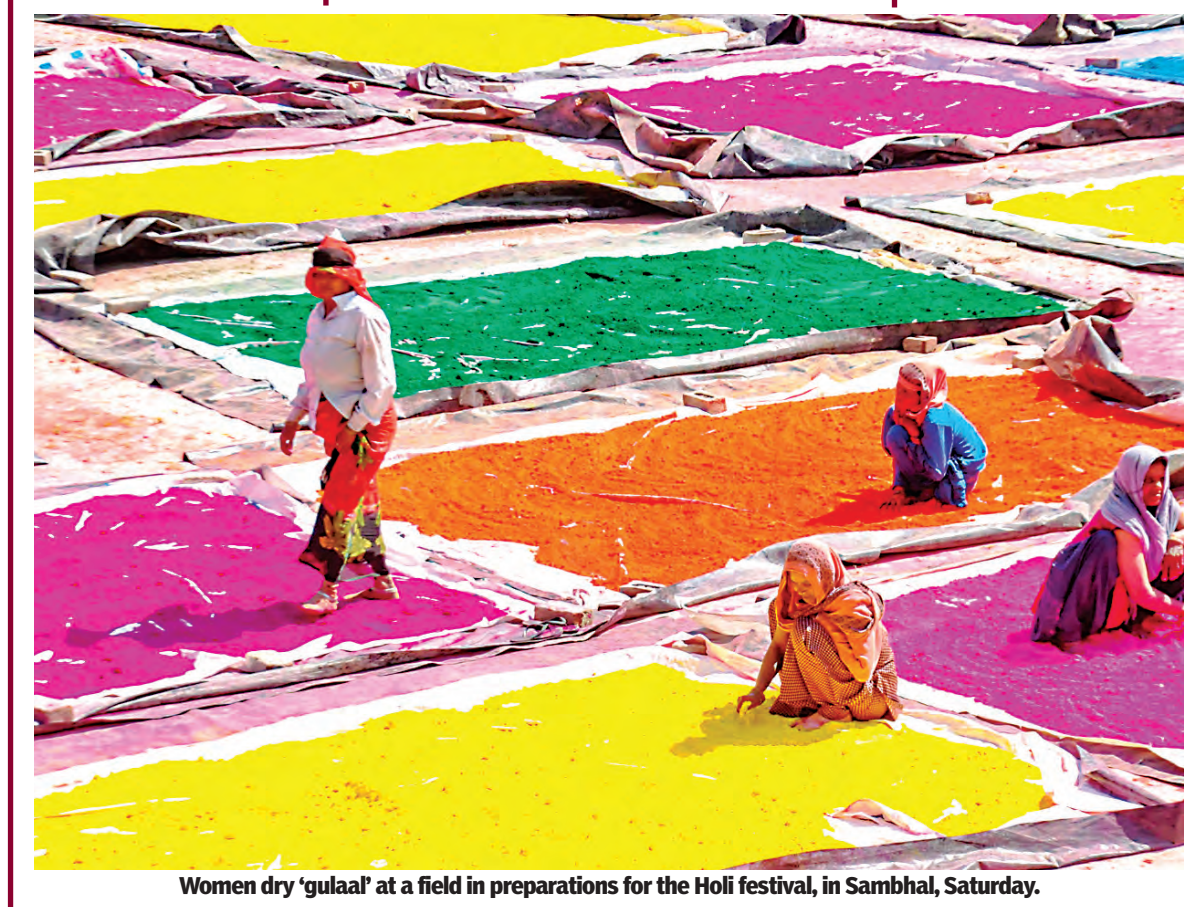
Women dry 'gulaal' at a field in preparations for the Holi festival, in Sambhal, Saturday.