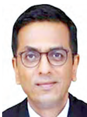
CJI D Y Chandrachud

"Dr Baba Saheb Ambedkar, as Chairman of the Drafting Committee, ensured that the Constitution promoted the values of justice, liberty and equality as well as the spirit of fraternity and dignity of the individual," he added. Justice Chandrachud said what it means to say is that "mutual brotherhood is necessary to maintain equality in the country. How will the country progress if people fight each other? Therefore, when we say