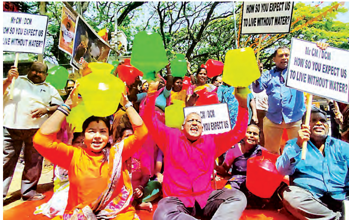
Kannada actress Tara with residents of Bharathi Nagar area stages a protest over water crisis in the city, in Bengaluru, Thursday.