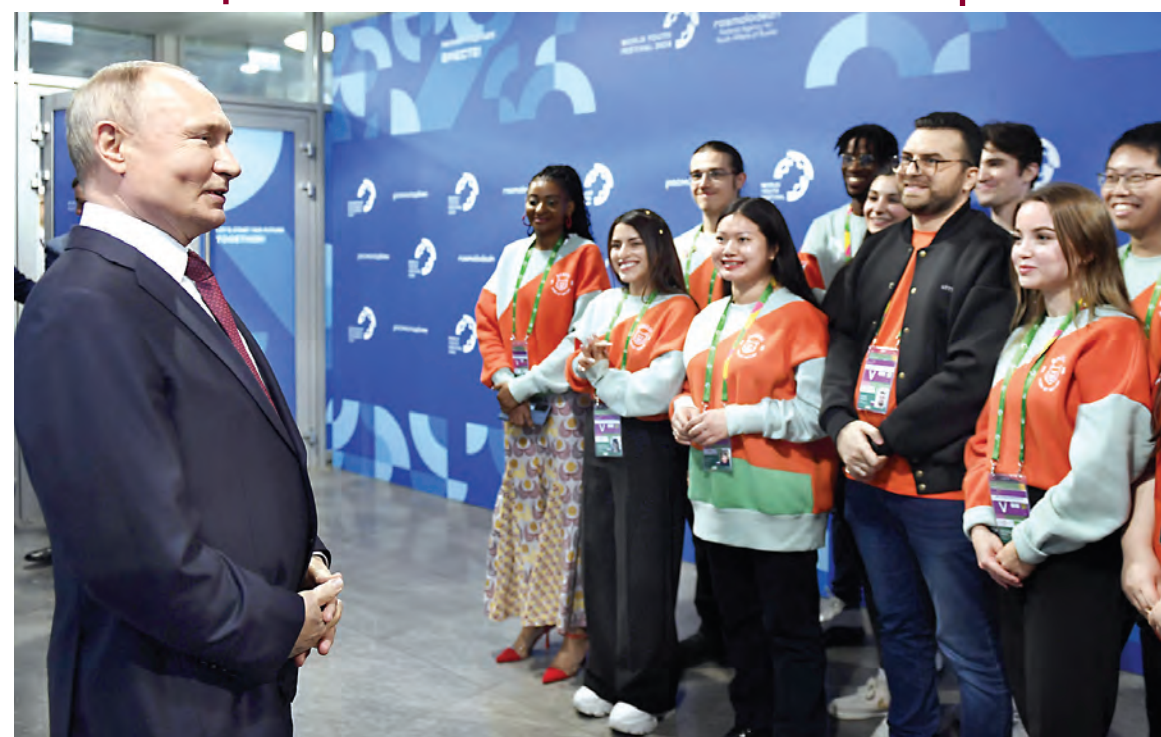
Russian President Vladimir Putin talks with foreign students studying in Russia, participants of the World Youth Festival at the Sirius Park of Science and Art outside Sochi, Russia.