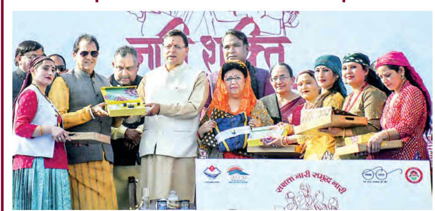
Uttkhand CM Pushkar Singh Dhami during the 'Nari Shakti Mahotsav' at Race Course, in Dehradun, Thursday.