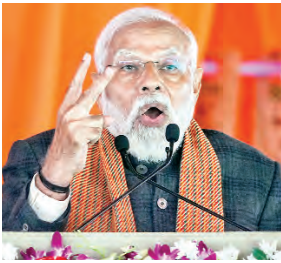
PM Modi addresses during the 'Viksit Bharat, Viksit Jammu & Kashmir' programme, in Srinagar, Thursday.

"Jammu and Kashmir is touching new heights of development after the abrogation of Article 370. Jammu and Kashmir is touching new heights of development today because it is breathing freely. Jammu and Kashmir has