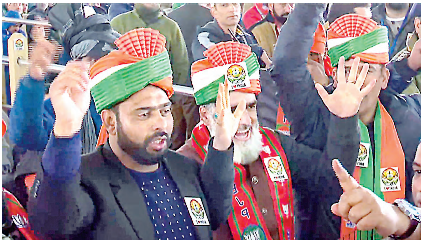
People gather at the venue of Prime Minister Narendra Modi's 'Viksit Bharat, Viksit Jammu & Kashmir' programme, in Srinagar, Thursday, March 7.