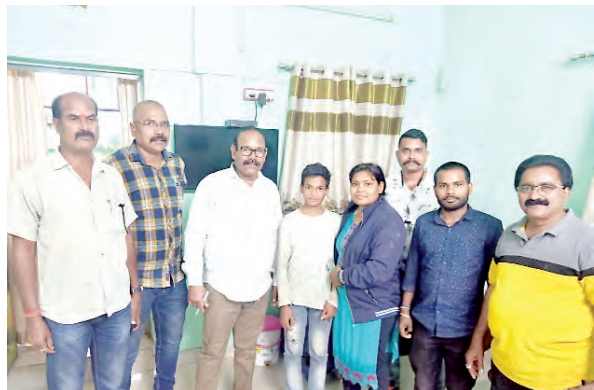
the missing child.