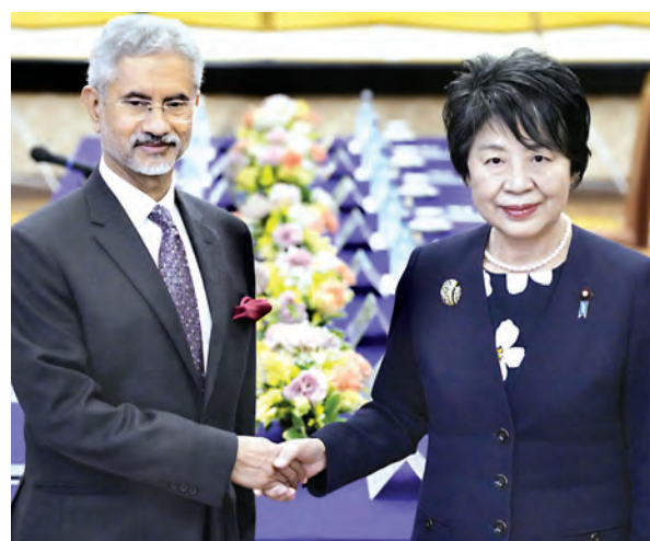
Indian Foreign Minister Subrahmanya Jaishankar, left, and his Japanese counterpart, Yoko Kamikawa, shake hands at their meeting at Iikura Guest House Thursday, March 7 in Tokyo.

Addressing the first Raisina Roundtable here, the minister called the United Nations the "most