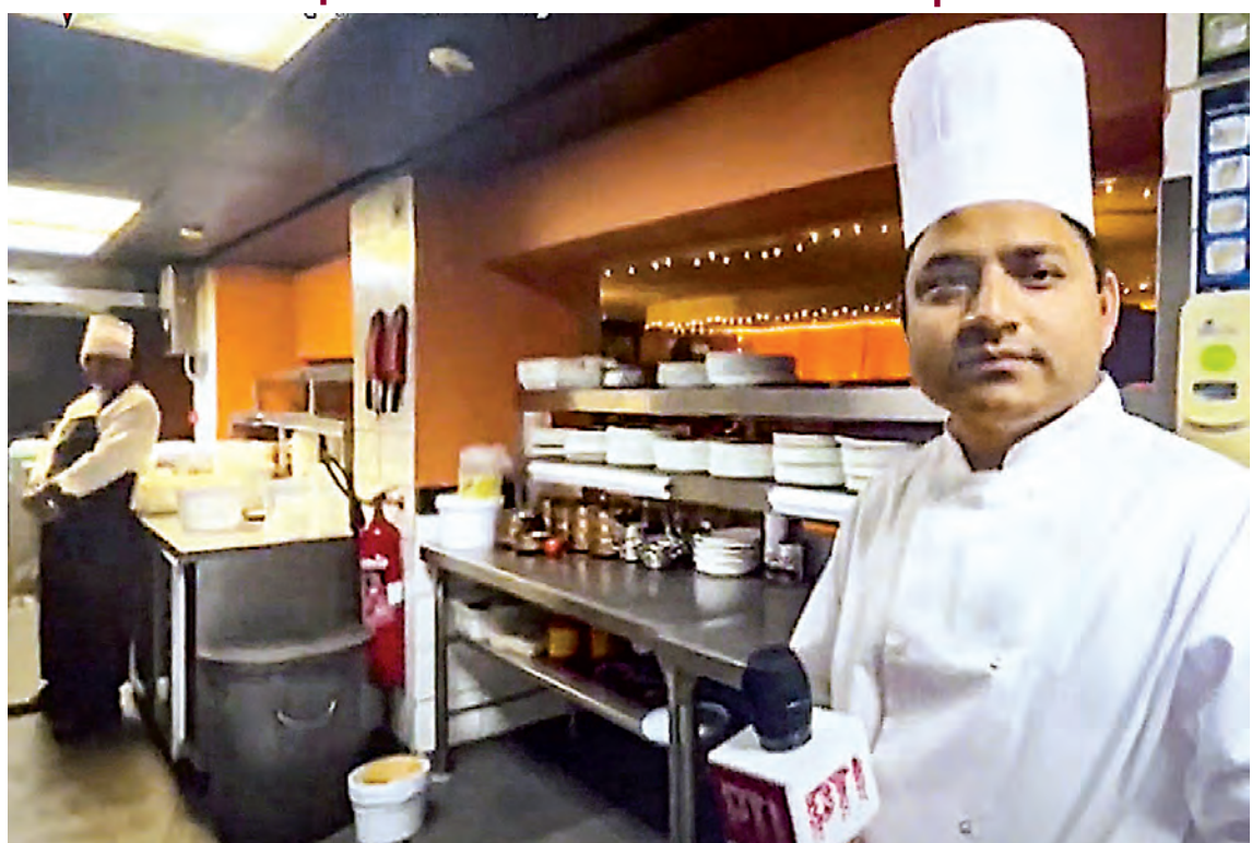
The 'Bihari Indian Restaurant' in Capetown, South Africa.