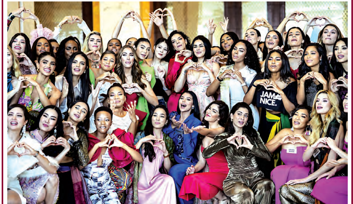
Contestants of the 71st Miss World pageant pose for photos during celebrations of International Women's Day at Jio Convention Centre, in Mumbai, Thursday, March 7, 2024.