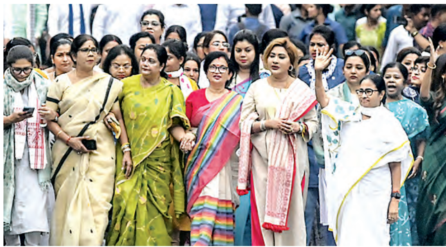
WB CM Mamata Banerjee participates in a rally on the eve of International Women's Day, in Kolkata, Thursday.

Addressing people after leading a rally in Kolkata for women's rights, she said, "Many have given fake sandesh (message) on Sandeshkhali. The way a few incidents were shown is reprehensible. Some incidents may have happened and they have not reached us. But when we get to know something, we take action. I don't hesitate to arrest TMC workers if they are at fault."