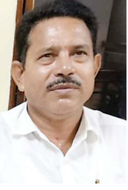
Paradip, Mar 13: