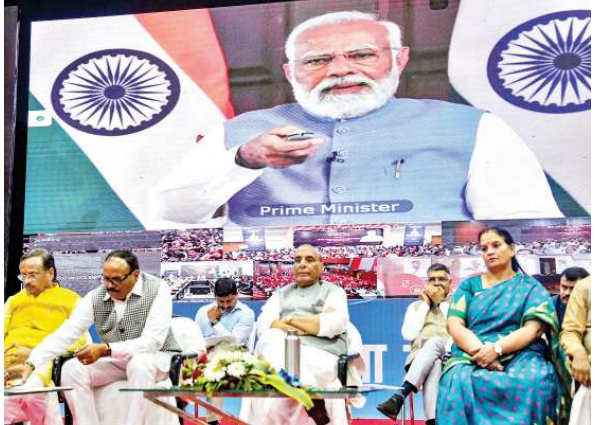
PM Modi virtually launches PM-SURAJ national portal in the presence of Union Defence Minister Rajnath Singh and others, in Lucknow, Wednesday.

Prime Minister Narendra Modi said on Wednesday that people from disadvantaged sections like SCs, STs and OBCs are the biggest beneficiaries of his government's welfare schemes as he accused the previous Congress dispensations of neglecting them and never appreciating their role in the country's progress. Speaking at the launch of the PM-SURAJ national portal, he cited the election of Ram Nath Kovind and Droupadi Murumu, who come from Dalit and tribal communities respectively, as president to assert that the BJP's efforts to ensure that those from deprived sections reach top positions will continue. The opposi-