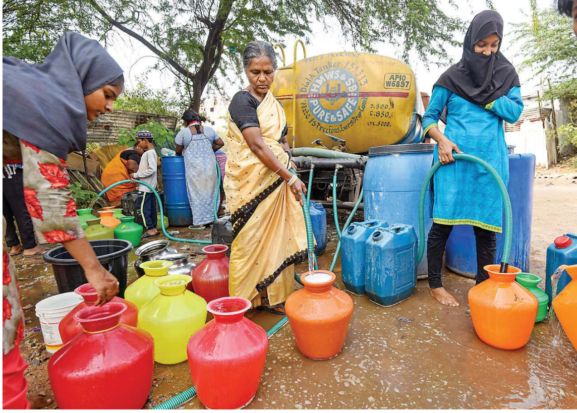
Locals collect free water from a government water supply tanker amid the ongoing water crisis, in Hyderabad, Wednesday.