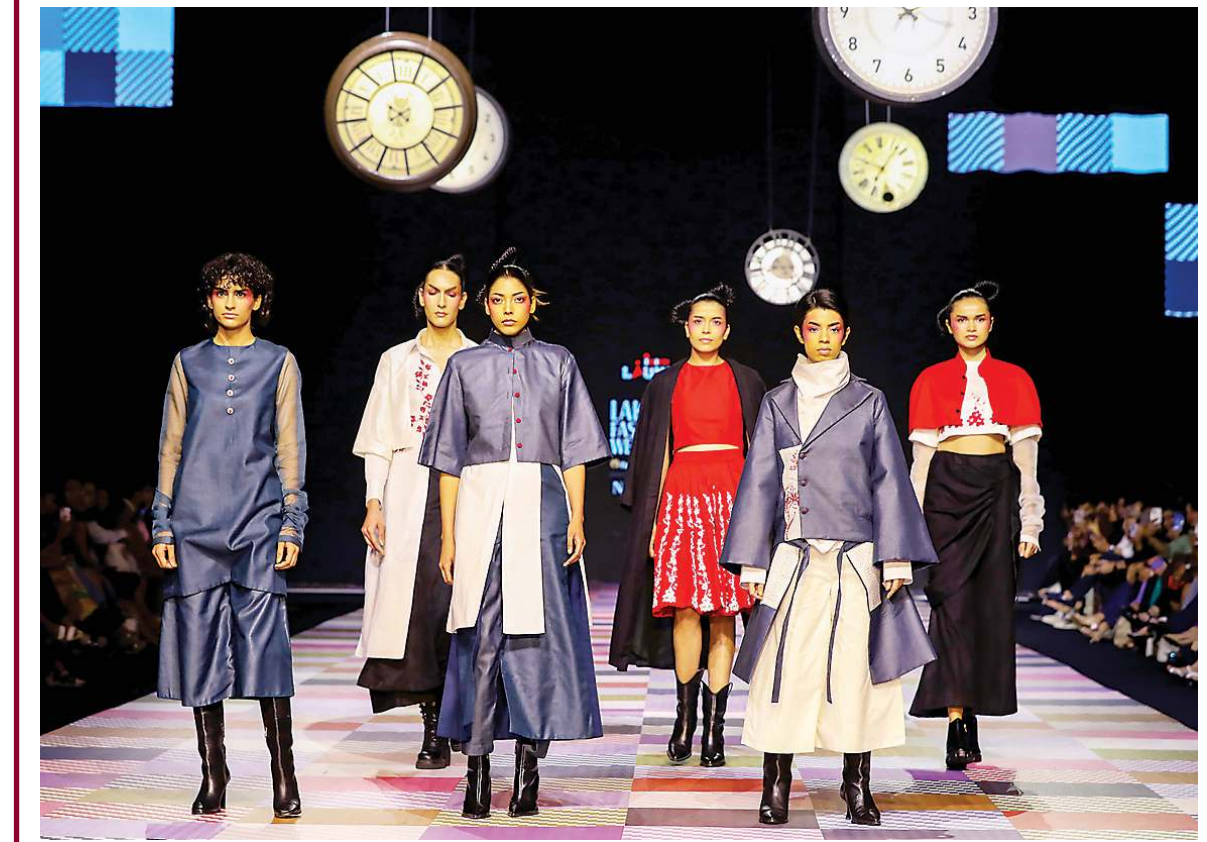
Models walk the ramp presenting the creations of the students of Inter National Institute of Fashion Design (INIFD) during the Fashion Design Council of India (FDCI) X Lakme Fashion Week (LFW), in Mumbai, Wednesday, March 13.