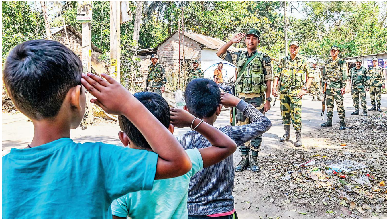
Children salute armed forces personnel during a confidence building march ahead of Lok Sabha polls, in Nadia, Wednesday, March 13.