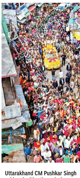
Uttarakhand CM Pushkar Singh Dhami with others during a roadshow at Gopeshwar, in Chamoli district.

Seat sharing ■ New Delhi: LJP (Ram Vilas) chief Chirag Paswan on Wednesday said his party has finalised a seat-sharing formula with the BJP for the Lok Sabha polls. Paswan announced this after a meeting with BJP chief J P Nadda here. "All my concerns have been addressed by the BJP. I am satisfied," he told reporters.