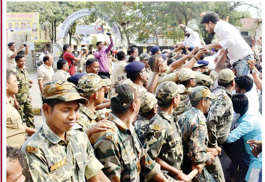
Congmen staged massive demonstration outside the IT office to protest against seizure of account of Congmen accused in scams in the state.