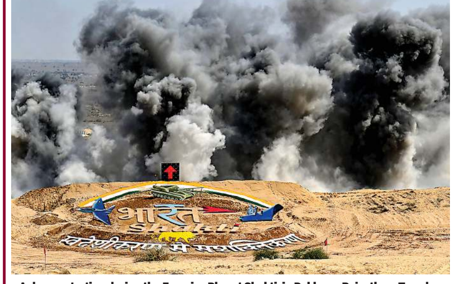
A demonstration during the Exercise Bharat Shakti, in Pokhran, Rajasthan, Tuesday.