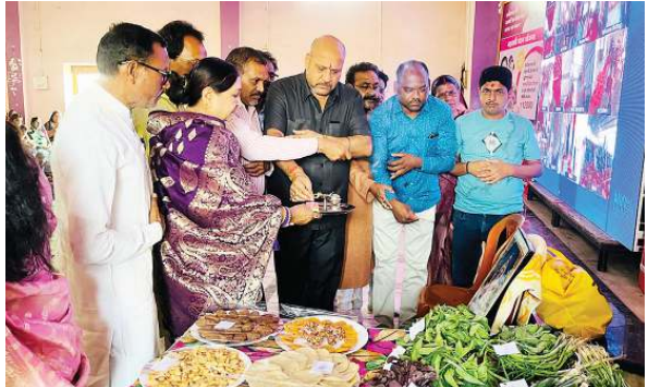
Simga, Mar 12:

Mahatari Vandan Sammelan was organized under "Mukhyamantri Mahatari Vandan Yojana" at Community Building in Simga Nagar Development Block, which was attended by a large number of women and public representatives. The above program started with lamp lighting and Saraswati Vandana and the enthusiasm of all the women was boosted by sharing the blessing and the first instalment of Mahatari Vandan by the Chief Minister and Prime