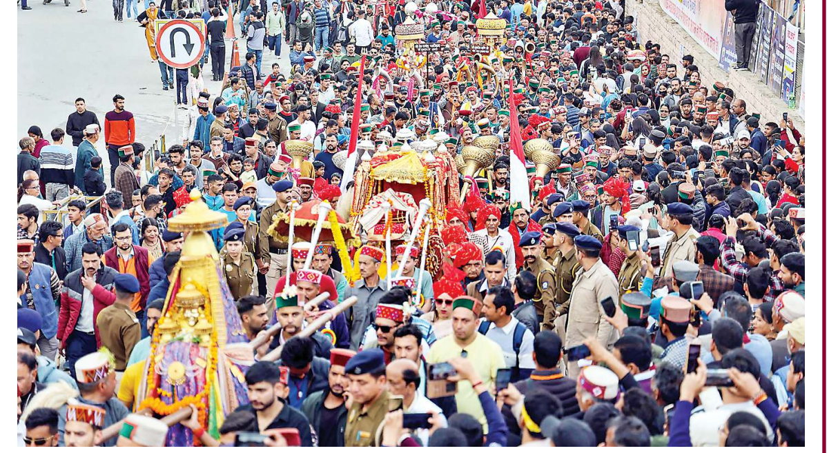
Devotees participate in a procession during the annual Mandi Shivaratri Fair, in Mandi, Tuesday.