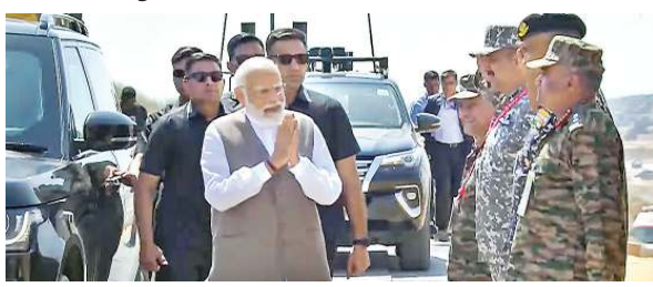
Prime Minister Narendra Modi arrives to witness the Exercise Bharat Shakti, in Pokhran, Rajasthan, Tuesday.

The integrated tri-service firepower and manoeuvre exercise was held for about 50 minutes at the Pokhran field firing range where