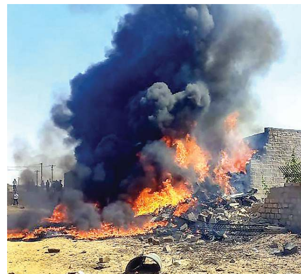
A Tejas aircraft of the Indian Air Force (IAF) in flames after it crashed during an operational training sortie, near Jaisalmer, Tuesday.

A Tejas light combat aircraft (LCA) of the Indian Air Force crashed near a residential colony in Jaisalmer on Tuesday during an operational training sortie, the first such incident involving the indigenously-built jet since its induction around eight years back. There were no casualties. The pilot ejected safely and a court of inquiry has been ordered to ascertain the cause of the accident, the IAF said in a brief statement.