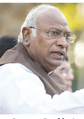
Congress President Mallikarjun Kharge addresses a press conference at his residence, in New Delhi, Tuesday.

Congress president Mallikarjun Kharge on Tuesday asserted the party's 'Adivasi Sankalp' will ensure that the rights of tribals as well as their 'zameen, jungle and jal' are protected. Addressing a press conference at his residence here, Kharge said former party chief Rahul Gandhi has announced the party's guarantee for the welfare and well-being of the tribal communities in Maharashtra's Nandurbar. Hailing the party's 'Adivasi Sankalp', Kharge said ensuring justice for tribals is the party's primary responsibility. "They are being harassed, their land is being taken away, they are made to work as bonded labour. We will ensure, through this guarantee, to free them from all this," he said. Kharge said the Congress is committed to protect the tribals, 'jal, jungle and zameen'. In a post on X later, Kharge said a national mission will be set up for the effective im-