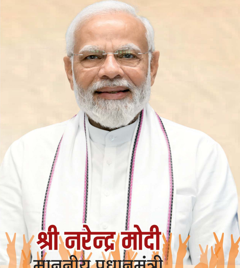
श्री नरेन्द्र मोदी माननीय प्रधानमंत्री