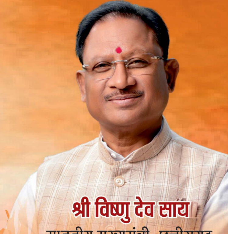
श्री विष्णु देव सायं माननीय मुख्यमंत्री, छत्तीसगढ़