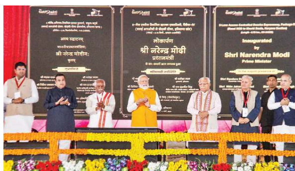
Prime Minister Narendra Modi with Haryana Governor Bandaru Dattatreya, Union Minister for Road Transport & Highways Nitin Gadkari and Haryana Chief Minister Manohar Lal Khattar during the launch of various national highway projects, in Gurugram, Monday, March 11.

Gurugram (Haryana), Mar 11: Prime Minister Narendra Modi on Monday said the speed of implementation of infrastructure projects will be accelerated manifold in the next five years to make India the third largest economy in the world. Modi said he has inaugurated and laid the foundation of projects worth Rs 10 lakh crore so far this calendar year and added that he is running short of time for inaugurating projects. He was addressing a gathering after inaugurating and laying the foundation stone for 114 National Highway projects across the country worth about Rs 1 lakh crore. Among key National Highway (NH) projects, Modi inaugurated the Haryana section of the landmark Dwarka Expressway. Modi took a dig at Congress, say-