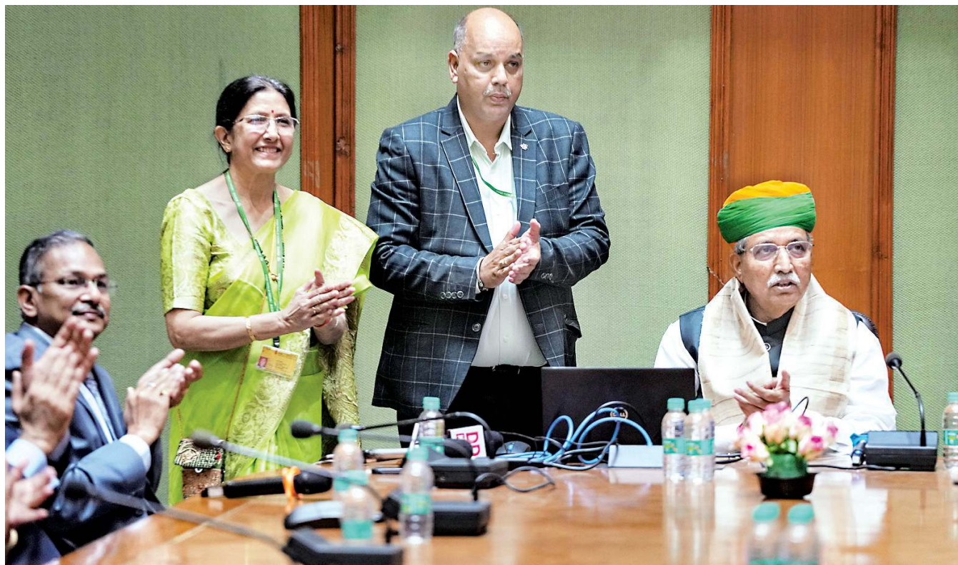
Minister of State for Parliamentary Affairs & Culture Arjun Ram Meghwal launches the digital exhibition "Subhash Abhinandan", based on the life of Subhash Chandra Bose, on 134th Foundation Day of National Archives of India, in New Delhi, Monday, March 11.