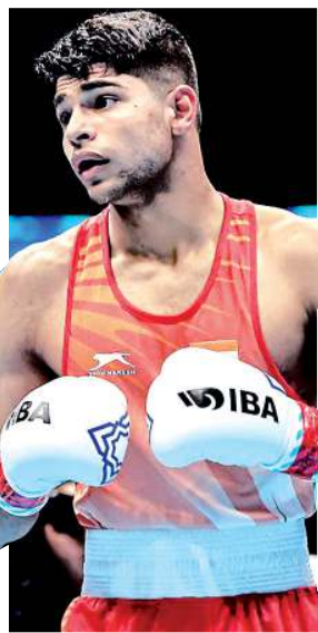
only Indian boxer out of the nine-member contingent who is still in the fray for a quota.