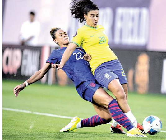
United States' Trinity Rodman, left, battles Brazil's Duda for the ball during the second half of the CONCACAF Gold Cup women's soccer tournament final match.

Horan scored just moments into stoppage time with a header off a well-placed lofted pass from Emily Fox. It was Horan's third goal of the tournament, her earlier goals were from the penalty spot. Lynn Williams nearly scored a second for the United States in the 79th minute but the play was offside. Casey Krueger headed out a dangerous Brazilian cross in the final moments. The United States was stunned in the group stage of the tournament