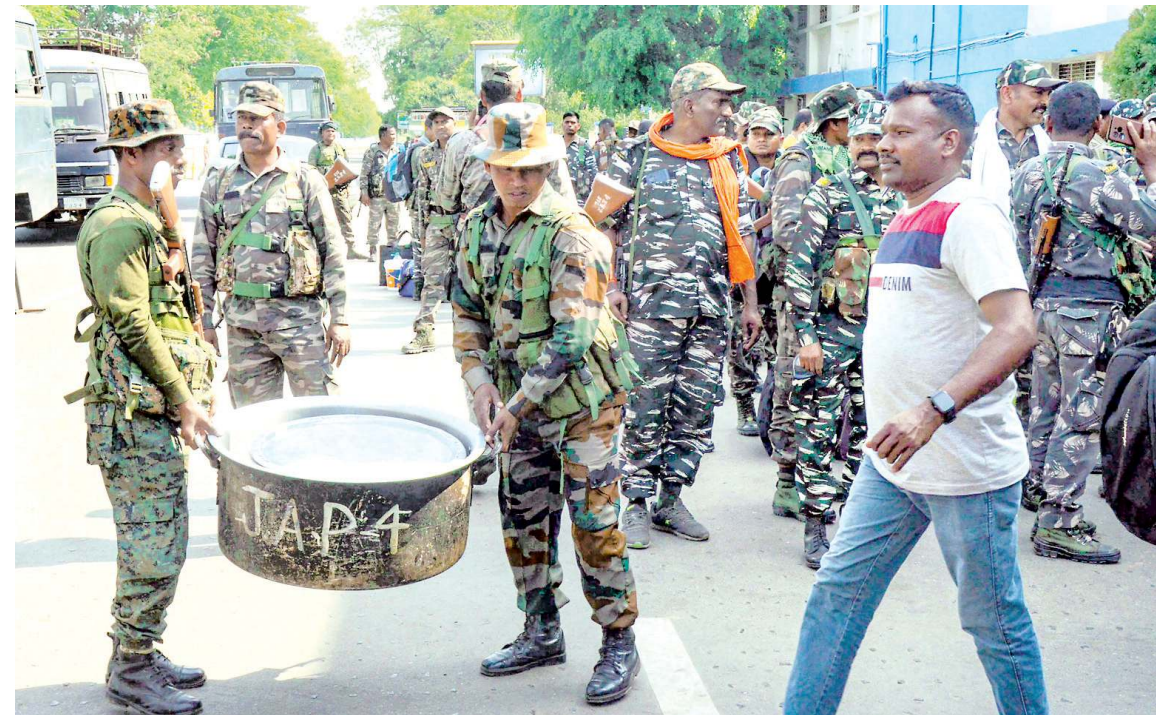
Paramilitary forces personnel arrive at Hatia Railway station ahead of the Lok Sabha elections, in Ranchi, Friday.