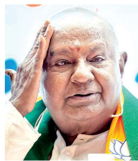
JD(S) supremo H D Devegowda during the BJP-JD(S) Co-ordination meeting, in Bengaluru, Friday.

"Our opponents are so strong. Don't think that we are going to win all the 28 seats unless and until we forget what all had happened in the past and our differences," the 91-year-old said at a coordination meeting of the two parties here.