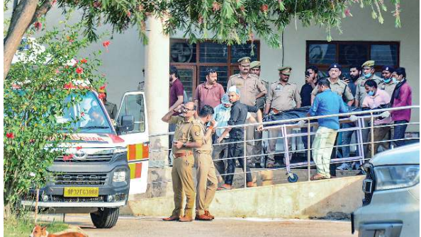
Mortal remains of the jailed gangster-turned-politician Mukhtar Ansari being taken to an ambulance before leaving for his native place in Ghazipur, from a hospital in Banda, Friday.