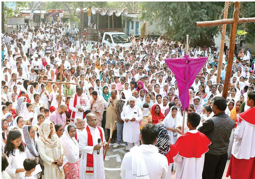
Christians attended the Church Services on Good Friday which commemorates the crucifixion and death of Jesus Christ on the cross. It is a day of reflection and reverence, often observed with fasting, prayer services, and church services that recount the events of Jesus's Passion.