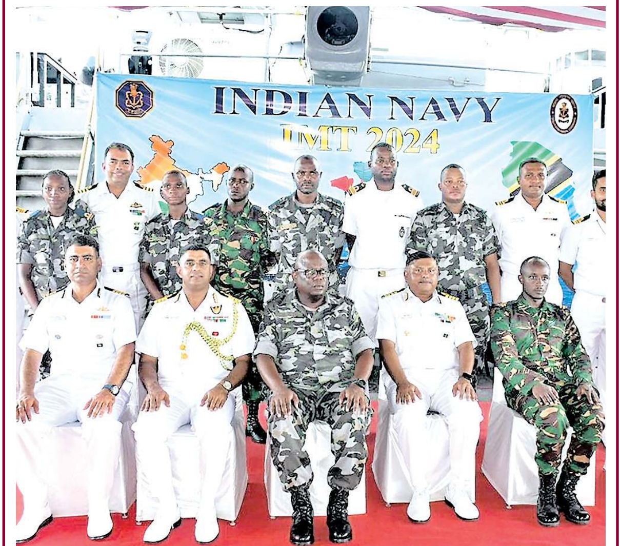
Navy officers with their counterparts from Tanzania and Mozambique at the conclusion of IMT TRILAT-24, a tri-lateral exercise between countries, in Nacla, Mozambique.