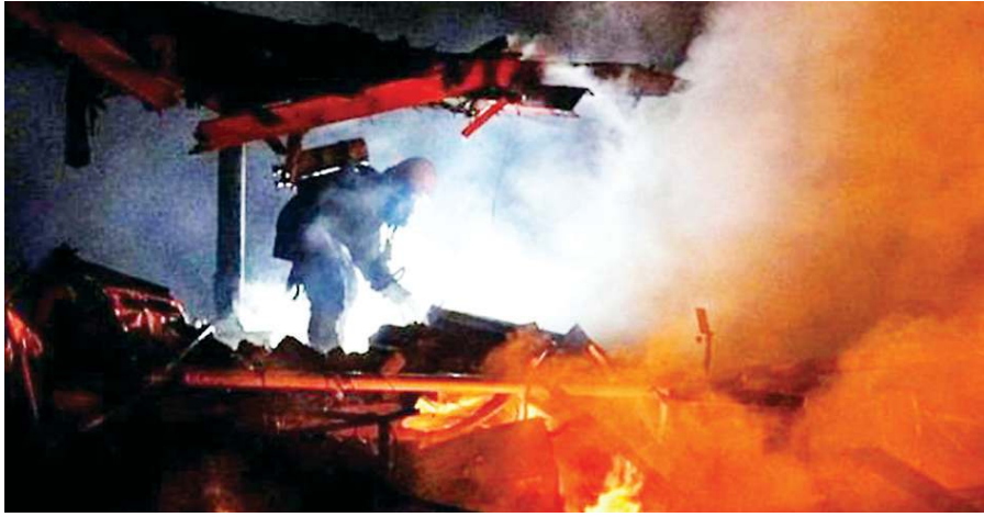
Kyiv, Mar 29 (AP):

Moscow launched a large-scale attack on Ukraine's energy infrastructure Friday, with a mass barrage of 99 drones and missiles hitting regions across the country, Ukraine's armed forces said.