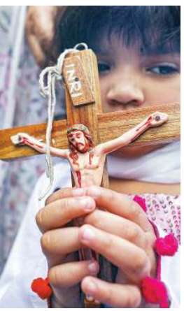
A Christian devotee during commemoration of the Good Friday, in Jammu.