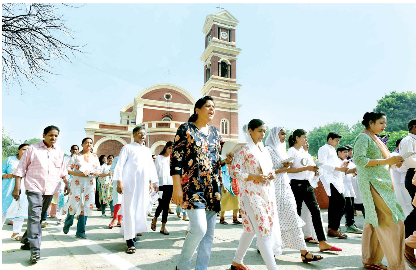
Christian devotees take part in a religious procession on the occasion of 'Good Friday' at St. Joseph's Cathedral Church, in Prayagraj, Friday, March 29.