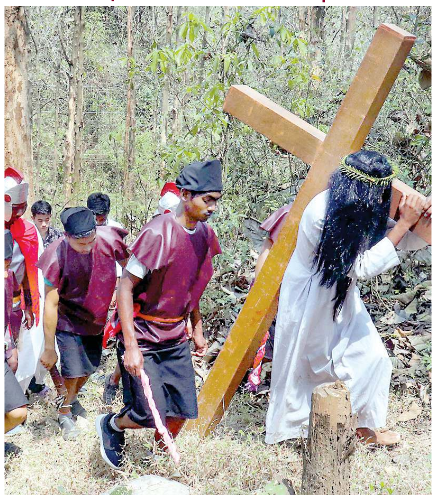
Christians re-enact crucifixion of Lord Jesus to commemorate Good Friday at Kharghuli, in Guwahati, Friday.