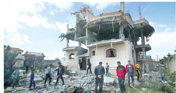
gent groups on civilians suburbs. It did not give targets in Aleppo and its suburbs. It did not give an exact numbers for the

Syrian state media quoted an unnamed military official as saying that the Israeli strikes coincided with drone attacks by Syrian insur-