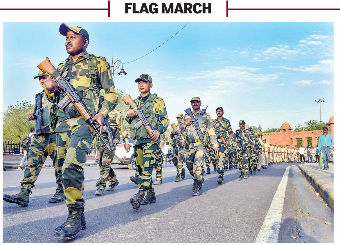
BSF and Police personnel march past during a flag march ahead of the upcoming Lok Sabha election, in Bikaner, Friday.

la, the RJD has also wrested from the Congress Purnia, a seat the latter has been contesting in the past few Lok Sabha polls. Recently, Lalu Prasad, the RJD president, gave party ticket for the seat to JD(U) turncoat Bima Bharti, stopping short of making a formal announcement. The Congress had last week inducted Pappu Yadav, a three-term former MP from Purnea, whose wife is also a Rajya Sabha MP of the party. Yadav had been hopeful of getting the ticket from the seat claiming that an assurance to the effect was given to him by Rahul Gandhi and Priyanka Gandhi.