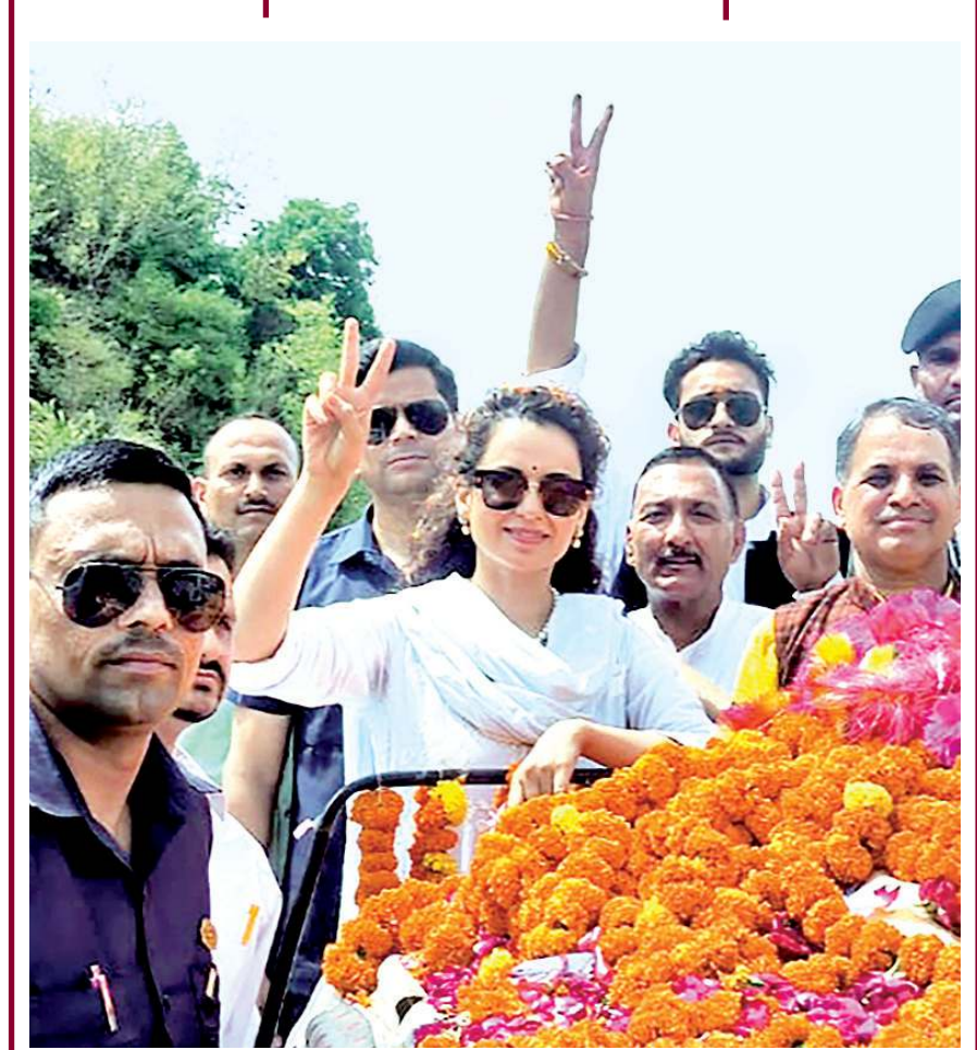
BJP candidate actor Kangana Ranaut during a roadshow ahead of Lok Sabha elections, in Mandi.