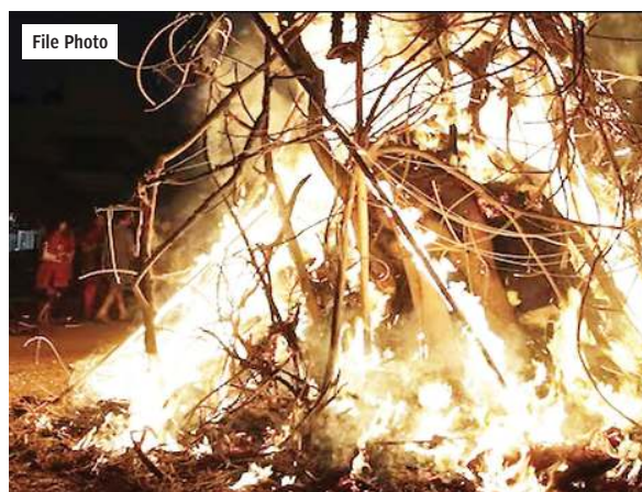
Arang, Mar 22:

Cholera epidemic spurs unique ritual in Ratakak village