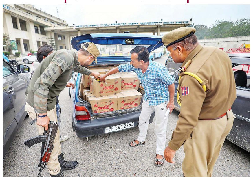
Police personnel check a vehicle at Lakhanpur border, ahead of the upcoming Lok Sabha election, in Kathua district.