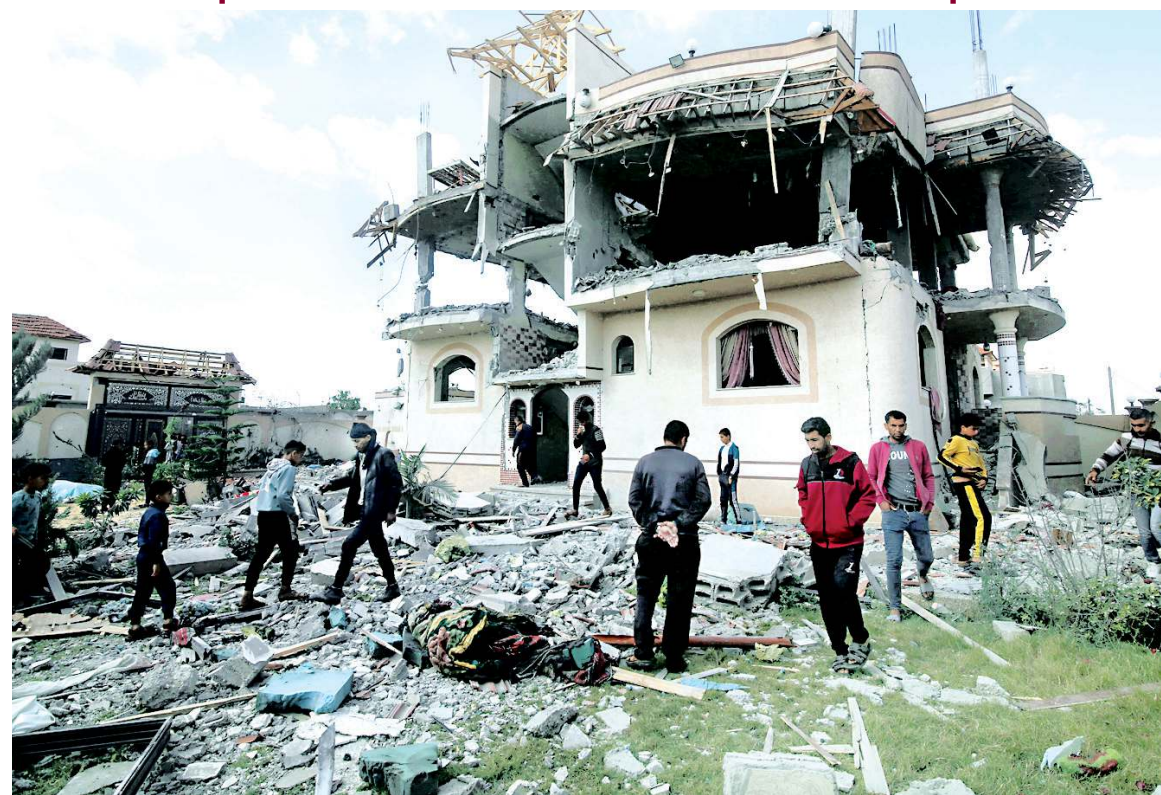
Palestinians look at a house destroyed in an Israeli airstrike, in Khan Younis, Friday, March 22.