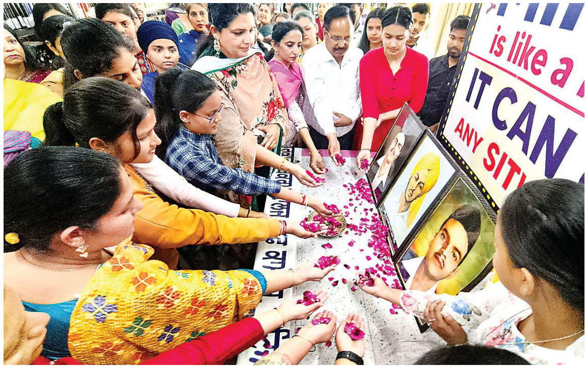
College teachers and students pay tribute to Shaheed Bhagat Singh, Rajguru and Shukhdev on the eve of their martyrdom day, at Government Bikram College of Commerce in Patiala, Friday