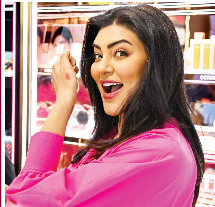
Actor Sushmita Sen during the launch of a Shopper Stop Beauty store, in Kolkata.