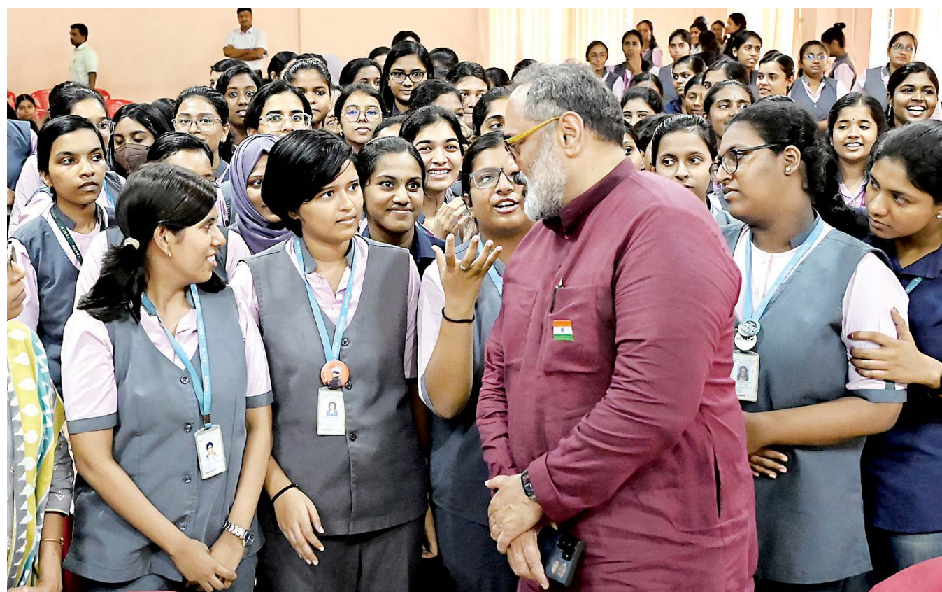
Union Minister & BJP candidate Rajeev Chandrasekhar interacts with the students of LBS Institute of Technology for Women during his election campaign ahead of upcoming Lok Sabha Polls, in Thiruvananthapuram, Friday, March 22.