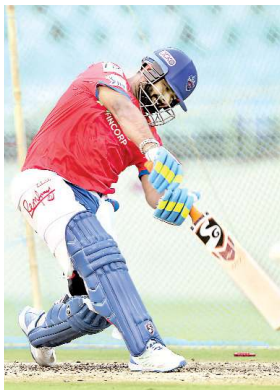
ing forward to playing my first game tomorrow," Pant said ahead of his team's first match of the season. The

Chandigarh: Rishabh Pant is experiencing an entire gamut of emotions from nervousness to excitement as he gears up for his first competitive game in nearly 15 months when he leads Delhi Capitals in their IPL opener against Punjab Kings here on Saturday. Coming back after a painstakingly long rehab following a horrific car crash in December, 2022, Pant feels grateful to be back on the 22-yard strip. "Jittery, nervous, excited...all of it, but at the same time, just happy, being able to come back to professional cricket. I'm just look-