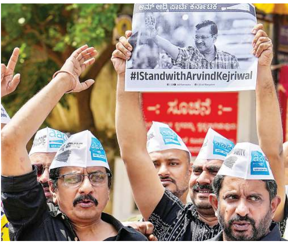
Aam Adami Party workers and leader raise slogans during a protest against the arrest of Delhi CM Arvind Kejriwal, in Bengaluru, Friday.

He demanded Rs 100 crore from some accused from the 'South group' for contesting the Punjab elec-