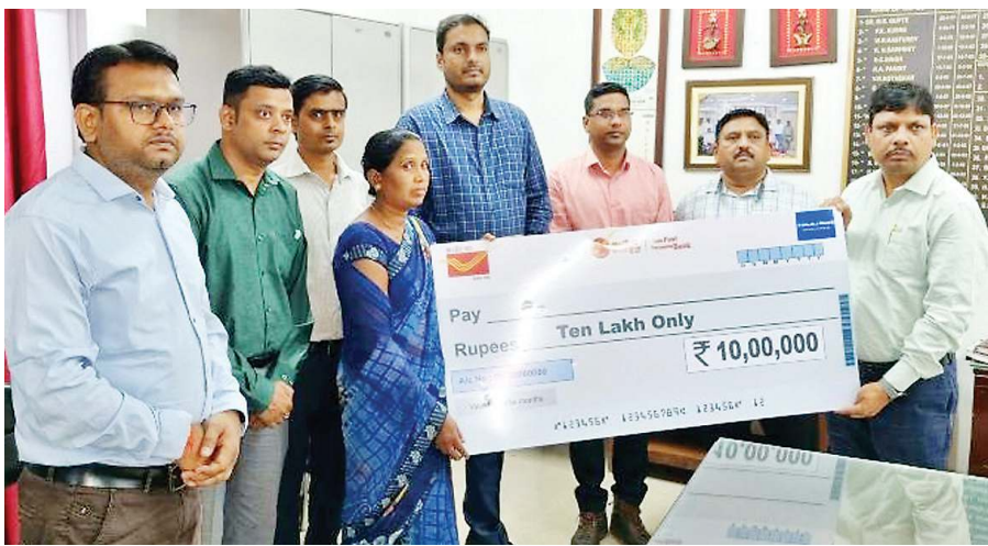
Pithora, Mar 22:

The Indian Postal Department, renowned for its extensive reach and commitment to financial inclusion, continues to serve as a beacon of reliability and support for the Indian populace. Not only does it facilitate essential postal services, but it also extends a helping hand