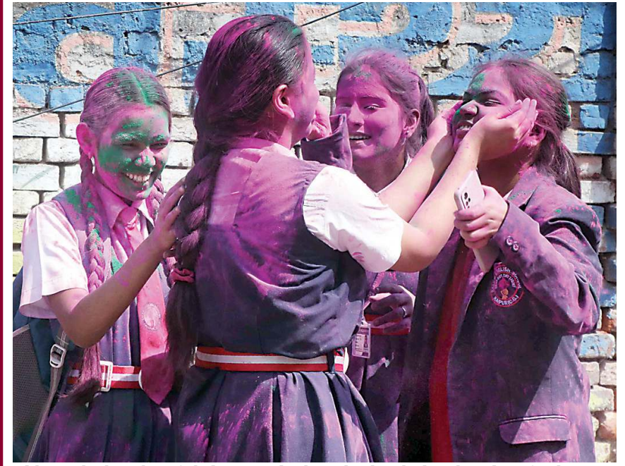
Girls on the last day of their exams in the School, enjoying throwing of colours on each other as pre-Holi celebrations here on Friday.