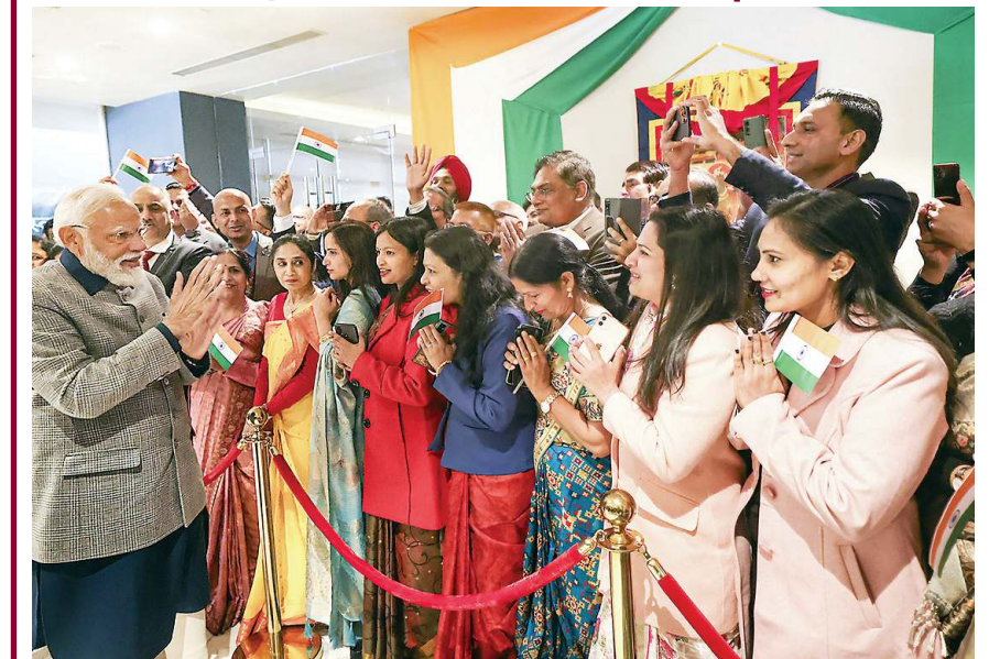
Prime Minister Narendra Modi being welcomed on his arrival, in Thimphu, Friday, March 22.