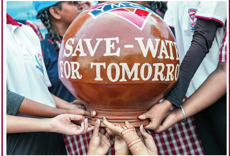
Students hold a pot during an event to mark the 'World Water Day' in Bengaluru, Friday.