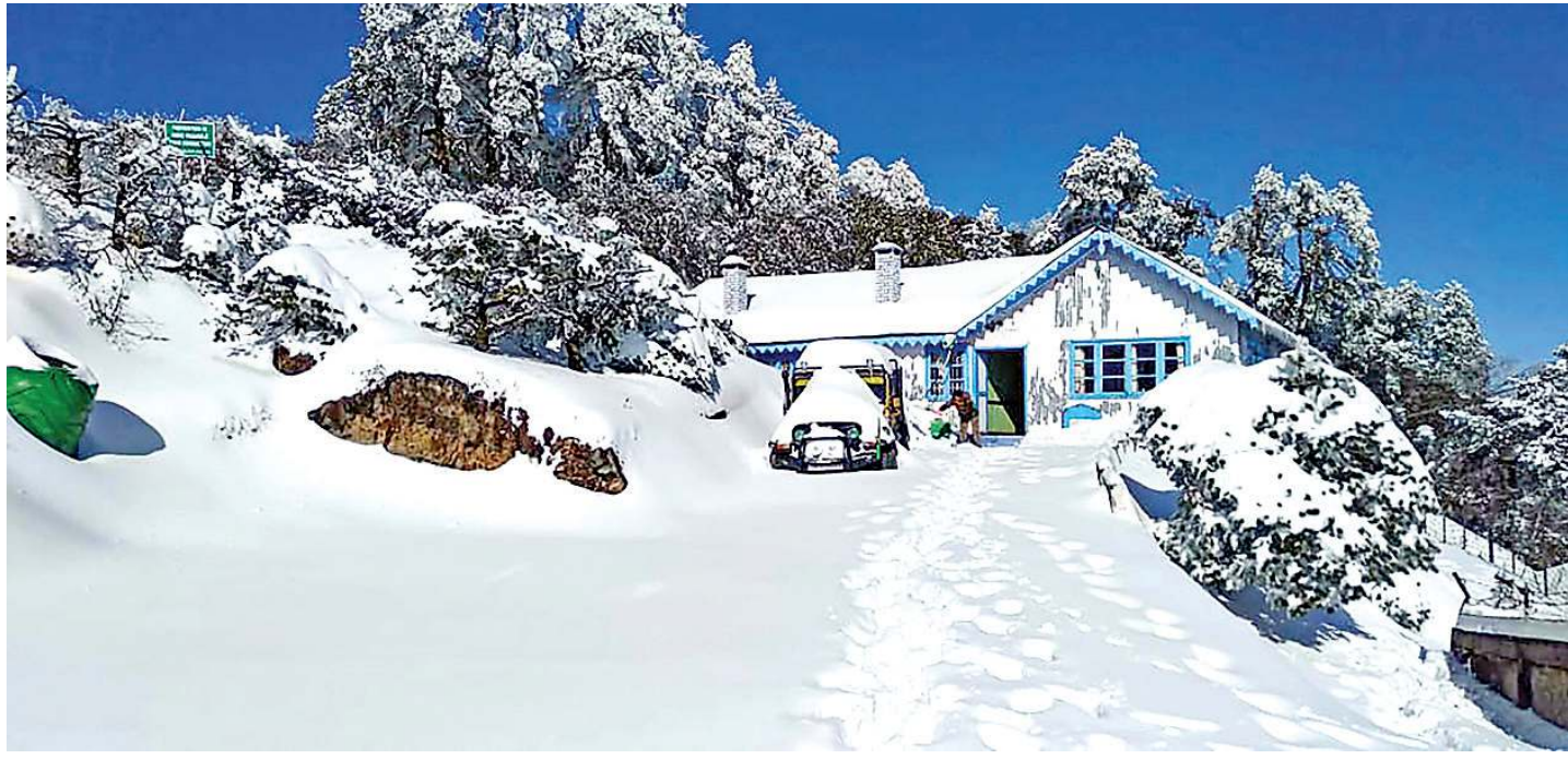
Sandakphu after being hit by heavy snowfall, in Darjeeling district, Friday.