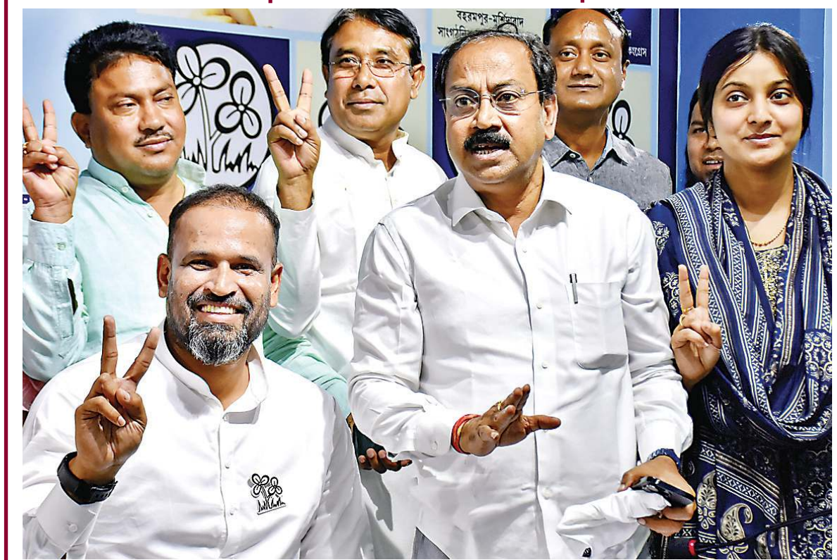
Former cricketer and TMC candidate Yusuf Pathan flashes victory sign with party leaders at the party office at Berhampore, in Murshidabad district of West Bengal, Friday.