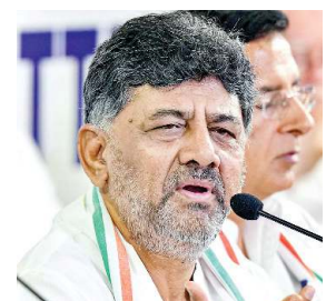
Karnataka Dy CM D K Shivakumar during a press conference at KPCC office, in Bengaluru, Friday.