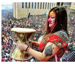
Devotees take part in 'Bhasma' or 'Masan' Holi celebration at the Manikarnika Ghat crematorium, in Varanasi, Thursday.