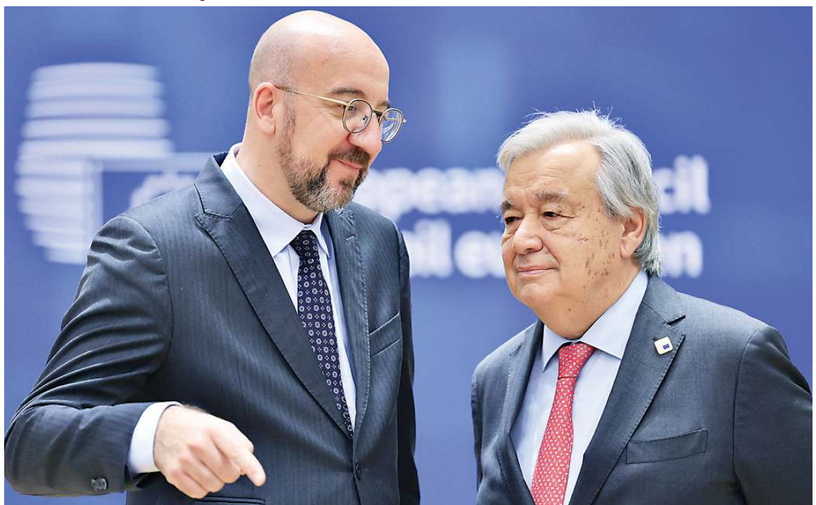
European Council President Charles Michel, left, speaks with United Nations Secretary General Antonio Guterres during a round table meeting at an EU Summit in Brussels, Thursday, March 21.