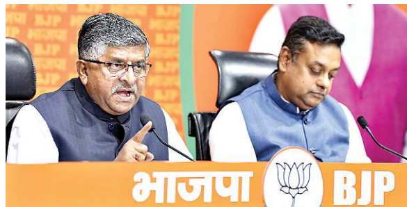
BJP leaders Ravi Shankar Prasad and Sambit Patra address a press conference at party headquarters, in New Delhi, Thursday.

BJP leader and former Union minister Ravi Shankar Prasad charged former Congress president Rahul Gandhi with lying and also targeted Sonia Gandhi, saying