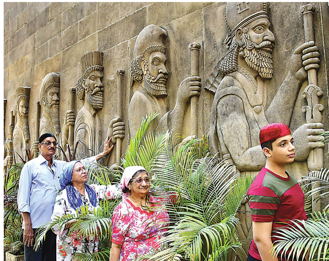
Parsi community members visit a fire temple on the occasion of 'Navroz', the Parsi New Year, at Kappawala Agiary in Mumbai, Thursday.