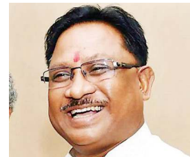
Vishnu Deo Sai

Asked about Baghel claiming he was being implicated in the Mahadev