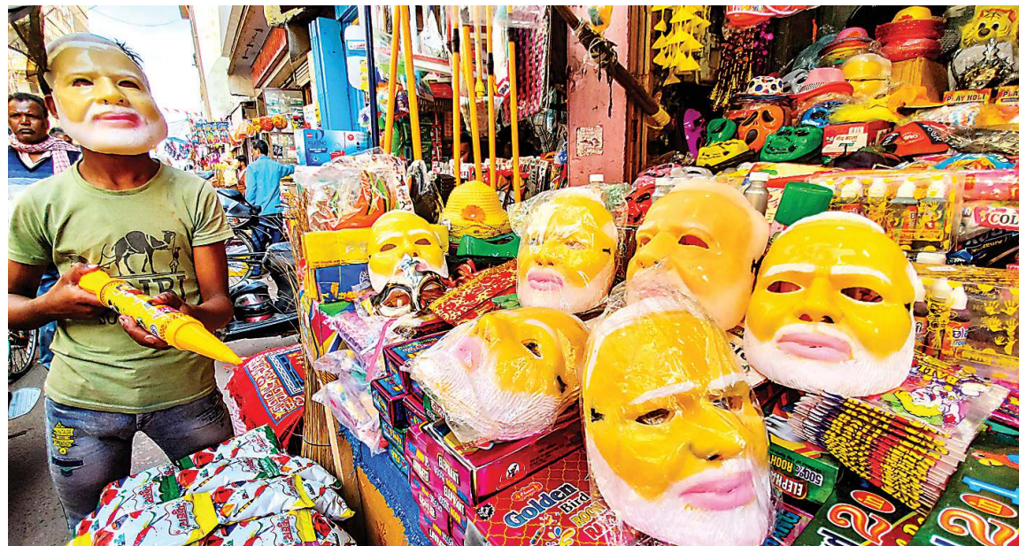
A vendor sells Modi-masks and water guns for the festival of Holi at Lohar Gali, in Agra, Thursday.