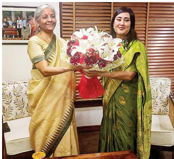
Finance Minister Nirmala Sitharaman with BJP leader Bansuri Swaraj during a meeting, in New Delhi, Thursday, March 21.

BJP's Lok Sabha candidate from New Delhi constituency Bansuri Swaraj on Thursday called on Union Finance Minister Nirmala Sitharaman.