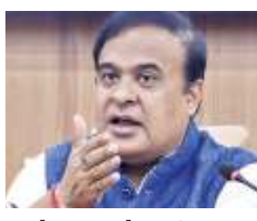
Himanta Biswa Sarma

"Therefore, there is no point in voting for the Congress. Besides, barring one candidate, I can bring all others contesting from the party to BJP", Sarma