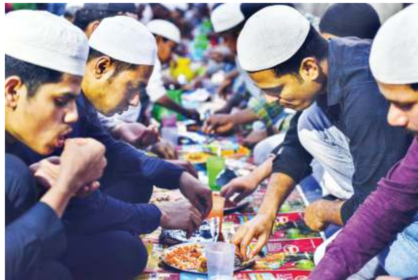
Muslim devotees break their fast at Iftar during the holy month of Ramadan, in Jalandhar, Monday.