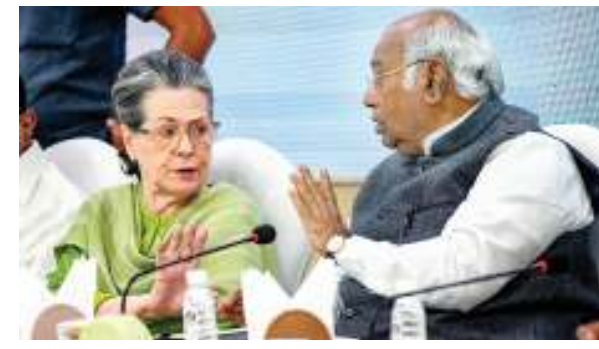
Congress President Mallikarjun Kharge with party leader Sonia Gandhi during the 'CWC Meeting' at AICC headquarters, in New Delhi, Tuesday.

Addressing a press conference after the CWC meeting, party leaders K C Venugopal and Jai Ram Ramesh said the CWC has