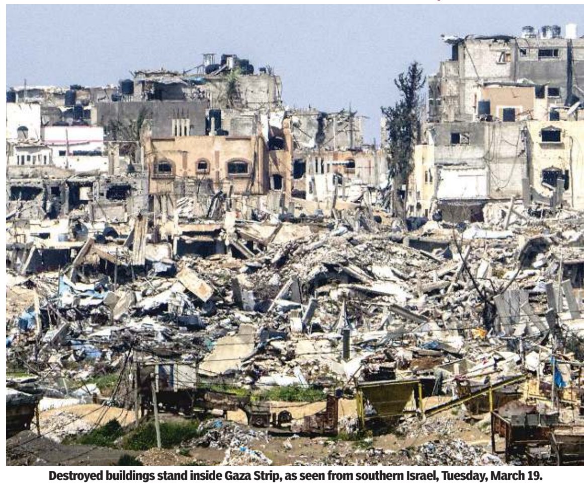
Destroyed buildings stand inside Gaza Strip, as seen from southern Israel, Tuesday, March 19.