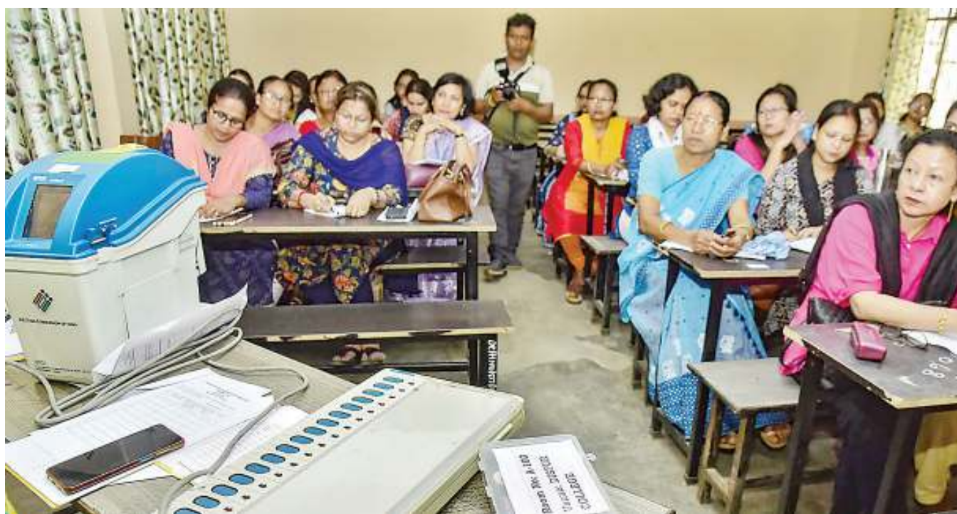
Polling officials during a training programme to learn the functioning of Electronic Voting Machine (EVM) and Voter Verifiable Paper Audit Trail (VVPAT), ahead of Lok Sabha elections, in Guwahati, Tuesday, March 19.