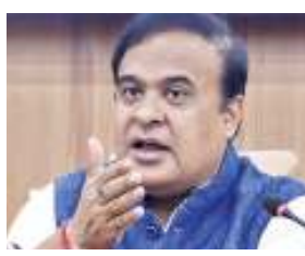
Himanta Biswa Sarma

"Therefore, there is no point in voting for the Congress. Besides, barring one candidate, I can bring all others contesting from the party to BJP", Sarma