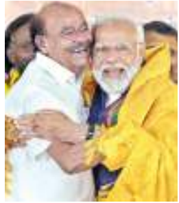
PM Modi with PMK founder S. Ramadoss during a public meeting ahead of Lok Sabha elections, in Salem, Tamil Nadu, Tuesday.