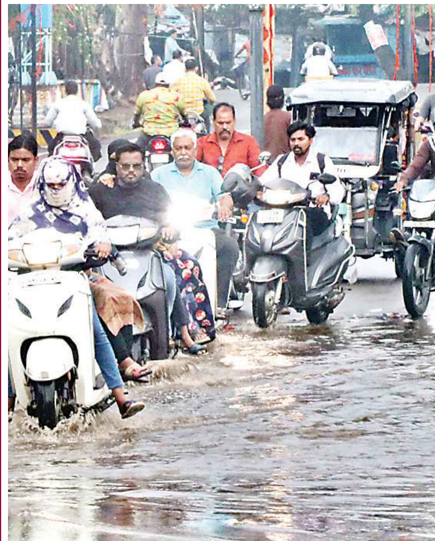
Light to medium showers in city since morning left few places with water logging here on Tuesday.