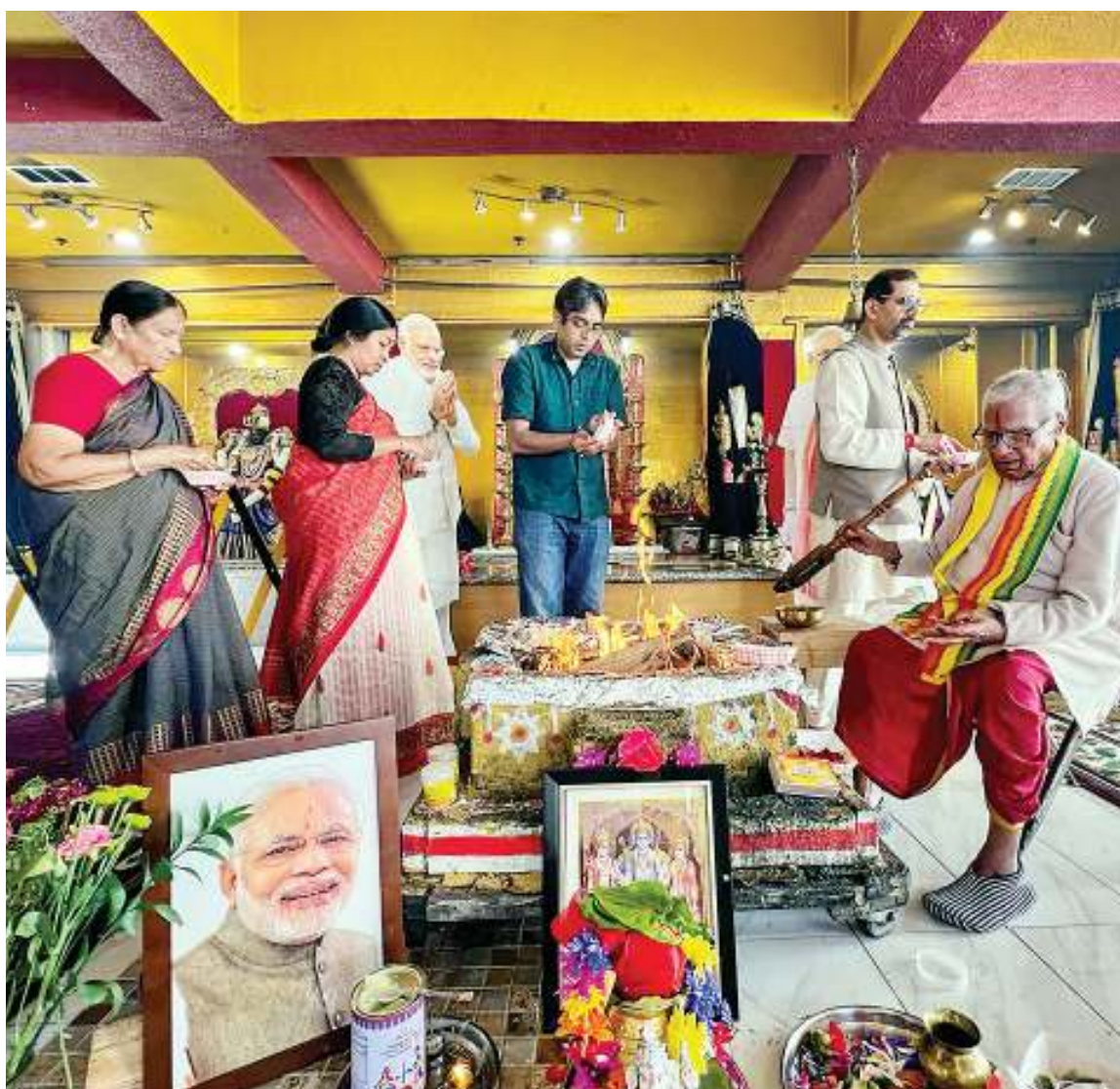
Organized by the Overseas Friends of BJP-USA San Francisco Bay Area Chapter, Indian American technology professionals from the Silicon Valley conducted a Hawan for the victory of Prime Minister Narendra Modi in the upcoming Lok Sabha elections.