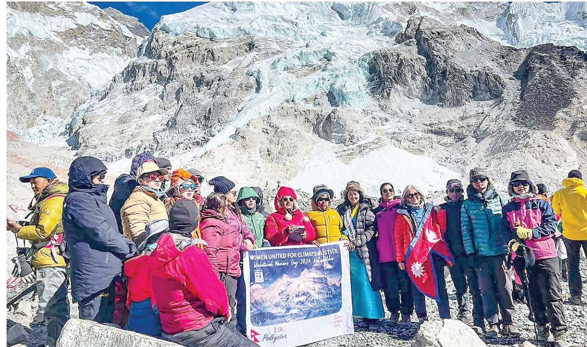
Women activists upon reaching the Everest Base Camp at an altitude of 5,364 metre to spread awareness about alarming impacts of climate change, on International Women's Day.