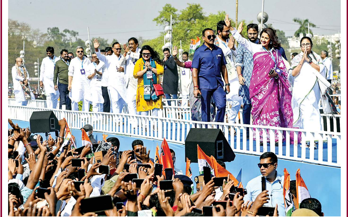
WB CM supremo Mamata Banerjee walks with party candidates for the upcoming Lok Sabha polls, during party's 'Janagarjan Sabha' rally, at Brigade Parade Ground, in Kolkata, Sunday.