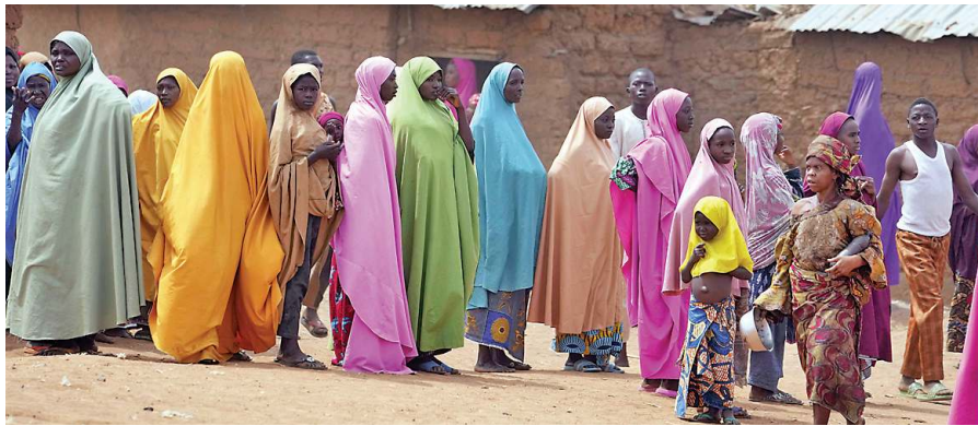
Parents wait for news about the kidnapped LEA Primary and Secondary School Kuriga students in Kuriga, Kaduna, Nigeria. Security forces swept through large forests in Nigeria's northwest region on Friday in search of nearly 300 children who were abducted from their school a day earlier in the West African nation's latest mass kidnap which analysts and activists blamed on the failure of intelligence and slow security response.