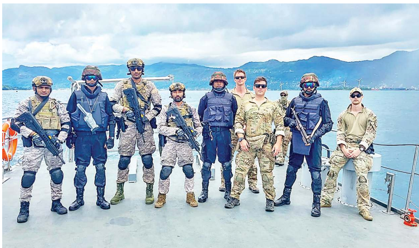
INS Tir, the lead ship of First Training Squadron (1TS) participated in Exercise Cutlass Express - 24 (CE - 24) held at Port Victoria, Seychelles from 26 Feb - 08 Mar 24.