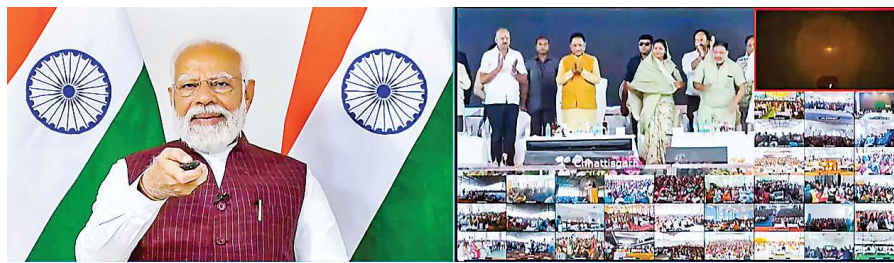
PM Modi digitally attends the launch of 'Mahtari Vandan Yojana', on Sunday.

Prime Minister Narendra Modi on Sunday said his government has resolved to make three crore women in the country "lakhpati didi" and asserted that women's welfare is their priority. The PM was speaking after virtually inaugurating the 'Mahtari Vandan' scheme in Chhattisgarh to provide monetary assistance to women. "It is fortunate that today I got an opportunity to dedicate the Mahtari Vandan scheme aimed at empowering 'hari shakti'." Under the scheme, we had promised to give Rs 1,000 per month to more than 70 lakh women and today, the BJP government has fulfilled it," Modi said addressing the function via video conference. The first installment of Rs 655 crore was deposited into the bank accounts of beneficiaries (married women) under the scheme on Sunday, he said. "I should have been among you today for this programme, but due to some other engagements I