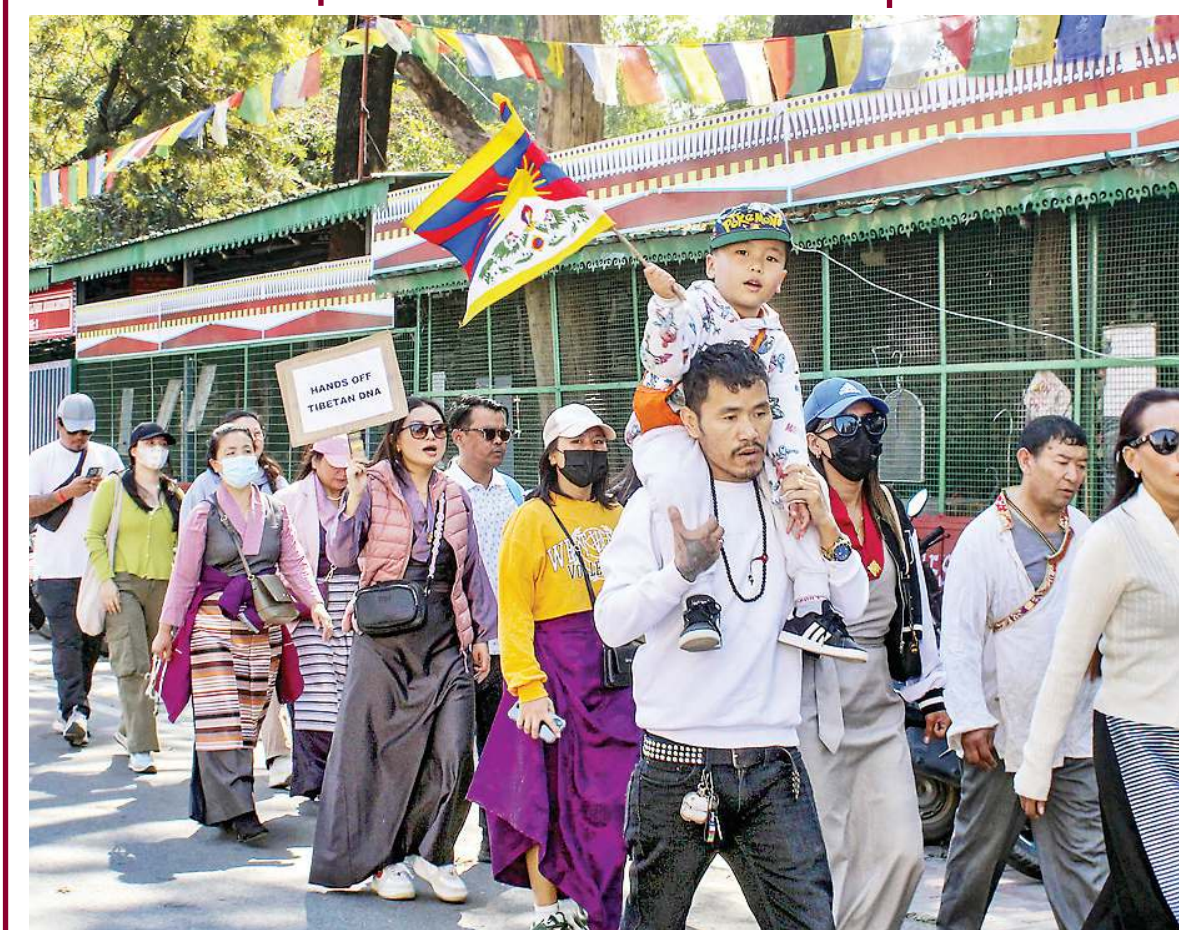
Members of the Tibetan community during a rally to commemorate the 65th anniversary of Tibetan National Uprising Day, in Dehradun, Sunday.