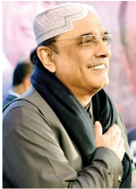
Prime Minister Shehbaz Sharif, all three service chiefs, senior officials and diplomats.

The swearing-in ceremony was attended by