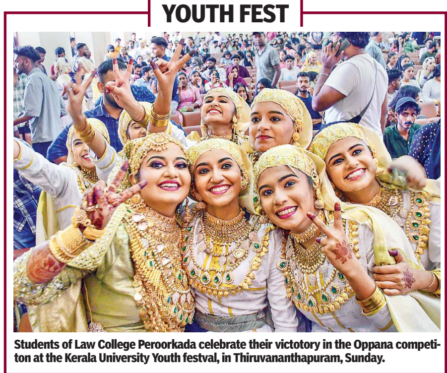
Students of Law College Peroorkada celebrate their victory in the Oppana competition at the Kerala University Youth festival, in Thiruvananthapuram, Sunday.

announced yesterday is an accused in the khichdi scam. He took bribe by way of cheque from a supplier," Nirupam alleged. "What is khichdi scam? During the COVID-19 pandemic, BMC (Brihanmumbai Municipal Corporation) provided free food to labourers in transit and the candidate took commission in the scheme meant to provide relief to poor people. The ED is probing the case," Nirupam claimed in his post. In the 2014 and 2019 Lok Sabha polls, the Congress lost all the six seats in Mumbai. In 2019, the then undivided Shiv Sena contested three seats in alliance with the Bharatiya Janata Party (BJP) and won all of them.