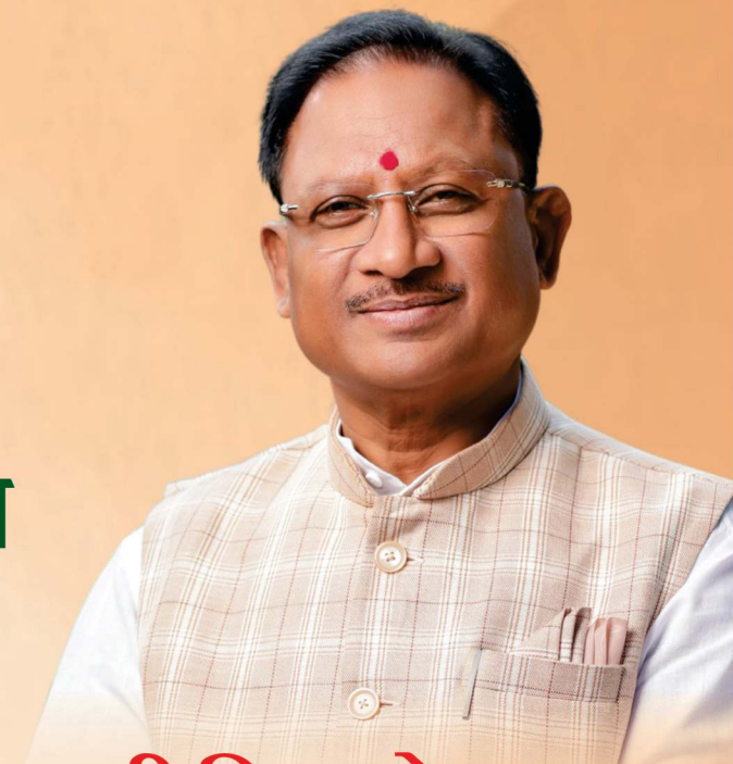
श्री विष्णु देव साय माननीय मुख्यमंत्री, छत्तीसगढ़