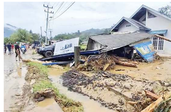
Damaged houses are seen in a village affected by flash flood in Langgai, West Sumatra, Indonesia, Sunday, March 10. Torrential rains have triggered flash floods and a landslide on Indonesia's Sumatra island leaving a number of people dead and missing, officials said Sunday.

Rescuers by Saturday pulled out seven bodies in the worst-hit village of Koto XI Tarusan, and recovered three others in two neighboring villages,