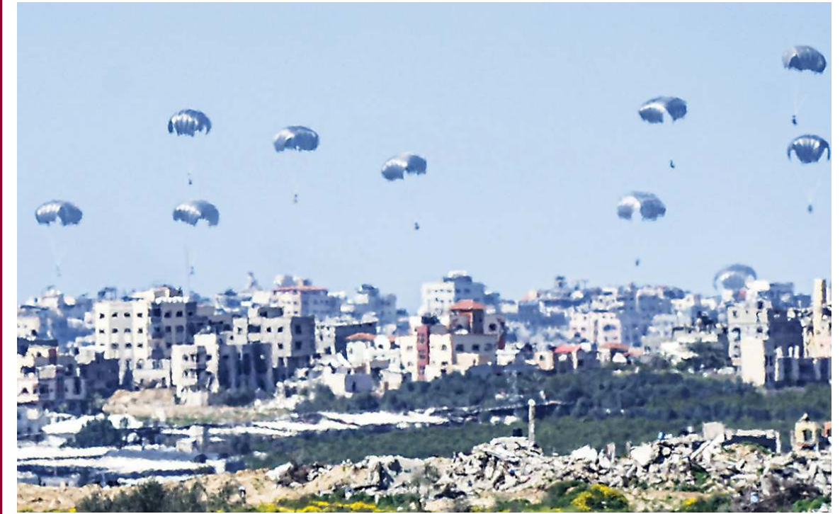
Parachutes drop supplies into the northern Gaza Strip, as seen from southern Israel, Sunday, March 10.