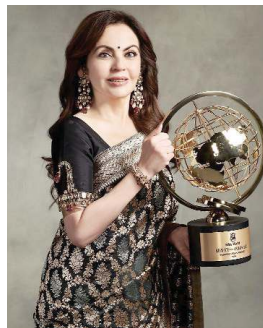
Nita Mukesh Ambani after receiving the prestigious Humanitarian Award during the grand finale of the 71st Miss World pageant at the Jio World Convention Centre, in Mumbai.