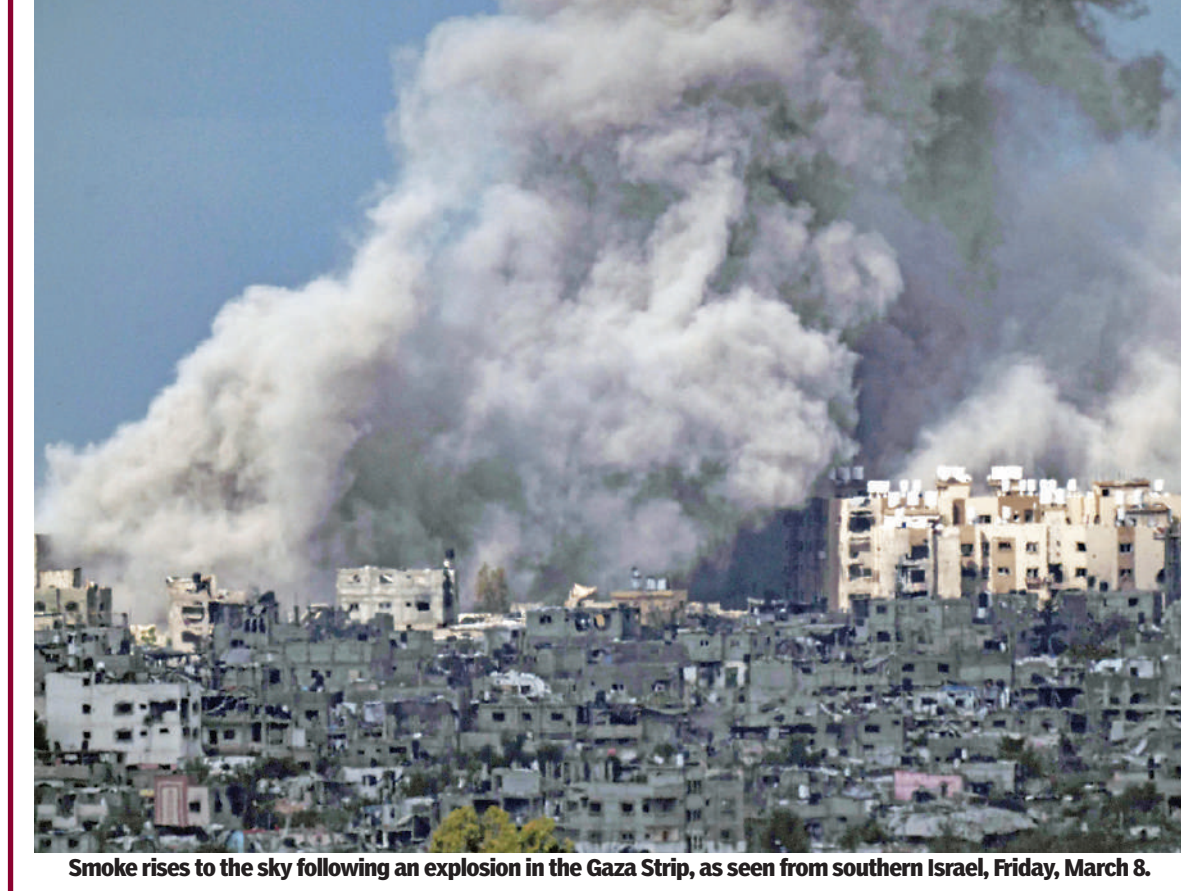
Smoke rises to the sky following an explosion in the Gaza Strip, as seen from southern Israel, Friday, March 8.

India's ambassador to Nepal Naveen Srivastava on Thursday separately met Deputy Prime Minister and Foreign Minister Narayan Kaji Shrestha and Finance Minister Varshaman Pun and conveyed New Delhi's stand on the latest political developments in the Himalayan nation, the reports said. An Indian embassy spokesman confirmed that the Indian envoy separately