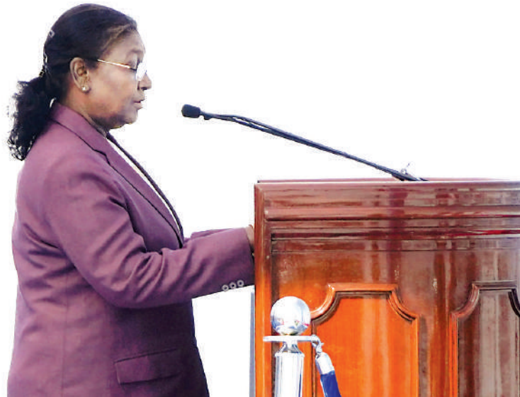
President Droupadi Murmu addresses during the President's Standard and President's Colours Presentation 2024, at the Air Force Station, Hindon, in Ghaziabad, Friday.

she said while expressing confidence that in coming times, "more and more girls will join the Air Force and serve the country".