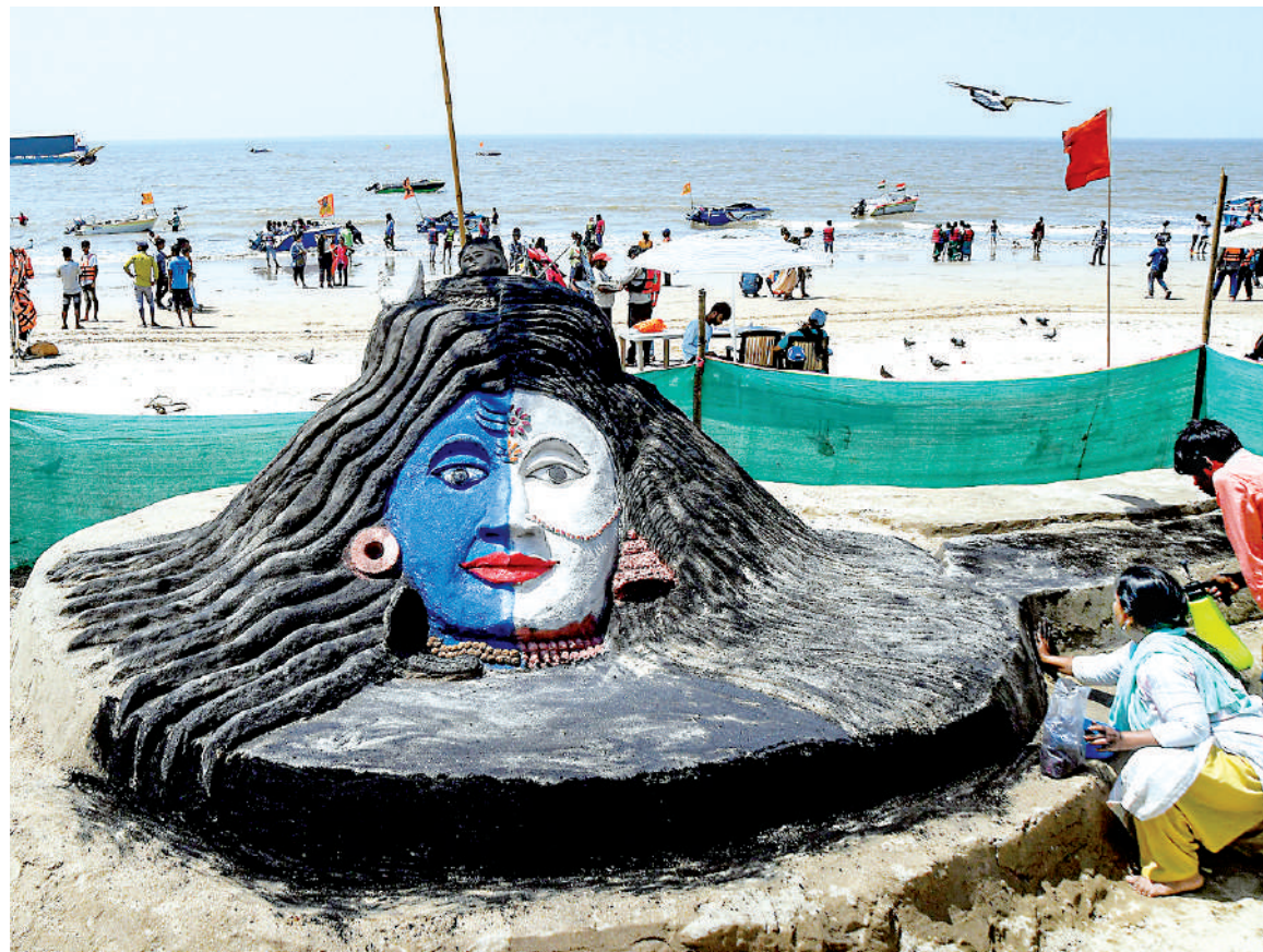
Sand artists give finishing touches to a sculpture of Lord Shiva on the occasion of Maha Shivratri festival, in Mumbai, Friday.