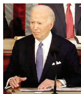
2024 presidential elections.

Following Super Tuesday primary contests, it has become clear that it will be a rematch of 2022 in the November 5,