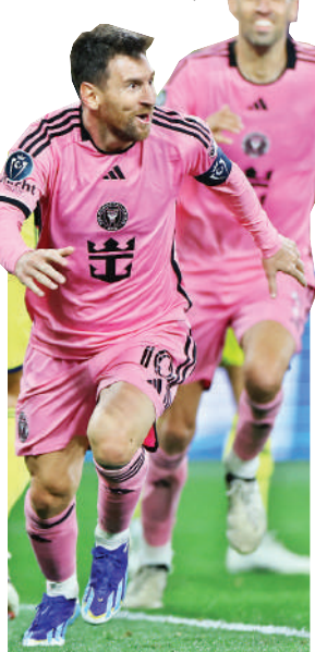
Lionel Messi #10 of Inter Miami CF celebrates after a goal by Luis Suarez #9 against Nashville SC during the second leg of the Concacaf Champions Cup Leg One Round of 16 match at GEODIS Park on March 07.