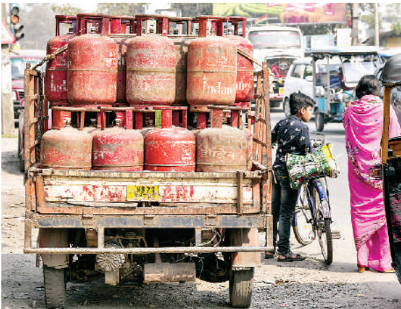
A van loaded with LPG cylinders at roadside near a distribution center.