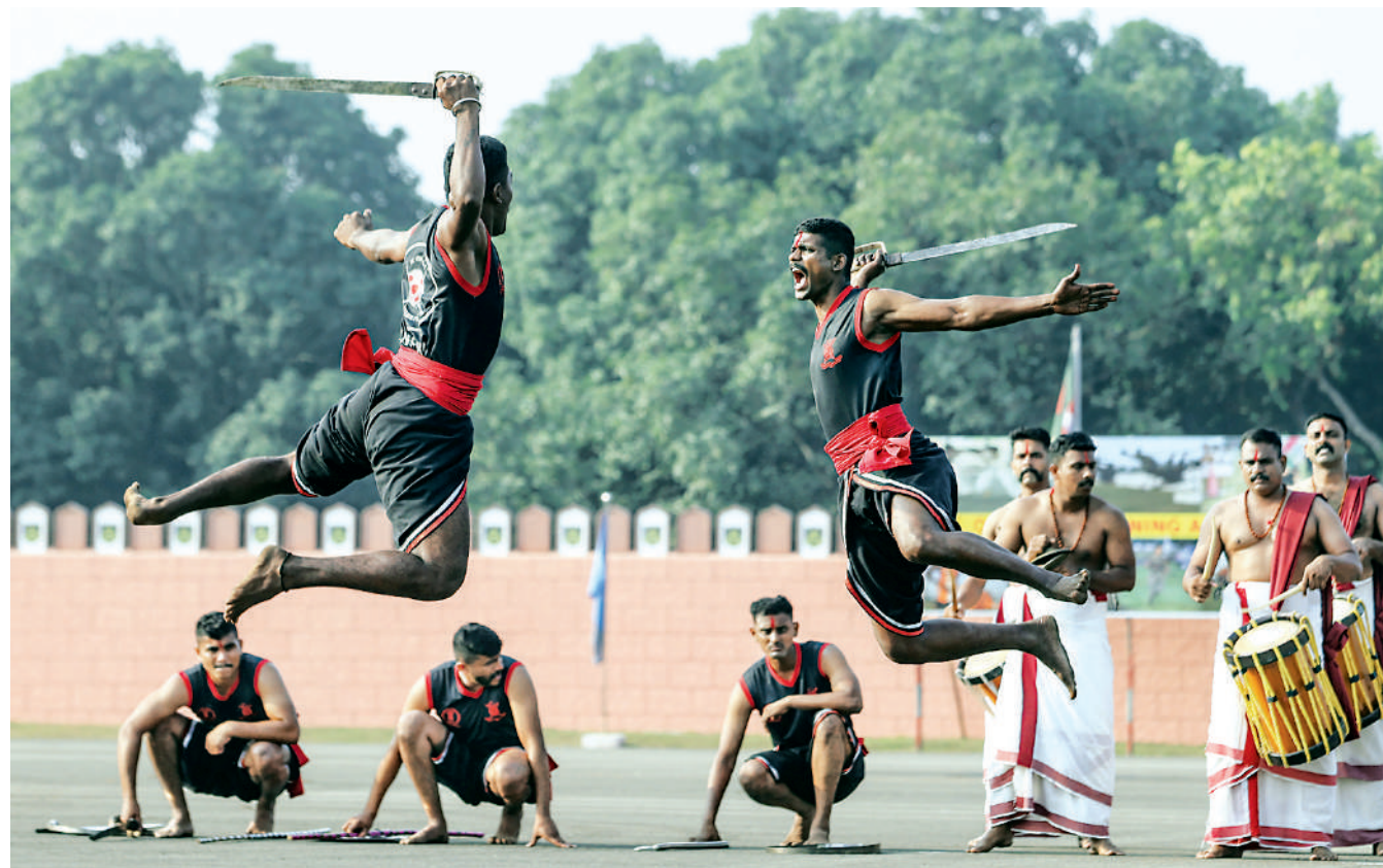
Cadets perform during the combined display organised as part of the Passing Out Parade, at Officers Training Academy (OTA) in Chennai, Friday, March 8.