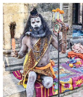
A devotee dressed as Lord Shiva at the Pashupatinath Temple on Mahashivaratri festival, in Kathmandu, Friday, March 8.

Thousands of devotees carrying flowers, incense, rice and other offerings in their devotion to the Lord queued up around the Pashupatinath temple for hours since early morning to have a view of Shiva Linga. Lord Shiva or Mahadeva is regarded as one of the trinity responsible for the dissolution of the world during pralaya. Mahashivaratri is known as the day when Shiva was born. Officials at Pashupati Area Development Trust (PADT) which is responsible for managing the af-