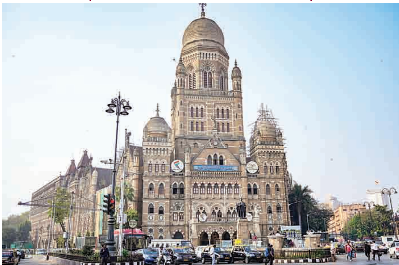
The Brihanmumbai Municipal Corporation (BMC) building, in Mumbai, Wednesday, Feb. 28.