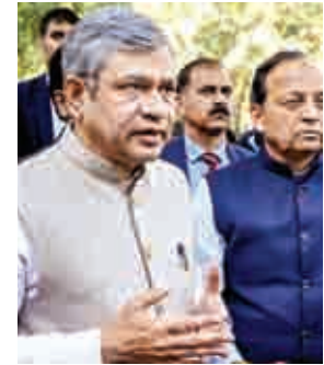
Union Minister Ashwini Vaishnaw speaks to the media after meeting with the Election Commission of India (ECI), in New Delhi, Wednesday.

It also requested the Election Commission to