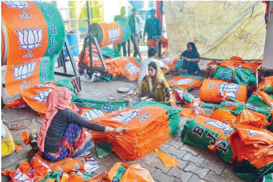
Labourers make flags of Bharatiya Janata Party (BJP) ahead of the Lok Sabha polls, in Mathura, Wednesday.