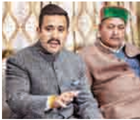
MLA Vikramaditya Singh addresses a press conference, in Shimla, Wednesday.

Shimla/New Delhi, Feb 28 (PTI): The Congress on Wednesday scrambled to save its government in Himachal Pradesh, amid dramatic developments that included the resignation of high-profile minister Vikramaditya Singh and the suspension of 15 BJP MLAs by the Speaker.