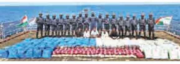
Indian Navy personnel show 3300Kgs contraband (3089kg Charas, 158kg Methamphetamine, 25kg Morphine) seized from a vessel in a joint operation with NCB.

Porbandar/New Delhi, Feb 28 (PTI): Indian agencies Wednesday made their highest-ever drugs bust from the sea as they seized 3,300 kg narcotics, which sailed from an Iranian port, off the Gujarat coast and arrested five foreigners from a dhow. Home Minister Amit Shah called the joint operation by the Navy, Narcotics Control Bureau (NCB) and the Gujarat