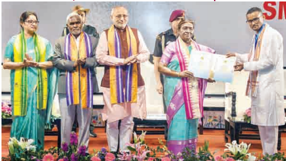
President Droupadi Murmu during the third convocation of the Central University of Jharkhand, in Ranchi, Wednesday.