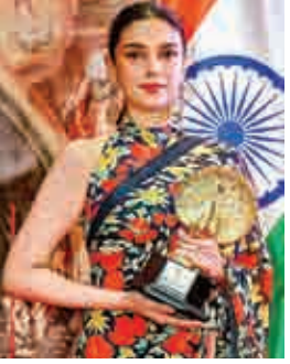
Actor Aditi Rao Hydari poses for photos at an event, in New Delhi, Wednesday.