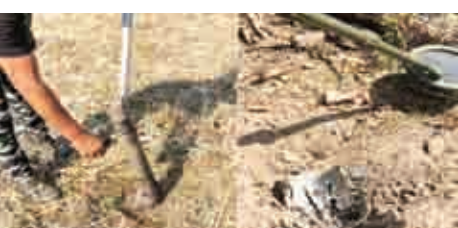
Naxalites to harm the soldiers in the footpath near Toyanala between Chinnagelur and Gudem has been recovered safely and defused on the spot. Due to the alertness of the soldiers, the plans of the Naxalites were once again foiled.

Jagdalpur, (Bijapur), Feb 28: A joint force of CRPF Cobra and STF were out on search from Chinnagelur under Tarrem police station area of the district. Meanwhile, the directional pipe bomb and tiffin