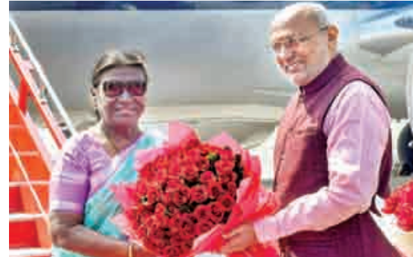
President Droupadi Murmu being received by Governor of Jharkhand C.P. Radhakrishnan upon her arrival in Ranchi, Wednesday.