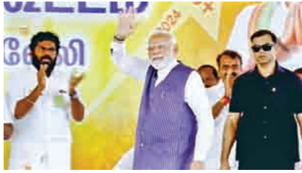
PM Modi during a public meeting, in Tirunelveli district, Wednesday.

The PM inaugurated projects in Thoothukudi and addressed a BJP rally