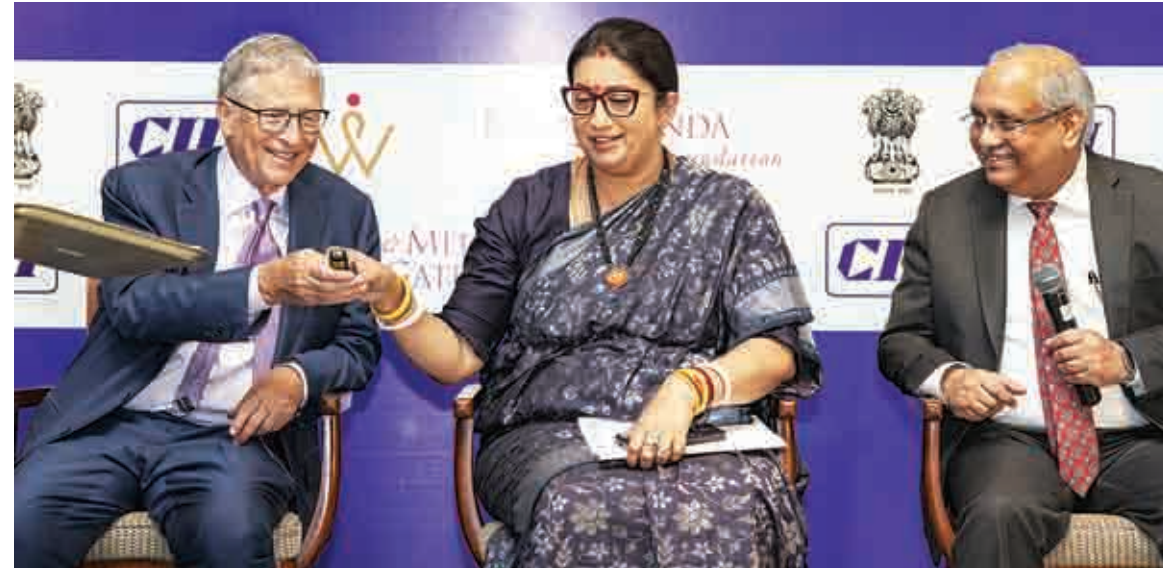
Union Minister Smriti Irani and former CEO of Microsoft Bill Gates at the Alliance For Global Good On Gender Equity and Equality event, in New Delhi, Wednesday, Feb. 28.