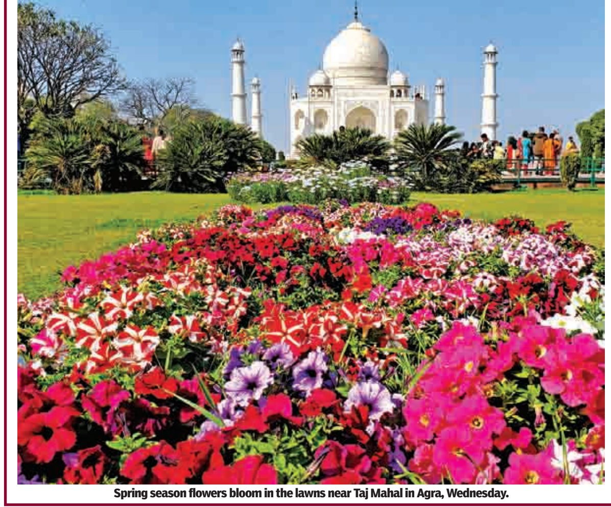
Spring season flowers bloom in the lawns near Taj Mahal in Agra, Wednesday.