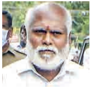
Santhan alias T Suthendiraraja

Santhan would be taken to his house in Sri