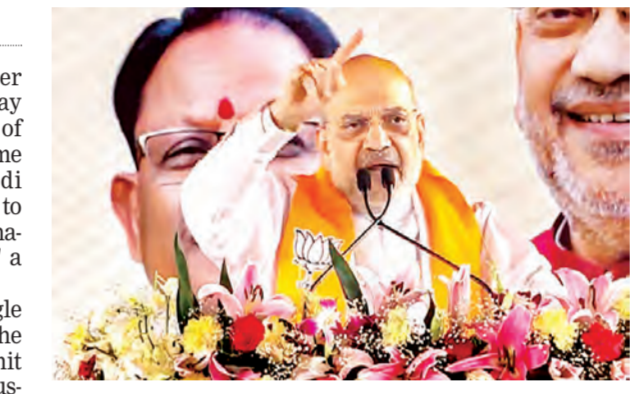
Union Home Minister and BJP leader Amit Shah, Thursday, Feb. 22. The BJP won ten out of 11 Lok Sabha seats in the state in 2014 and nine in 2019, Shah noted, adding that in the recent assembly elections people voted his party to power with a thumping majority. "The incompetent (Congress) government nei-

The Congress on Thursday accused the BJP-led Centre of indulging in "financial terrorism" against it and alleged that the government had "looted" over Rs 65 crore from its accounts to economically cripple the party ahead of Lok Sabha polls. The Congress also alleged that the ruling party was attempting to "murder democracy" and drag the country to a "dictatorship raj". Addressing a press conference at the AICC headquarters along with Congress leaders K C Venugopal and Ajay Maken, Congress general secretary in-charge communications