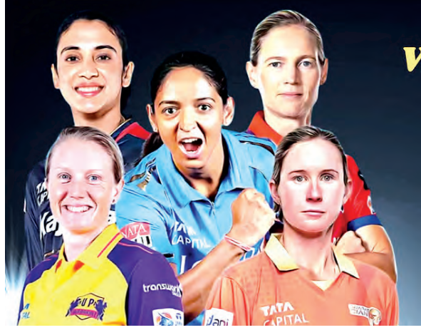
Match starts at 7.30 PM IST