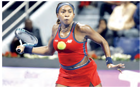
Dubai, Feb 22 (AP):

Coco Gauff rallied from a slow start and a second-set argument with the chair umpire to beat Karolina Pliskova 2-6, 6-4, 6-3 and reach the quarterfinals of the Dubai Championships.