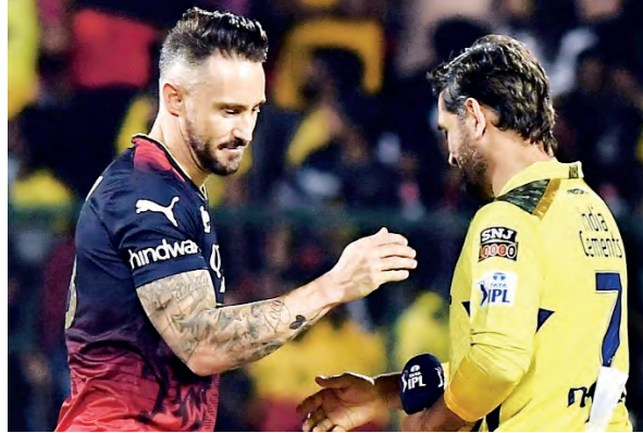
New Delhi, Feb 22 (PTI):

Defending champions Chennai Super Kings will take on Royal Challengers Bangalore in the 2024 IPL season-opener in Chennai on March 22, the BCCI announced Thursday while unveiling the schedule for only the first 17 days of the popular T20 league. The roster for the remaining matches will be announced once the dates for the upcoming general elections are announced early next month. The first 17 days of the tournament will see 21 matches taking place.