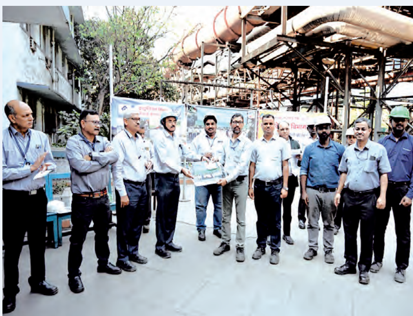
Central Chronicle News

Bhilai, Feb 22: BSP's Instrumentation Department provides round-the-clock services for measuring, monitoring, and controlling of process and environment parameters of all shops of Bhilai Steel Plant, including the CO & CCD, Blast Furnaces, Steel Melting Shops, the Mills, PBS, SPs, RMPs, and other auxiliary units.