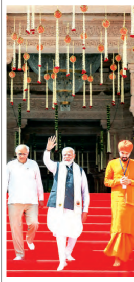
Prime Minister Narendra Modi waves at people as he comes out after visiting the Valinath Mahadev Mandir in Tarah, Mahesana, Gujarat, Thursday, Feb. 22. Gujarat CM Bhupendra Patel is also seen.