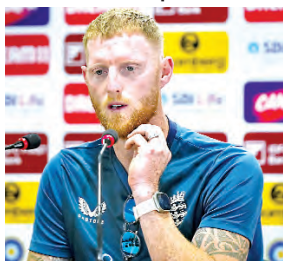
Ranchi, Feb 22 (PTI):

I've never seen something like that before: Stokes on Ranchi pitch