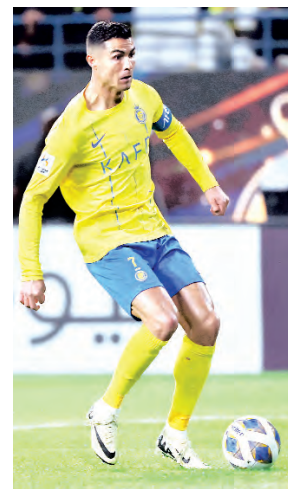
Riyadh, Feb 22

Cristiano Ronaldo's Al-Nassr moved into the quarterfinals of the Asian Champions League with a 3-0 aggregate win over Al-Fayha in an all Saudi Arabian matchup.