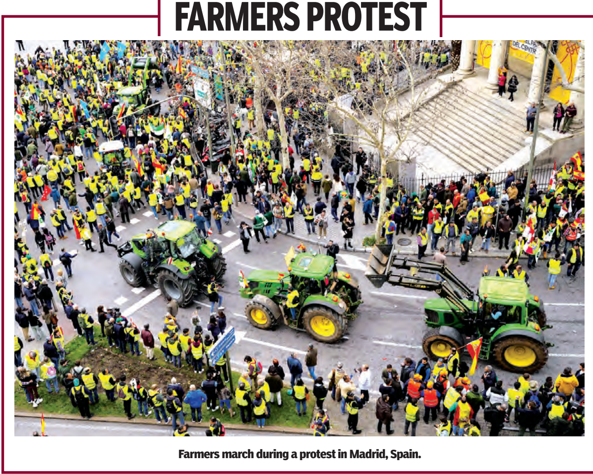
Farmers march during a protest in Madrid, Spain.

and diplomacy," while on the Israel-Palestine conflict, "India believes in a two-State solution on the Israel-Palestine issue." Asserting that India condemns terrorism in all its forms, he said, "We must not allow conflict in West Asia to spread any wider." Referring to the attacks on marine vessels in the Red Sea, he emphasised the need for utmost security on high seas and also that the safety of sea lanes of communication "is critical." Muraleedharan also drew attention to the need to address "geopolitical issues constructively and find common ground." Reiterating India's stand, he also reminded the gathering of foreign ministers that the G20 as an economic forum should focus on Sustainable Development Goals (SDG) and climate change.