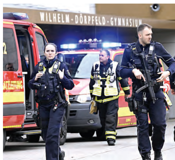
Police and ambulances at the scene of an attack, at the Wilhelm D rpfeld school, in Wuppertal, Germany, Thursday, Feb. 22. Police say five people have been injured in an incident at a school in the western German city of Wuppertal and a suspect has been arrested.

Four students were wounded in a stabbing Thursday at a school in the western German city of Wuppertal and a suspect, believed to be a student himself, was arrested, authorities said. The incident took place Thursday morning at the Wilhelm D rpfeld high school in the city of some 350,000 people near Duesseeldorf and Cologne. Police said four students were wounded, as was the suspect, German news agency dpa reported. The top regional security official, Herbert Reul, said the attack was apparently carried out with a knife by a 17-year-old student. Reul, the interior minister of North Rhine-Westphalia state, said that at least two of the victims were seriously injured, as was the suspected assailant. He told the state legislature's