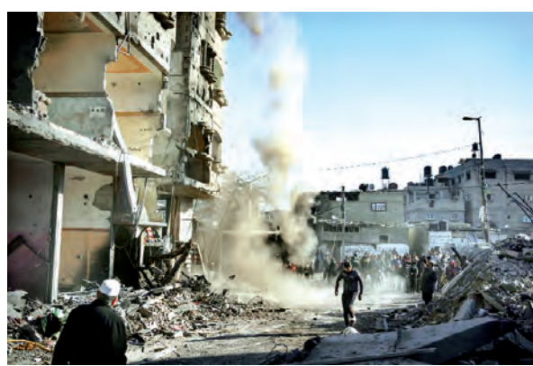
Palestinians look at the destruction after an Israeli strike on residential buildings and a mosque in Rafah, Gaza Strip, Thursday, Feb. 22.

A member of Israel's War Cabinet said late Wednesday that new attempts are underway to reach a cease-fire deal between Israel and Hamas that could pause the war in Gaza and bring the release of around 130 Israeli hostages held by the militants since their Oct. 7 attack on southern Israel. It was the first Israeli indica-