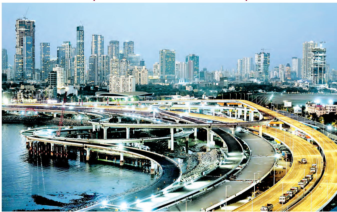
The Coastal Road along the Arabian Sea under construction, in Mumbai.