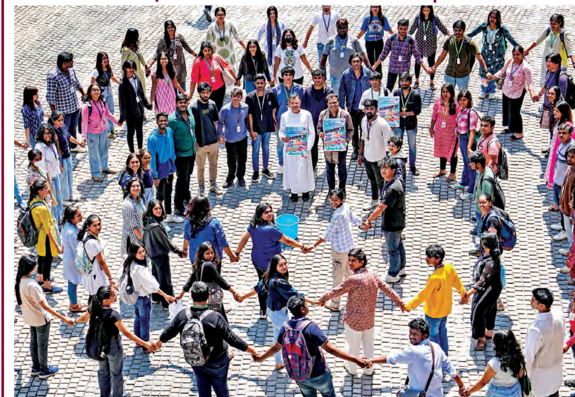
Students form a human chain during a save water campaign ahead of the 'Neerathon' 2024, an annual run to create awareness on water conservation, in Bengaluru, Tuesday.