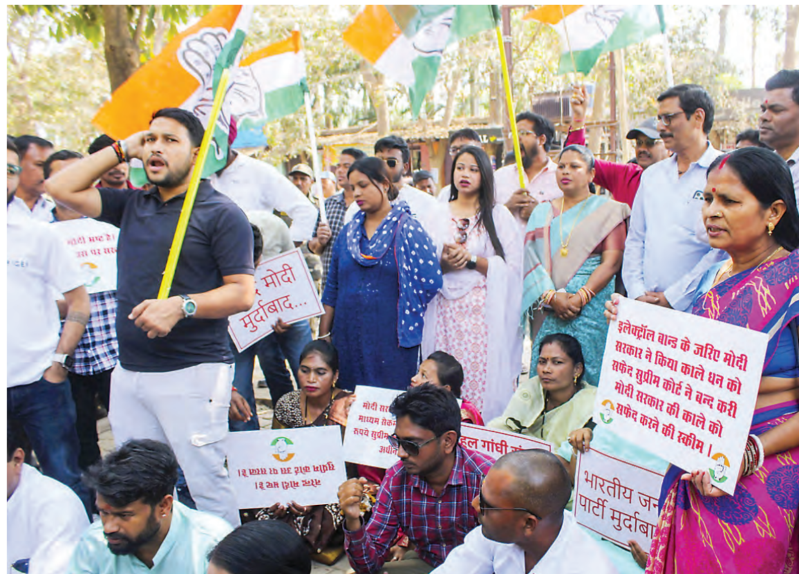
Congress workers stage a protest against the central government over freezing of some bank accounts of the Congress party by the Income Tax department, at Jagdalpur in Bastar district, Tuesday.