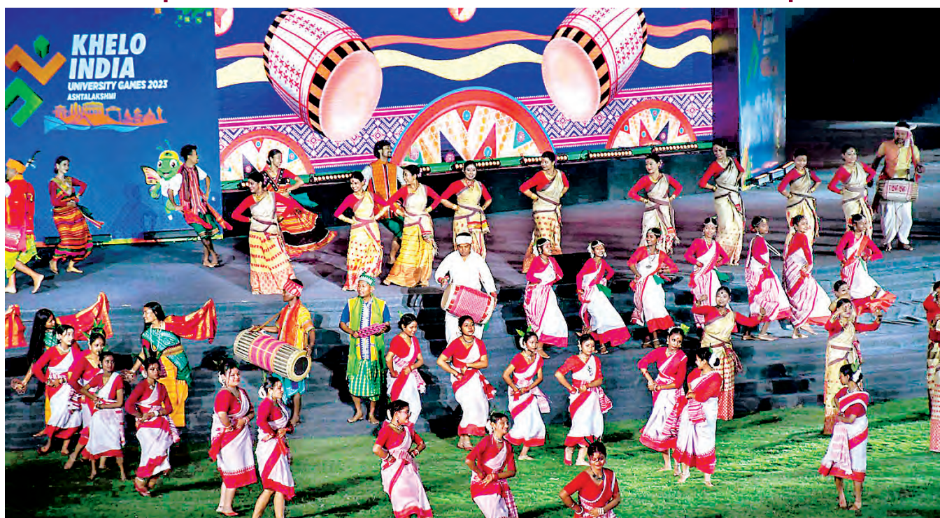
Artists perform during the opening ceremony of the 4th edition of the Khelo India University Games, in Guwahati.