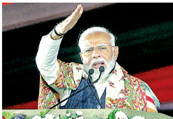
PM Modi addresses the gathering, in Jammu, Tuesday.