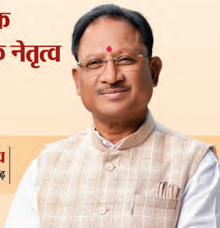
श्री विष्णु देव साय माननीय मुख्यमंत्री, छत्तीसगढ़

सबका साथ-सबका विकास, सबका विश्वास और सबका प्रयास