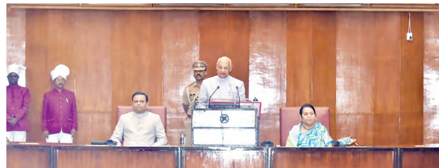
Neelam Gorhe, Minister of Parliamentary Affairs and Chandrakant Patil and Chief Secretary Nitin Kareer. The Governor was given a ceremonial Guard of Honour on the occasion.

The Governor was welcomed by Speaker of Maharashtra Legislative Assembly Rahul Narwekar, Chief Minister Eknath Shinde, Deputy Chairperson of Legislative Council Dr