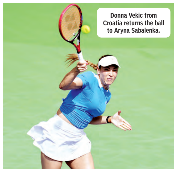
Donna Vekic from Croatia returns the ball to Aryna Sabalenka.

They go back eight years, and Vekic dominated the early matchups. But Sabalenka made the Grand Slam breakthrough when she beat Vekic in the Australian quarterfinals a year ago en route to her first major title. Vekic referenced Sabalenka winning "the big one" of their career matchups on Tuesday but her sixth win