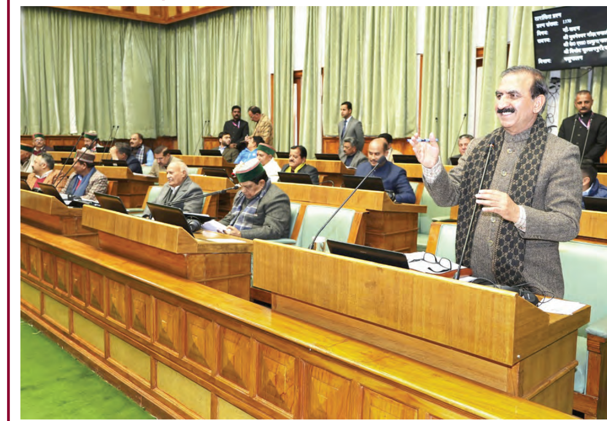
Himachal Pradesh Chief Minister Sukhvinder Singh Sukhu addresses the Budget session of the Himachal Pradesh Assembly, in Shimla, Tuesday, Feb. 20.