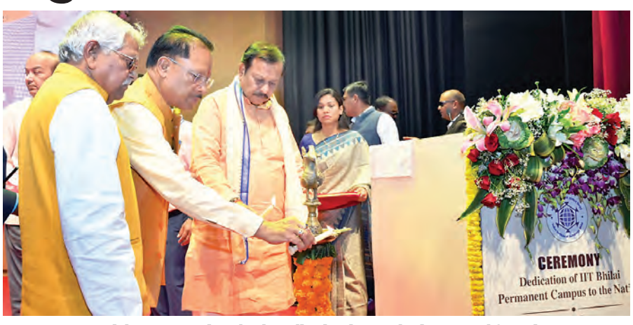
CM Vishnu Dev Sai and other dignitaries at the inaugural function.

PM Modi laid the foundation stone of the IIT Bhilai campus on June 14, 2018. Its construction