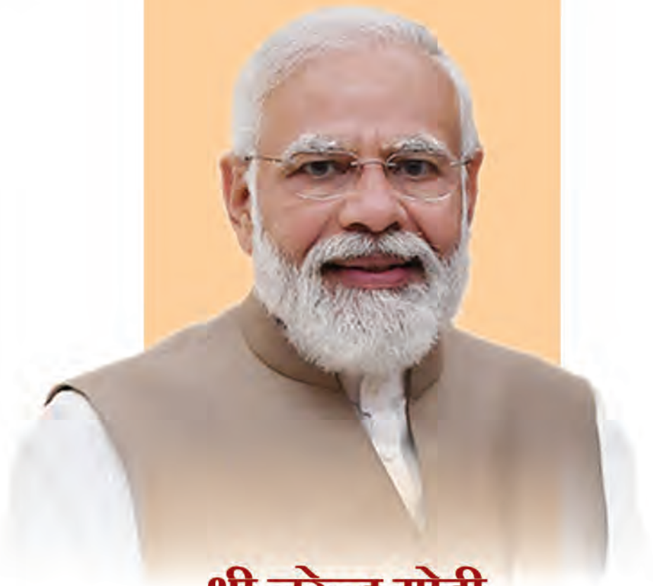
श्री नरेन्द्र मोदी माननीय प्रधानमंत्री