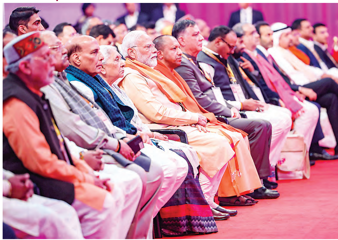
Prime Minister Narendra Modi with Uttar Pradesh Governor Anandiben Patel, Defence Minister Rajnath Singh and UP Chief Minister Yogi Adityanath during the 4th groundbreaking ceremony of UP Global Investors Summit, in Lucknow, Monday, Feb. 19.