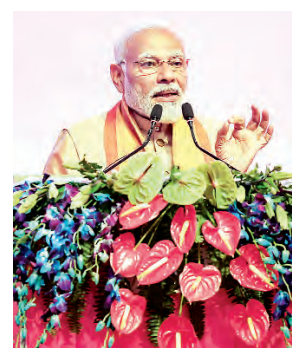
PM Modi speaks during the 4th groundbreaking ceremony of UP Global Investors' Summit, in Lucknow, Monday.

"We are assisting and encouraging farmers to take our country's agriculture on a new path," he said. He emphasised the