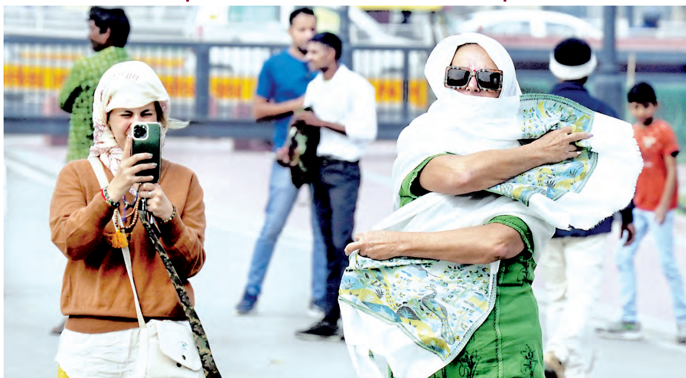
Tourists on the Kartavya Path near the India Gate in New Delhi, Monday, Feb. 19