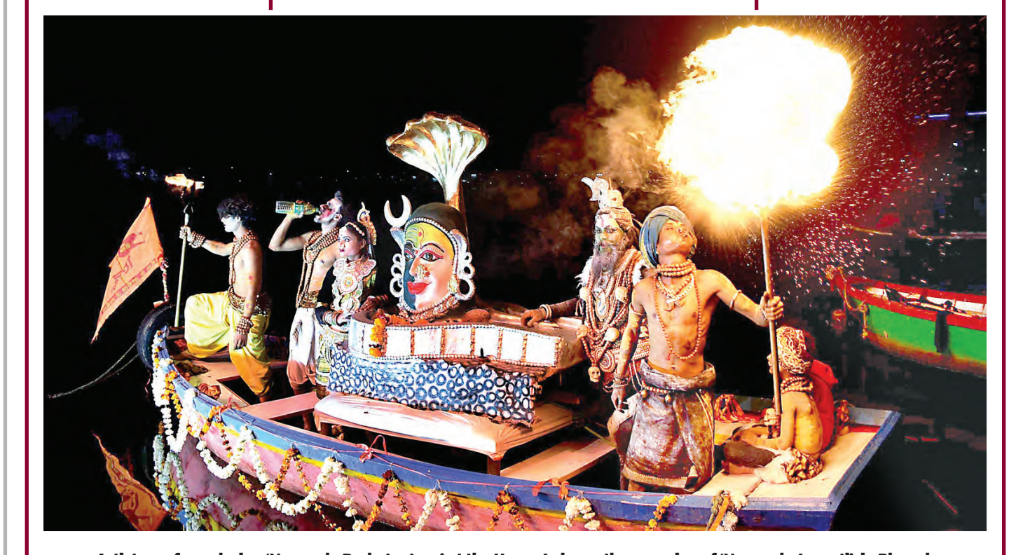
Artists perform during 'Narmada Prakatyotsav' at the Upper Lake on the occasion of 'Narmada Jayanti', in Bhopal.