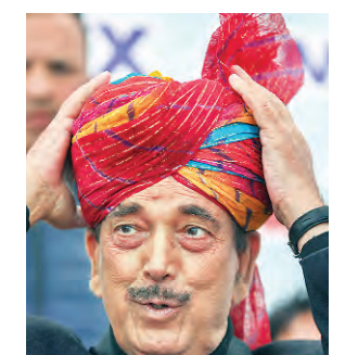
DPAP Chairman Ghulam Nabi Azad during a public rally at Nagrota, in Jammu district, Saturday.

the sidelines of a function in Nagrota, Azad, who resigned from Congress after decades of association, also appealed to Prime Minister Narendra Modi to resolve the issues of agitating farmers "once for all" as the