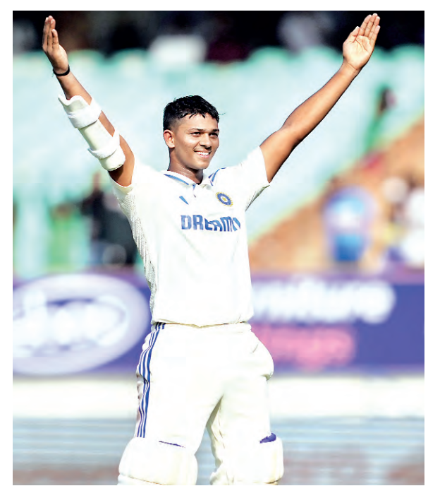
India's Yashaswi Jaiswal celebrates after scoring as century.

The left-handed opener, who will be torch-bearer of Indian batting for the next decade, scored his third Test hundred in only seventh Test appearance before the blazing blade was brought to a halt by back