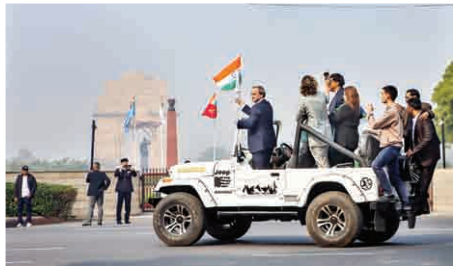
FIDE President Arkady Dvorkovich, former world chess champion Viswanathan Anand and Hungarian chess legend Judit Polgar during Chess Olympiad Torch hand-off ceremony, in New Delhi, Wednesday, Feb. 14.