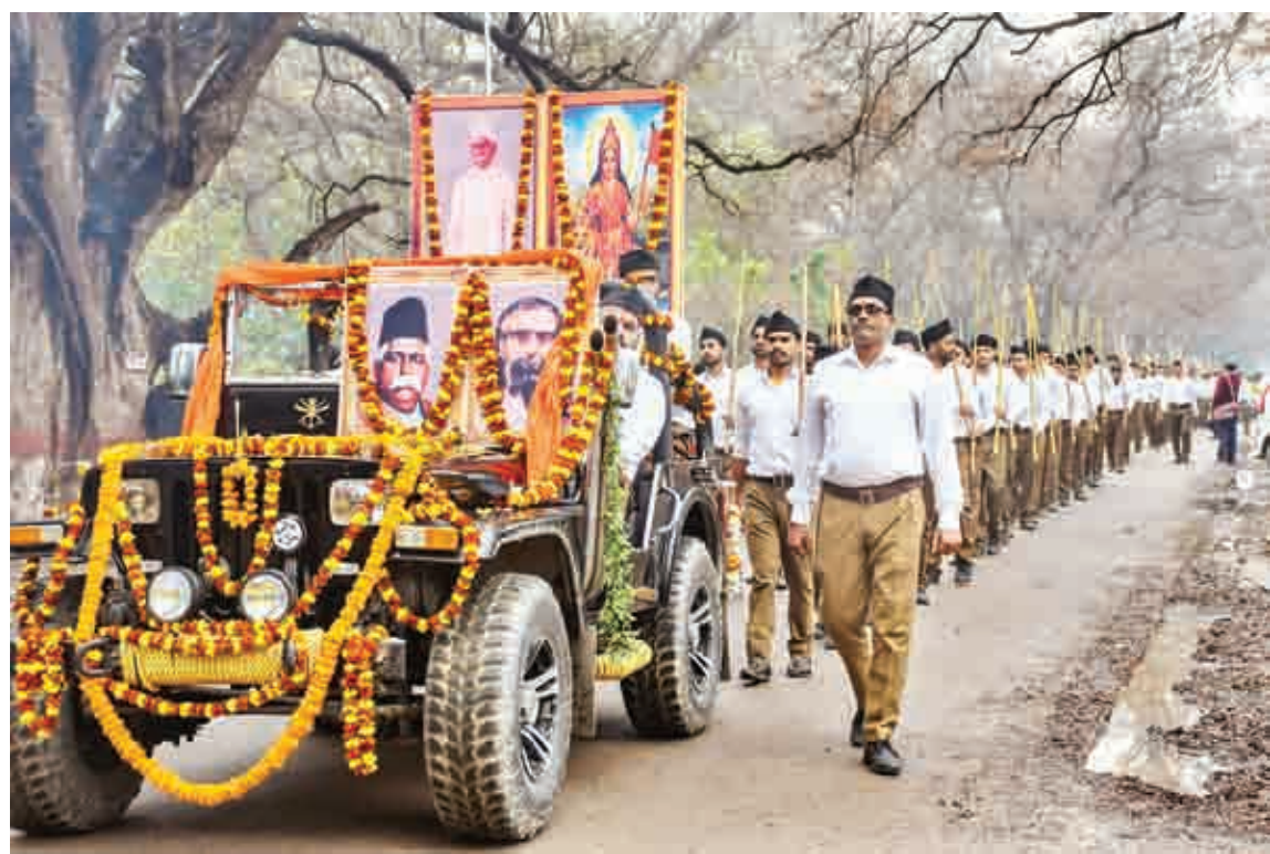
RSS volunteers take part in a 'Path Sanchalan' on the foundation day of Banaras Hindu University and 'Basant Panchami', in Varanasi, Wednesday.