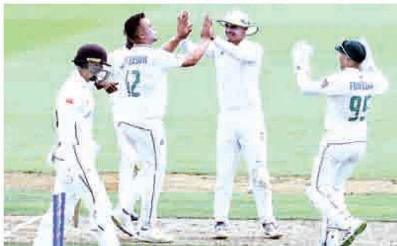
South Africa players celebrate the dismissal of New Zealand's wicket keeper Tom Blundell.

Four batters, two from each team, were out bowled off an inside edge