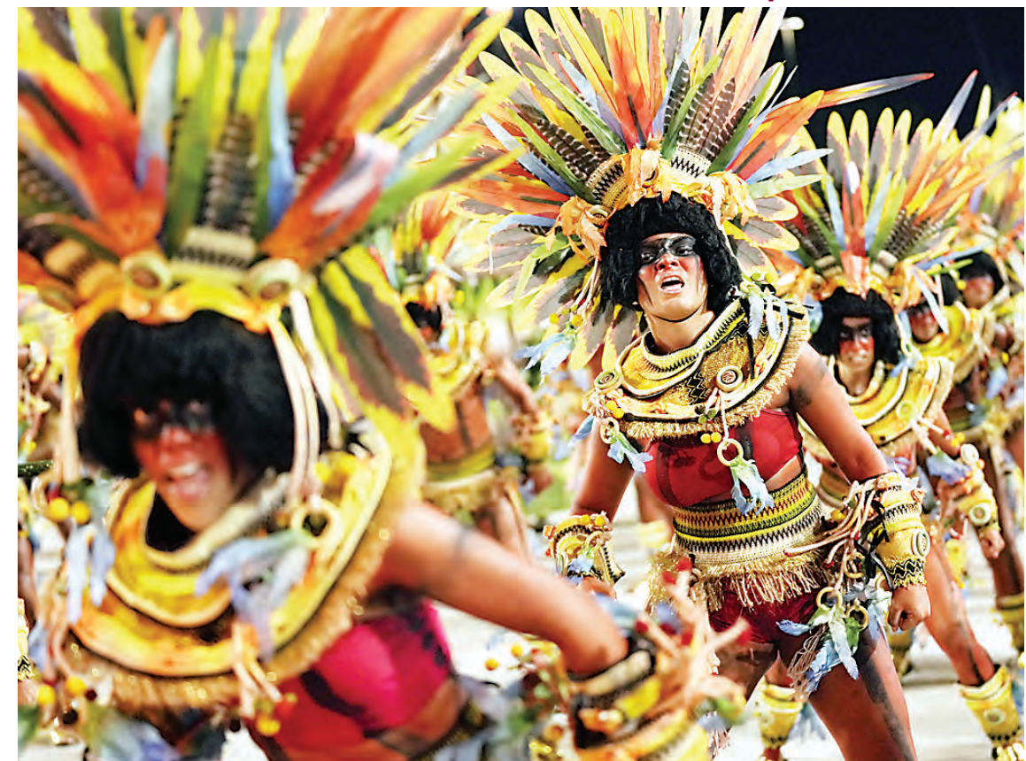
Performers from the Salgueiro samba school parade during Carnival celebrations at the Sambadrome in Rio de Janeiro, Brazil.