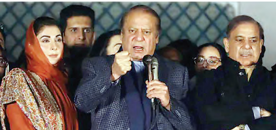
Lahore, Feb 13

Pakistan's former prime minister Shehbaz Sharif on Tuesday reaffirmed that Pakistan Muslim League-Nawaz supremo Nawaz Sharif will become the prime minister for a record fourth time.