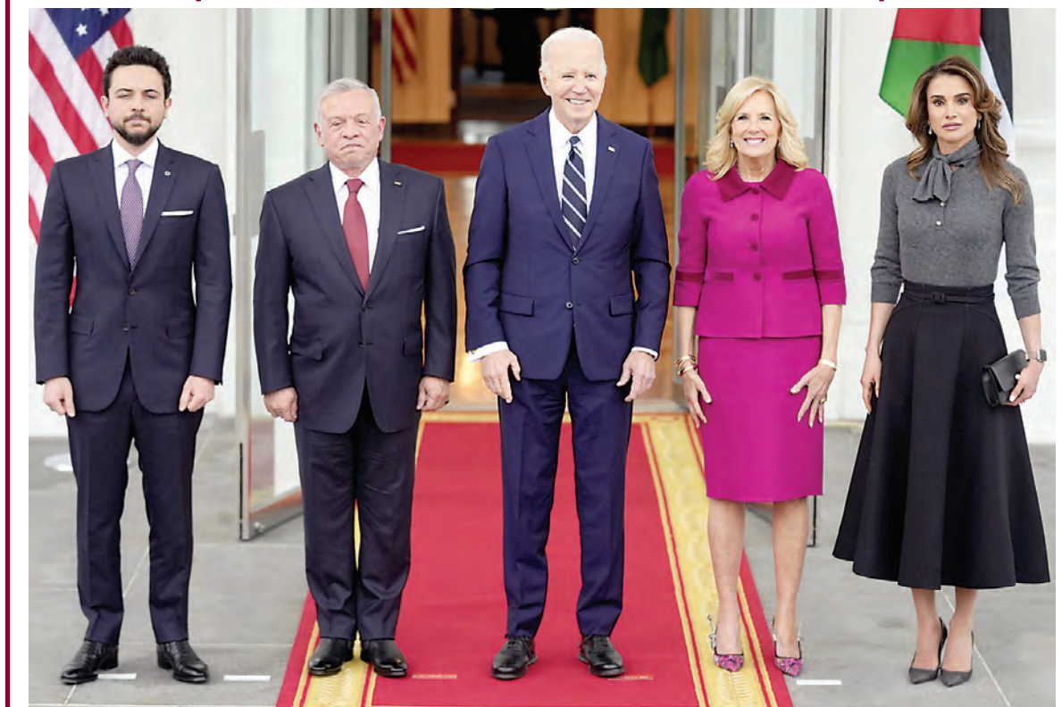
President Joe Biden, center, and first lady Jill Biden, second right, pose for a photo upon greeting Jordan's King Abdullah II, second left, Queen Rania, right, and Crown Prince Hussein, left, on the North Portico of the White House.