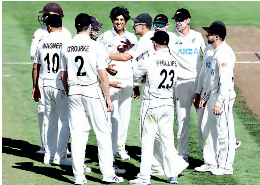
New Zealand's Rachin Ravindra (C) celebrates a South African wicket with his teammates.

On a day of unusual decisions, New Zealand left out regular spinner Mitchell Santner, who took six wickets in the first test, included four seamers and ended up leaning heavily on Ravindra's left-arm spin.