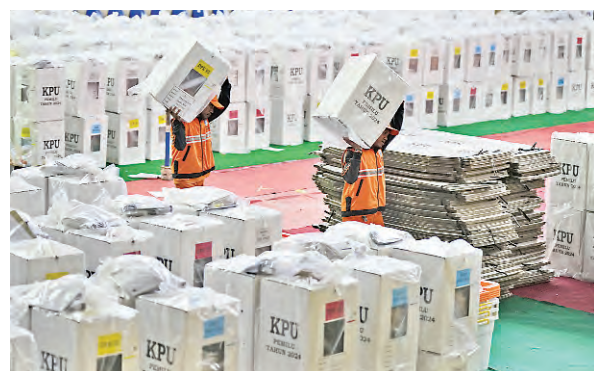
Workers arrange ballot boxes prepared for the Feb. 14 election at a stadium in Jakarta, Indonesia, Tuesday, Feb. 13.

Outgoing President Joko Widodo's foreign policy avoids criticism of Beijing and Washington but also rejects alignment with either power. The delicate balancing act has