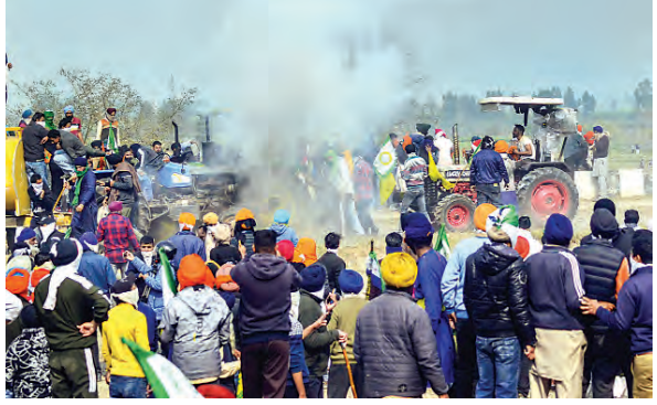
Police use tear gas shells to disperse farmers during their 'Delhi Chalo' march at Punjab-Haryana Shambhu border, near Patiala, Tuesday.

Farmers from Punjab faced tear gas shells some of them dropped by a drone -- at two border points as protesters tried to break past barricades set up by the Haryana Police to stop them from heading to the national capital. Police hurled tear gas shells, and the protesters hurled stones, at the Shambhu border near Ambala in Haryana. Tear gas was also used against protesters at the border between the two states in Haryana's Jind district.