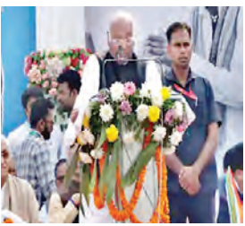
Ambikapur, Feb 13:

Amid farmers' 'Delhi Chalo' agitation, Congress president Mallikarjun Kharge on Tuesday said his party would provide legal guarantee to Minimum Support Price (MSP) for crops after coming to power. This was his party's first "guarantee" ahead of the Lok Sabha elections, he said. Speaking during Congress leader Rahul Gandhi's 'Bharat Jodo Nyay Yatra' in Ambikapur district of Chhattisgarh, Kharge also targeted Prime Minister Narendra Modi, saying the people should not believe Modi's "guarantees". "If Congress comes to power at the Centre (after the Lok Sabha polls), it will ensure legal guarantee to MSP in the interest of farmers. It is our first guarantee," Kharge said. One of the demands of the farmers participating in the 'Delhi Chalo' march is enactment of law guaranteeing MSP for crops. PM Modi does not believe in democracy and works only for himself, Kharge claimed.