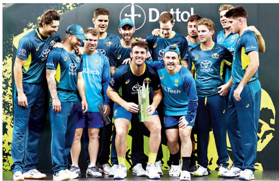
Australia's players pose with the trophy after winning the series following their defeat in the third Twenty20 international cricket match against the West Indies at Perth Stadium in Perth on February 13.