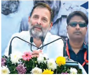
Congress leader Rahul Gandhi on Tuesday slammed the BJP-led Centre, claiming that only some people were benefitting from the "system" in the country while all the others were paying taxes and dying of hunger.