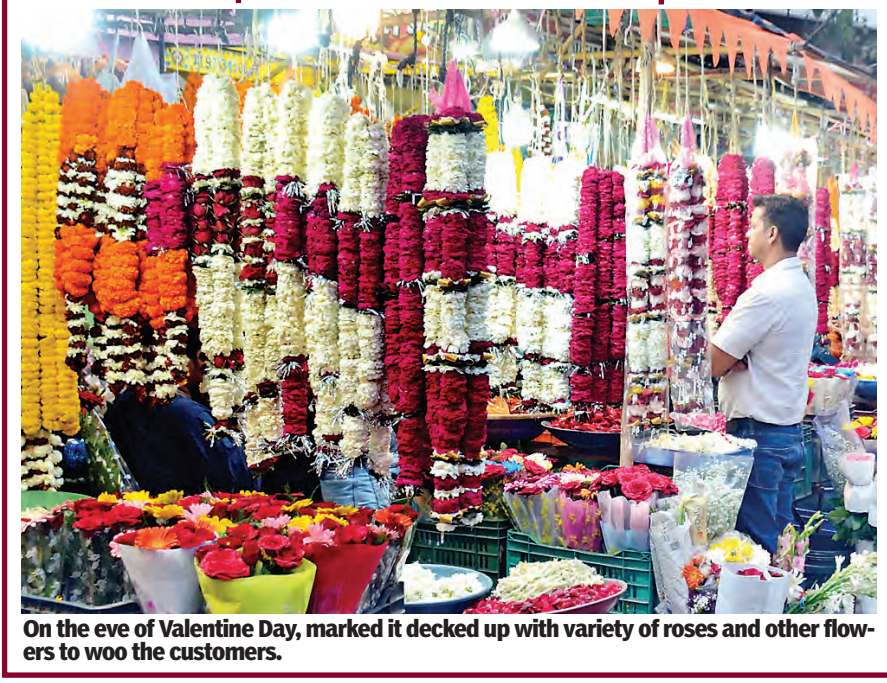
On the eve of Valentine Day, marked it decked up with variety of roses and other flowers to woo the customers.