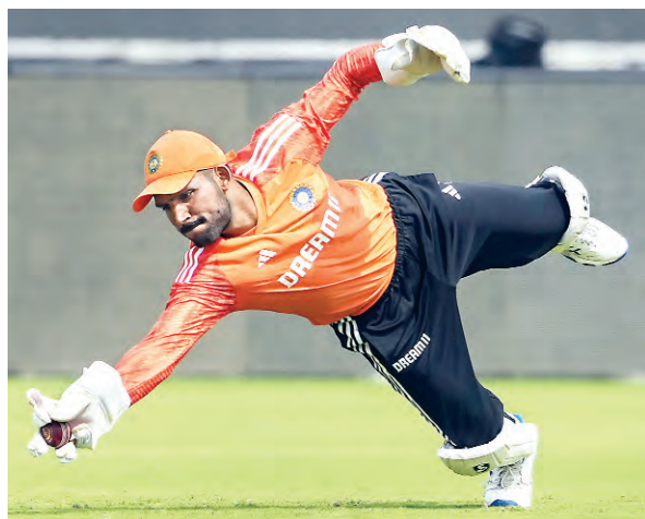
India's Dhruv Jurel during a practice session.

In case of Jurel, it is his superior batting quality that could get him the nod ahead of Kona Bharat,