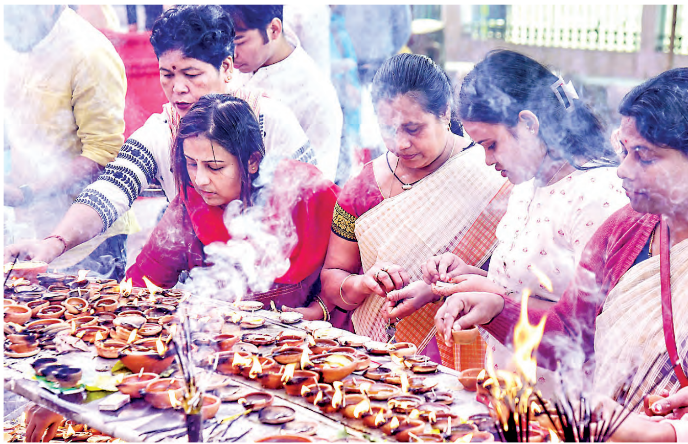
Devotees light earthen lamps on the occasion of 'Ganesh Jayanti' at Latashil Ganesh Mandir, in Guwahati, Tuesday, Feb. 13.