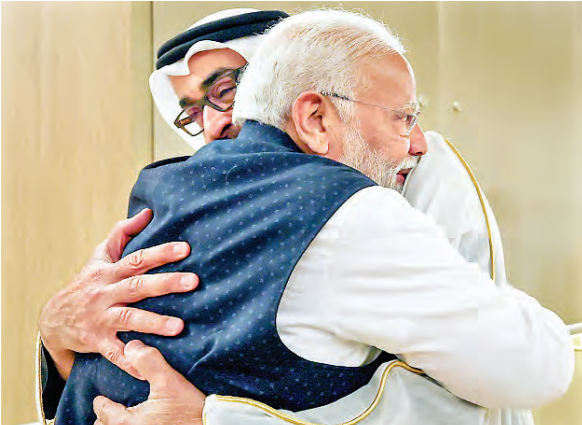
PM Modi being received by UAE President Mohamed bin Zayed Al Nahyan upon his arrival in Abu Dhabi, UAE, Tuesday.

Prime Minister Narendra Modi on Tuesday held wide-ranging talks with the UAE's President Sheikh Mohamed bin Zayed Al Nahyan during which they reviewed the strategic partnership, discussed new areas of cooperation and witnessed the signing of several agreements, including a bilateral investment treaty.