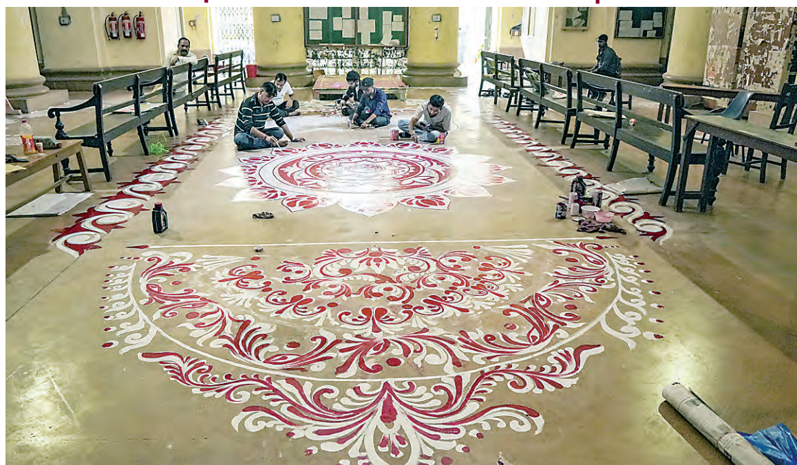
Students of Sanskrit College make 'rangoli' on the eve of 'Saraswati Puja', in Kolkata, Tuesday.