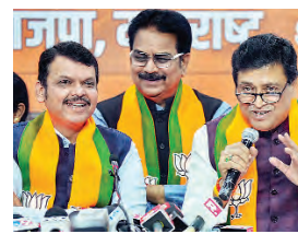
Former Maharashtra CM and Congress leader Ashok Chavan with Maha Dy CM Devendra Fadnavis addresses media after joining BJP, in Mumbai, Tuesda.

Former Maharashtra Chief Minister Ashok Chavan on Tuesday made his political move by joining the ruling Bharatiya Janata Party (BJP) in Mumbai, just a day after parting ways with the Congress.