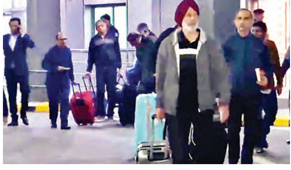
Former Indian naval personnel, who were jailed and handed down death sentences in a case of suspected espionage in Qatar, arrive in India following their release, in New Delhi, early Monday.

Qatar has released eight jailed former Indian Navy personnel and seven of them returned home on Monday morning, in what is being seen as a major diplomatic victory for India that came nearly three-and-a-half months after a Qatari court handed them death sentence that was subsequently commuted to jail terms. Foreign Secretary Vinay Kwatra said Prime Minister Narendra Modi himself constantly supervised all the developments in the case and has never shied away from any initiatives to ensure the return of the Indians. At a media briefing, the foreign secretary announced that Modi will