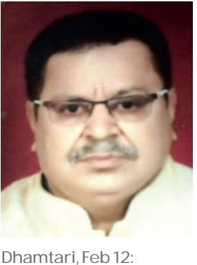
Dhamtari, Feb 12: