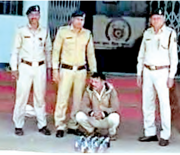
Dhamtari, Feb 13:

Police seizes country liquor worth Rs 2940