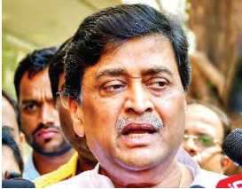
Former Congleader Ashok Chavan addresses the media.