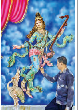
An artist gives finishing touches to an idol of Goddess Saraswati ahead of Saraswati Puja festival, at a workshop, in Nadia district, Monday.