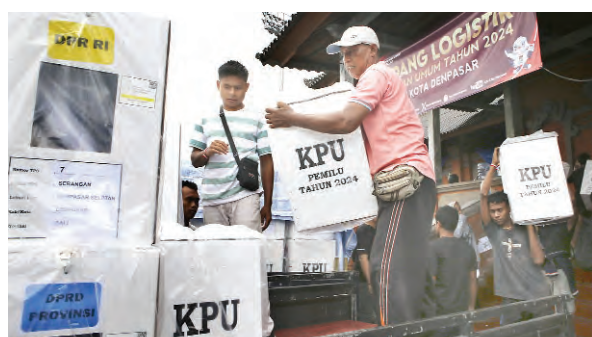
Workers arrange ballot boxes on a truck for the distribution ahead of Feb. 14 election in Denpasar, Bali, Indonesia on Monday.

About 205 million people are eligible to vote in the world's third-largest democracy and the most populous Muslim-majority nation. Here is some information about the candidates and their running