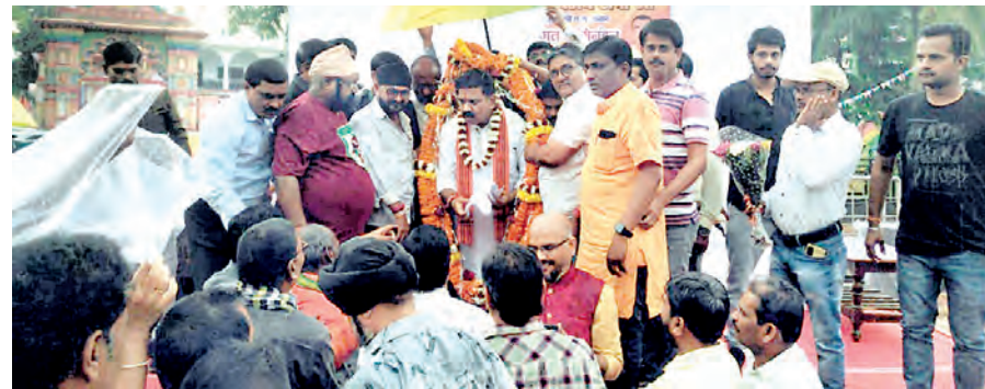
BJP party workers welcomed Dy. CM Vijay Sharma on his arrival in city amidst light showers.

But with the BJP government coming back to power, it was right in the first budget of the state by CM Vishnu Deo Sai and with efforts of Dy. CM Vijay Sharma, a provision of Rs 300 cr was made for