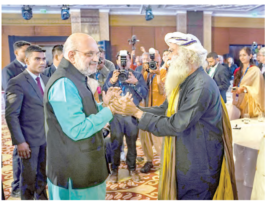
Union Home Minister Amit Shah with Spiritual leader Sadhguru during the ET Now Global Business Summit 2024, in New Delhi, Saturday.