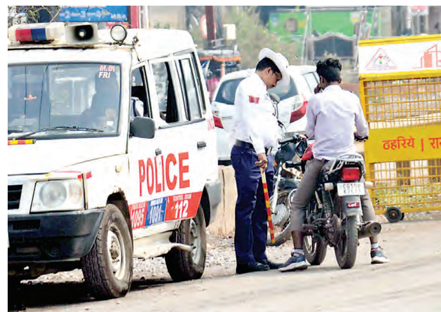
The traffic police is checking vehicle documents of vehicles in outer along with strictness on use of helmets and seat belts while driving, so as to ensure safe driving.