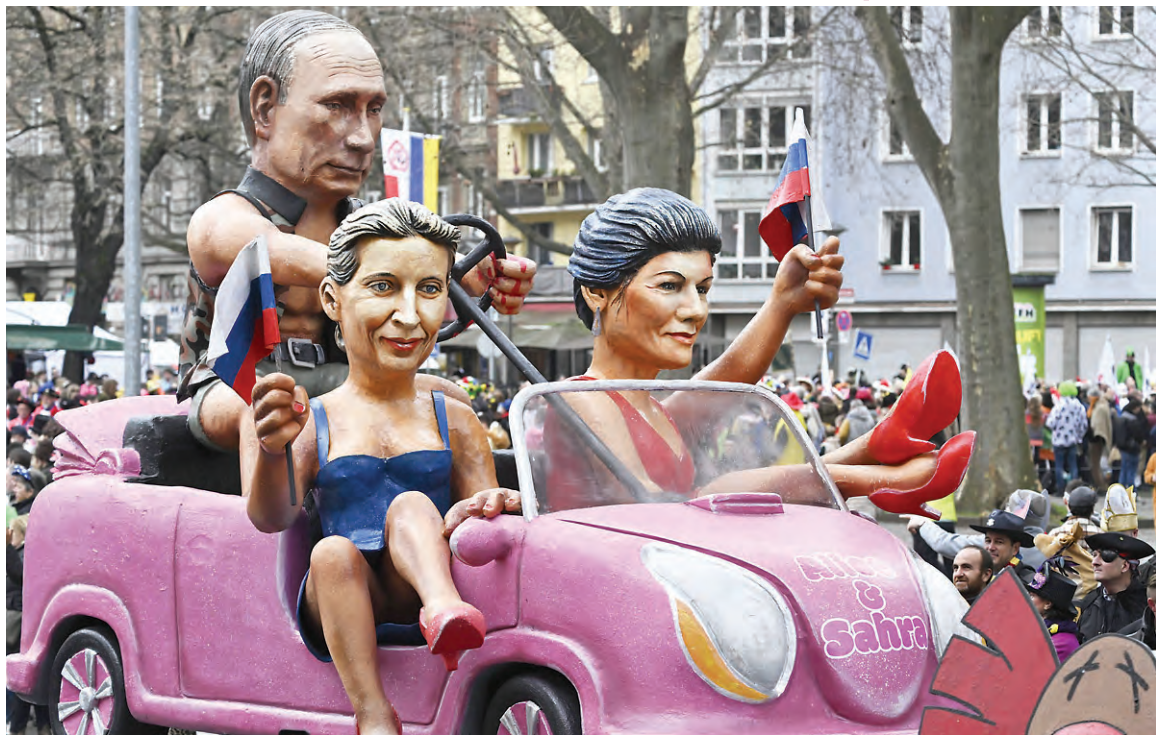
A float depicting "Barbies and Ken", with the characters of Russian President Vladimir Putin, left, Alice Weidel, center, and Sahra Wagenknecht is driven through the streets during the Rose Monday parade in Mainz, Germany, Monday.