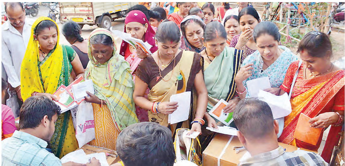
The government's Mahtari Vandan Yojana is receiving huge response and married women were found filling up forms in large number here on Monday.