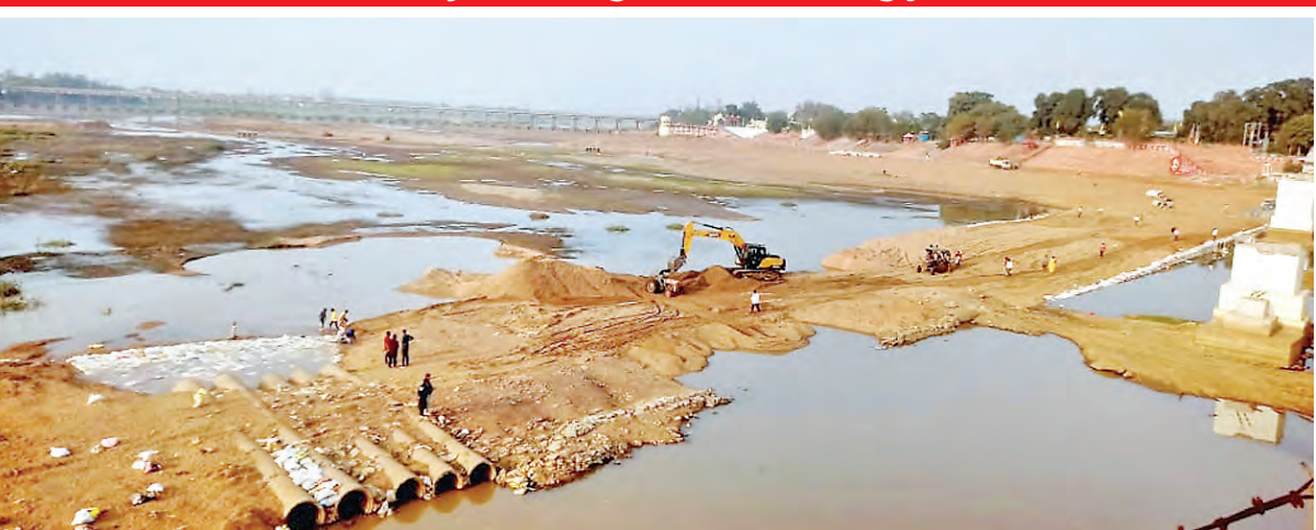
Central Chronicle News

Brijmohan Agarwal's meeting yields visible results