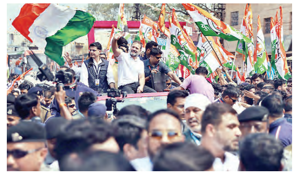
Cong leader Rahul Gandhi during the Bharat Jodo Nyay Yatra, in Raigarh, Sunday.

Yatra to cover 536 kms in state..... Raigarh, Feb 11 (PTI): The BJP and RSS are spreading hatred while love is in the DNA of this country, said Congress leader Rahul Gandhi as his 'Bharat Jodo Nyay Yatra' resumed in Chhattisgarh on Sunday after a two-day break. Addressing a gathering in Kevdabadi Chowk in Raigarh, Gandhi said his party wants a "Hindustan for the future generation where hatred and violence does not exist". "At present, hatred and violence is being spread in every corner of the country. Some say they don't like others on the basis of their language, some say they don't like others on the basis of the states they belong to. Such thoughts will weaken the country," he said. "The Bharatiya Janata Party and Rashtriya Swayamsevak Sangh are spreading hatred, while love is in the DNA of this country. In this country, people belonging to different faiths and having different thoughts live together peacefully with love," Gandhi asserted. He slammed Prime Minister Narendra Modi for not visiting strife-torn Manipur so far despite hundreds of people dying and scores of houses getting torched since May last year. There is civil war under-