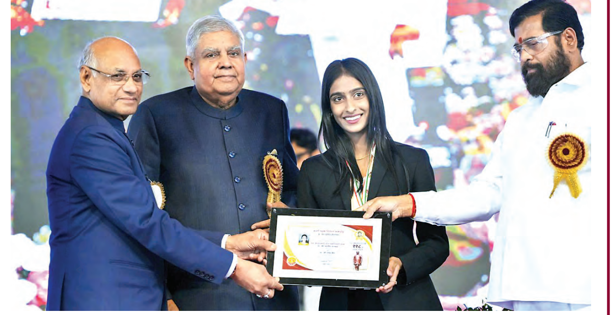
Vice President Jagdeep Dhankhar with Maharashtra Governor Ramesh Bais and Chief Minister Eknath Shinde during the felicitation ceremony of meritorious students and prominent personalities of Bhandara and Gondia districts, in Gondia district, Sunday.