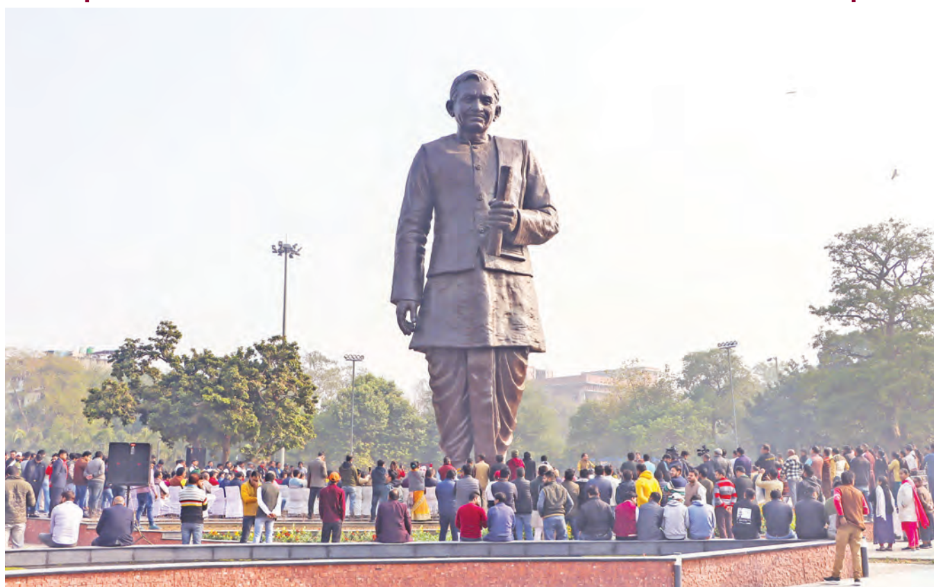
People attend a programme organised to pay tribute to Bharatiya Jana Sangh leader Deendayal Upadhyaya on his death anniversary, in New Delhi, Sunday, Feb. 11.