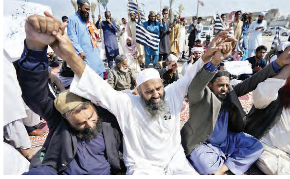
Supporters of religious party Jamiat Ulema-e-Islam block a road as they protest against the delaying result of parliamentary election by Pakistan Election Commission in Karachi, Pakistan, Sunday, Feb. 11.

Former prime minister and the Pakistan Muslim League-Nawaz supremo Nawaz Sharif received the backing of the powerful Pakistan Army chief General Asim Munir on