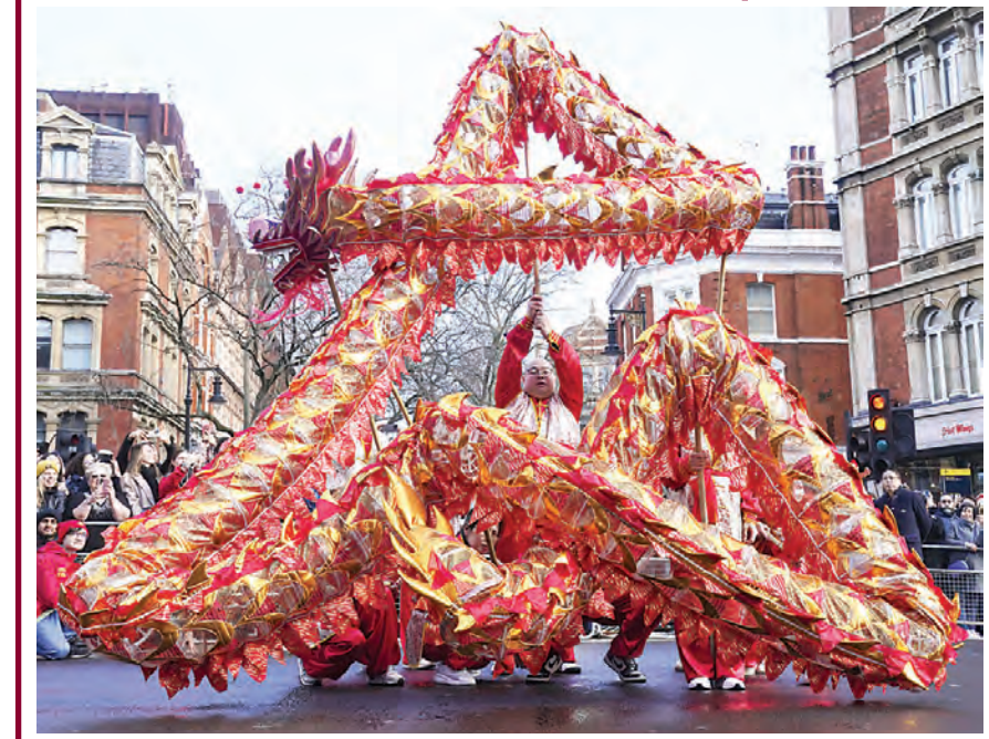
Performers take part in a parade involving costumes, lion dances and floats, to mark Lunar New Year, also known as the Spring Festival or Chinese New Year, in London, Sunday, Feb. 11.