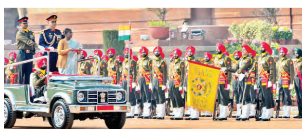
President Droupadi Murmu inspects the Guard of Honour during the ceremonial change-over of the Army Guard Battalion stationed at Rashtrapati Bhavan, in New Delhi, Sunday.

President Droupadi Murmu on Sunday witnessed the ceremonial change-over of the Army Guard Battalion stationed at the Rashtrapati Bhavan here. During the ceremony, the 6th Battalion of the Sikh Regiment on completion of its tenure as the ceremonial Army Guard Battalion handed over the charge to the 1st Battalion of 5th Gorkha Rifles. Different infantry units of the Army function as the ceremonial Army