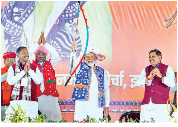
PM Modi with Tribal Affairs Minister Arjun Munda, MP CM Mohan Yadav and others during the 'Janatiya Sammelan' in Jhabua, Madhya Pradesh, Sunday.

PM slams Cong for 'loot and divide' Jhabua, Feb 11 (PTI): Prime Minister Narendra Modi on Sunday said he is confident the BJP will cross the 370 seats-mark in the upcoming Lok Sabha polls, and even the opposition leaders in Parliament are saying the ruling coalition will get more than 400 seats.