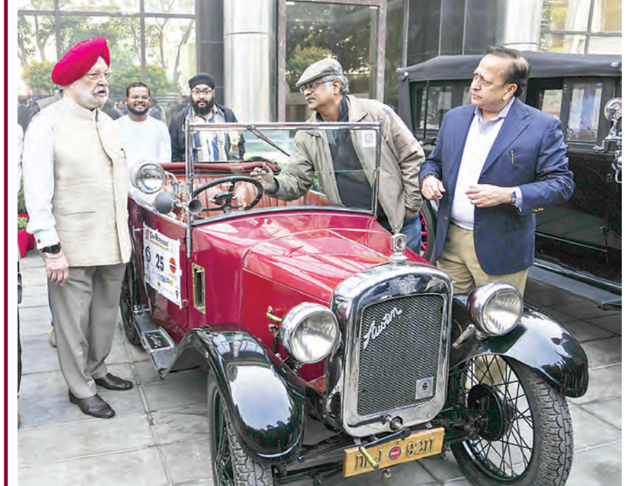
Union Minister Hardeep Singh Puri during the 57th Statesman Vintage & Classic Car Rally, at Statesman House, Connaught Place, in New Delhi, Sunday, Feb. 11, 2024.

Mcap of 4 most valued firms jumps Rs 2.18 lakh cr; LIC, SBI lead gainers