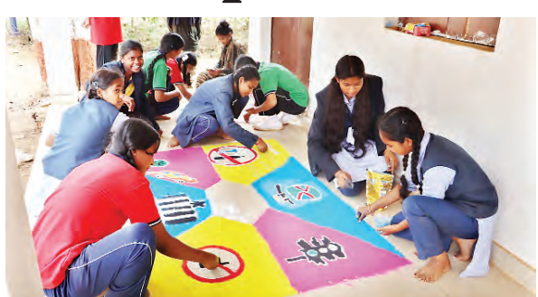
Central Chronicle News

Bijapur, Feb 11: The district of Bijapur embraced the spirit of the 34th National Road Safety Month with fervour as school students delved into various activities aimed at fostering traffic awareness. Led by the Traffic Police