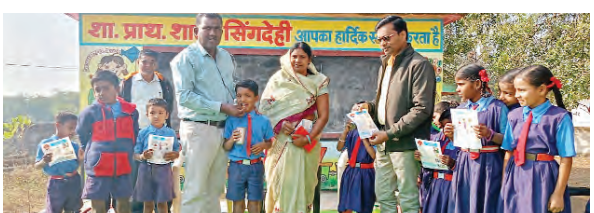
Central Chronicle News

Anwari, Feb 11: Singdehi village witnessed a commendable initiative as it celebrated National Deworming Day, aligning with the government's vision to prioritize children's health. The event, held at the government primary school and Anganwadi center, aimed to educate children about the importance of deworming for better health outcomes, including reduced anemia and improved nu-