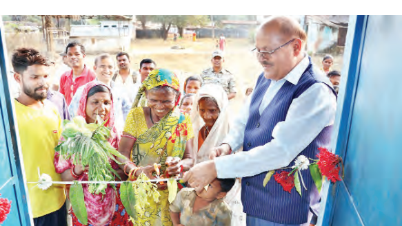
Central Chronicle News

Bijapur, Feb 11: Despite recent challenges posed by Maoist disturbances in the village of Bencharam, a beacon of hope emerged as the Collector of Bijapur inaugurated a new primary school, symbolizing resilience and commitment to education. Just a day ago, Maoists had struck fear by burning mobile tower equipment, leaving a trail of destruction. However, the Collector's arrival brought a renewed sense of optimism as he engaged with villagers to assess the situation and extend support. Addressing the community, the Collector emphasized the transformative power of education, urging villagers to embrace