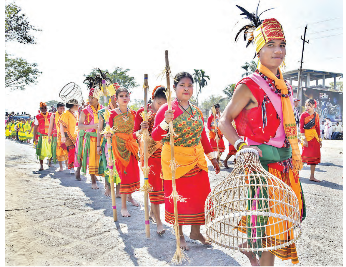
Devotees participate in a cultural rally during the 93rd annual session of the Srimanta Sankardev Sangha at Rangia, in Kamrup district, Sunday.