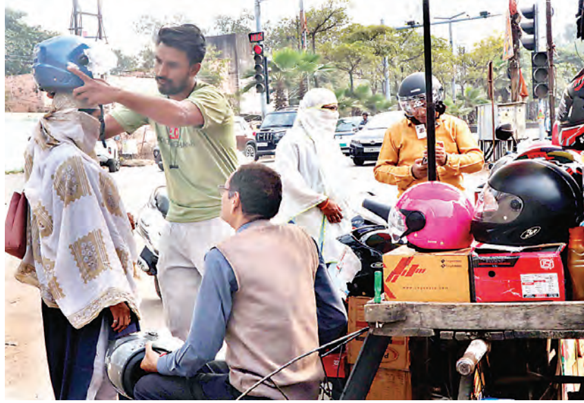
With traffic police getting strict on use of helmets on highways and other parts of city, the denizens are left with no option but to purchase a helmet for their own safety.